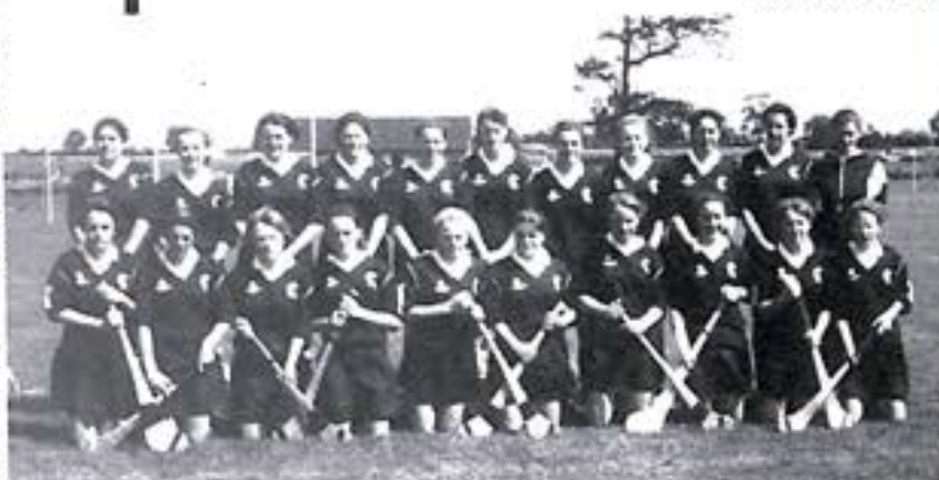
Galway - 1993 All-Ireland Minor Camogie beaten finalists