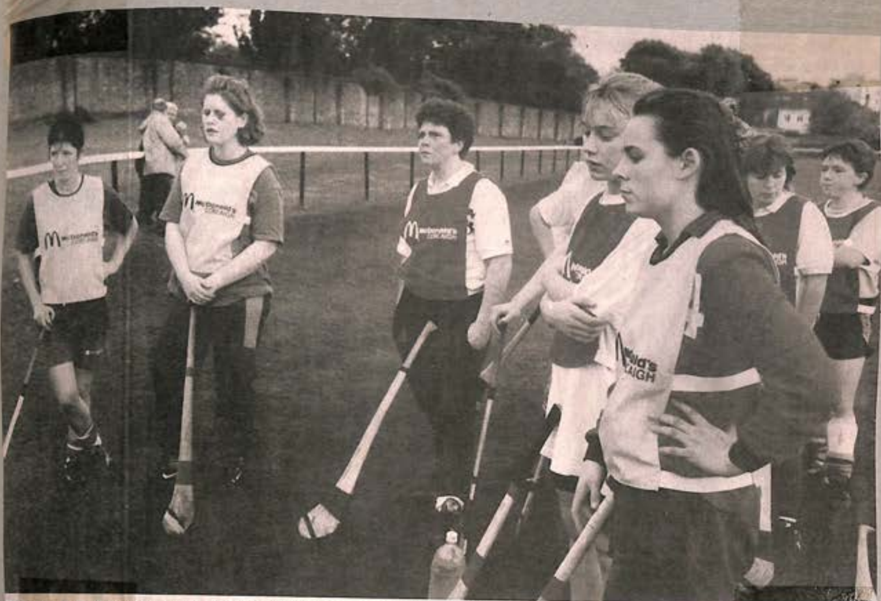
■ Members of the Cork camogie team pictured at their training camp at the Mardyke, Cork.