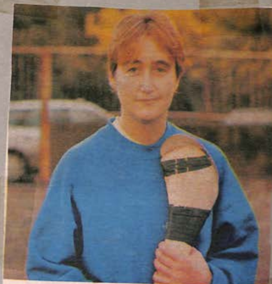
MAROO-ED IN CORK: A Galway girl playing for Cork.