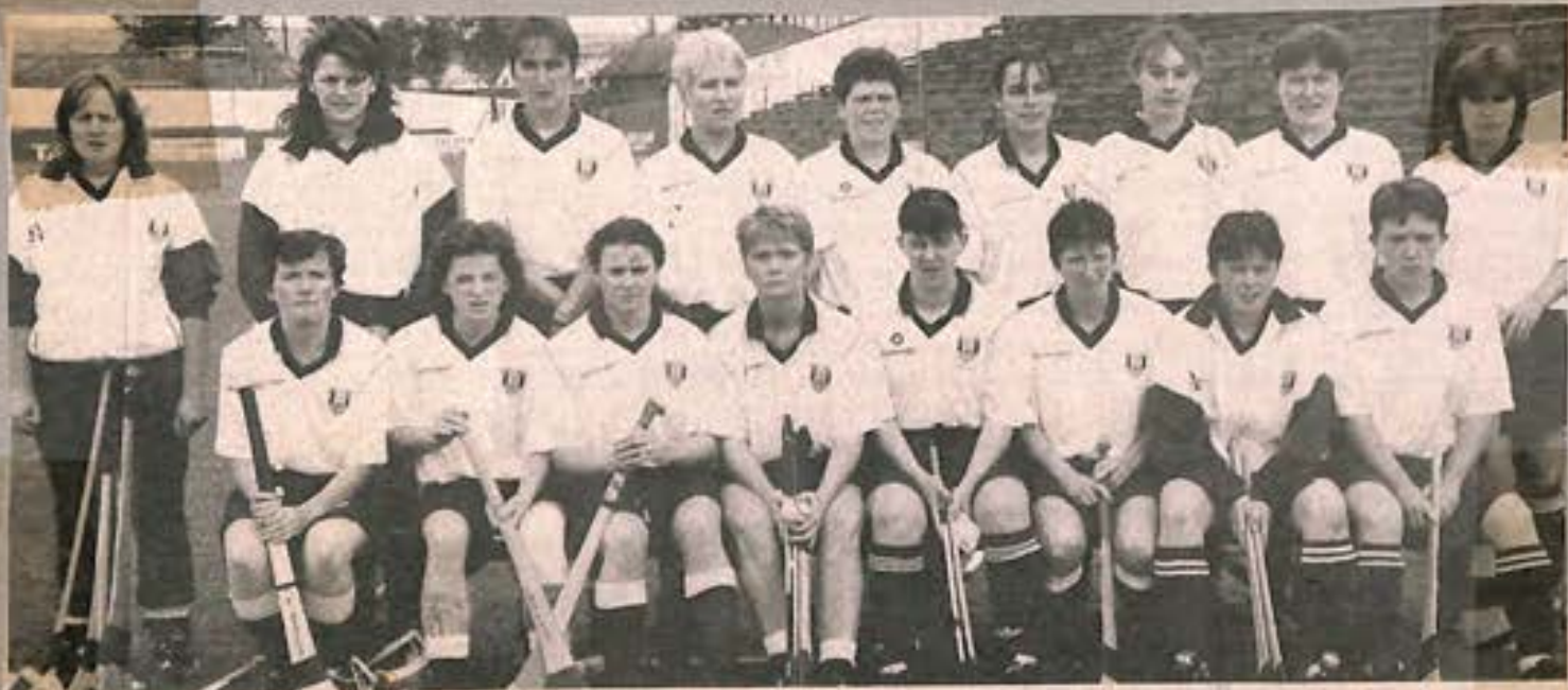
THE Cork camogie team who have qualified to meet Galway in the All-Ireland final following a thrilling victory over Kilkenny on Sunday