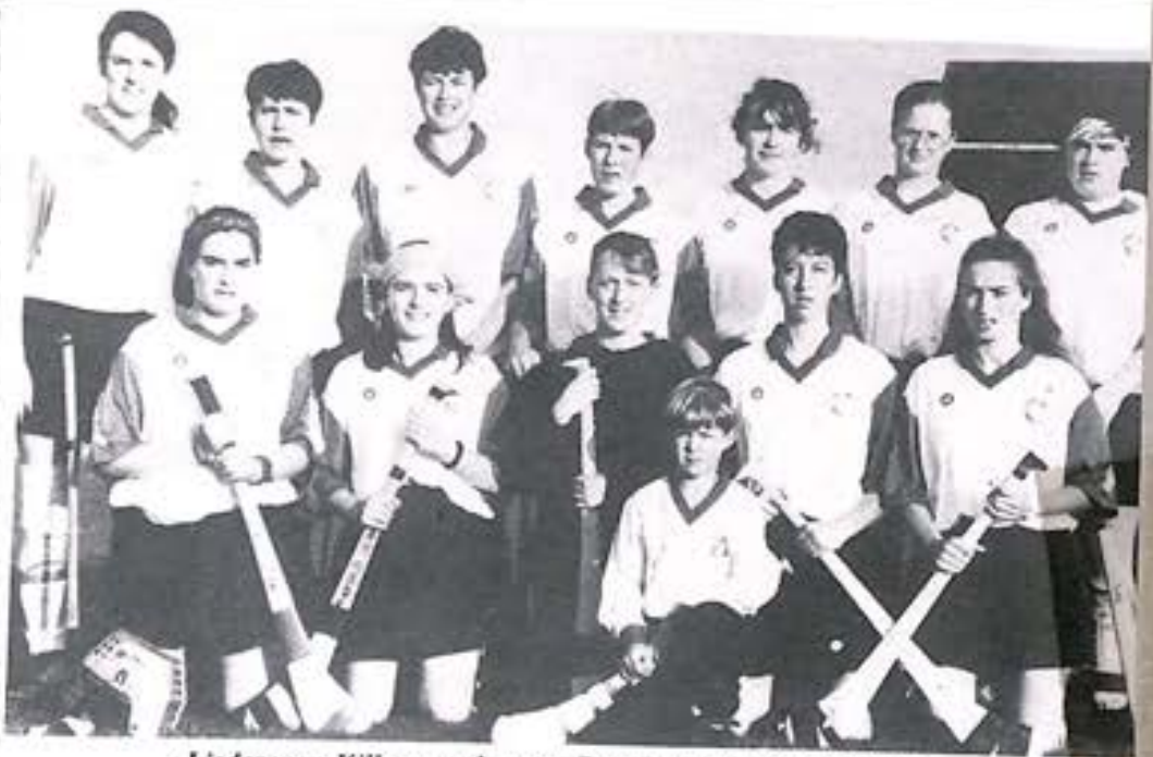
Lisdowney, Kilkenny who meet Broadford, Kildare on Sunday