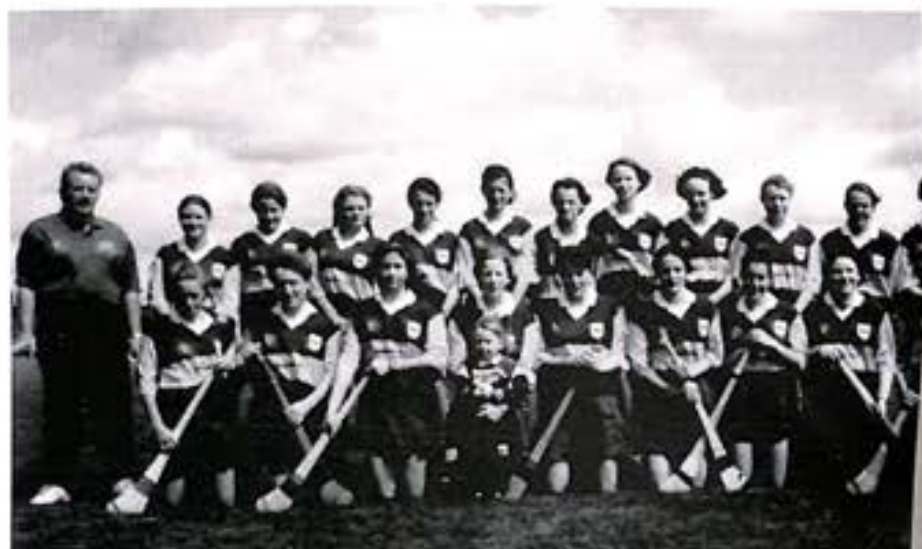
Tipperary... All-Ireland Minor Camogie Champions 1993.