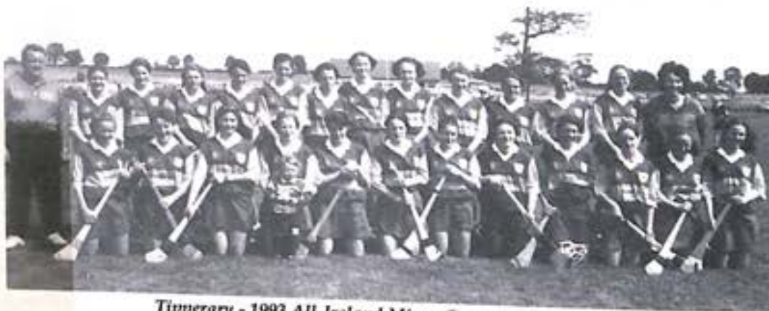
Tipperary - 1993 All-Ireland Minor Camogie Champions