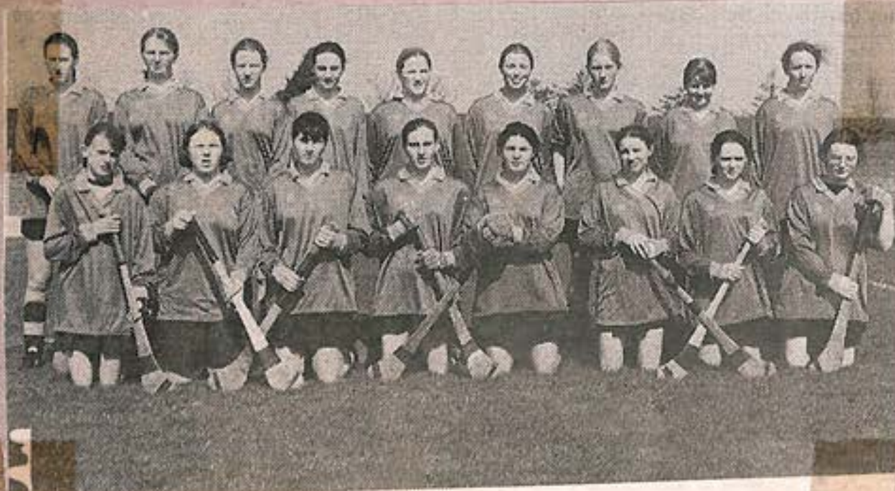
St. Mary's, Charleville, winners of the All Ireland Colleges Junior Camogie Championship Final.