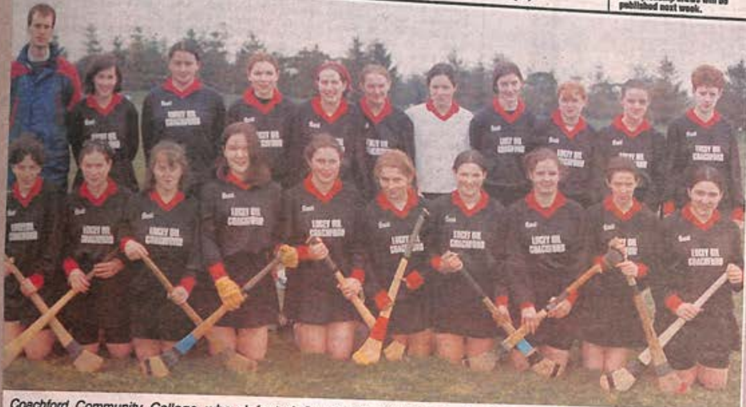
Coachford Community College who defeated St. Mary's Macroom in the Quarter Final of the Munster Colleges Camogie Championship. Score 4-1 to 2-0.

Championship draws will be published next week.