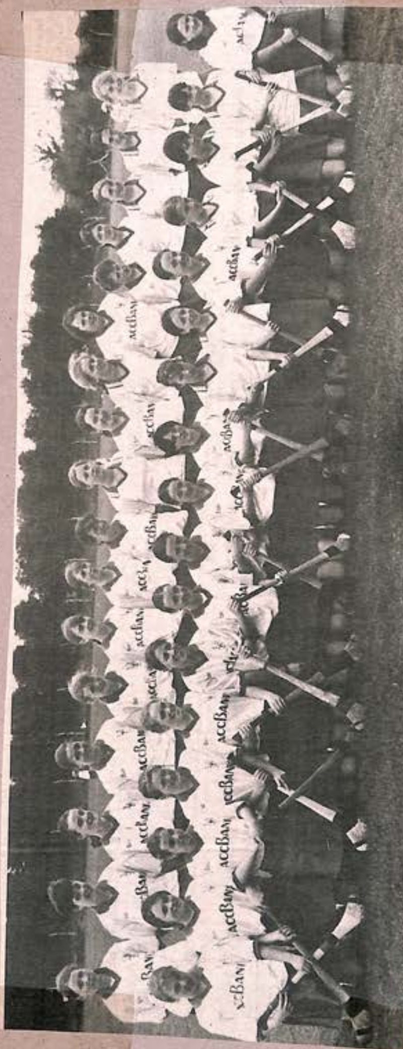
The Cork team and complete panel who scored a convincing win over Waterford in the first round of the Munster Minor Camogie Championship at Ballyanley, Co. Cork.