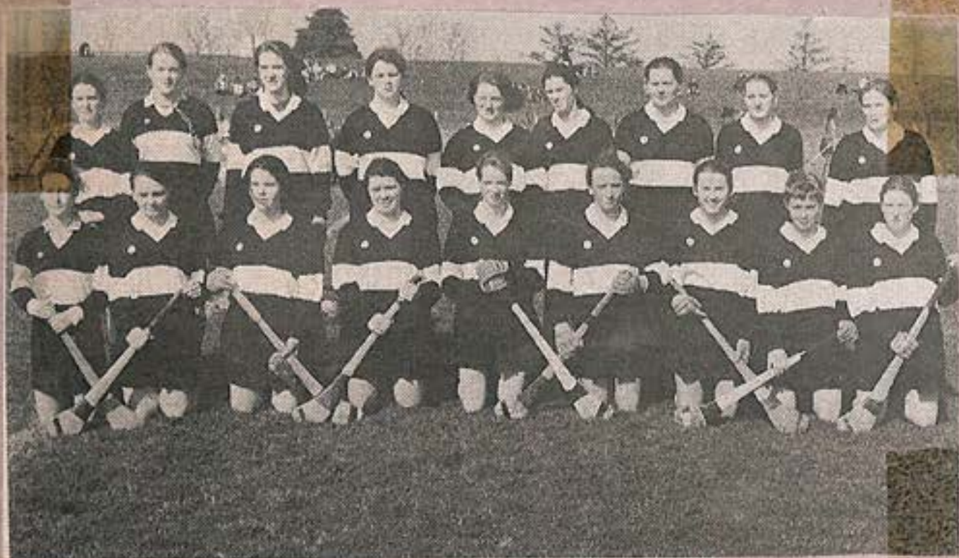
St. Mary's, Charleville, narrowly defeated by Presentation, Kilkenny in the All Ireland Colleges Senior Final.