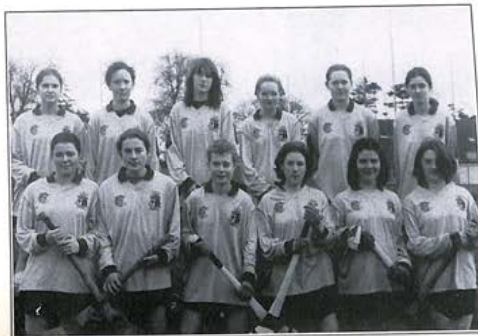
SENIOR FINALISTS – ST. MARY'S, CHARLEVILLE