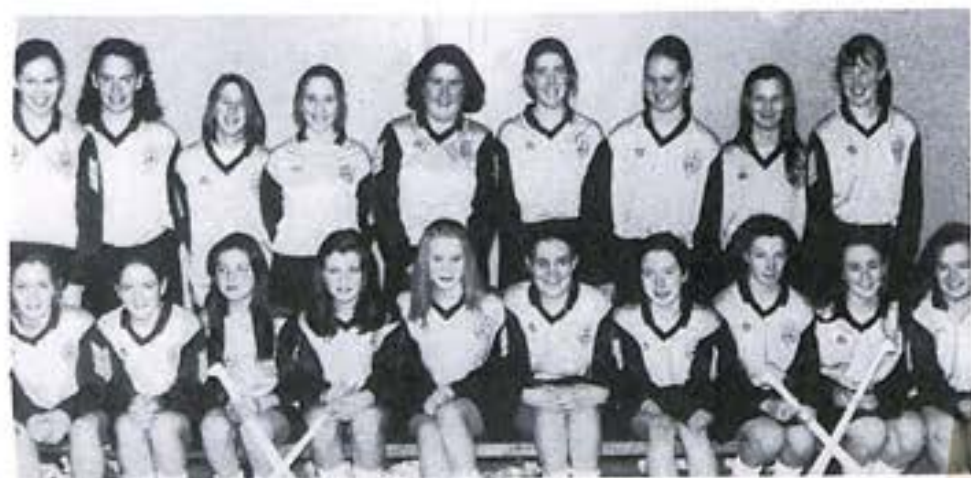
ST. MARY'S, MAGHERAFELT 1995