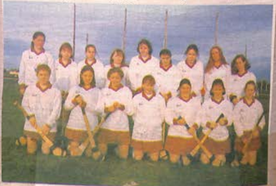
Bishopstown who won the U-16 Camogie League defeating Glen Rovers in the final at Mayfield.

Next match Limerick v Galway 10th April.