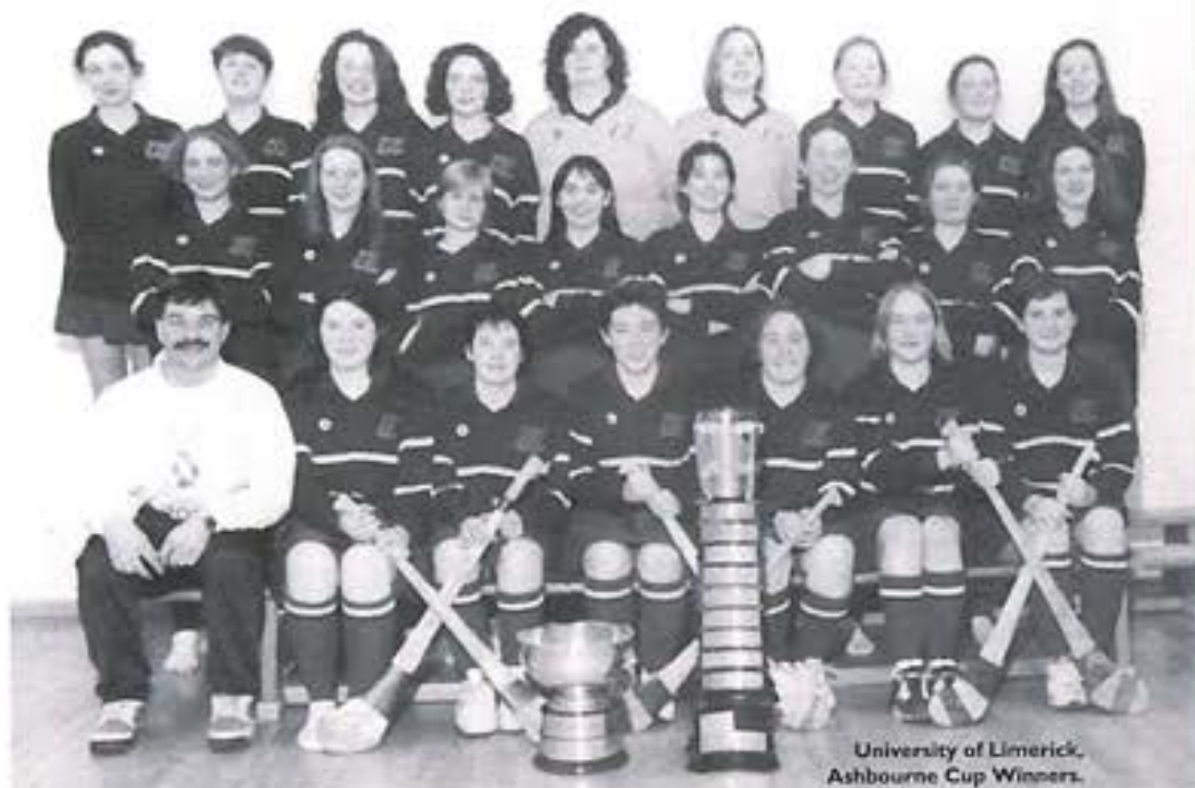
University of Limerick, Ashbourne Cup Winners.