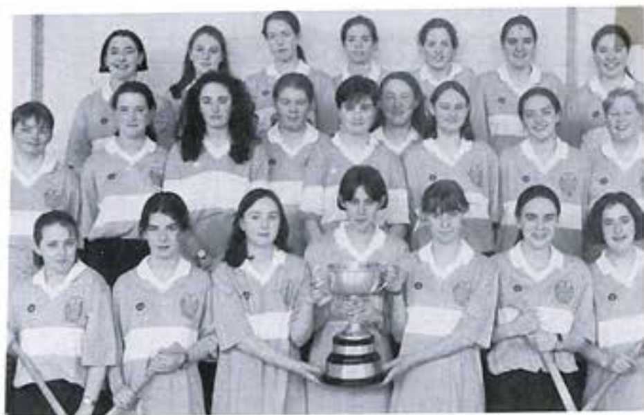
SENIOR FINALISTS – PRESENTATION, KILKENNY