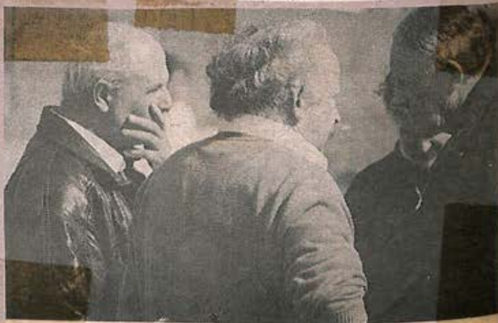
Decision time for Charleville mentors.

Junior: In the first round of the Junior League we play Bruree on Wednesday next, April 12th, in Bruree at 6.30p.m.