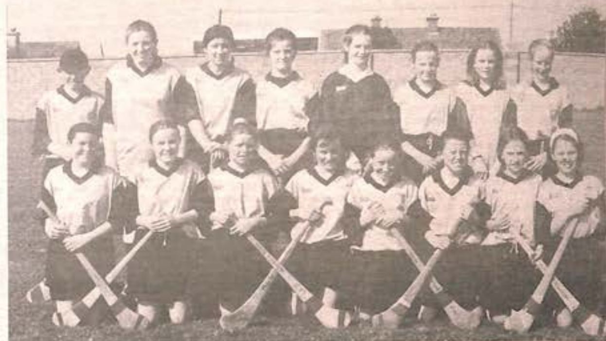
Ballyphehane N.S. team who recently defeated Cloghroe N.S.

St. Finbarrs got a successful start to their playing season last Saturday night at Ballinhassig when they defeated Barryroe to take the Junior 'A' title for '94. The previous week their under-16 team were suc-