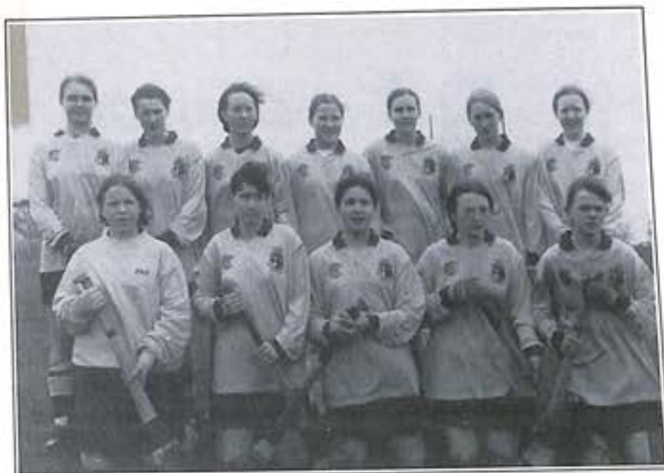
JUNIOR FINALISTS – ST. MARY'S, CHARLEVILLE