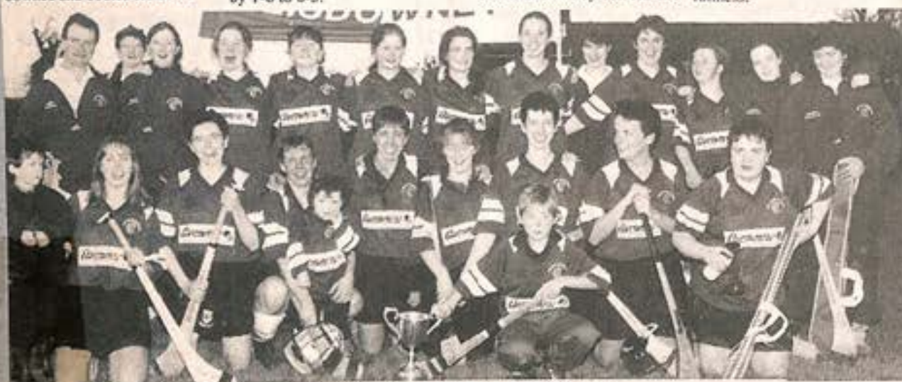
Lisdowney - All-Ireland Club Champions, 1994