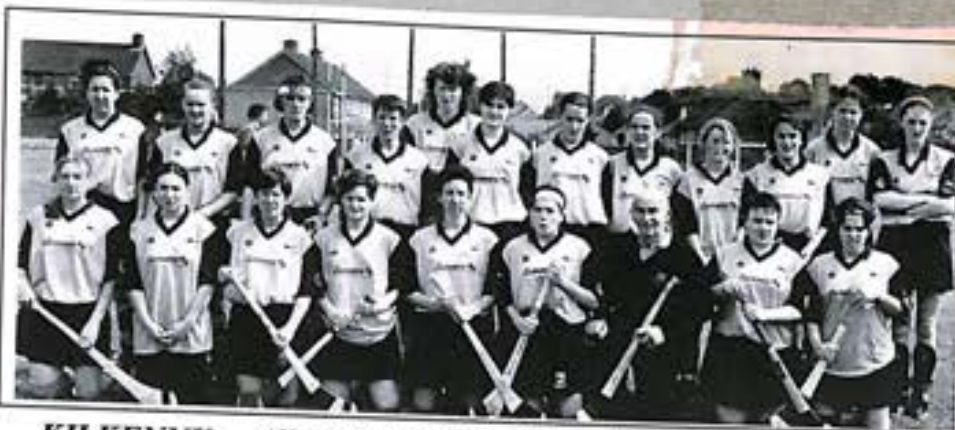
KILKENNY ... All-Ireland Senior Champions for the 12th time.