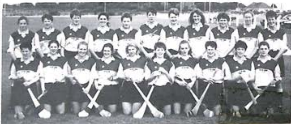
Youthful Wexford who went under to neighbours Kilkenny in the Senior decider