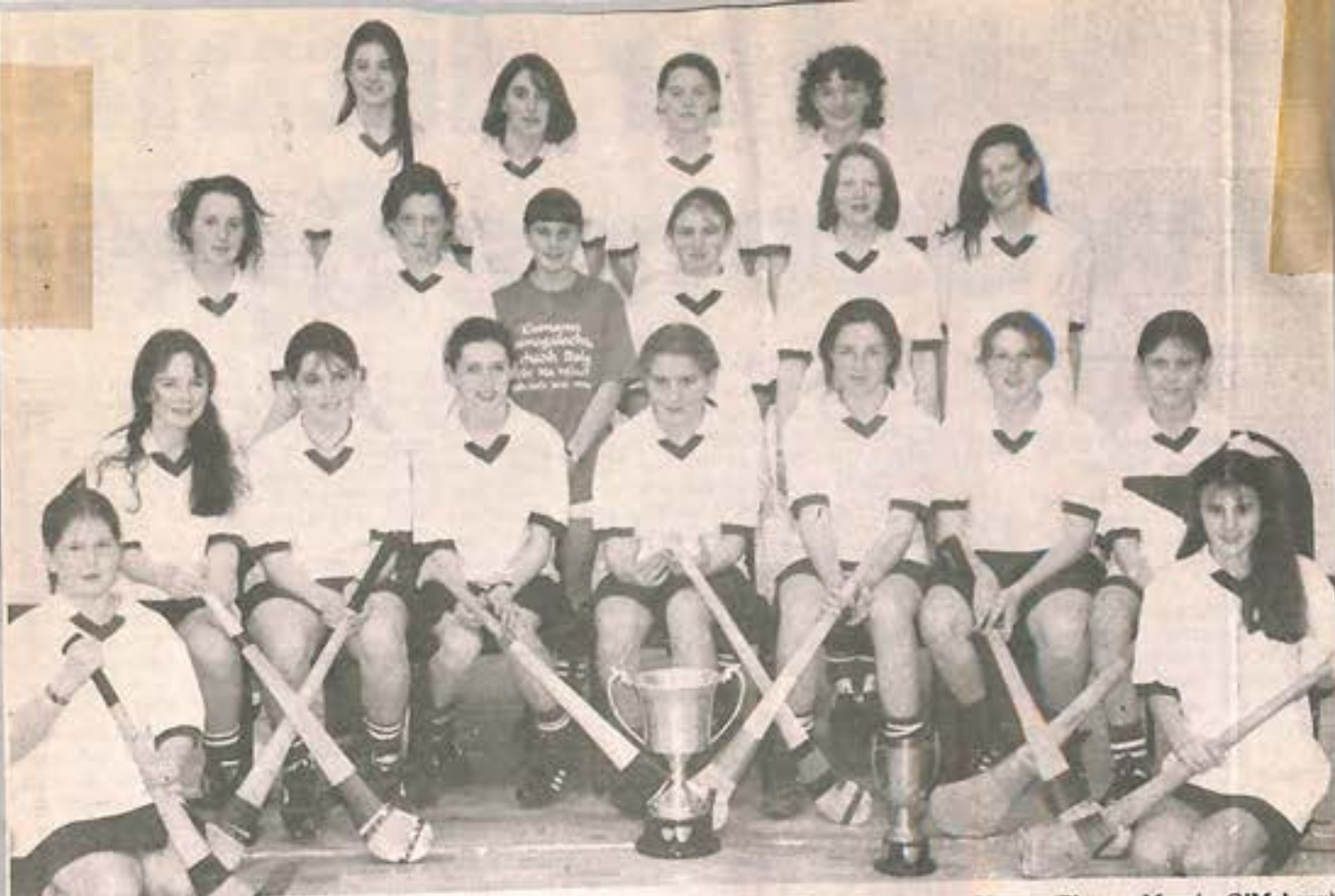
Aghabullogue U-14 camogie team, winners of the U-14 A Cork Feile Na Gael and County Championship.