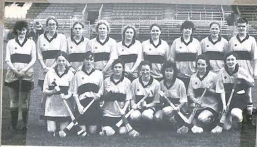
Lismore ladies ... Waterford Senior Camogie champions 1994