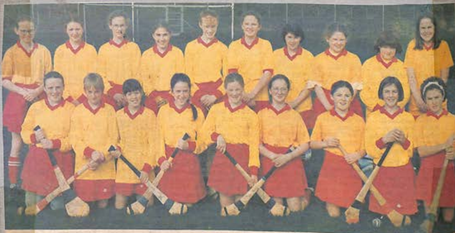
★The Eire Og team who won the first ever Under 12 camogie championship recently.