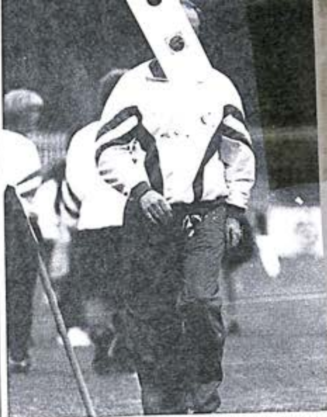
EAMONN CREGAN WHO LED OFFRALLY TO GLORY IN HURLING WENT SO NEAR COMPLETING A DOUBLE WITH THE LIMERICK CAMOGIE TEAM