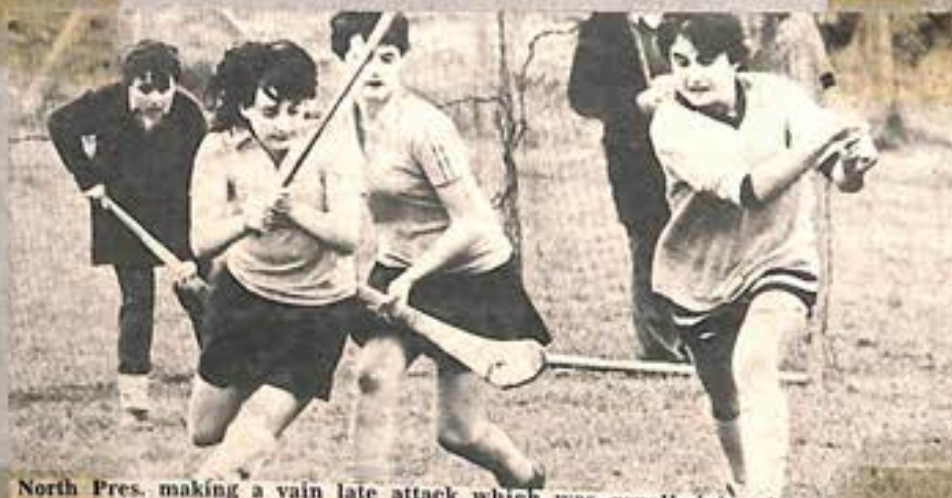
North Pres. making a vain late attack which was repelled by the eventual winners St. Patrick's during the Munster Colleges' Senior Camogie Championship final at Ballinora on Saturday.