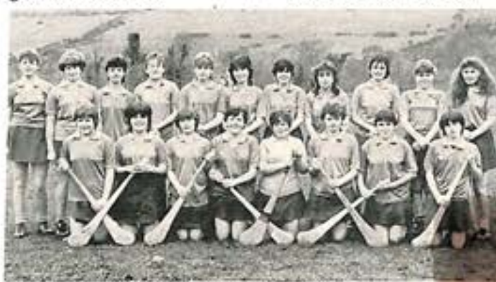
St. Finbarr's — Cork Under-16 champions 1983.