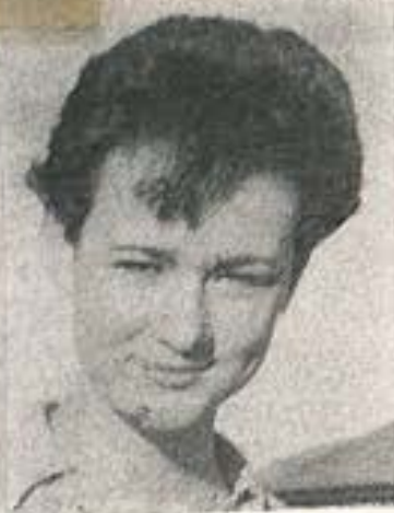
• MARY ROSE

SUNDAY National Leagues At Loughrea — Galway v Louth, Junior 2.00; Senior 3.00. At Portaferry — Down v Antrim, Senior, 3.00. At Cappawhite — Tipperary v Wexford, Junior 2.00; Senior 3.00. At Delaney's Grounds — Cork v Clare, Senior, 3.00. At Silver Park — Dublin v Limerick, Senior 3.00.