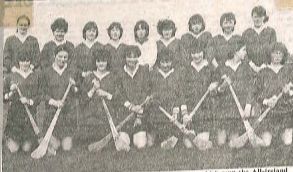
St. Raphael's of Loughrea senior (above) and junior teams which won the All-Ireland Colleges camogie championships.