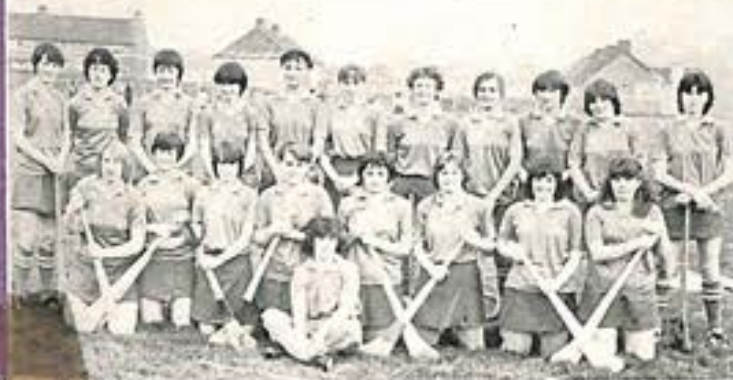
St. Finbarr's, Cork County Junior A champions.