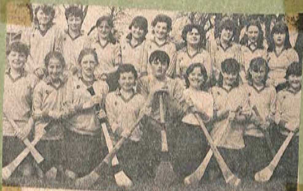
St. Patrick's Comprehensive School, Shannon, who are the Munster Colleges First Year Camogie Champions of 1985.