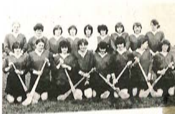
St. Raphael's, Loughrea, All-Ireland Colleges junior champions. They beat Colaiste Mure, Ennis by 3-4 to 1-0.