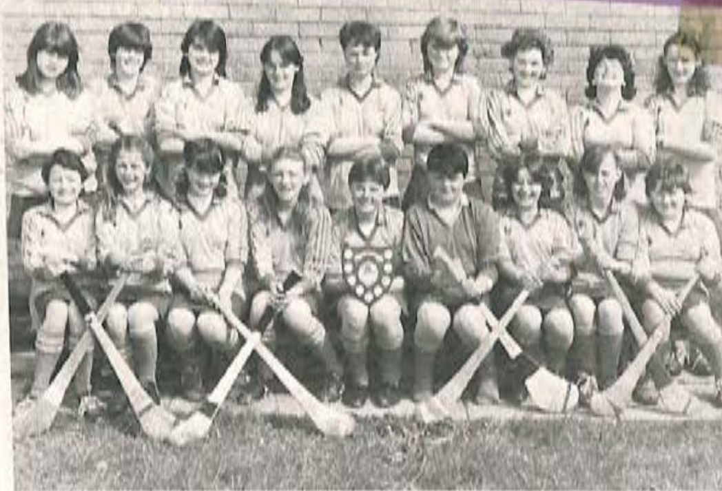
St. Patricks Shannon winners of the Clare post primary schools under 16 title last week.