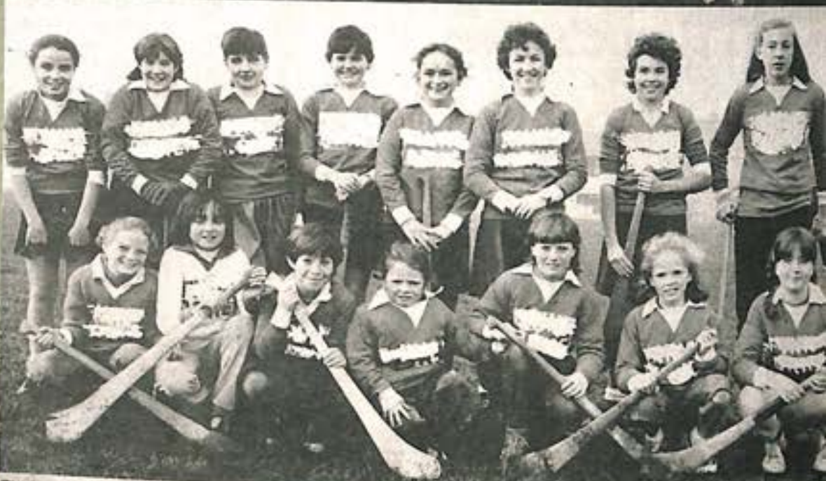
Firgrove/Westgate/Melbourne (top) which defeated Kenley/Parkway (below) in the final of Bishopstown Street League (under 13) at Bishopstown GAA pitch.