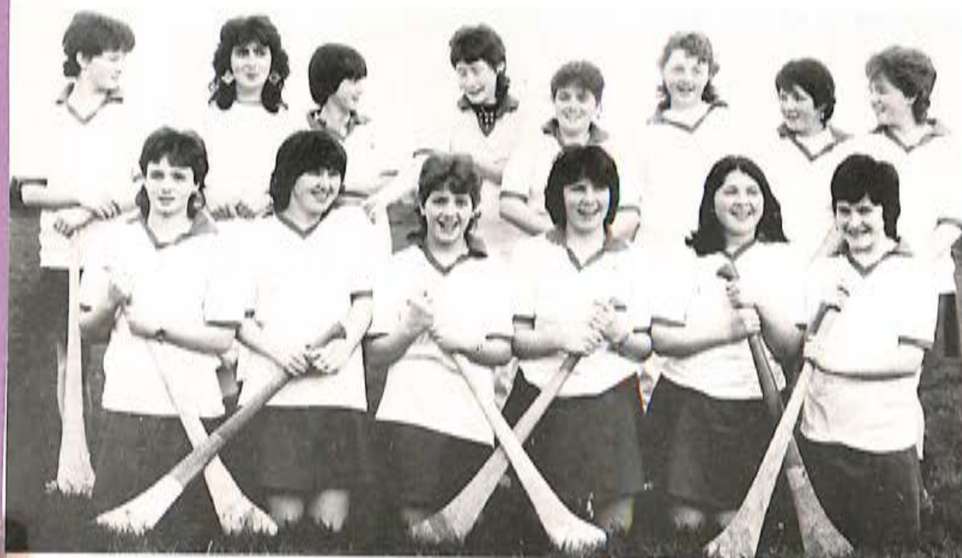
THE INNISCARRA UNDER 16 CAMOGIE TEAM WHO DEFEATED THEIR VISITORS ROSSA CAMOGIE CLUB, BELFAST OVER THE EASTER WEEK END