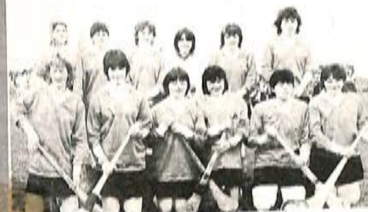
Above: St. Raphael's, Loughrea, All-Ireland Colleges senior champions. They defeated St. Patrick's secondary school Cork in the senior final by 4-7 to 3-3.