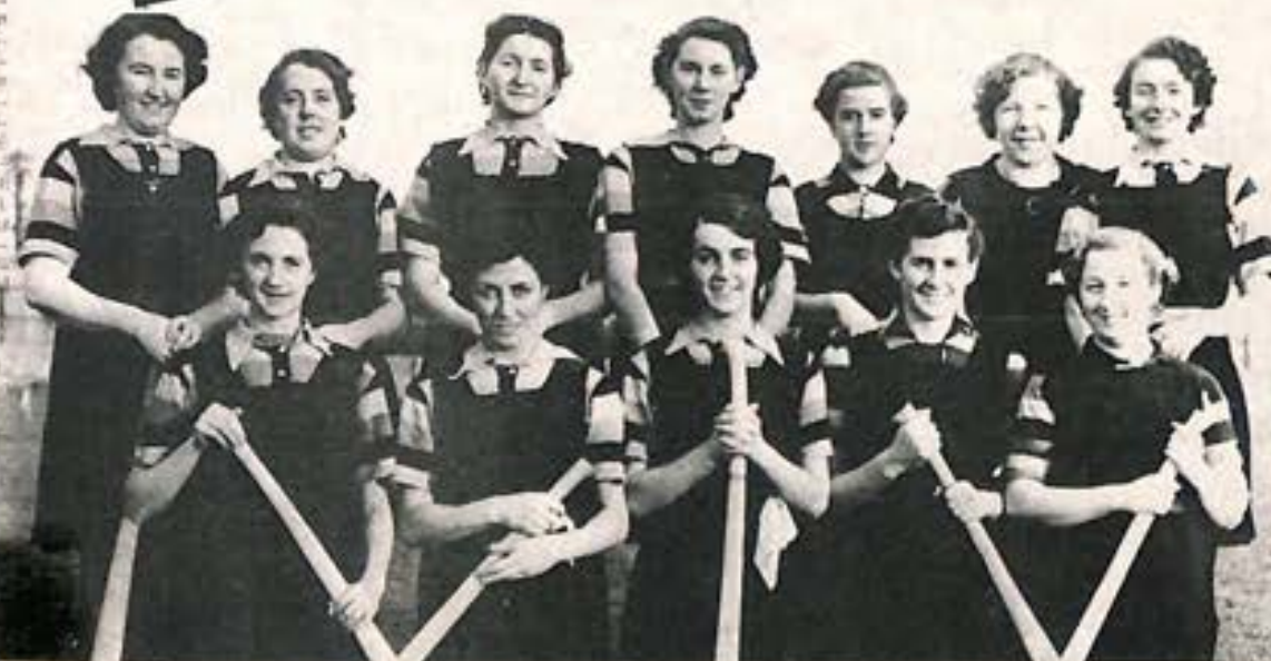
CHAMPIONS OF 1954 — The Glen Rovers Camogie team of 30 years ago which defeated Blackrock in the Cork Senior Championship final.