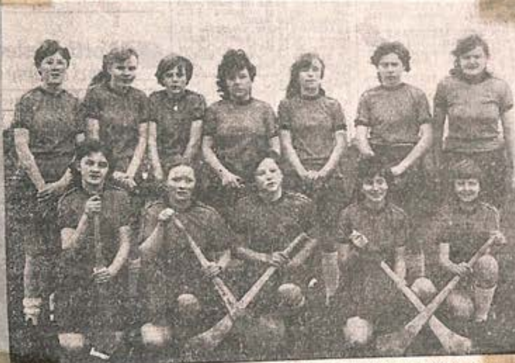
COLAISTE MHUIRE, ENNIS , who won the Munster Junior Colleges Championship for the first time ever by defeating St. Mary's, Charleville, at Ennis, Co. Clare.