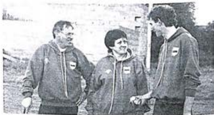
Tipperary selectors in jubilant mood before the All-Ireland semi-final. Left