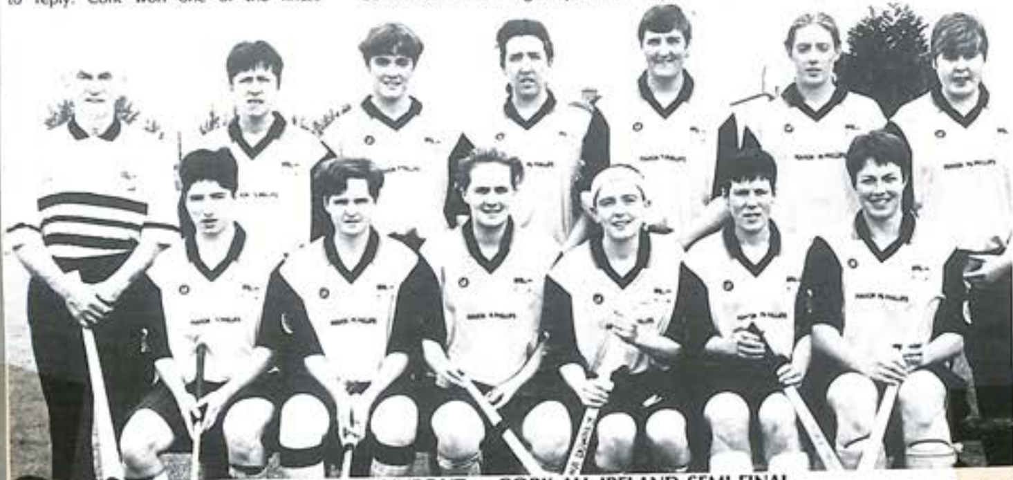
SENIOR TEAM LINEOUT v. CORK ALL-IRELAND SEMI-FINAL