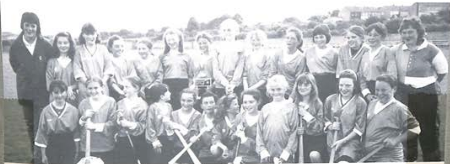
Toomevara u.12 team - County Championships 1993 (seventh title in a row).