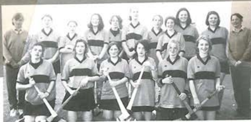
JOHNSTOWN VOCATIONAL SCHOOL SENIOR CAMOGIE