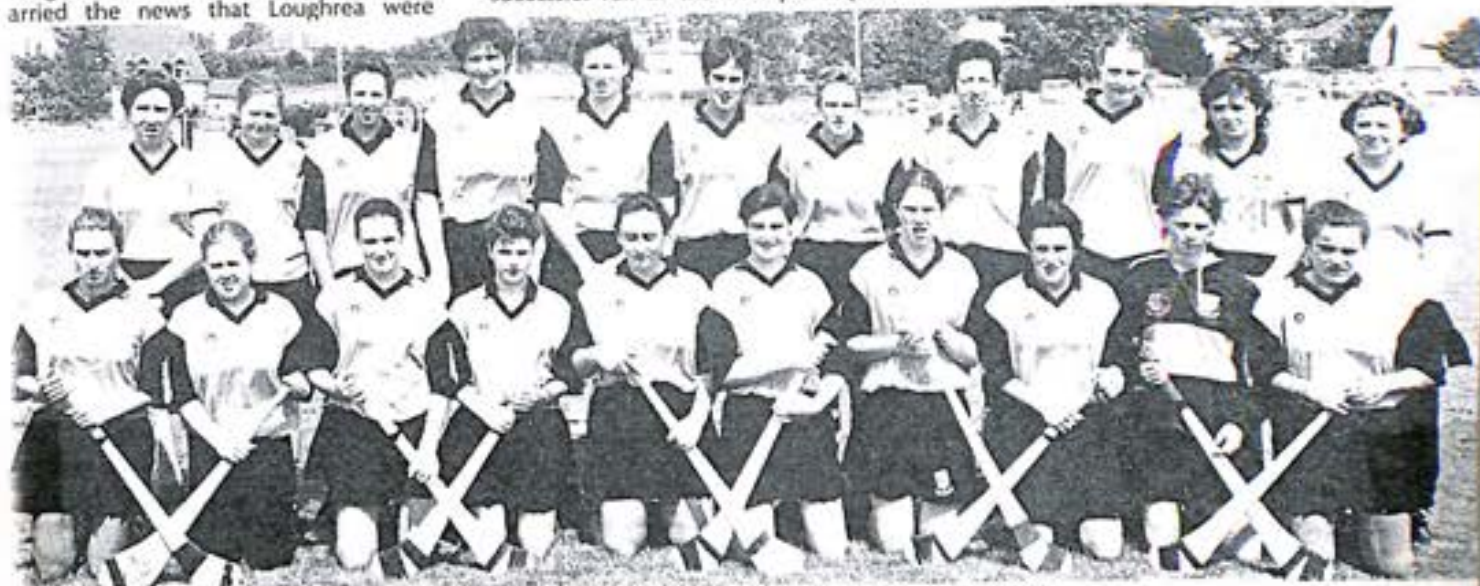
KILKENNY JUNIOR LEINSTER FINAL TEAM DEFEATED BY CARLOW