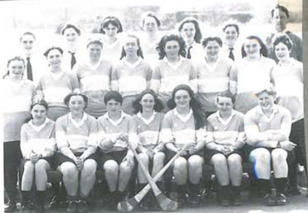
PRESENTATION KILKENNY - WINNERS LEINSTER POST PRIMARY SCHOOLS ROINN B SENIOR CHAMPIONSHIP