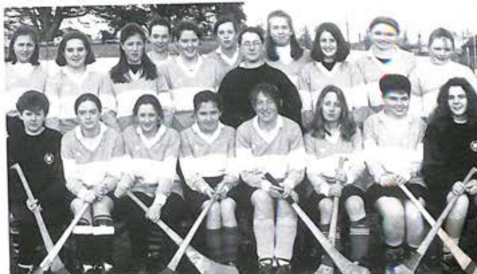
PRESENTATION KILKENNY - FINALISTS IN THE LEINSTER POST PRIMARY SCHOOLS JUNIOR CAMOGIE CHAMPIONSHIP