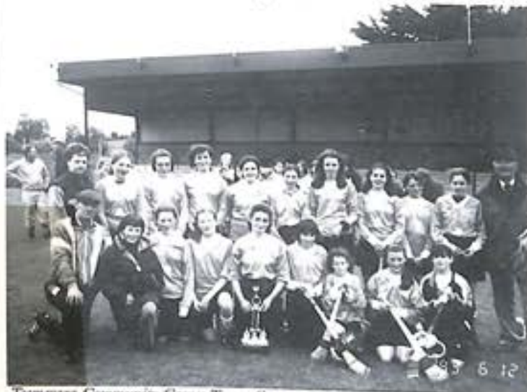
Toomevara Community Games Team: County Champions 1993