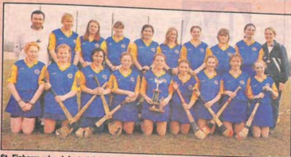
St. Finbarrs who defeated Aghabullogue in the under 16 league final