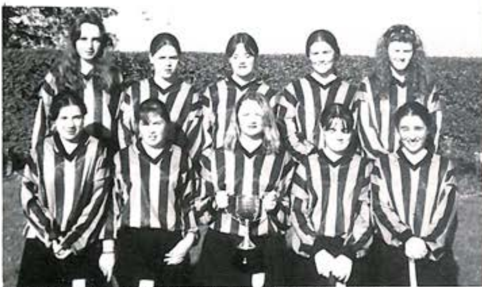
LEINSTER POST-PRIMARY SCHOOLS' SENIOR CHAMPIONSHIP SHIELD FINAL