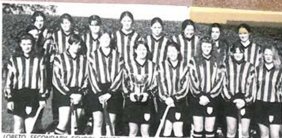
LORETO SECONDARY SCHOOL SENIOR CAMOGIE TEAM LEINSTER COLLEGES SENIOR SHIELD CHAMPIONS 1995