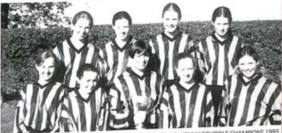
LORETO SECONDARY SCHOOLS FIRST YEAR CAMOGIE TEAM KILKENNY SCHOOLS CHAMPIONS 1995