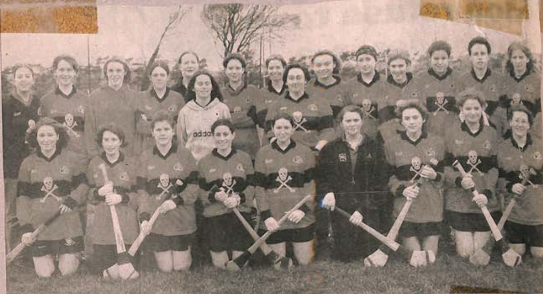
The University College Cork camogie panel of players who defeated UCD in the Ashbourne Cup Inter-Varsities qualifier in Carlow recently.