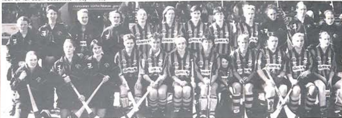
KILKENNY - ALL-IRELAND SENIOR CAMOGIE FINALISTS