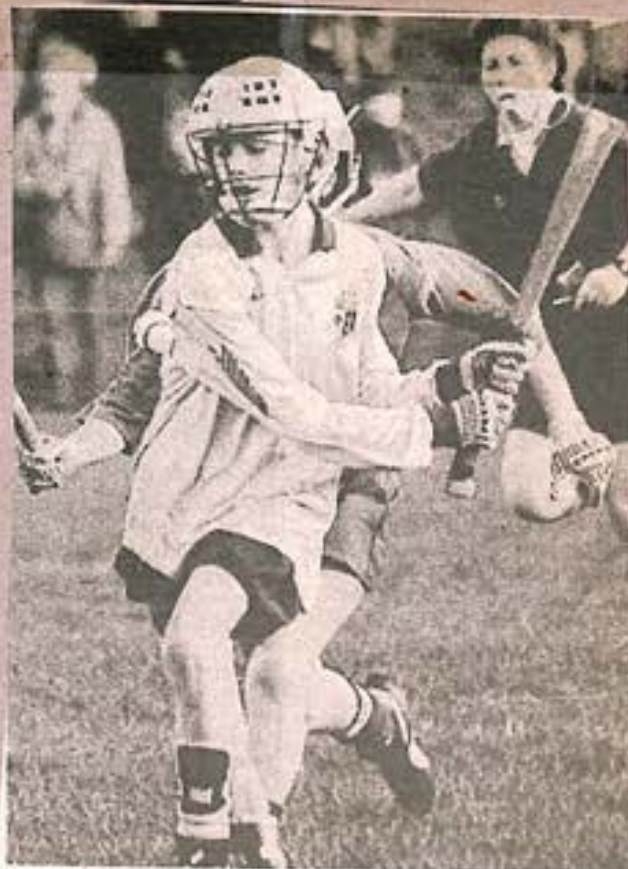
Action from last Saturday's Munster Senior Schools Camogie Final in Newtown. (See page 26 for report and more photos).

for their generous sponsorship for today's final