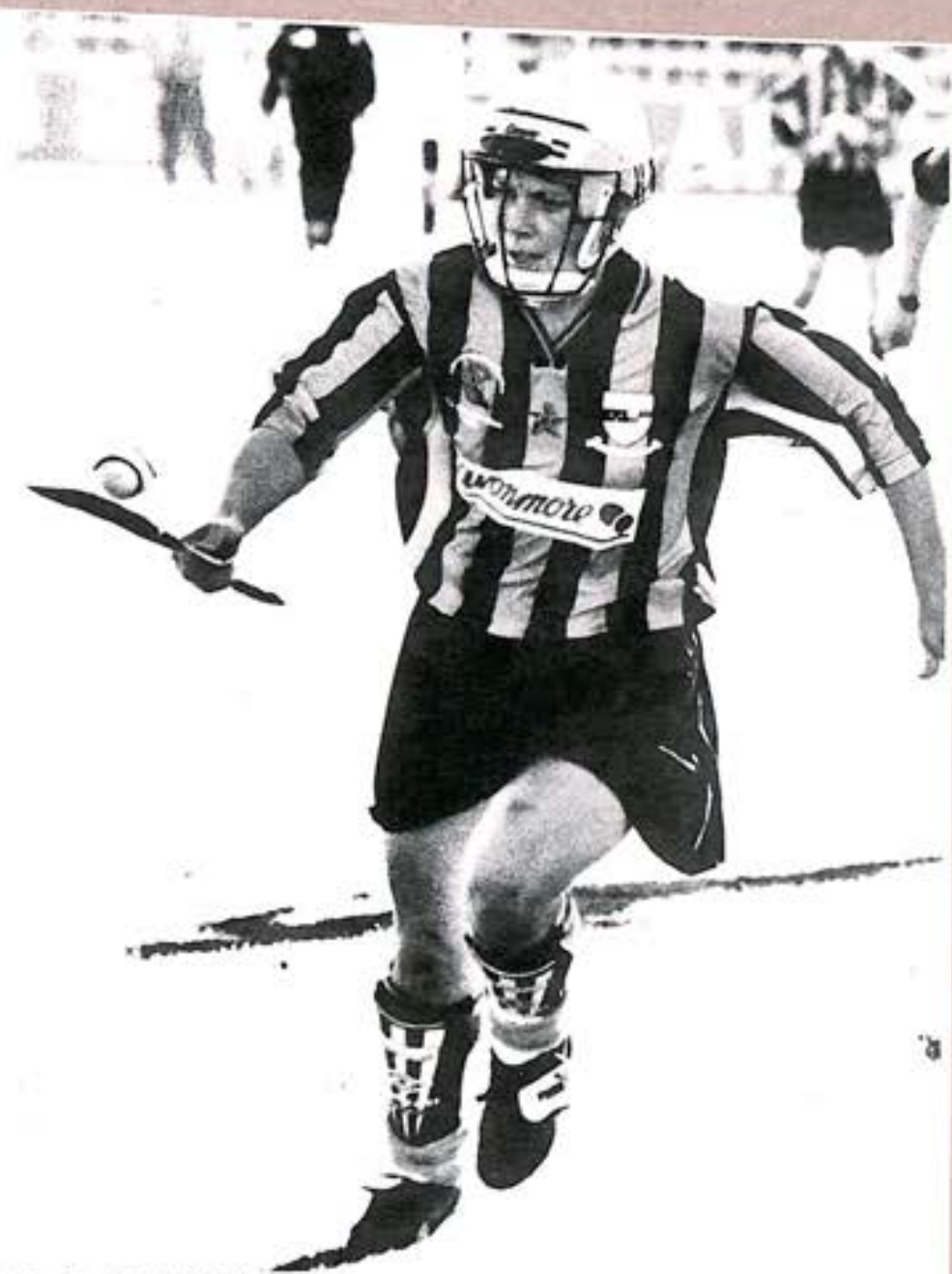
"The Queen" in full flight.

"I honestly thought, travelling to Dublin in September, that we were going to be