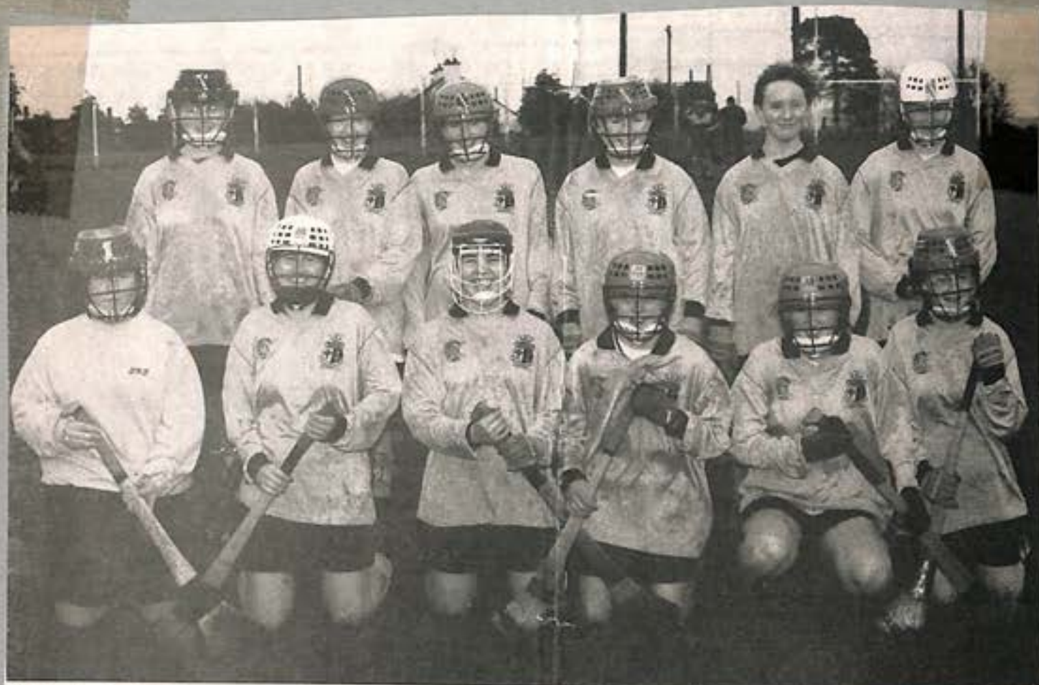
St. Mary's Charleville, who won the Munster Schools Junior camogie final at Mayfield GAA club on Saturday.