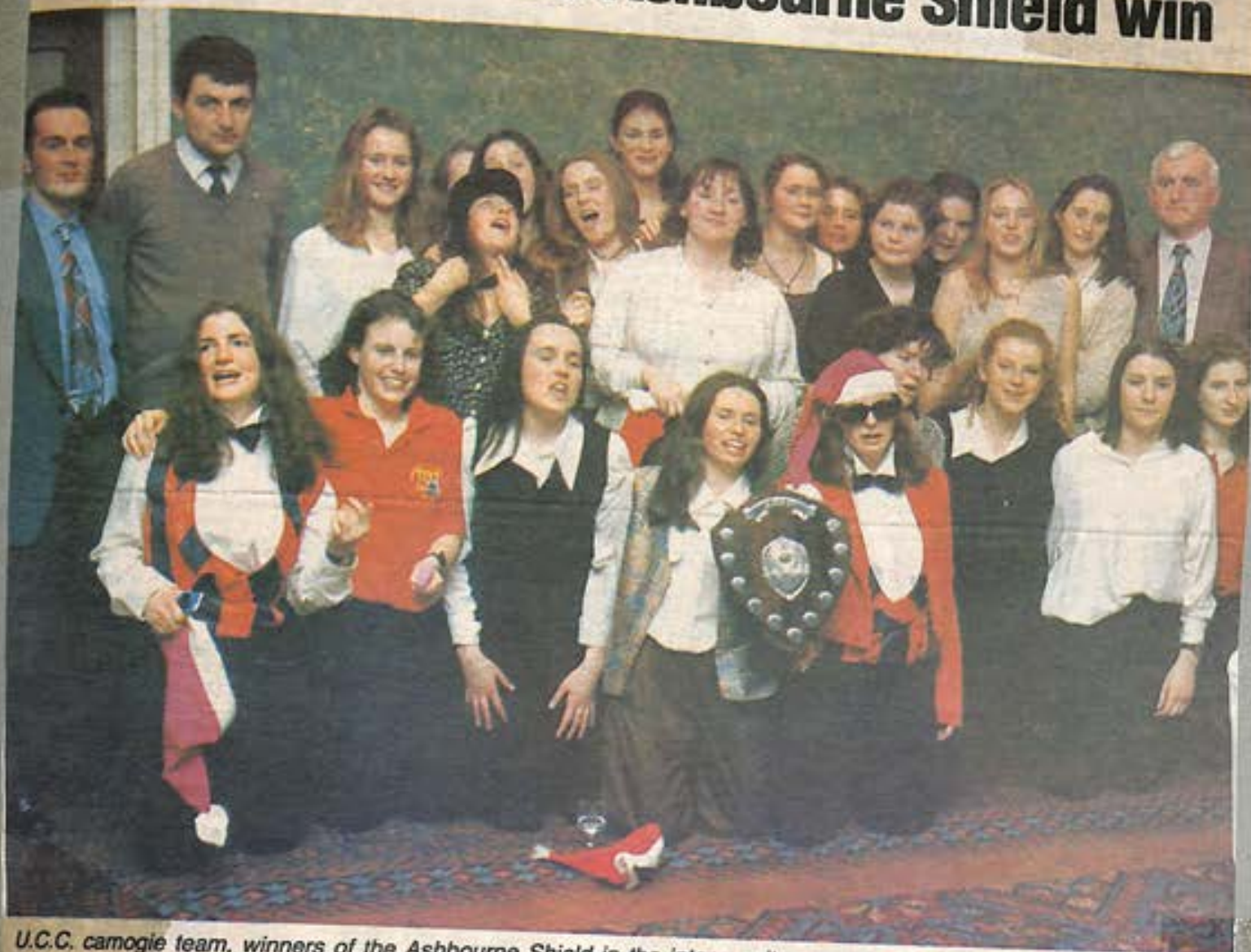
U.C.C. camogie team, winners of the Ashbourne Shield in the inter-varsity camogie finals, during celebrations in the Metropole Hotel last night.