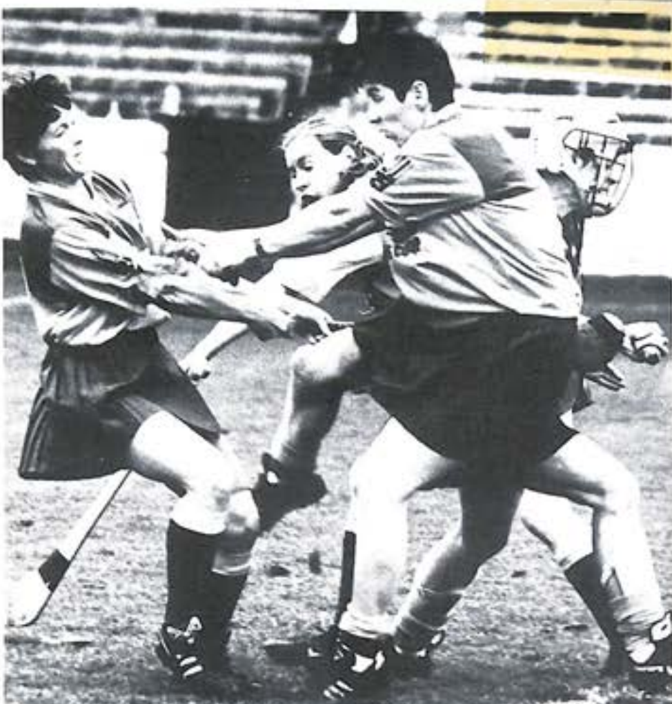
ANGELA'S GOLDEN MOMENTS.. Angela Downey slips through the Wexford rearguard to score Kilkenny's first goal in this year's All-Ireland Senior Camogie Final played at Croke Park.