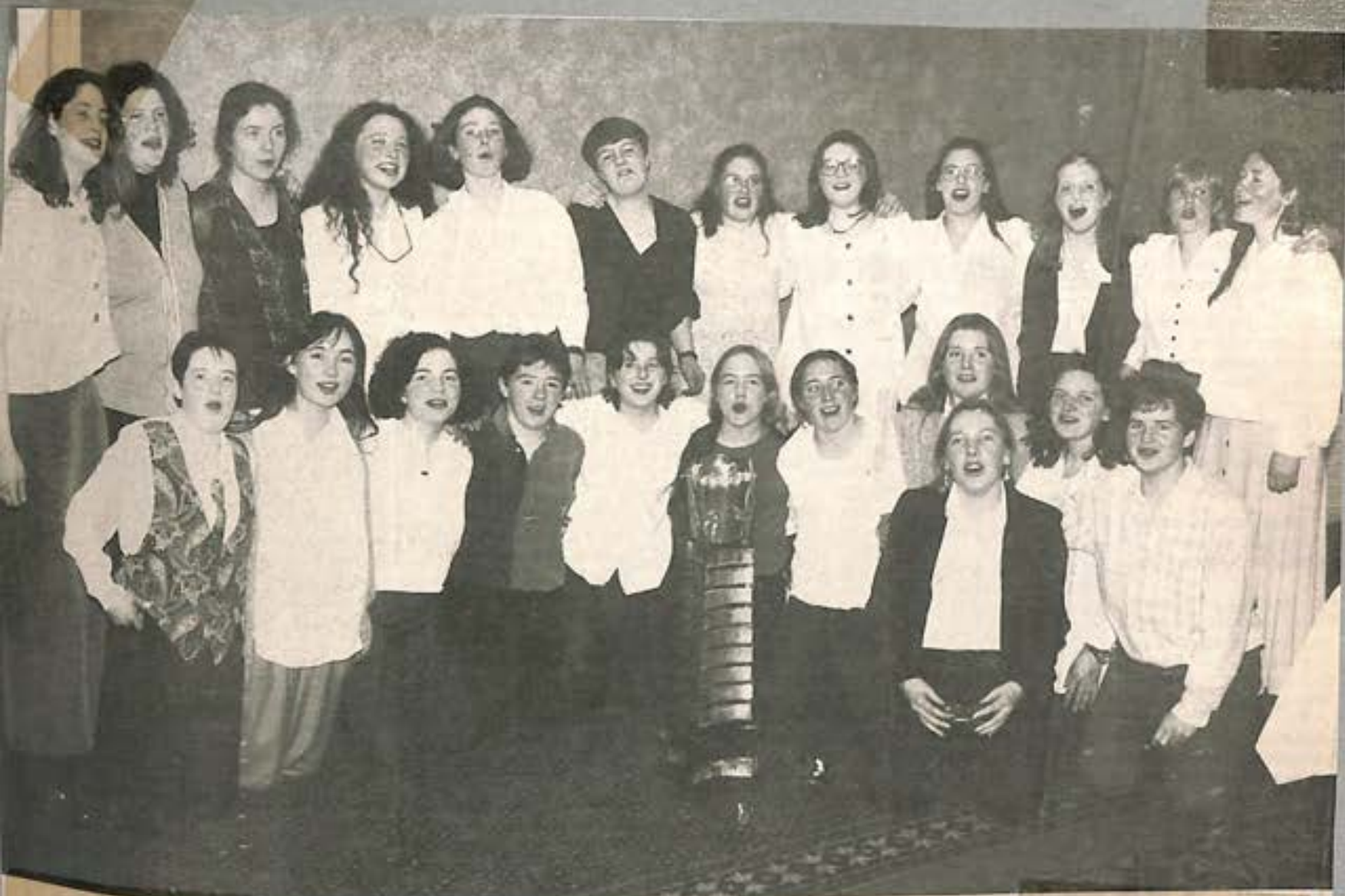
University of Limerick camogie team celebrating their win in the Ashbourne Cup Intervarsity Camogie final at the Metropole Hotel, Cork.