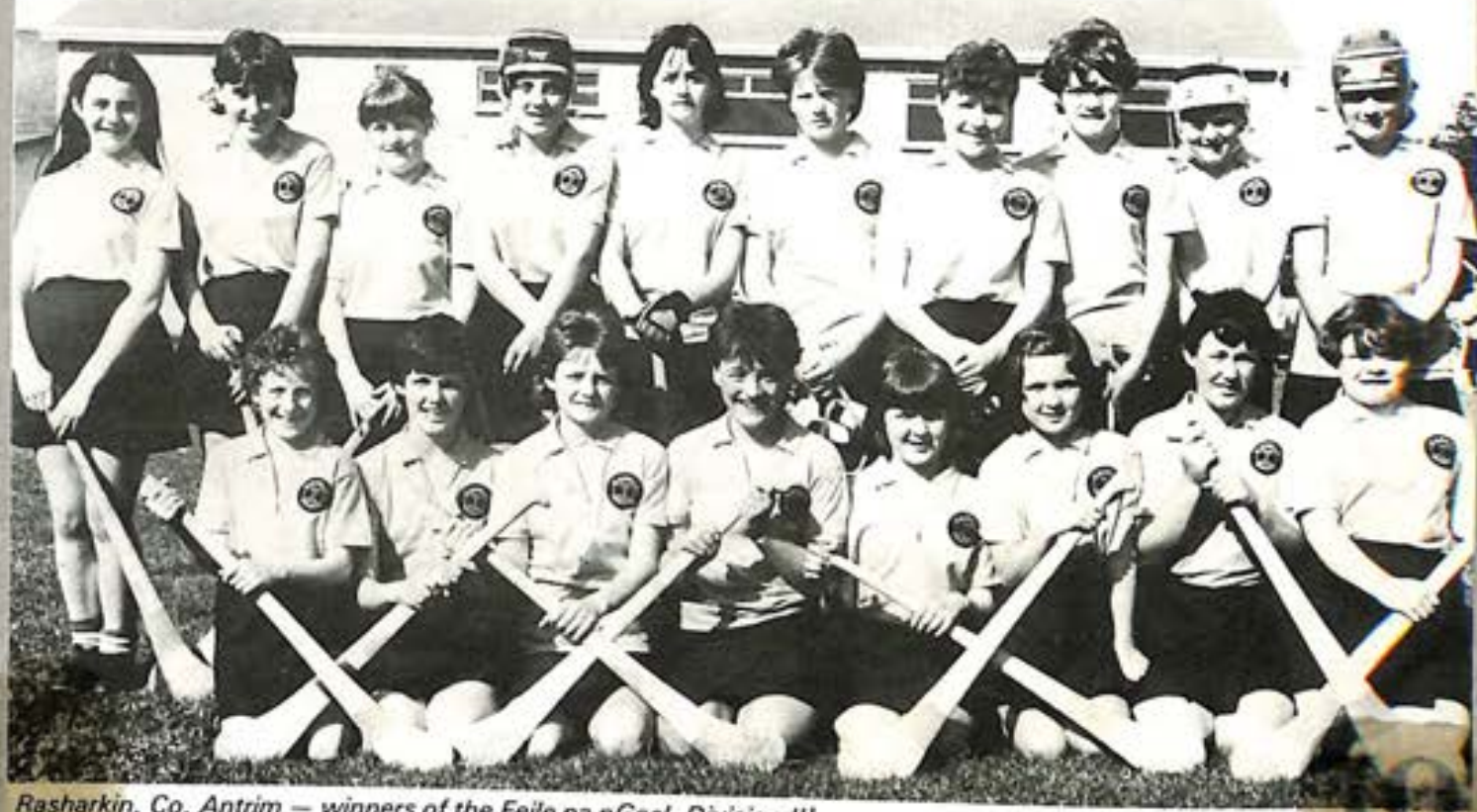
Rasharkin, Co. Antrim — winners of the Feile na nGael, Division III