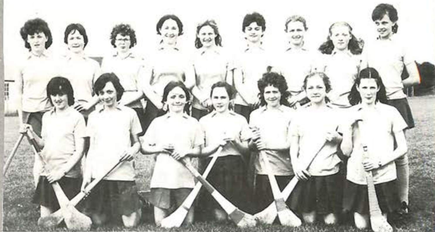
Mullagh, Galway . . . Feile na nGael Division I champions.

The Division 1 title was won by Mullagh, from County Galway.