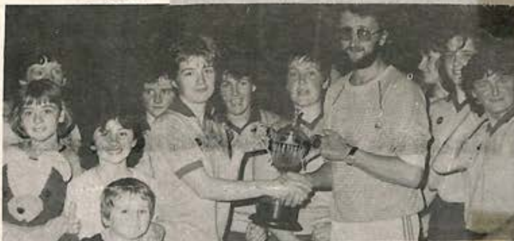
The Buffers Alley Captain receives the cup after her sides splendid victory.