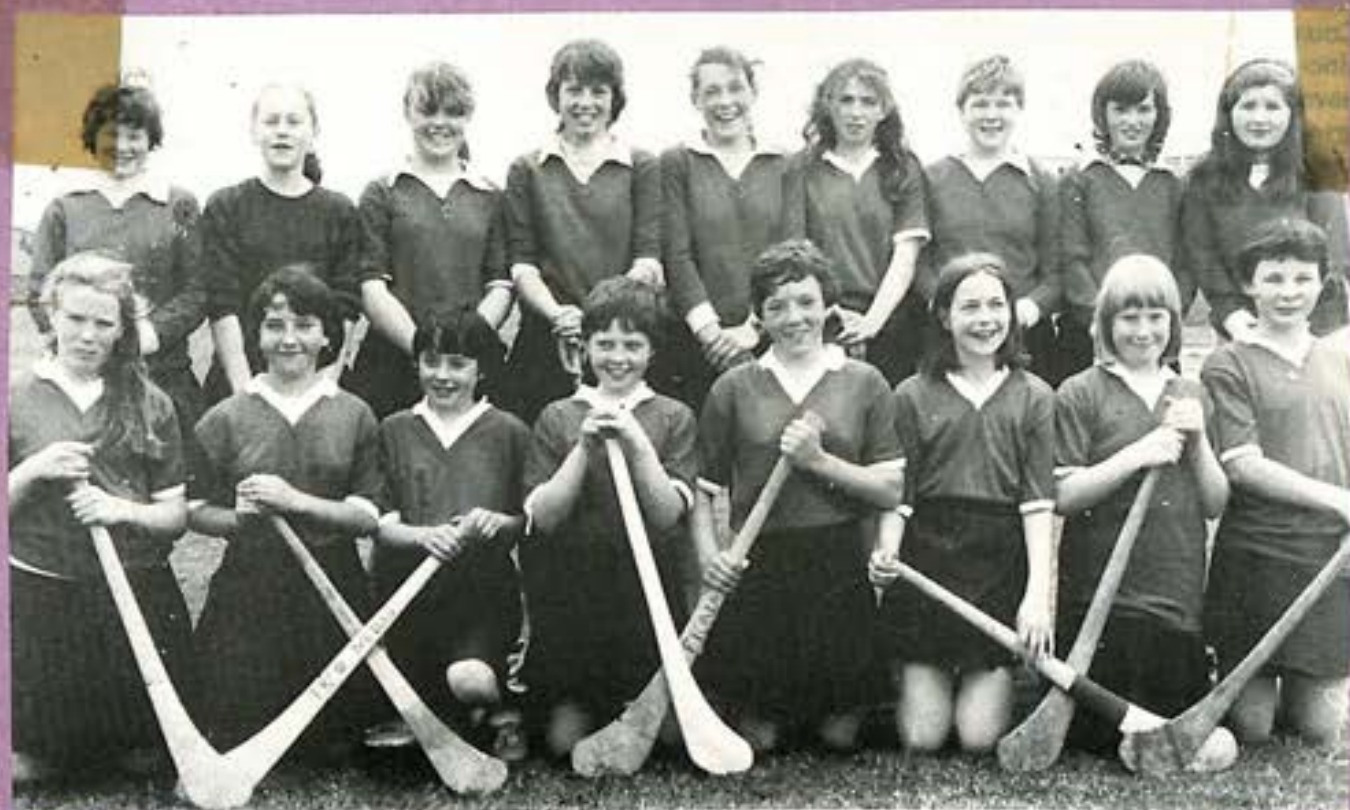
THE FR. O'NEILLS TEAM WHO TOOK PART IN CORK FEILE