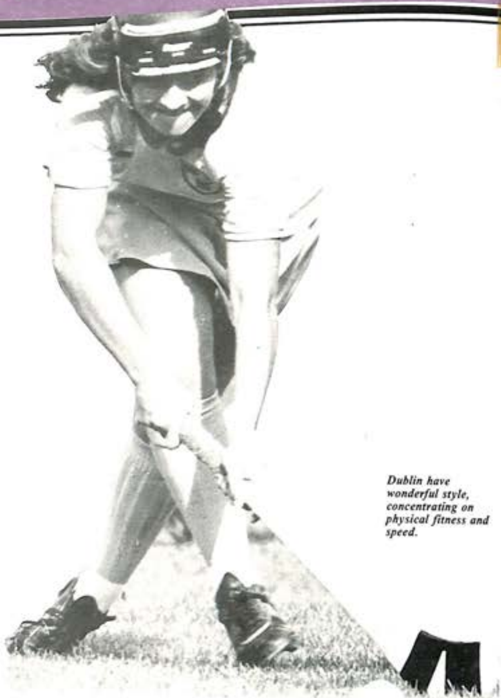
Dublin have wonderful style, concentrating on physical fitness and speed.