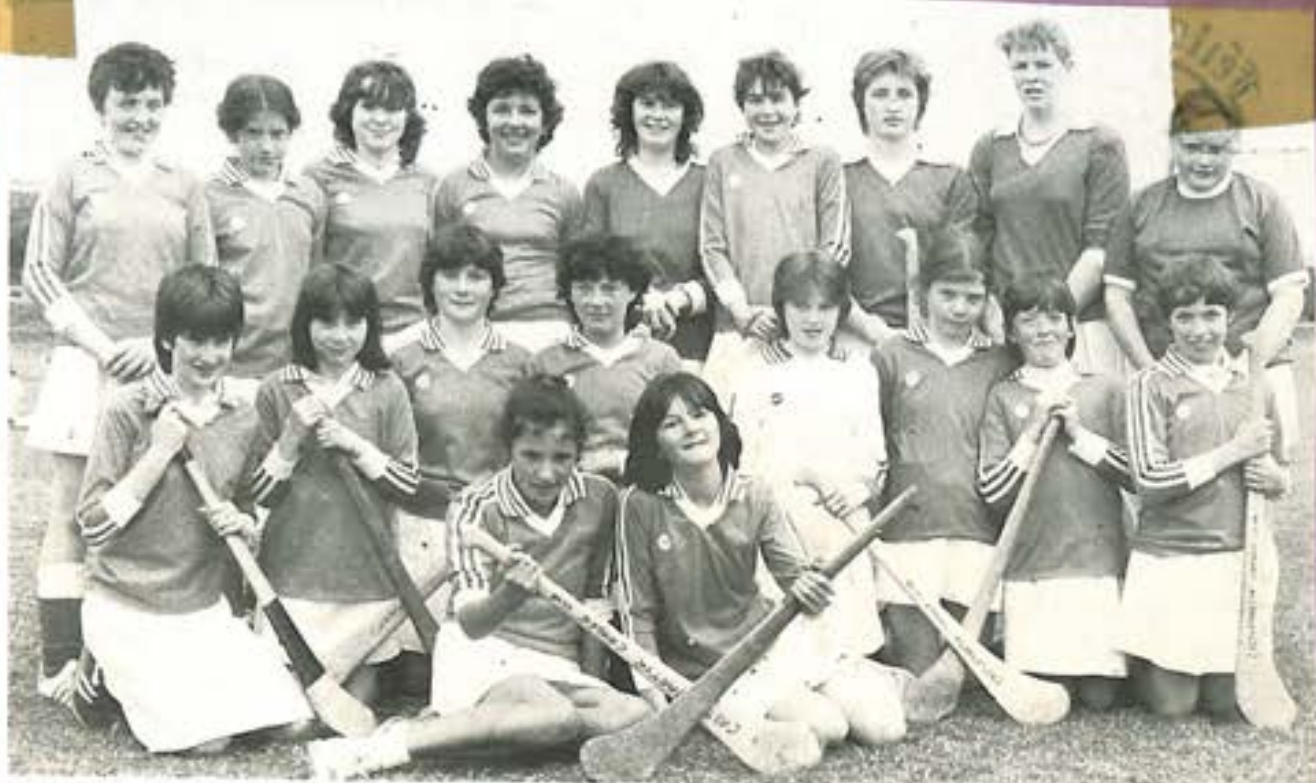
CASTLEMARTYR FEILE TEAM