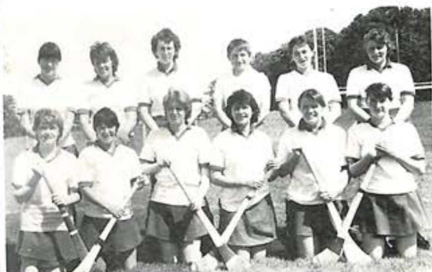
Cork Senior Team—Munster Champions 1985