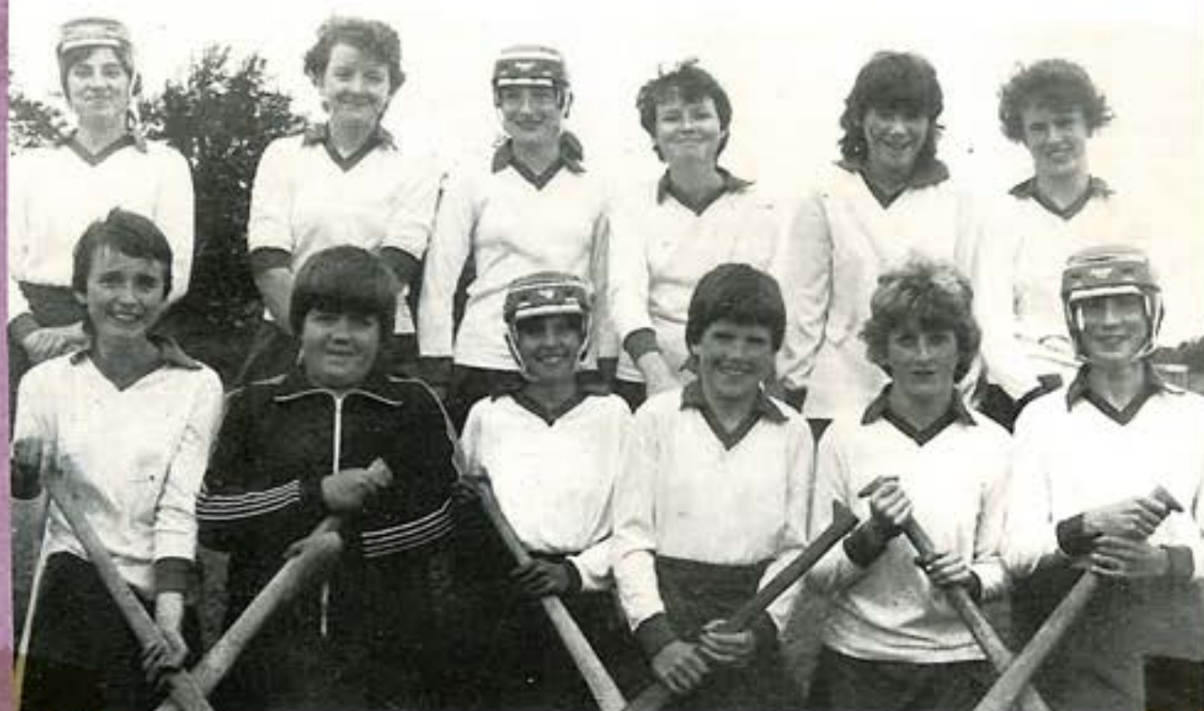
AGHABULLOGUE — CORK FEILE CHAMPIONS 1985 — Photo—Mary Moran