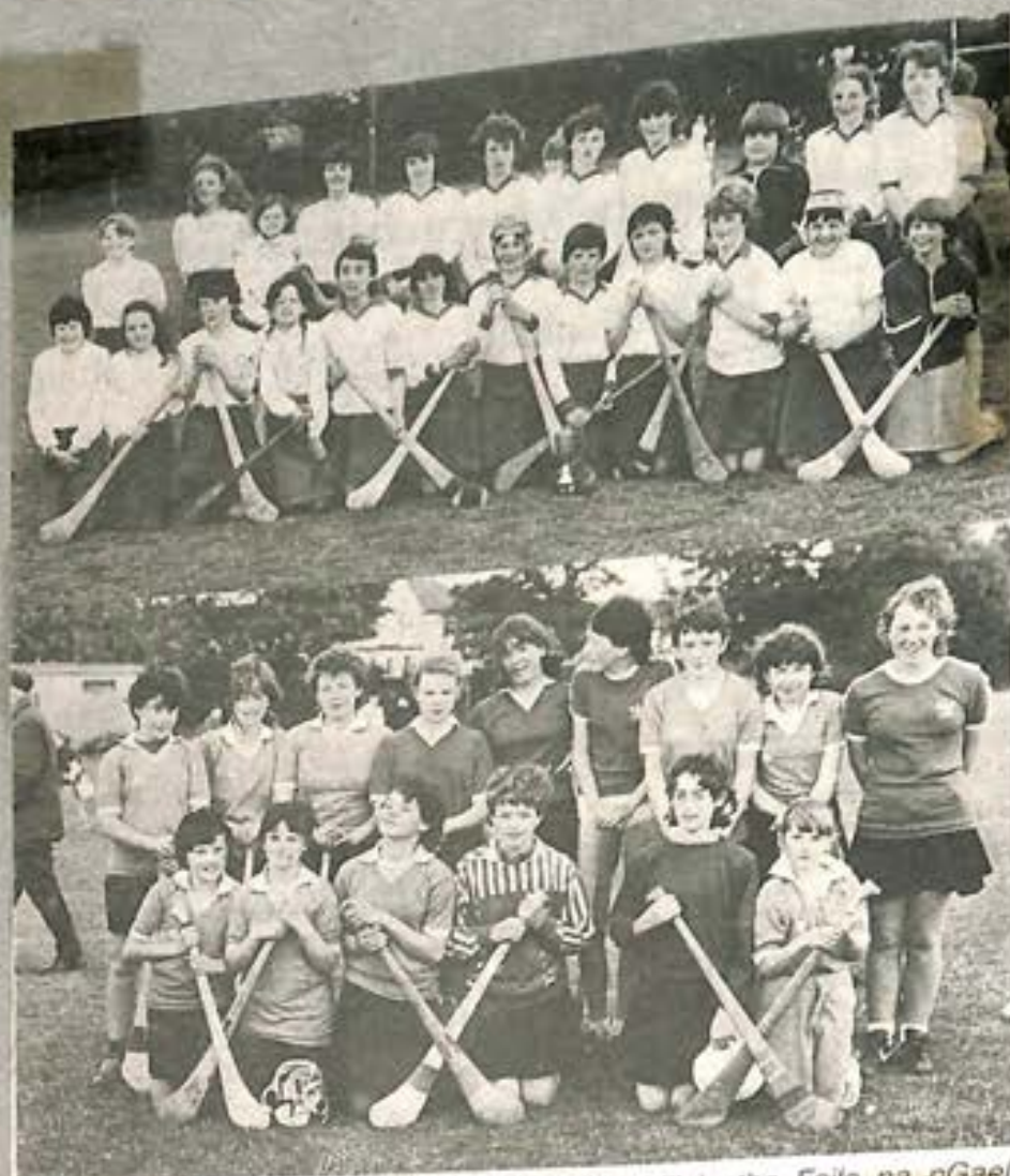
Agnabullogue (top) who defeated Watergrasshill in the Feile, na nGael camogie final, Cork area at St. Finbarrs H & F Club. They now represent Cork in the national finals in Wexford. (Eddie O'Hare)