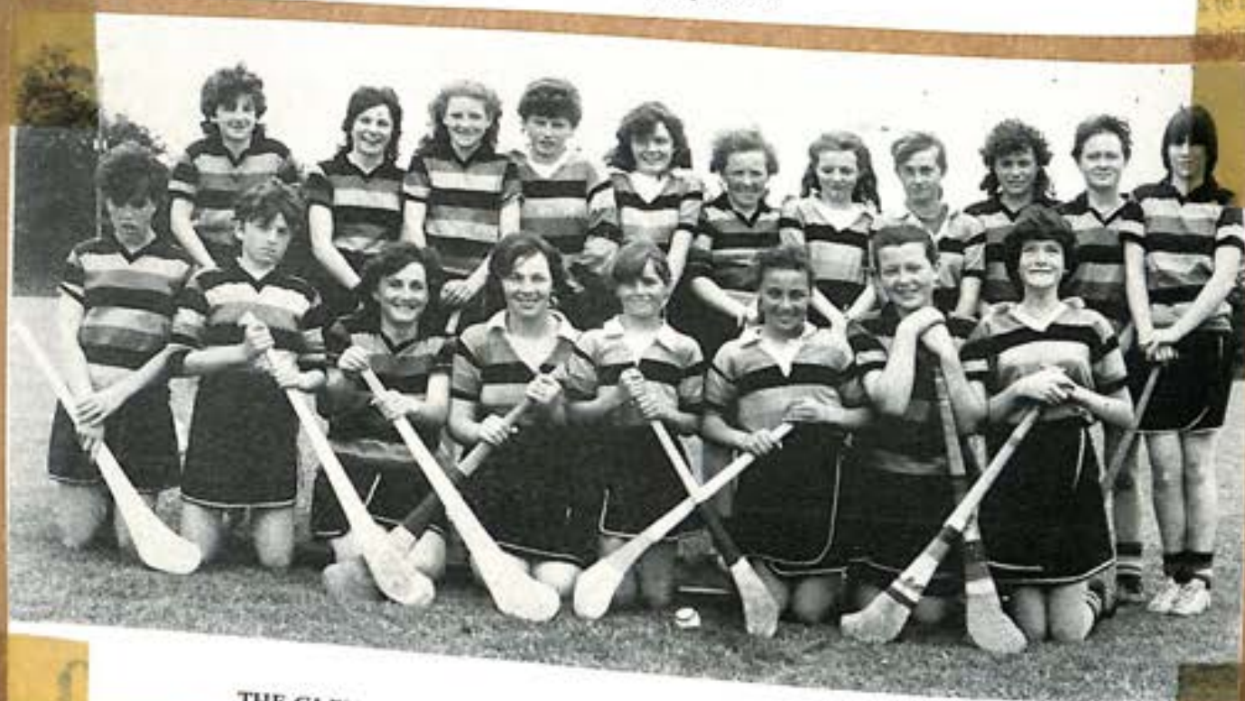
THE GLEN ROVERS FEILE TEAM