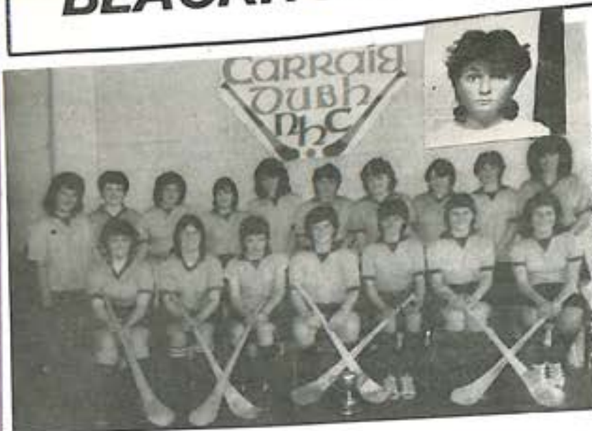
CORK COUNTY INTERMEDIATE CHAMPIONS E 1984