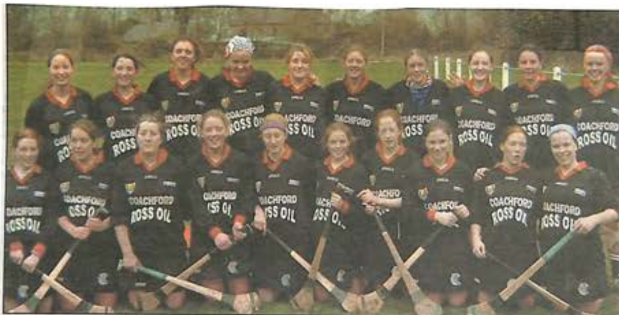
FIRST: The history-making Coachford team who became All Ireland Senior B Colleges champions on Saturday.