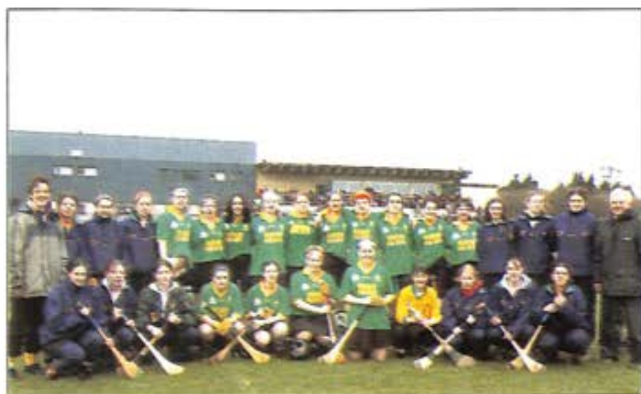
SENIOR A FINALISTS – Coláiste Bride, Enniscorthy