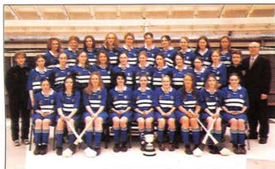
SENIOR A FINALISTS – St. Patrick's College, Maghera