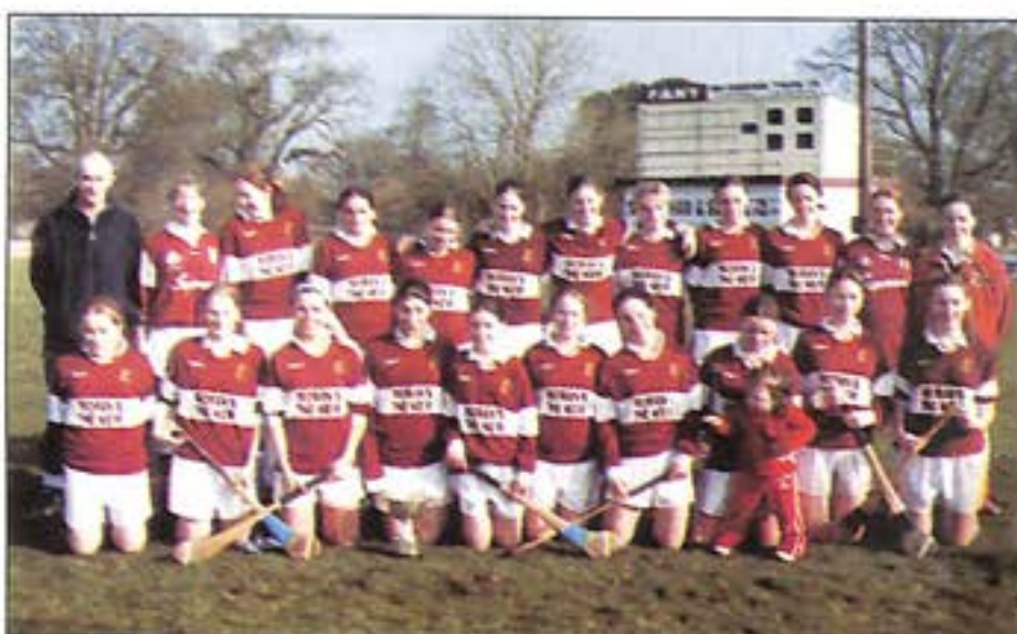
SENIOR B FINALISTS – Presentation Secondary School, Athenry