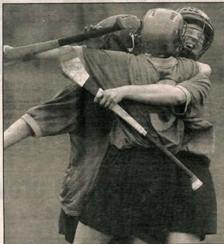
A few of Coláiste Bríde's All-Ireland hopefuls celebrate their recent semi-final dismissal of holders, St. Mary's of Charleville, at Bellefield.

forward. (Oulart-The Ballagh): Has numerous underage medals, including two Féile All-Ireland medals, and an All-Ireland Pan-Celtic title with her club. Holds inter-county Leinster medals for U14 and U16. Won one All-Ireland Schools junior 'A' medal, a senior Leinster and two junior Leinster medals, plus one football Leinster medal with the school.