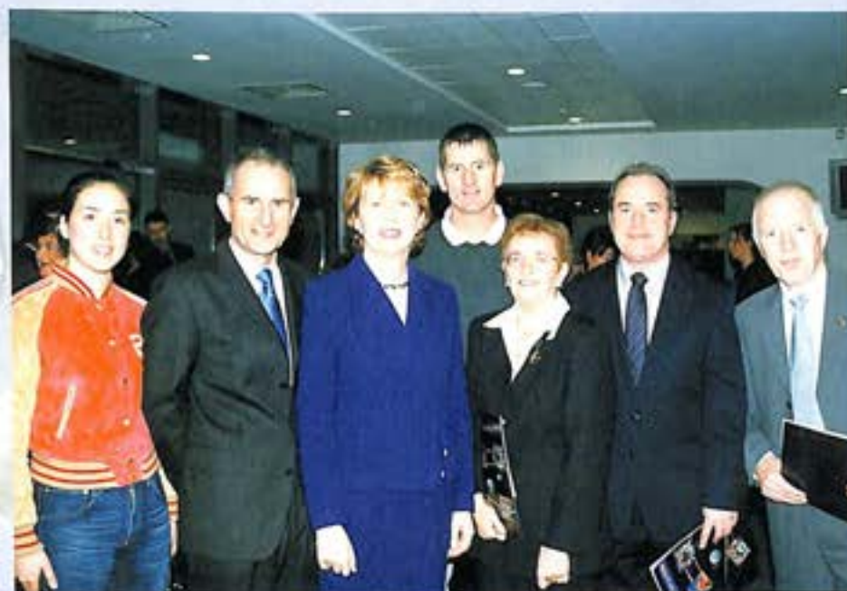
Down GAA & Camogie representatives (top) and Laois GAA, Camogie and Ladies Football (below) representatives with President McAleese & husband Martin at the launch of the pilot scheme for the integration of the Ladies Football and Camogie Associations with the GAA.

Cumann Camógalocta na nGael was founded in 1904 and will celebrate its centenary next year. The Ladies Gaelic Football Association (Cumann Peil Gael na mBan) was established in 1974 and has experienced phenomenal growth since its inception.