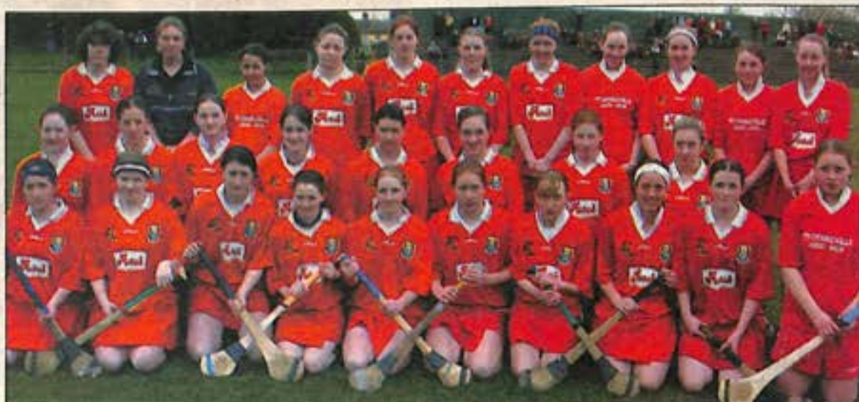
The Cork minor camogie panel which began their championship campaign with a 5-10 to 1-4 win over Limerick.