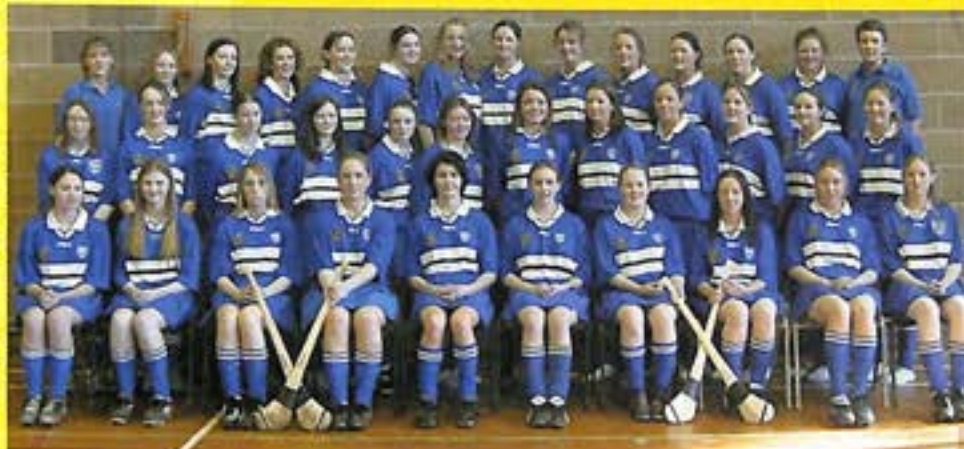
The St. Patrick's Maghera camogie panel