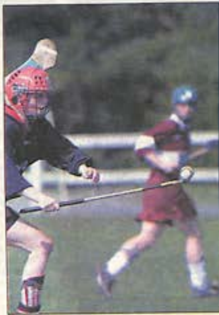
Action from the All-Ireland B Camogie Final.