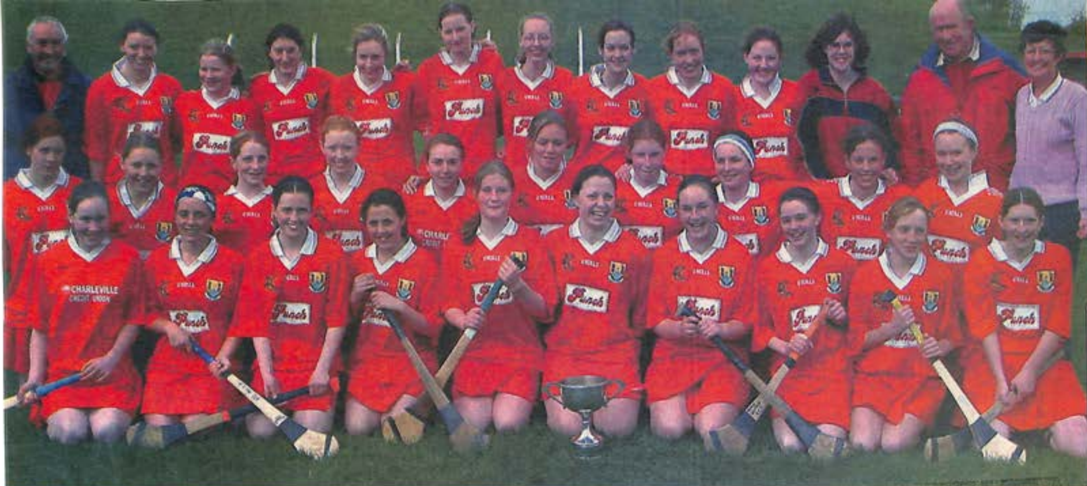
The Cork minor camogie team who completed a great Munster championship three-in-a-row by beating great rivals, Tipperary, by 6-13 to 4-4 at Charleville on Saturday last.