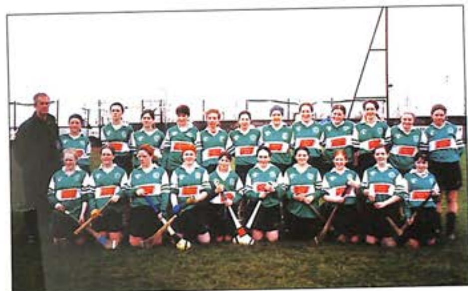
JUNIOR A FINALISTS - Portumna Community School