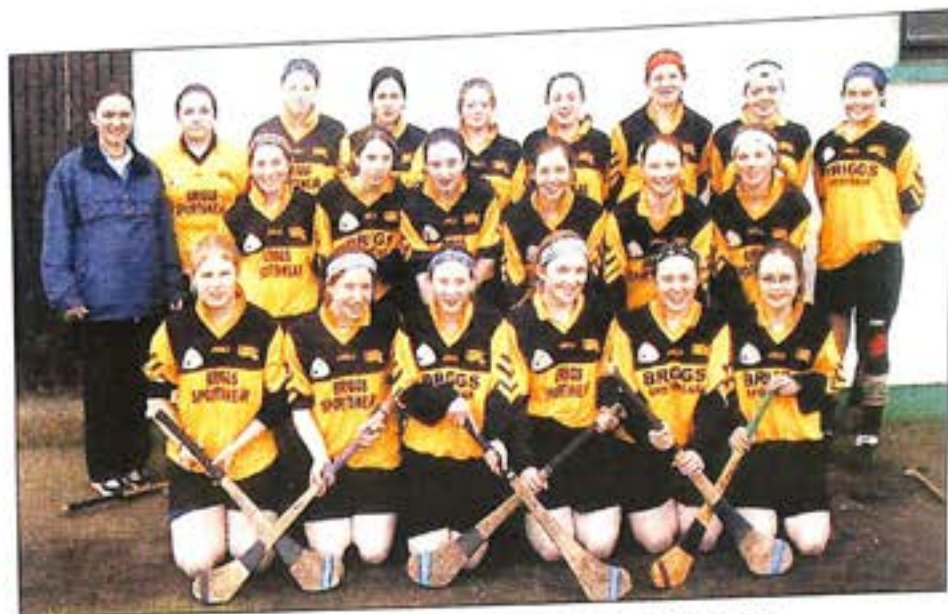
JUNIOR B FINALISTS - Holy Rosary College, Mountbellew