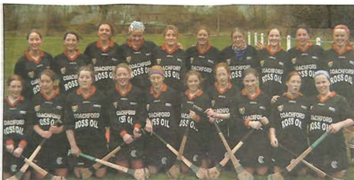
FIRST: The history-making Coachford team who became All Ireland Senior B Colleges champions on Saturday.