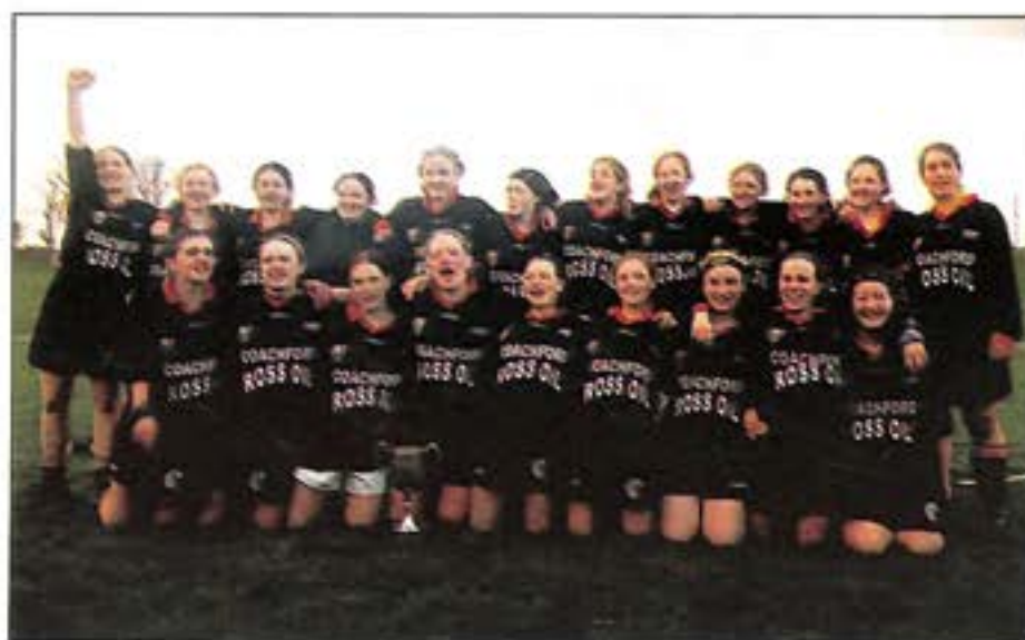
SENIOR B FINALISTS – Coachford College