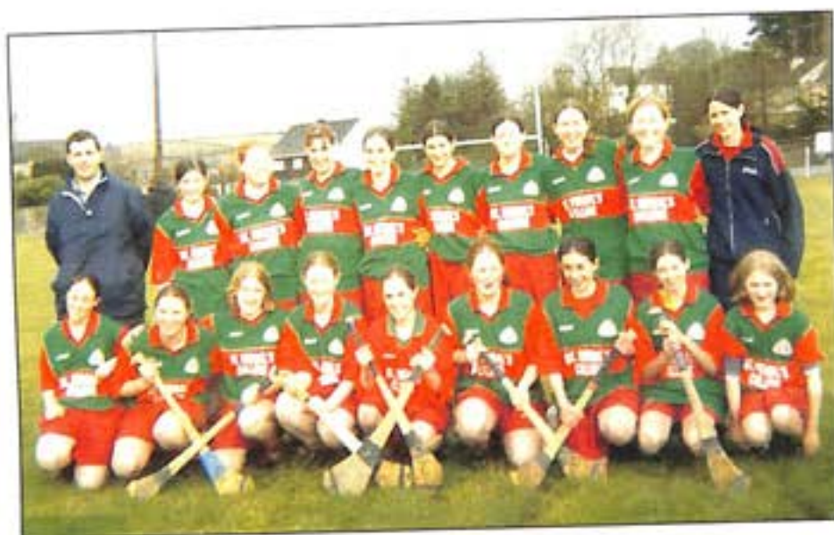
JUNIOR B FINALISTS - St. Fergal's College, Rathdowney