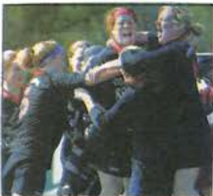
Jubilant after-match scene following the victory of Coachford College.