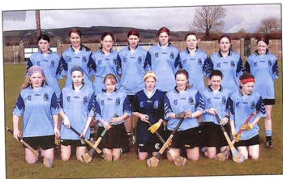
JUNIOR A FINALISTS - St. Mary's Secondary School, Charleville