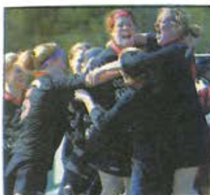
Jubilant after-match scene following the victory of Coachford College.