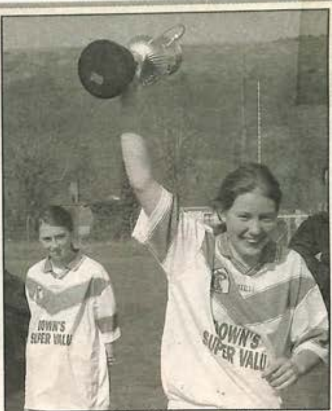
A delighted Rena Buckley (Inniscarra and captain of Muskerry) celebrates after receiving the County Inter-Divisional Cup.