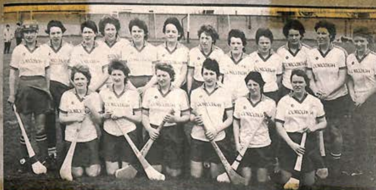
The Cork team who won the National Camogie League Final at O'Toole Park, Dublin by defeating Dublin.