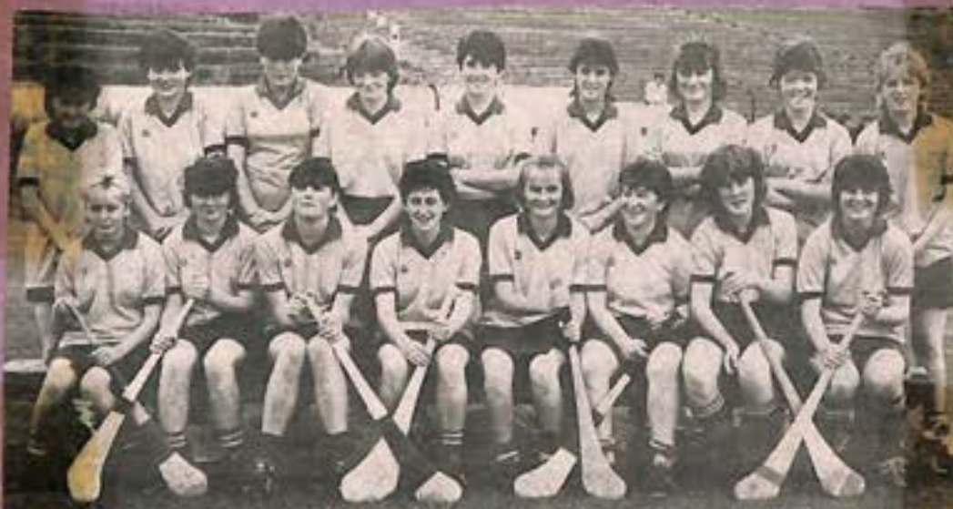
The Wexford minor camogie team defeated by Galway in the All-Ireland minor camogie final at Wexford Park last Sunday.