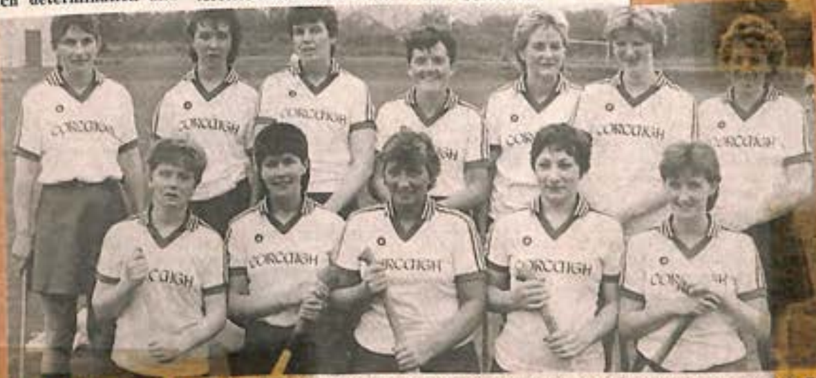
The Cork team who defeated Antrim by 2-7 to 1-2 in the All-Ireland camogie quarter-final at St. Finbarr's, Toghher, yesterday.