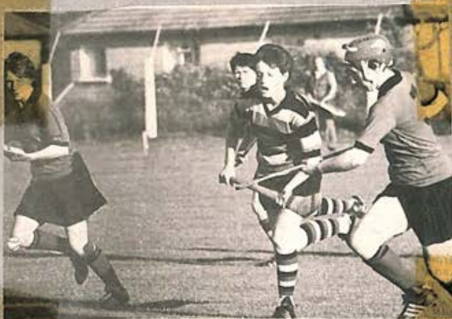
Action during the Cork Co. Senior Camogie final at Ballinlough last night between Glen Rovers and Killeagh.