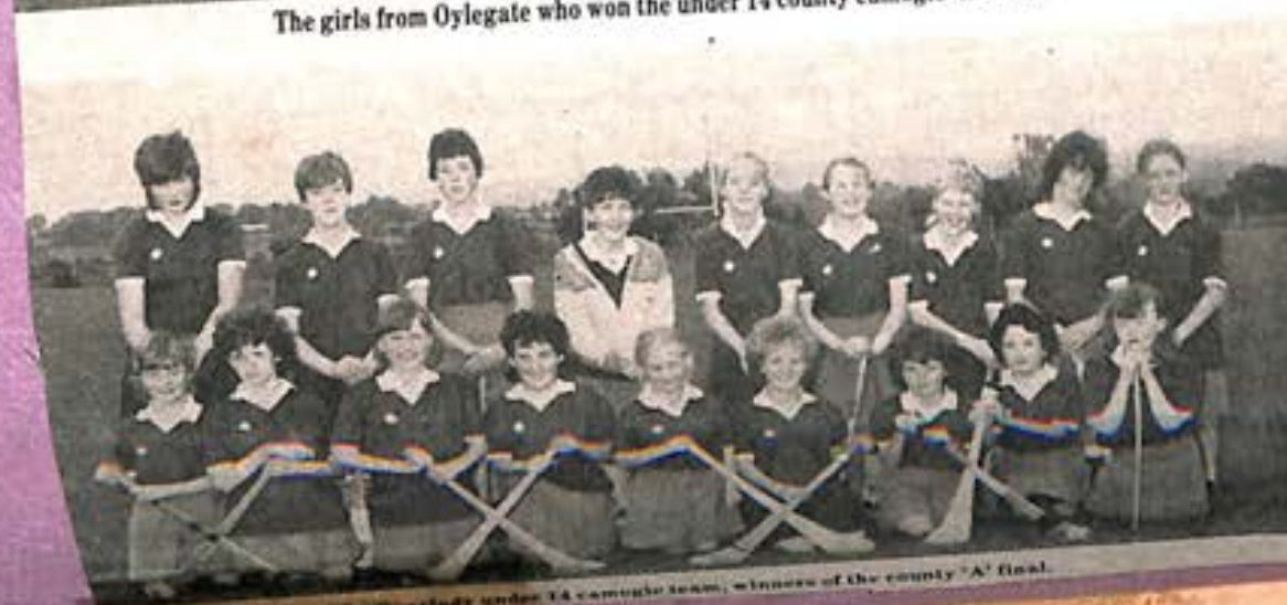
The Rathnure under 14 camogie team, winners of the county 'A' final.