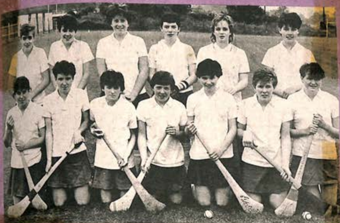
The Cork team which defeated Clare in the Munster minor camogie championship final at Douglas, Cork.