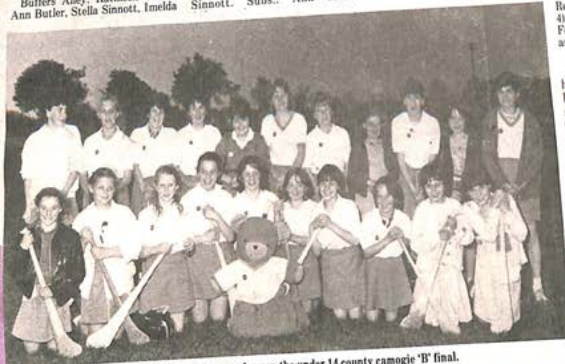
The girls from Oylegate who won the under 14 county camogie 'B' final.