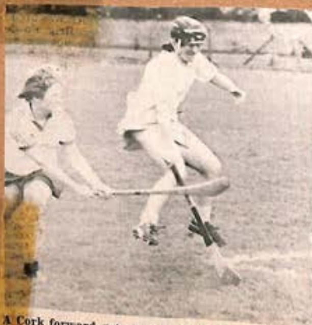
A Cork forward gets to the ball first and shoots for goal during the National Camogie League final against Dublin in O'Toole Park, Dublin yesterday.