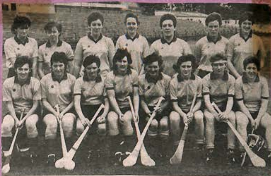
Buffers Alley winners of the County Senior Camogie title when they defeated Rathmure (below) on Sunday last, to take the title for the twelfth year in succession.

All-Ireland Senior Championship — quarter-finals At Silver Park, Dublin (3.0) — Dublin v Tipperary. At Monaghan (2.30) — Wexford v Galway. At St. Flannan's, Cork (12.00) — Cork v Antrim. At Nowlan Park (7.00) — Kilkenny v Limerick.