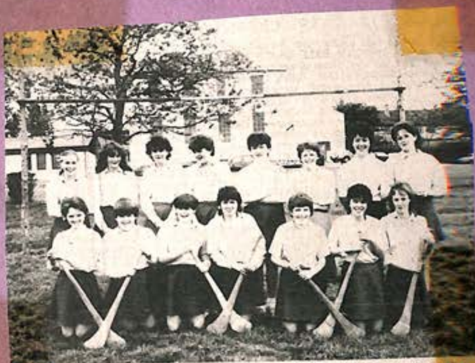
Coachford Community College, winners of Co. Cork V.E.C. Camogie Championships.