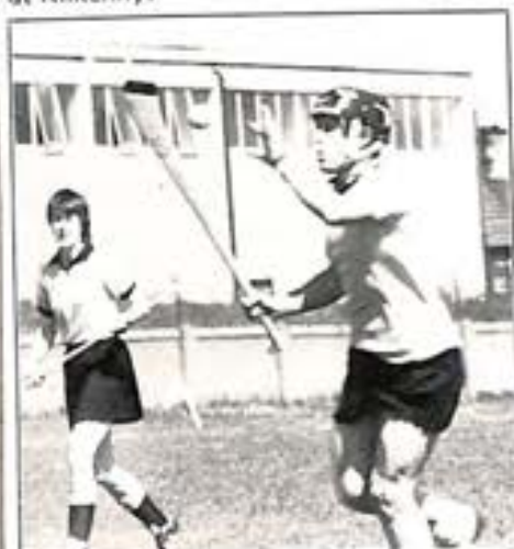
Match winning skills from Angela Downey.

Angela has become something of a legend in the short history of this superstars test. She won the title for the first time in highly impressive fashion in 1984 in Dublin, and did even better when she retained the crown last year at Kilkenny.