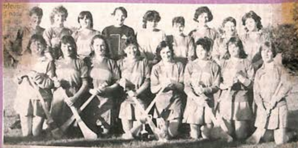
Cashel County Senior Champions who defeated Newport (St. Mary's) in Drombane in the county camogie final.

It was the first time Cashel ever won the Sean Treacy Cup presented by Dan Breen in 1943 to the camogie girls of Tipperary.