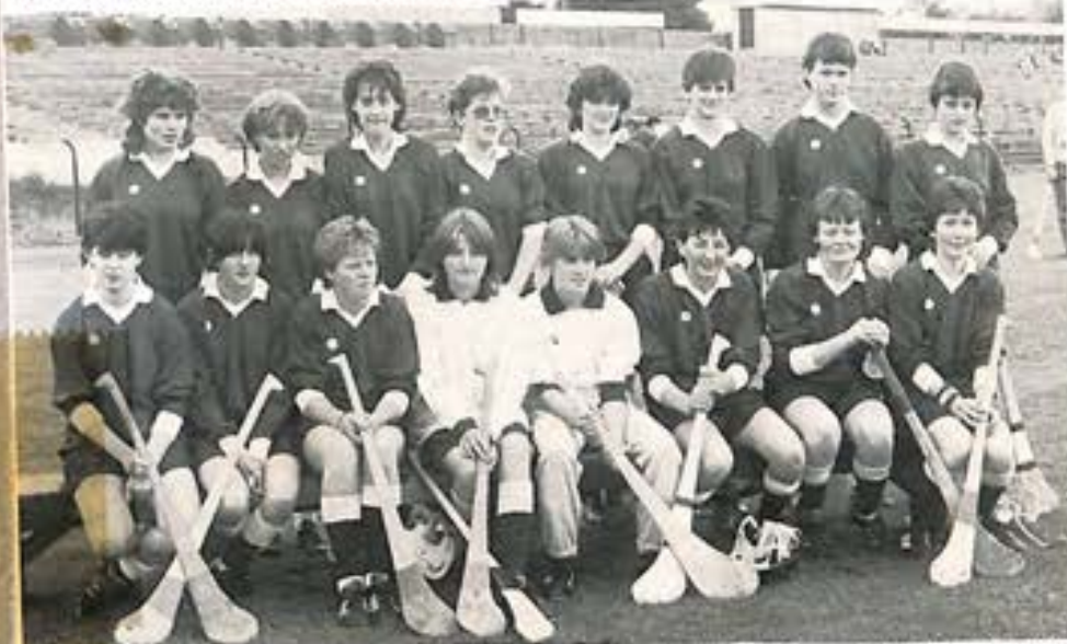
The Galway minor team that beat Wexford to win the All-Ireland camogie title for the third time in the county's history.

This is Galway's first title since 1981, and their second in all.