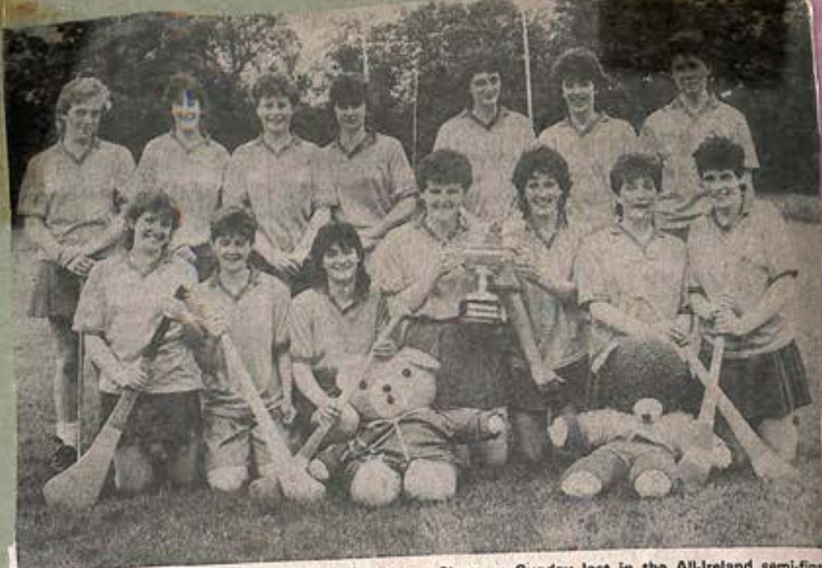
Roscommon county camogie team which lost to Clare on Sunday last in the All-Ireland semi-final pictured after they won the Connacht title.