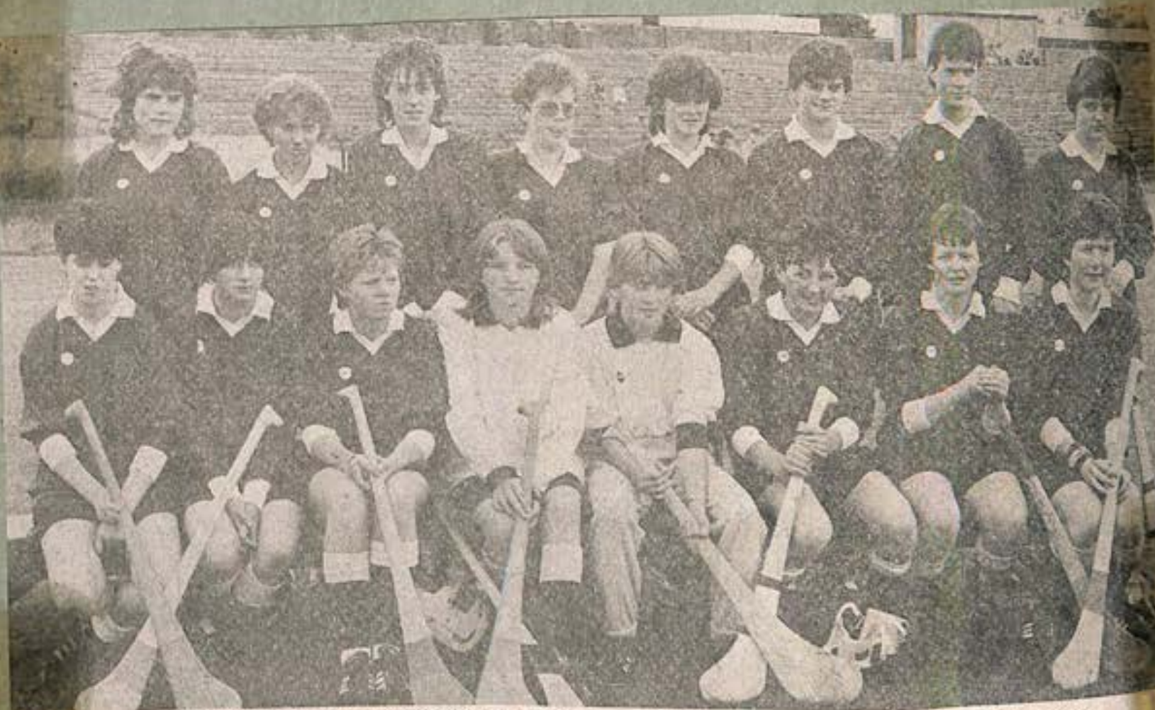
THE Galway team which defeated Wexford on Sunday to win their third All-Ireland Minor Camogie Championship.