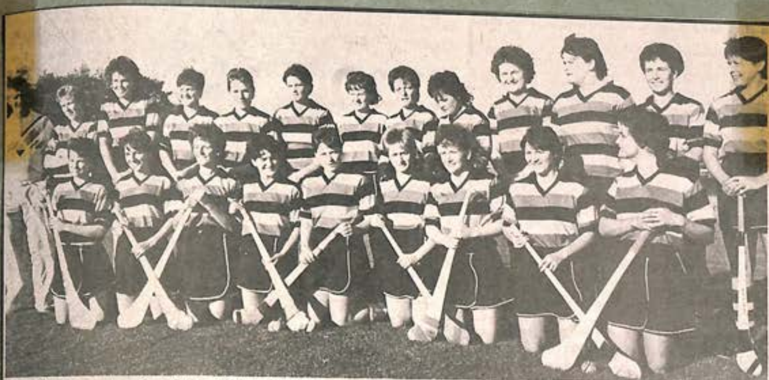
The Glen Rovers team (top) that beat Killeagh in the Cork Co. Senior camogie final at Ballinlough last night.