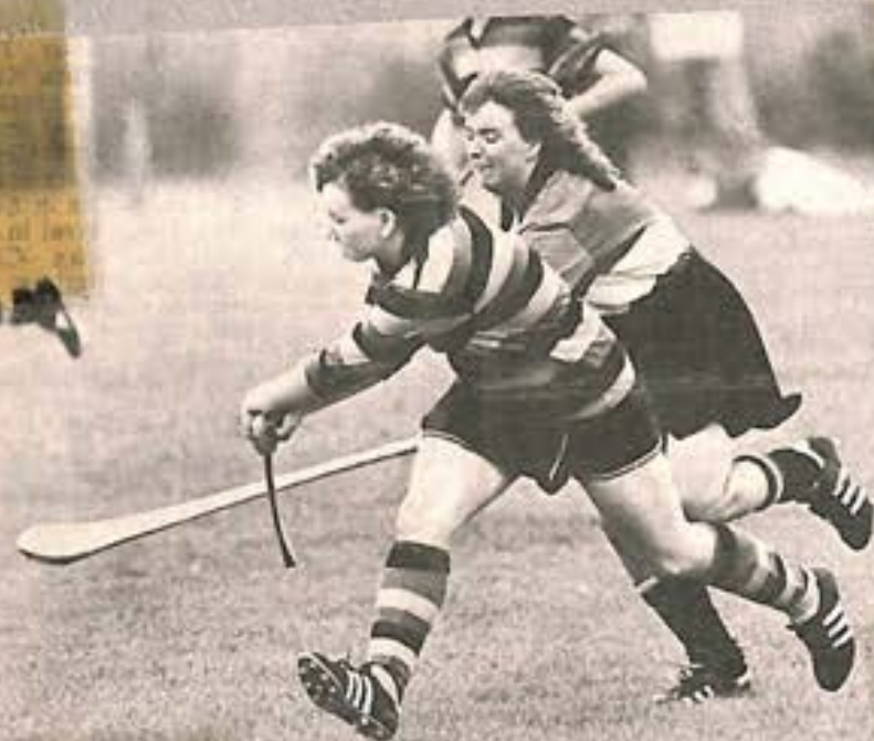
A Glen Rovers player is first to the ball during the Cork County Senior camogie championship semi-final at Carrigtwohill yesterday.