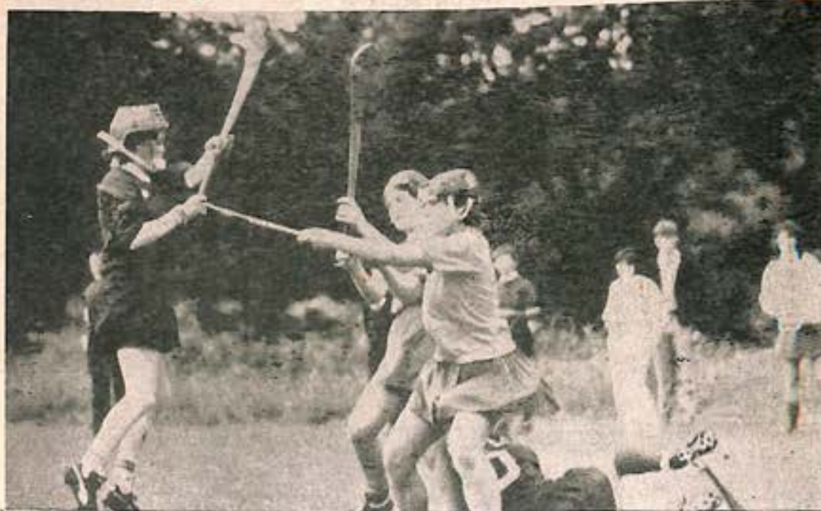
HALT! Two Roscommon players get in a telling tackle during Sunday's game.