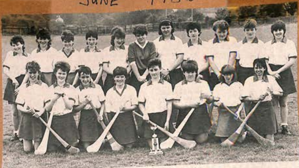
Members of Aghabullogue under-16 league winning team.