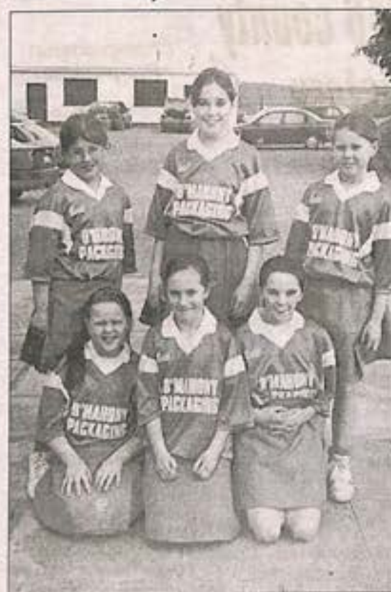
■ The Ballinhassig U11 team who competed at the South East Camogie Blitz in Riverstick.