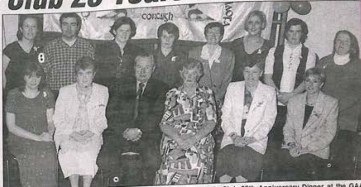
■ Committee members and guests at the St. Finbarr's Camogie Club 25th Anniversary Dinner at the GAA Club.