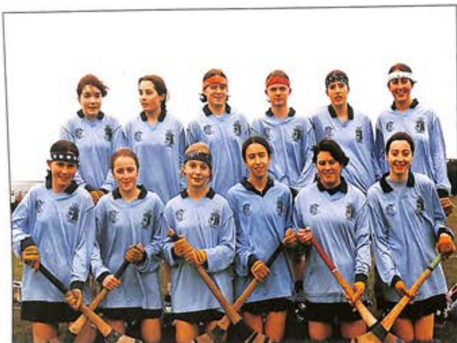
JUNIOR FINALISTS - St. Mary's, Charleville