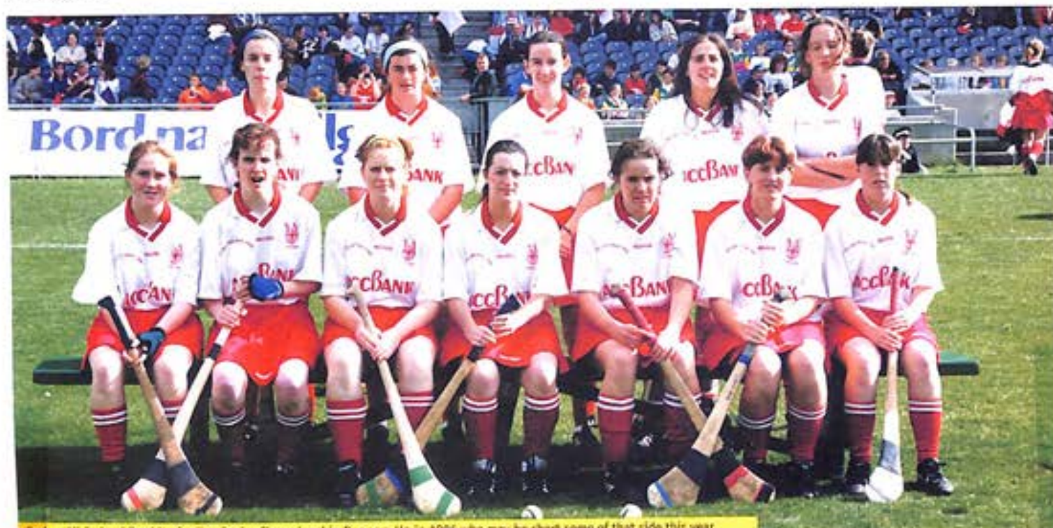
Cork... All-Ireland Bord Na Gaeilge Senior Championship Runners-Up in 1996 who may be short some of that side this year.