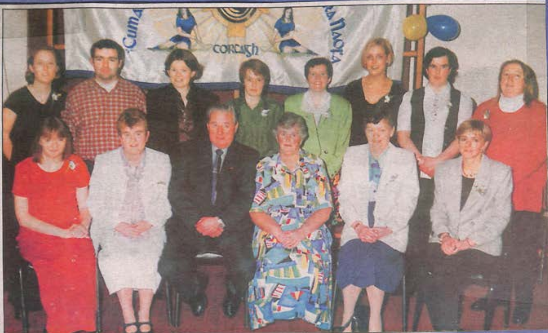
Some of those who attended the silver jubilee celebrations of St. Finbarr's Camogie Club which were held recently.