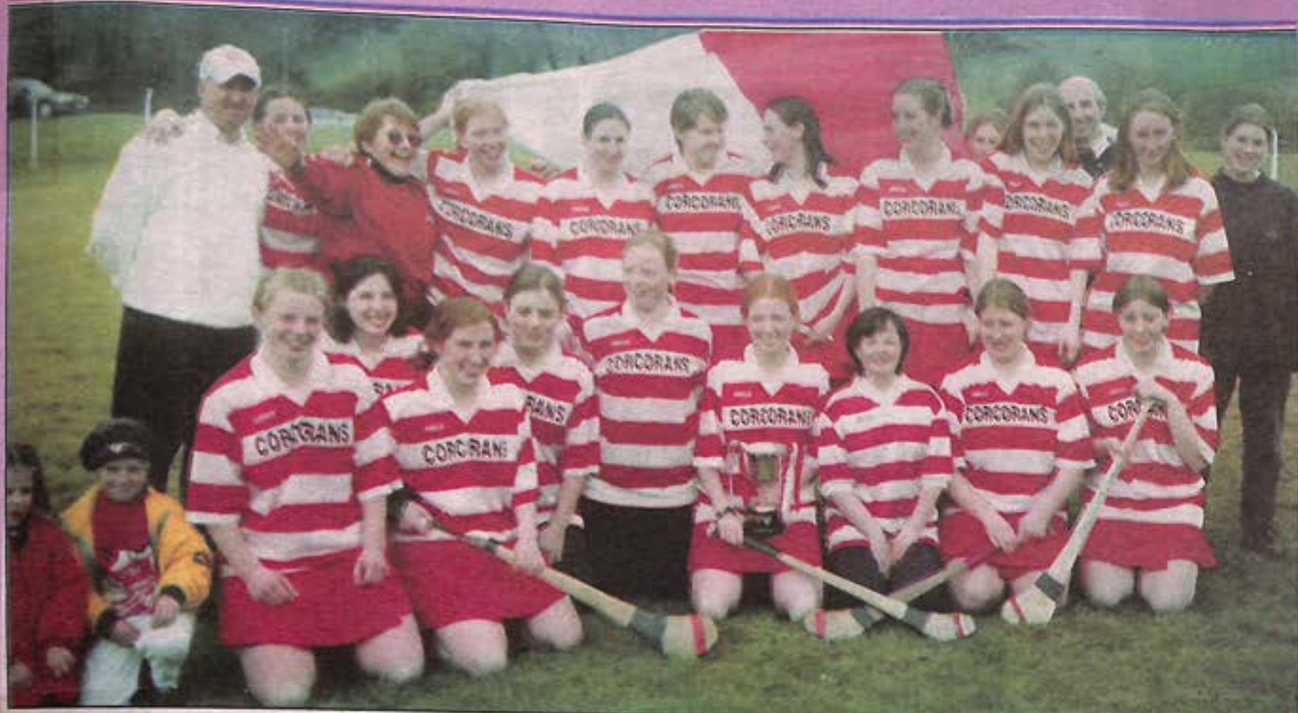
The Courcsey Rovers camogie team who capped a season to remember with victory in the U-18 county championship final recently.