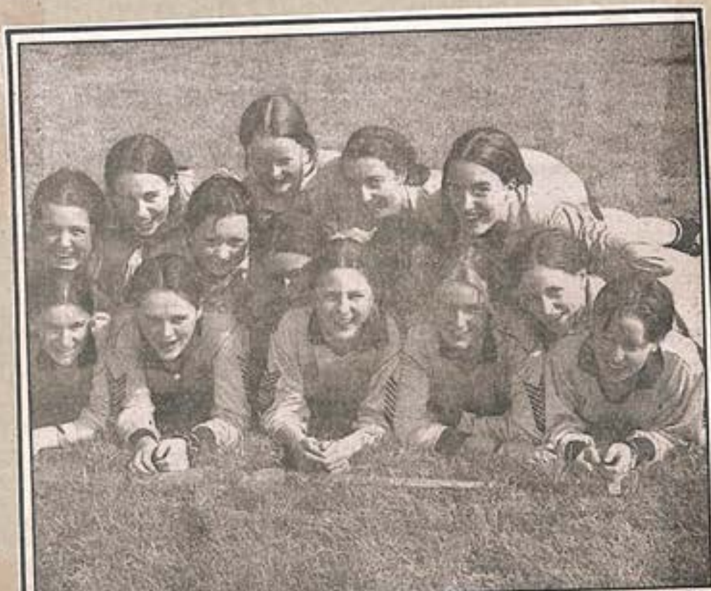
FINAL SMILES . . . Members of the St Mary's Charleville junior and senior teams who will contest the All-Ireland finals at Tullamore this afternoon.

Thursday, Under 16 league: Eire Og v Na Piarasigh at Na Piarasigh 7.15.