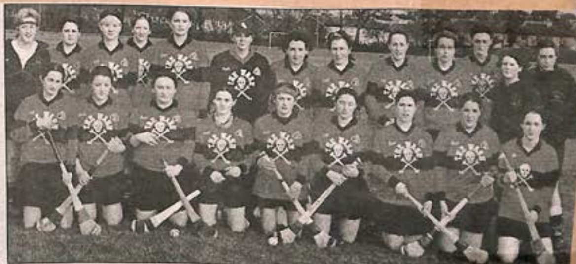
■ UCC Camogie team who beat WIT in their Ashbourne Cup game.