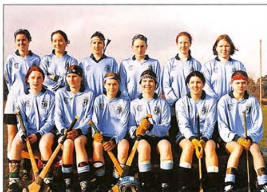
SENIOR FINALISTS - St. Mary's, Charleville