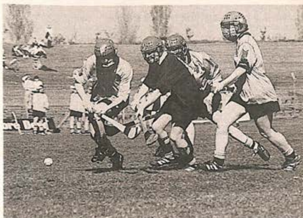
St. Marys forwards setting up another attack.