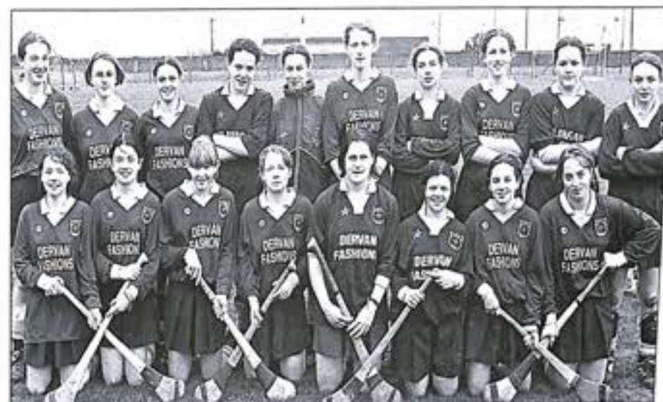
SENIOR FINALISTS - St. Brigid's Vocational School, Loughrea