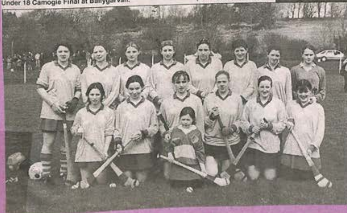
■ LEFT: Cloughduv, defeated finalists in the Cork County Under 18 1996 Camogie Final which was played at Ballygarvan recently.