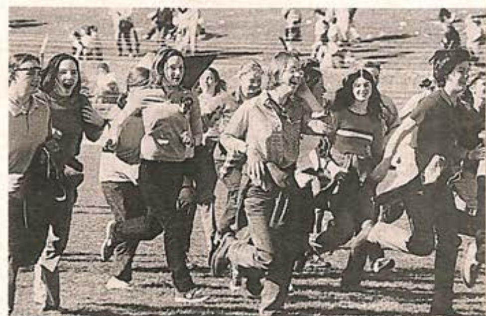
"WE ARE THE CHAMPIONS"

Excited St. Mary's supporters invade the pitch.