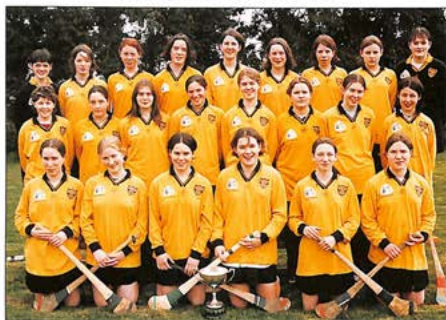
JUNIOR FINALISTS - Holy Rosary College, Mountbellew