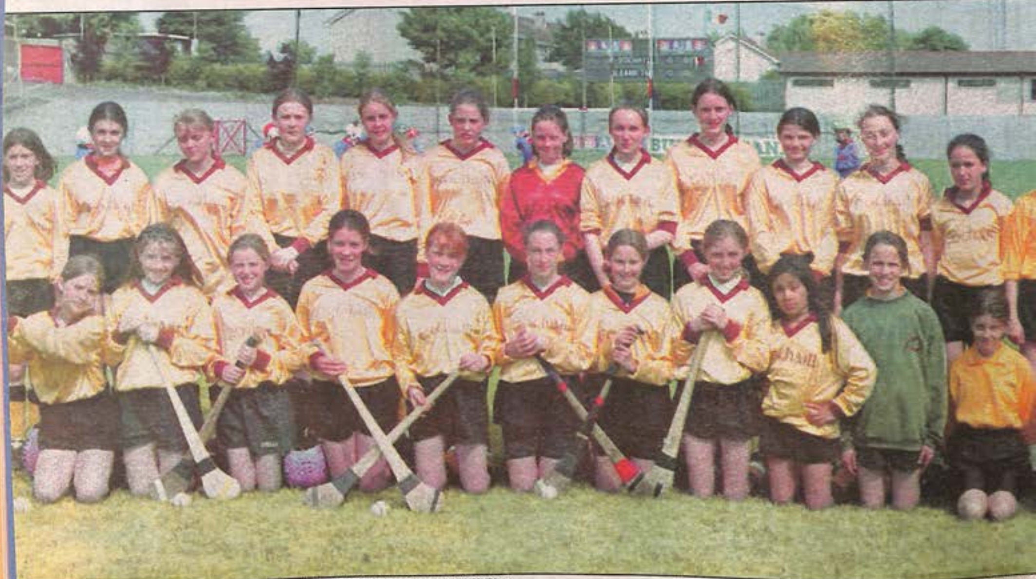
The Glounthaune team who played Youghal in the Roinn 5 final at Sciath na Scol at Pairc Ui Rinn.