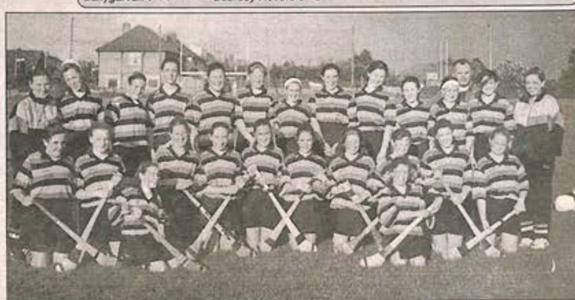
Glen Rovers Under 13 Camogie League team who played 'Barr's in Final. (-)