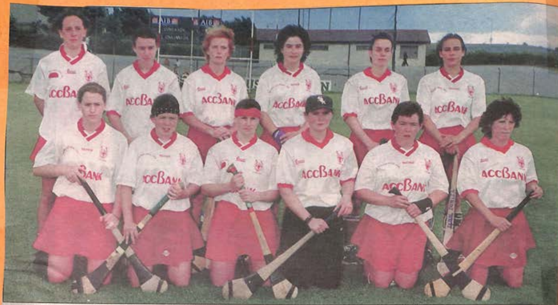
National Camogie League champions Cork who made it three titles in a row with a win over Kilkenny at Páirc Uí Rinn.