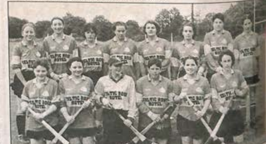
■ Carbery, who defeated Carrigdhoun in the Cork County Camogie Championship 1st round match played at Innishannon.