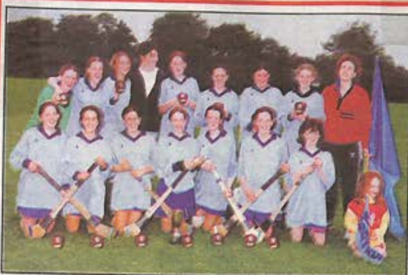
Barryroe who won the Cork County Feile na Gael camogie final.