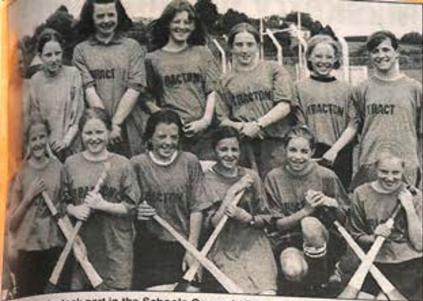
Tracton, who took part in the Schools Camogie Blitz in Carrigaline recently.