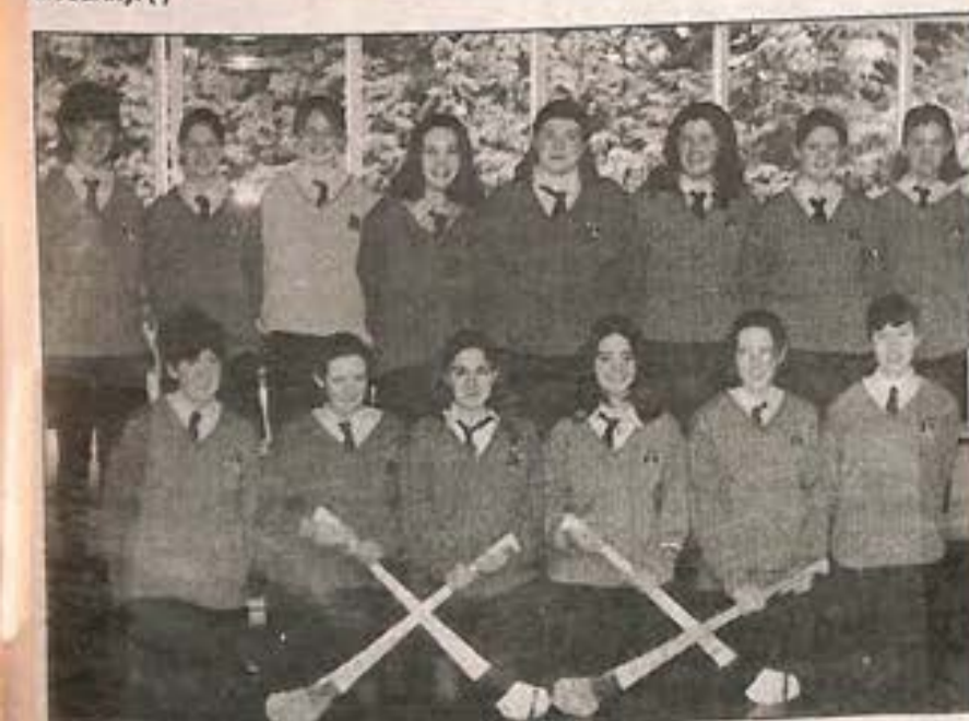
■ The Under 14 Ballincollig Community School Camogie Team which defeated Dunmanway 7-4 to 1-2. (-)