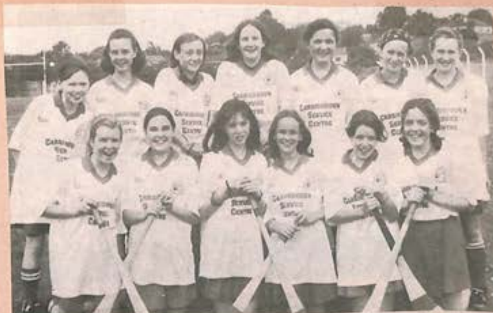
The Ballygarvan team, which participated in the recent South East Schools Camogie Blitz competition in Carrigaline.