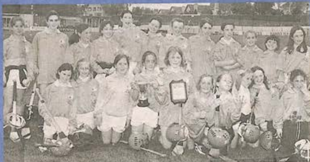
■ Carrigaline Gaelscoil team who won the Roinn 4 camogie final.