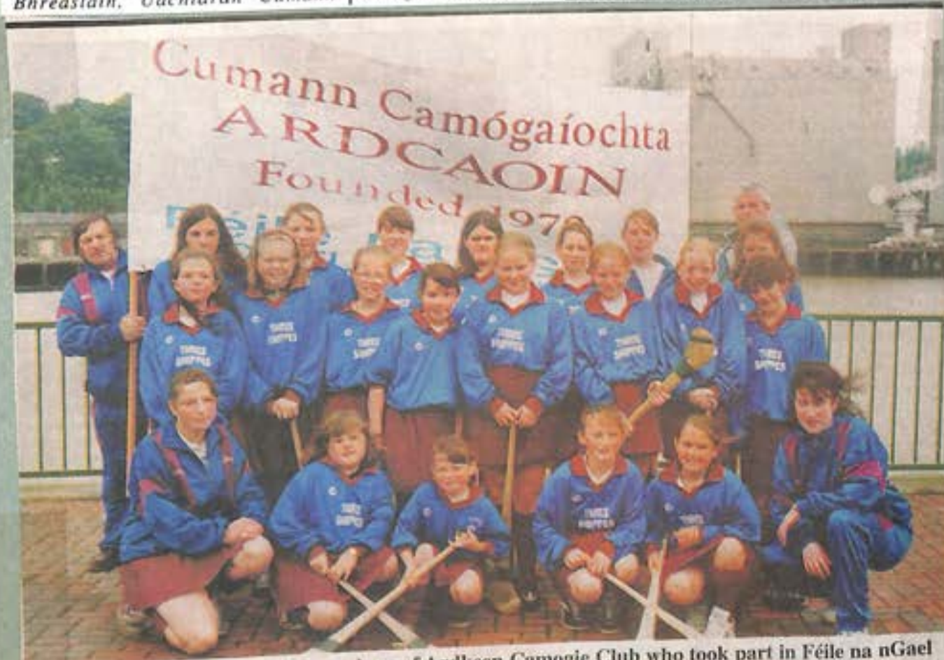
READY for the off are the members of Ardkeen Camogie Club who took part in Féile na nGael parade on Saturday.