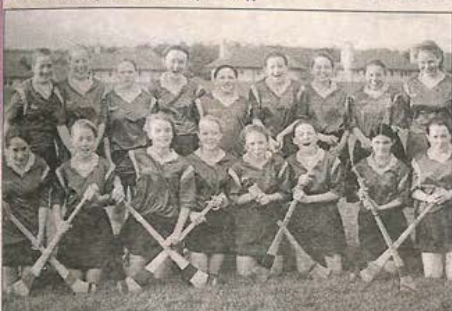
St Finbarr's Under 13 Camogie League team who played Glen in the Final. (-)