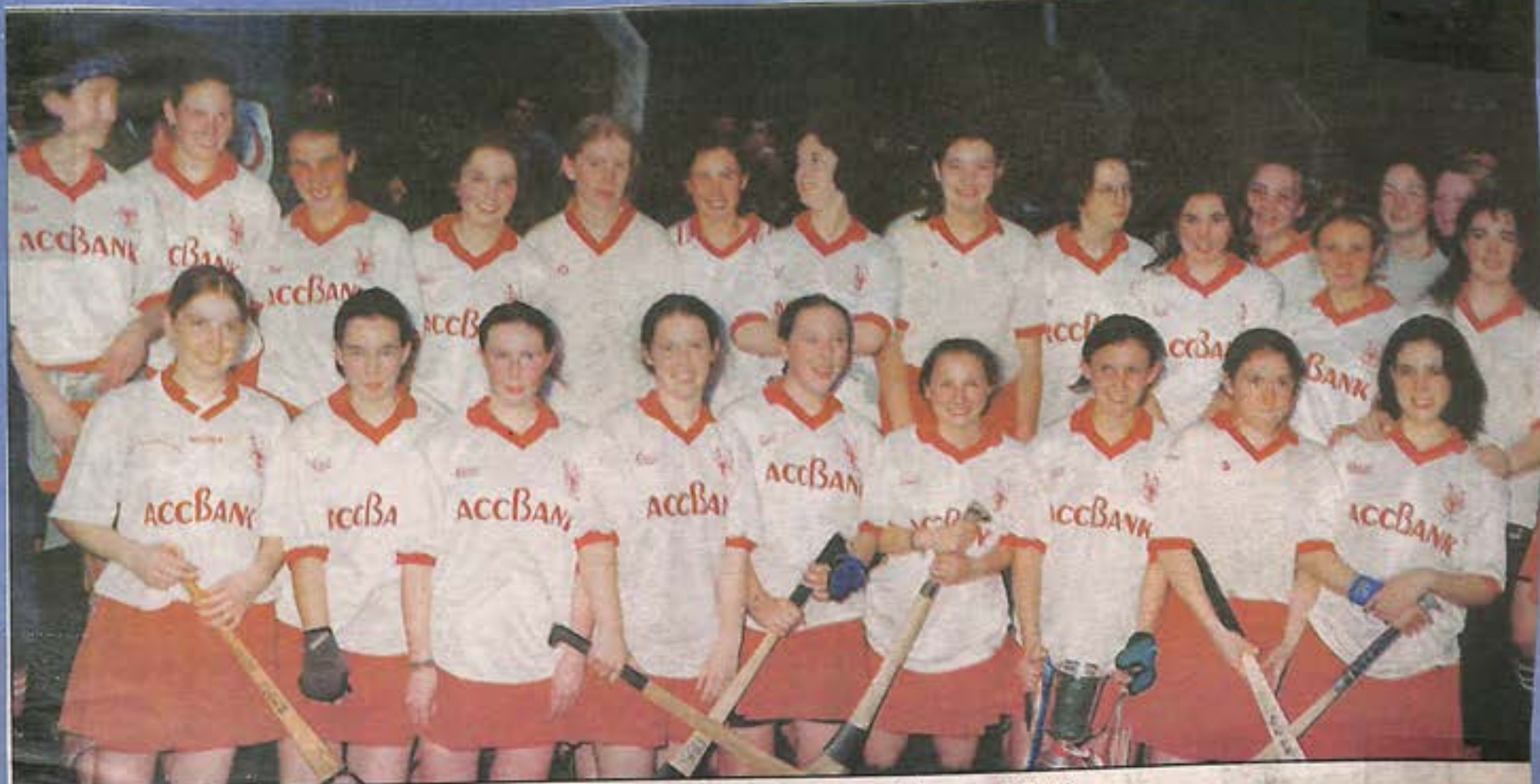
The Cork minor camogie team pictured with the Munster championship trophy following their win over Tipperary at Ovens.