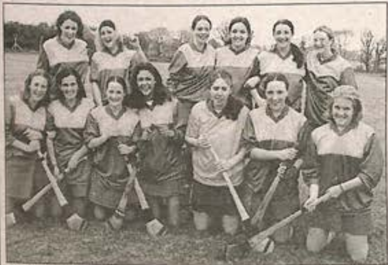
St Patrick's, Gardiner's Hill Camogie team celebrate their win in the Cork Colleges Senior Camogie Championship beating Coachford Community School.