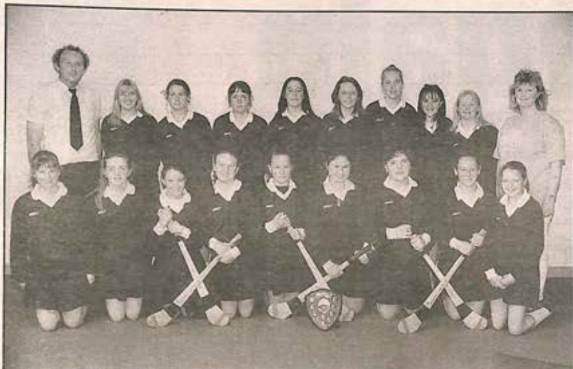
McSwiney Community College, Knocknaheeny, who defeated Kilmallock in the Munster Under 16 final.

It is no wonder, then, that 14 of the victorious Cork Minor panel come from the aforementioned top schools and, if more emphasis is put on camogie at secondary schools level, then the inter-county teams will reap the benefits of all the extra practice and dedication that sets these players apart as excellent competitors and diligent students.