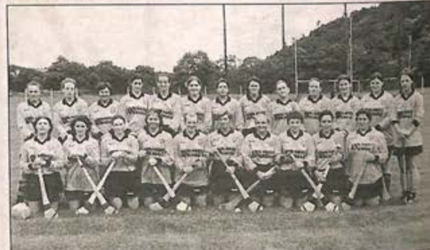
■ Carrigdhoun, who were defeated by Carbery in the first round of the Cork County Camogie Championship at Innishannon.