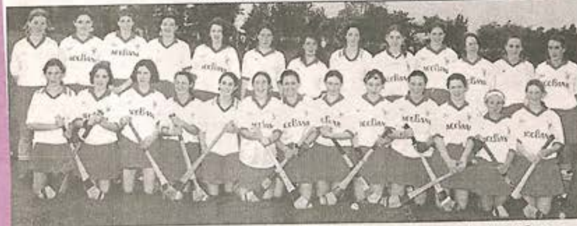
■ Cork Minor Camogie who won the Munster Championship Title Beating Tipperary in the final at Ovens.