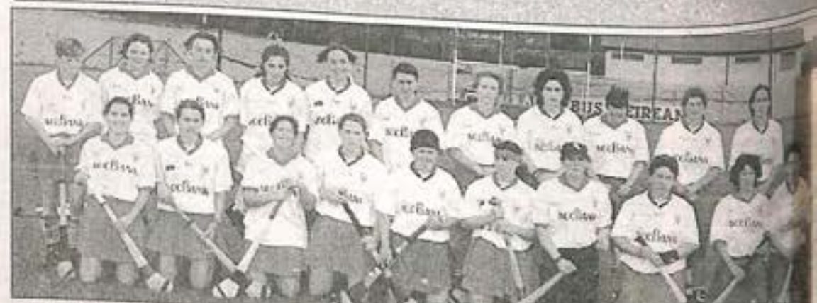
■ Cork Camogie Team which won the National League beating Kilkenny at Páirc Uí Rinn on Sunday.