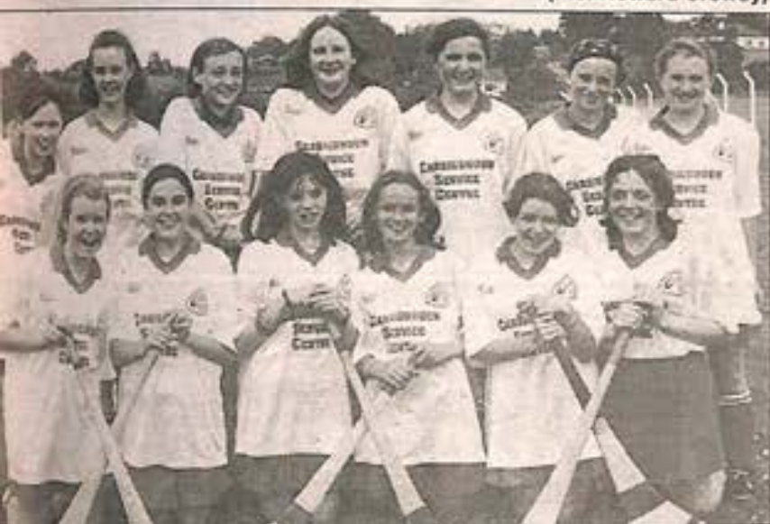
The Ballygarvan team, who participated in the recent South East Schools Camogie Blitz competition in Carrigaline recently.