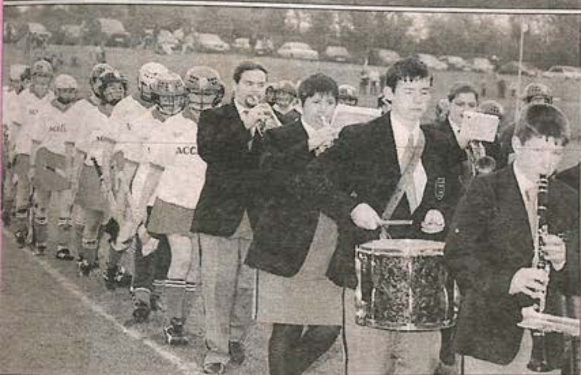
Blarney Brass and Reid Band play on the Cork and Tipperary teams prior to their Munster Minor Championships Camogie Final