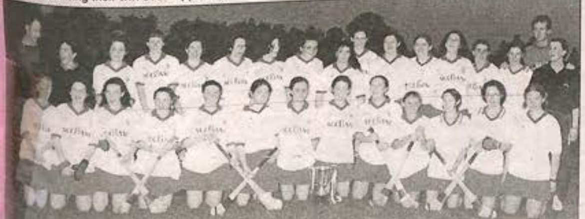
Cork Minor Camogie defeated Tipperary in the Munster Championship Final at Ovens