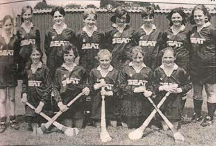
Belgooly, who took part in the Camogie Blitz in Carrigaline recently.