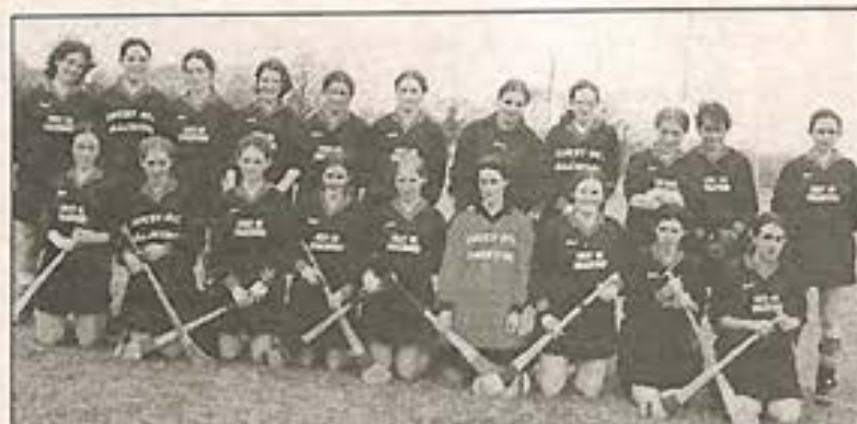
Coachford Community School who lost to St Patrick's in the Cork Colleges Senior Camogie Championships.