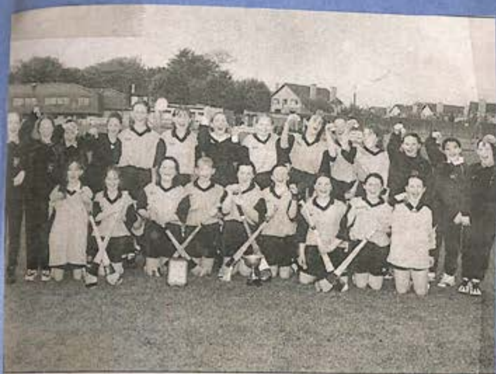
■ Maria Assumpta, Ballypheane who won the Roinn 2 Camogie at Sciath na Scol finals.