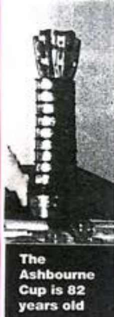
The Ashbourne Cup is 82 years old