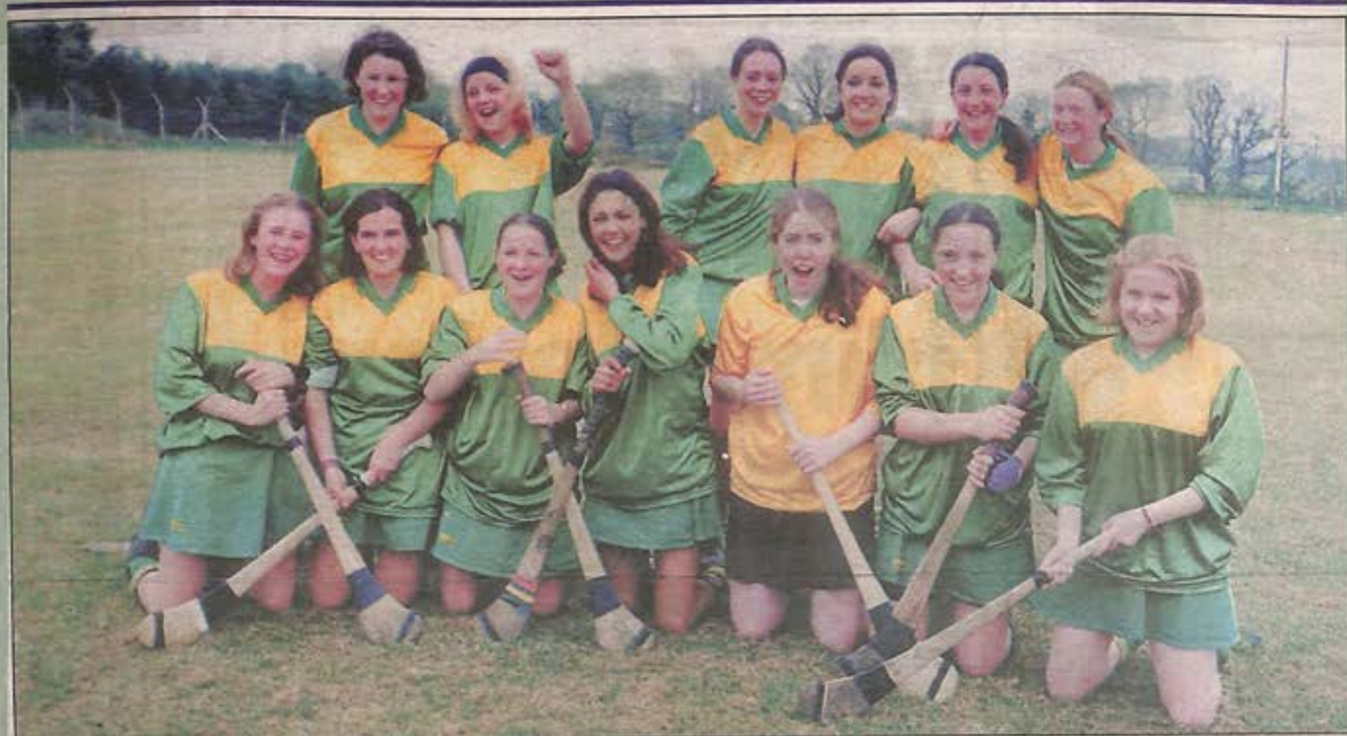
St Patrick's camogie team celebrate their win over Coachford Community College in the Cork Senior Colleges Camogie Championship.