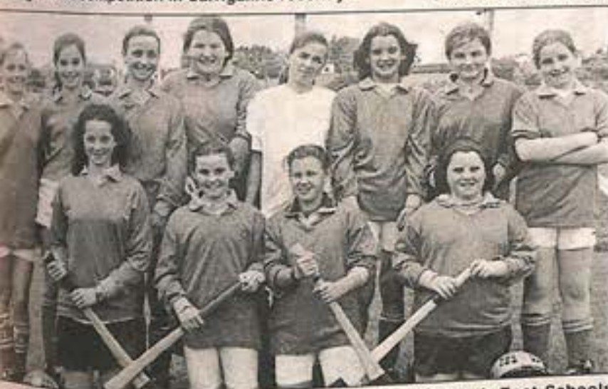
The Carrigaline Girls NS team, who took part in the South East Schools Camogie Blitz in Carrigaline.