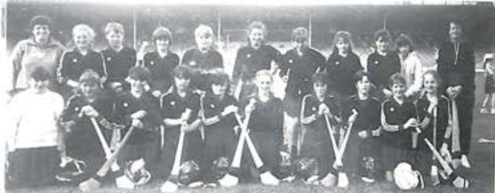
THURLES — UNDER-12 COUNTY CAMOGIE FINALISTS 1990

To conclude then, quite a successful year for the juveniles. Next year we would like to have even more girls playing. If so they would be more than welcome. And finally what about a B competition in Tipperary? Not every emerging club can aspire to county championships like the traditional strongholds. Come on County Board, think about it.