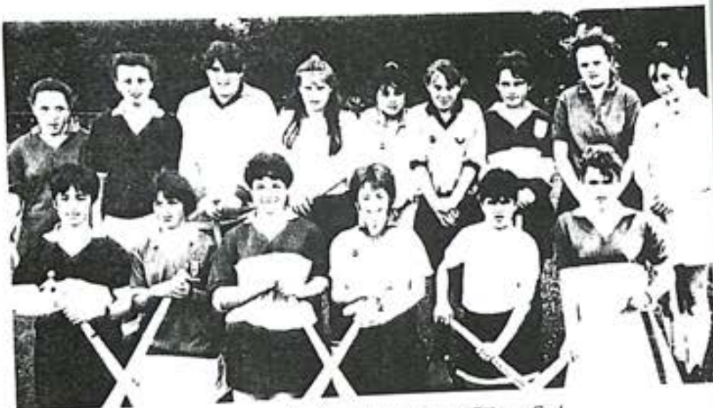
All who competed in the skills competition of Féile na nGael