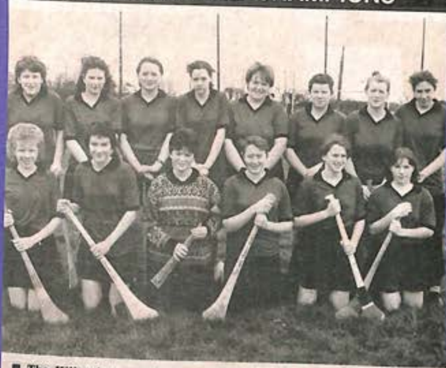
■ The Killeagh team who defeated Cloghdub in the Cork County U-18 camogie championship at Killeagh.