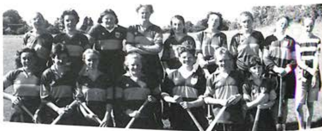
CASHEL UNDER-14 FÉILE NA nGAEL