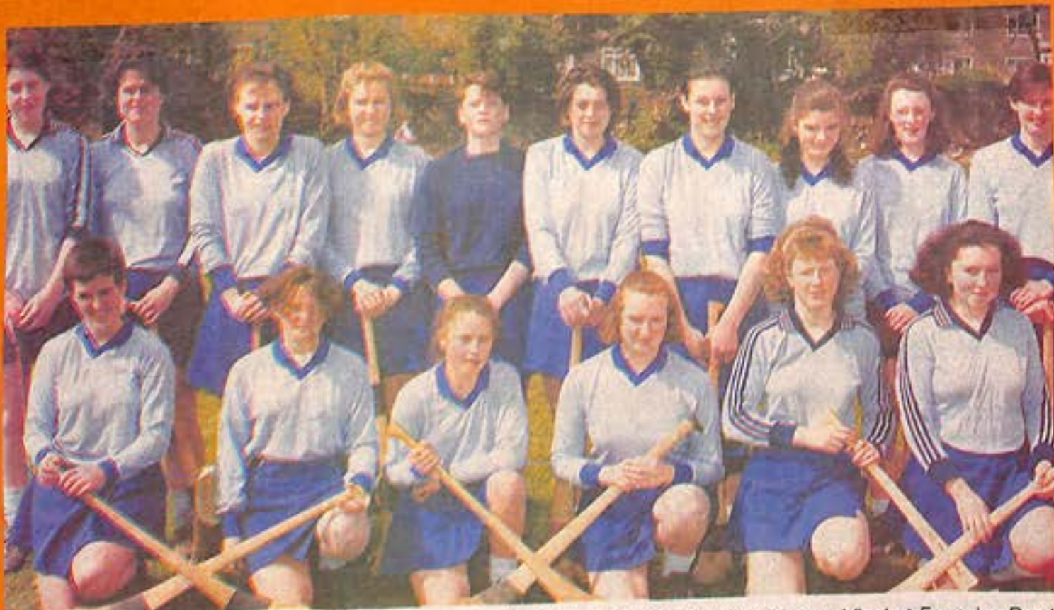
Barryroe camogie team, winners over Glen Rovers in the Cork under-18 championship semi-final at Farranlea Road. They now meet Bishopstown in the county final.

U-17B — Butlerstown (Waterford) 4-3; Cloughwell (Galway) 1-0; U-17A — Davitts (Galway) 4-5; Burgess (Tipperary), 1-1; Senior B — St. Monica's (Dublin), 1-7; St. Dominics (Roscommon) 1-1; Senior A — Mullagh (Galway), 6-5; Na Piar-saigh (Cork) 1-3.