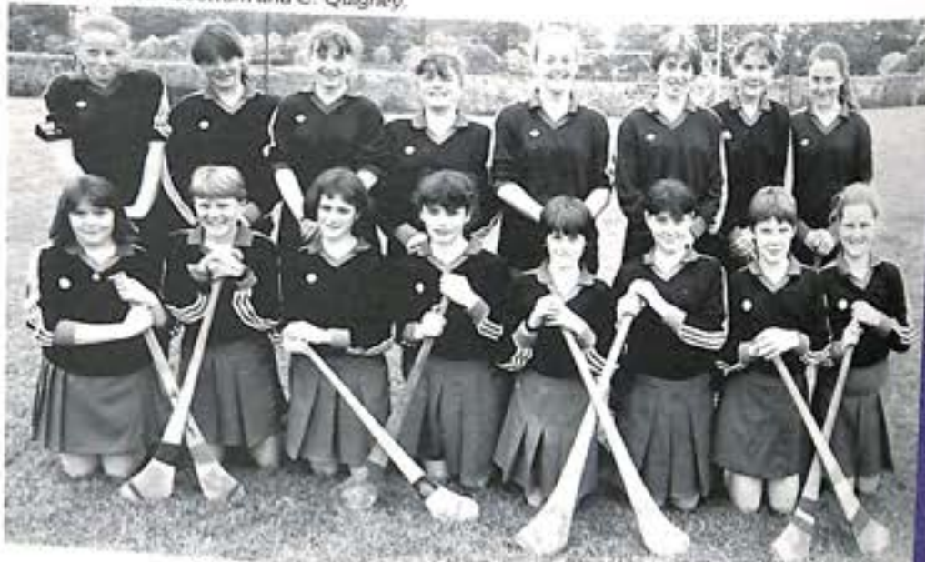
THURLES FÉILE NA nGAEL CAMOGIE PANEL — 1990