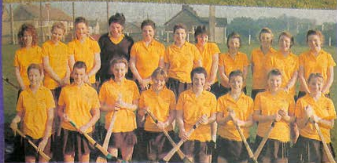
St. Mary's, Midleton (top), who defeated St. Patrick's, Cork, in the Munster Colleges' camogie final at Ballinlough, Cork.