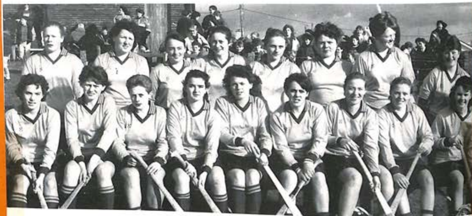
SCOIL MHUIRE CASHEL, MUNSTER CHAMPIONS & ALL-IRELAND FINALISTS 1989-1990

Early April was the date, O'Toole Park, Dublin the venue and the climatic conditions were ideal. Loughrea, playing some brilliant camogie were too strong for Scoil Mhuire and ran out winners by fourteen points. The Cashel girls failed to settle and though they tried very hard they could not match the Loughrea girls and