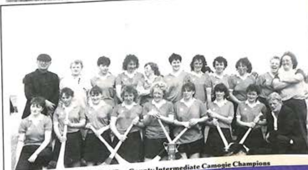
BORRISOKANE — County Intermediate Camogie Champions