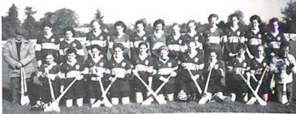
CASHEL UNDER-16 COUNTY CHAMPIONS 1990

In the flush of victory however one cannot forget the great sportsmanship of Toomevara. The game itself was hard