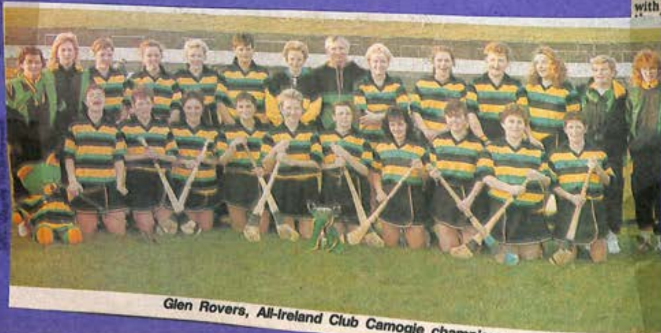
Glen Rovers, All-Ireland Club Camogie champions

For instance the Glen camogie officials were faced with raising £1,400 for a match in Derry which they did largely with the assistance of footballers.