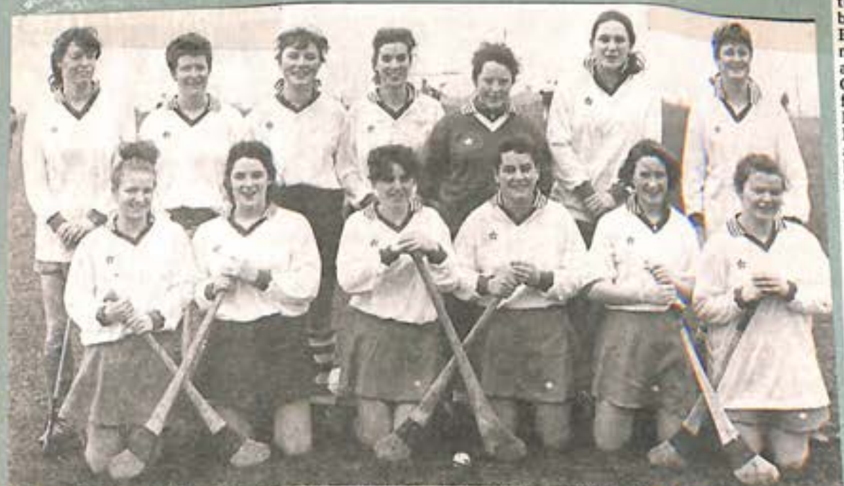
Thomond College of Education, Limerick, camogie team, who defeated St. Mary's College, Belfast in the All-Ireland Colleges camogie final for the Purcell Cup.