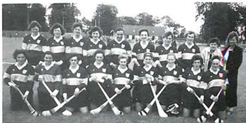
CASHEL — SENIOR COUNTY CHAMPIONS 1990