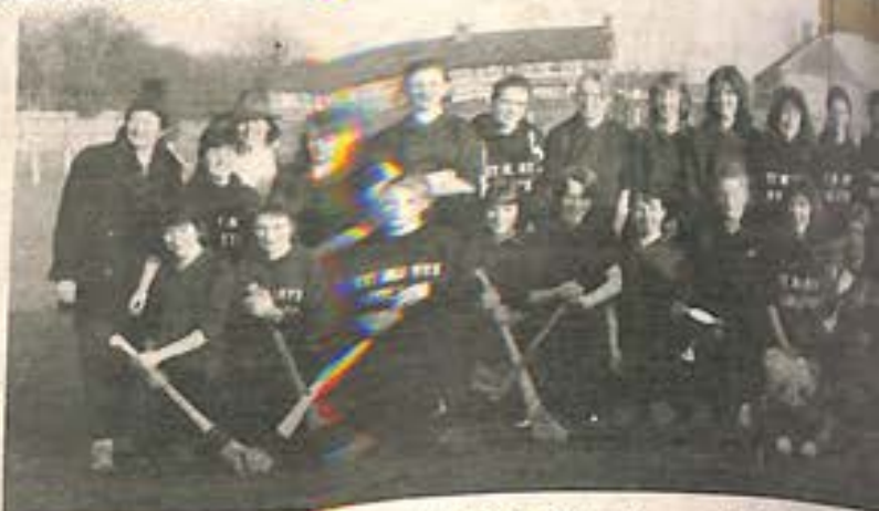
The victorious St. Mary's High School panel with coaches