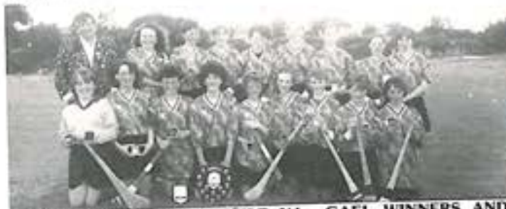
TOOMEVARA — U-14 FEILE NA nGAEL WINNERS AND COUNTY FINAL WINNERS 1990

teams, their mentors and the officers of the Board for their work and achievements in 1990.