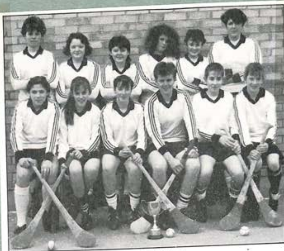
St. Cuan's, Castleblakeney