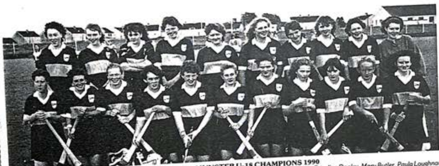
TIPPERARY — MUNSTER U-18 CHAMPIONS 1990

Camogie is a game of skill. Girls compete earnestly but in a very sporting manner. If the game is promoted properly then there is no limit to the enjoyment that will be got out of competing and taking part — winning will come. The future lies in the promotion of the game in our schools as well as in the clubs.