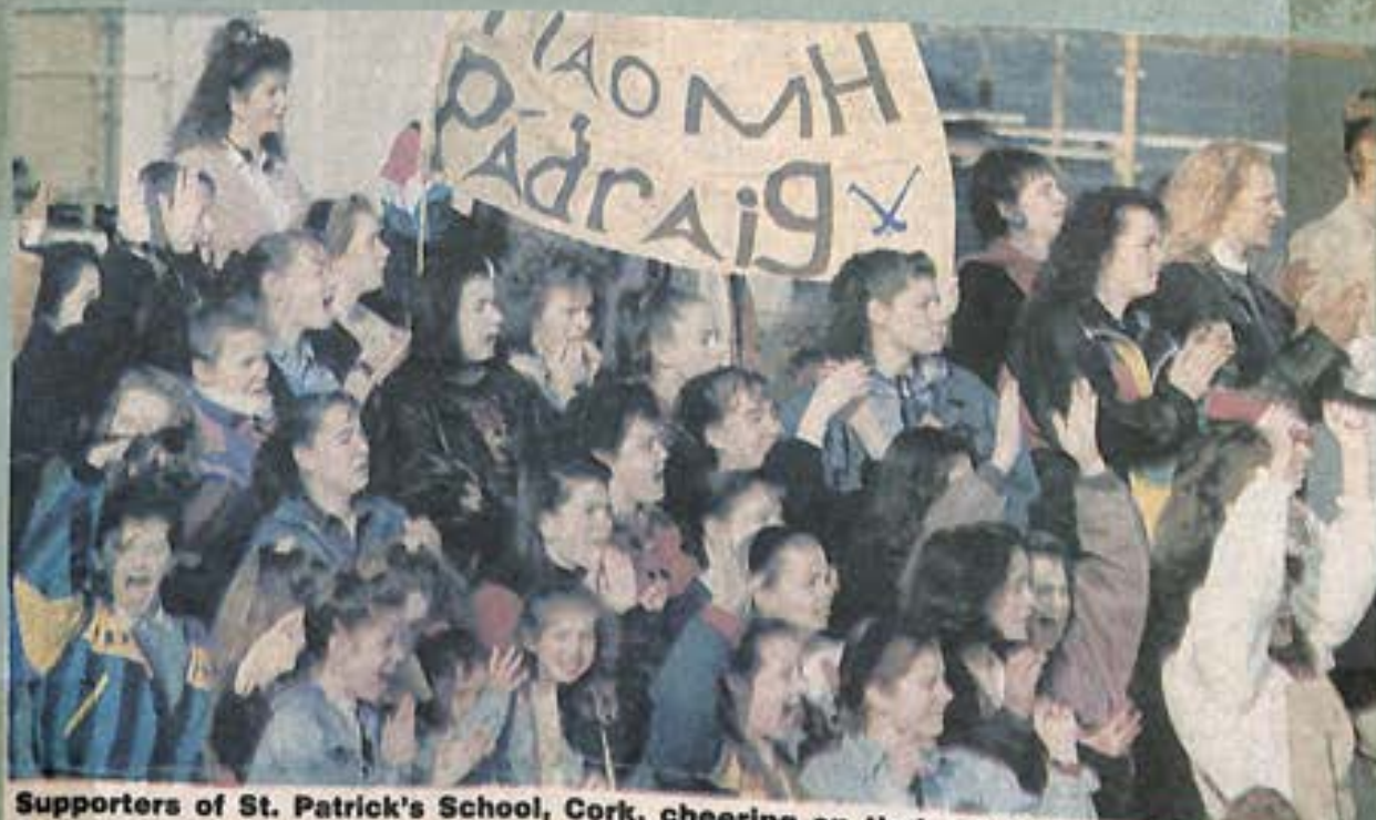
Supporters of St. Patrick's School, Cork, cheering on their side during the Munster Colleges camogie final at Ballinlough, Cork.