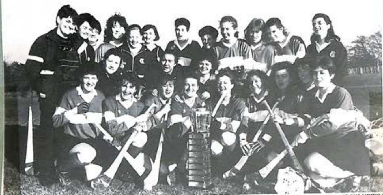
QUEEN'S UNIVERSITY CAMOGIE TEAM ... ASHBOURNE CUP WINNERS 1991

It as a cold sunny day as I watched the Queen's team coach leave Turloughmore for Galway and the Banquet when they would be presented with the Cup. They will remember Turloughmore when all concerned were delighted with the welcome and the facilities provided. It was all such a dignified and sporting occasion and to make it a real big weekend for the North, Coleraine defeated U.C.C. in the Shield Final by 5-10 to 5-8 after twoyes two periods of extra time. Congrats to all concerned.