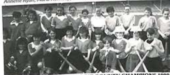
TOOMEVARA — U-12 CAMOGIE COUNTY CHAMPIONS 1990