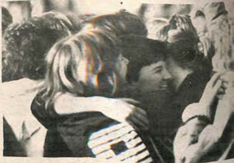
Scenes of jubilation after the final whistle