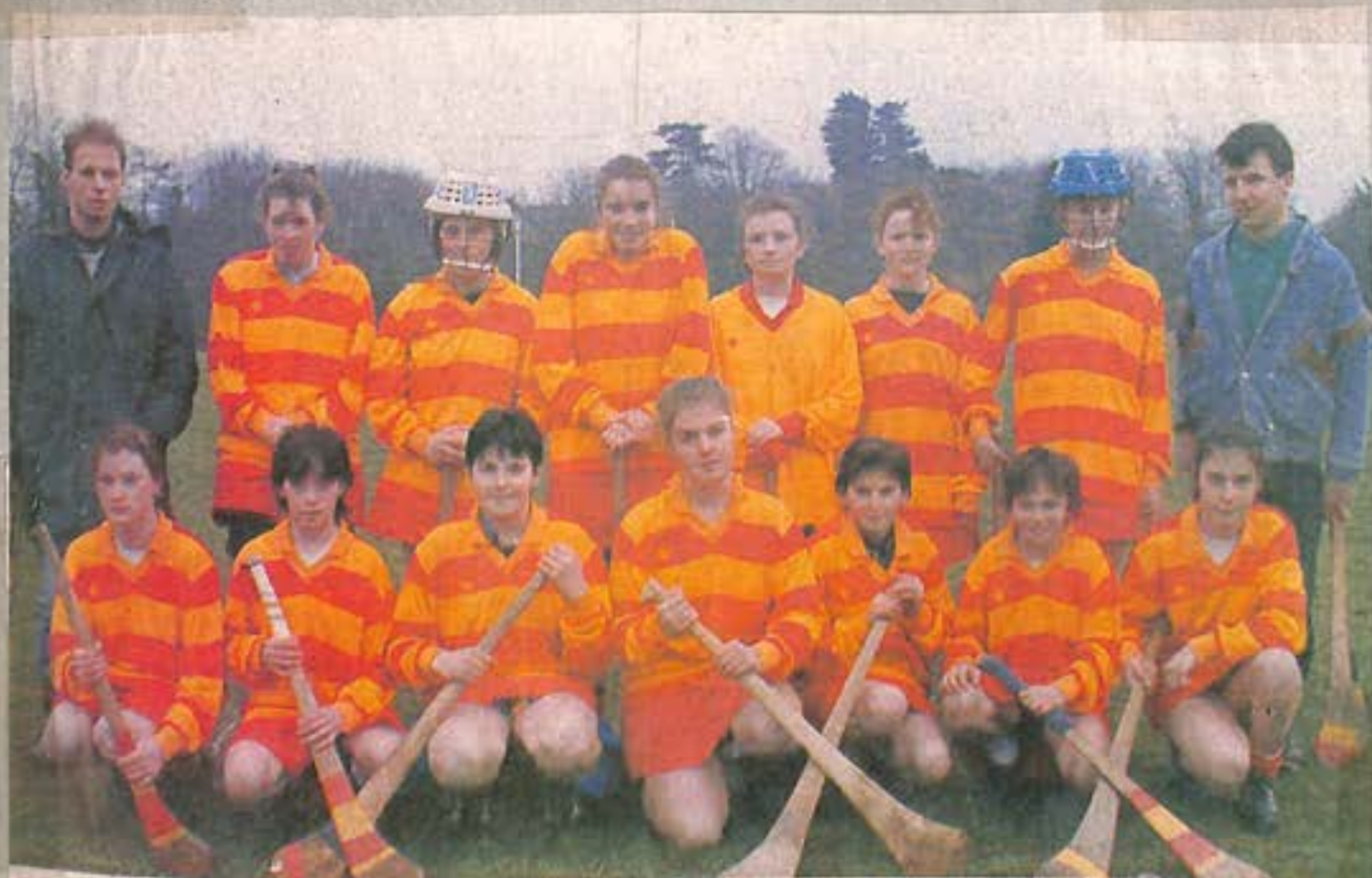
The Newcestown team which beat Kilbrittain in the Cork Co. U-16 camogie championship semi-final at Farranlea Road on Sunday.