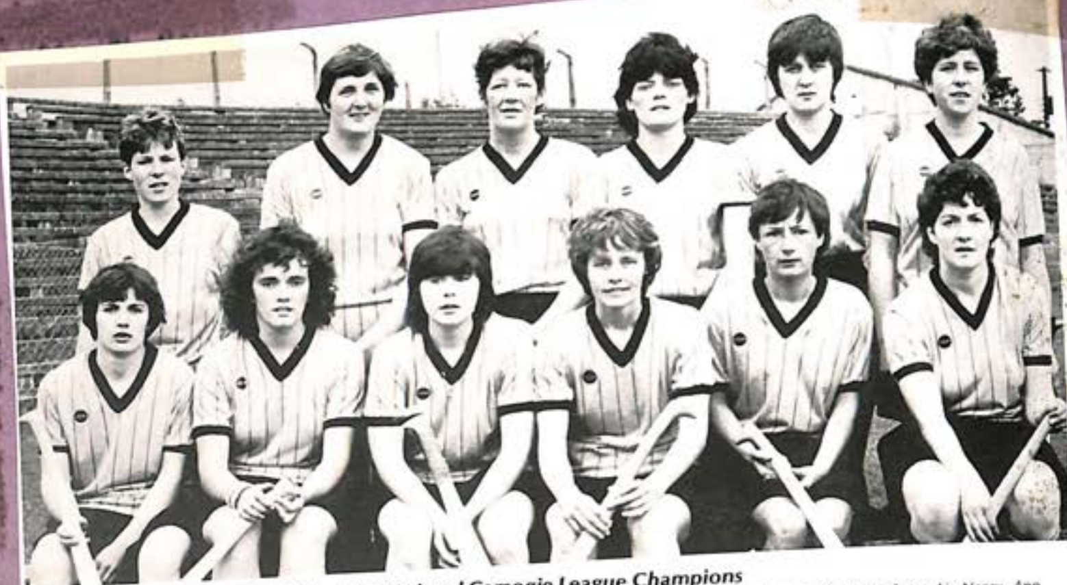
KILKENNY — the National Camogie League Champions