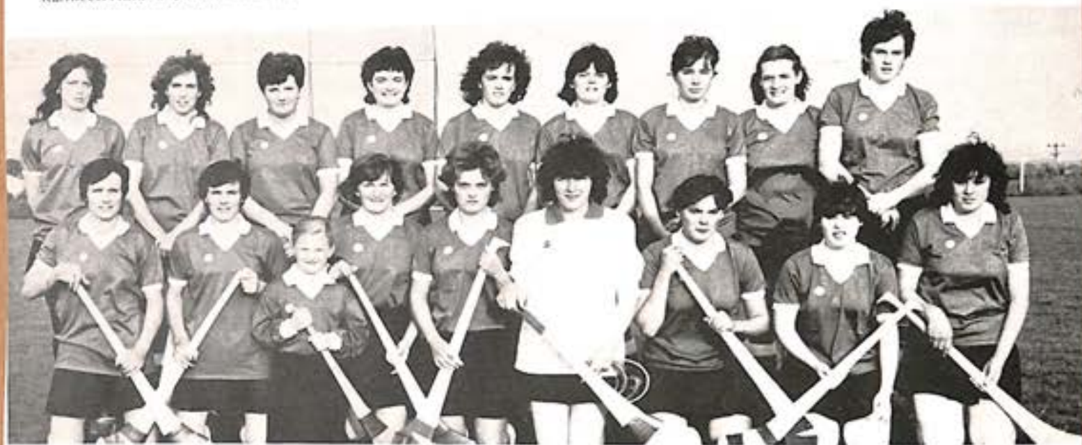
St. Brigid's (Ballycallan), the losing Kilkenny senior camogie finalists.