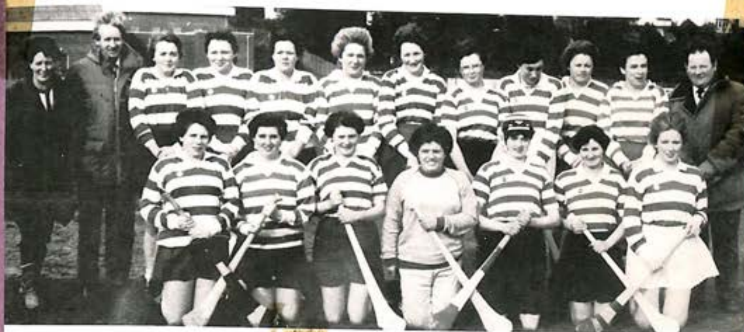
The Downpatrick Senior Camogie Team