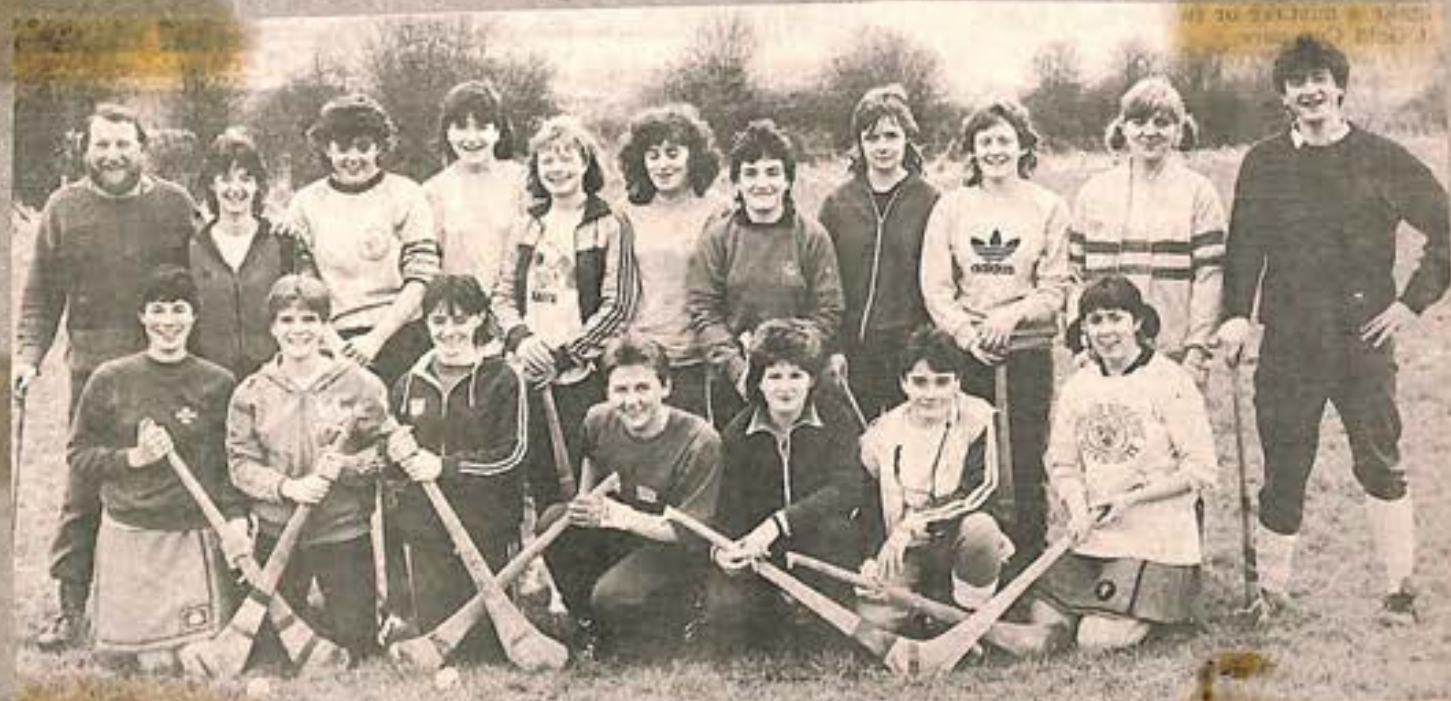
Members of the UCC camogie team during training for the Ashbourne Cup this weekend.