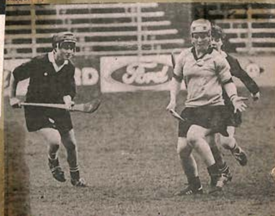
The captain of the St. Mary's Charleville team hand-passes to a teammate during the All-Ireland Junior Colleges Camogie final against F.C.J. Bunclody at Croke Park, Dublin.

Two late goals gave Bunclody a second chance in the senior final after St. Raphael's dominated most of the game.