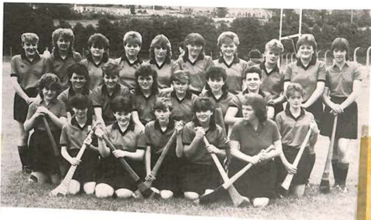
The Down Squad that faced Antrim in Ulster Minor Final