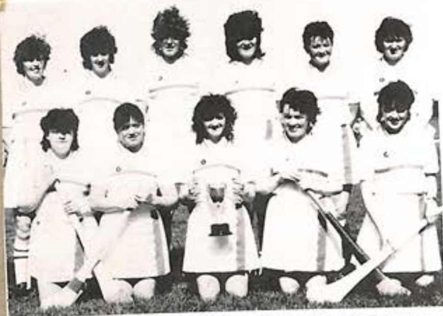
The Leitrim Senior Camogie Team which won the Feis Sevens