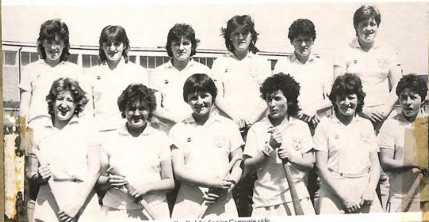
The Dublin Senior Camogie side.

Finally, I asked the very likeable and courteous midfielder with the scoring touch for her hopes for the future. "To win another All-Ireland medal. I have only one from four final outings. That is the No. 1 aim. Then, I would very much like to win another county championship medal with U.C.D."