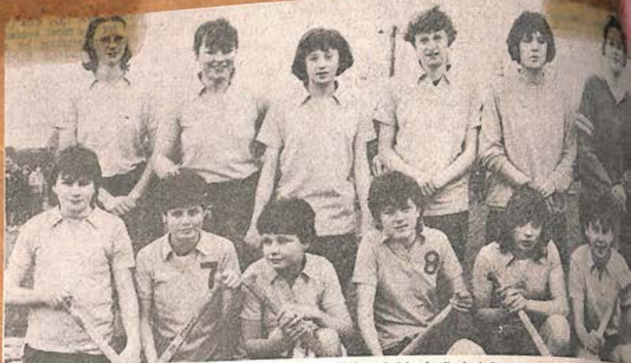
St. Mary's, Charleville, who defeated Colaiste Mhuire 2-4 to 0-6 in the final of the Munster Colleges' Junior Camogie championship at Charleville.

W.O.T. Tol- Belvedere v Loughrea v St. postponed.