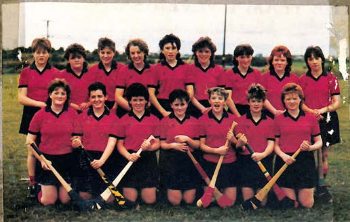
DOWN MINOR CAMOGIE TEAM WHICH DEFEATED ANTRIM IN THE ULSTER MINOR FINAL BEFORE BEING BEATEN BY GALWAY IN THE ALL-IRELAND SEMI-FINAL