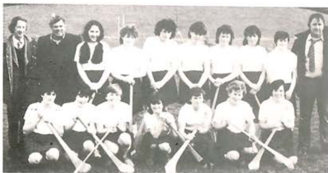
The "Bright" shining stars of Down Camogie.