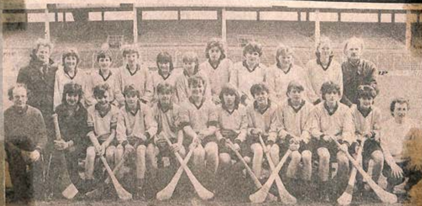
COLLEGES CHAMPIONS . . . St. Mary's, Charleville, the All-Ireland Colleges Junior Camogie title-holders.