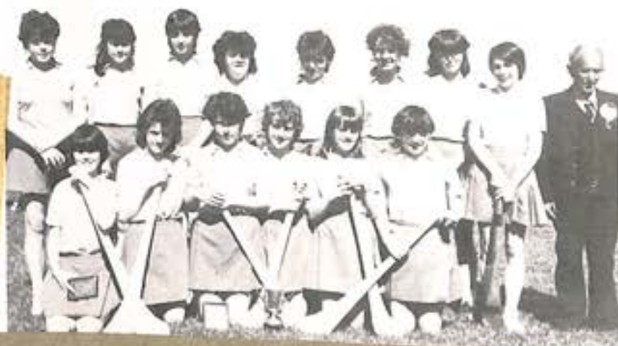
The Leitrim Minor Camogie Team which took part in the Final