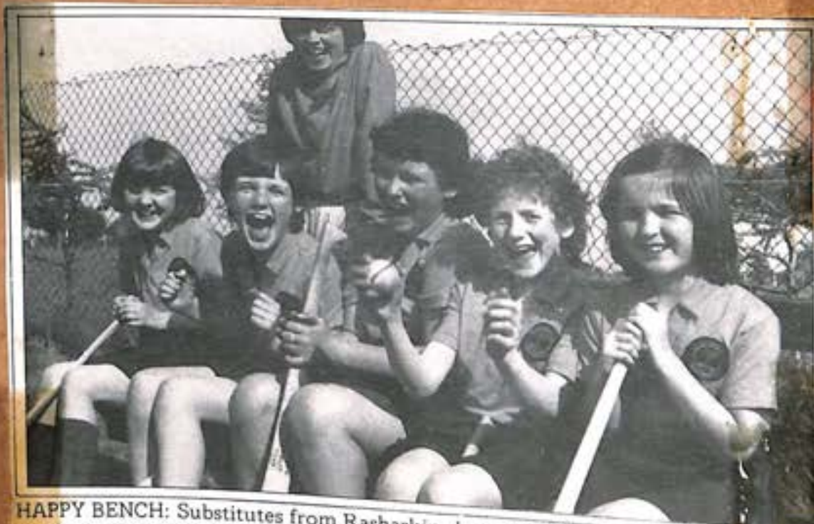
HAPPY BENCH: Substitutes from Rasharkin shout encouragement during the Feile final in Wexford.

Pride of Cork this season were, of course, the minors. Aiming for a three-in-a-row with five survivors in their ranks, they only escaped by a whisker after a truly memorable match with Clare in the opening round. Poor defensive play by Tipperary helped Cork to an easy win in the semi-final. Although Cork lead all the way in the Munster final with Limerick, they were never able to draw clear and kept their supporters on tender hooks to the end.