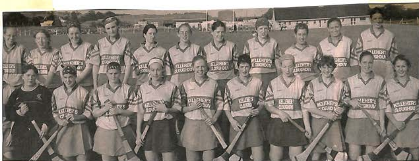
Defending champions, Cloughduv, who defeated, Barryroe, in the recent quarter final of the county senior camogie championship, played in Ballineen.