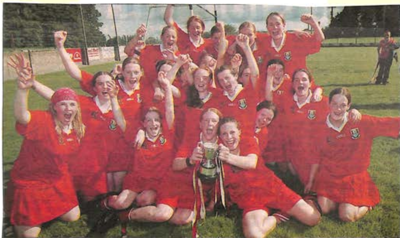
The Cork team celebrate after winning the All-Ireland Minor 'A' title for the 12th time at Leahy Park, Cashel. Cork won the game 1-11 to 1-5.

All-Ireland double: Congrats to the Cork minor camogie team who captured the All-Ireland crown at Cachel on Sunday. For seven players, it was the completion of a great double as they also figured on the team that defeat Galway in the All-Ireland under 16 football final the previous week.