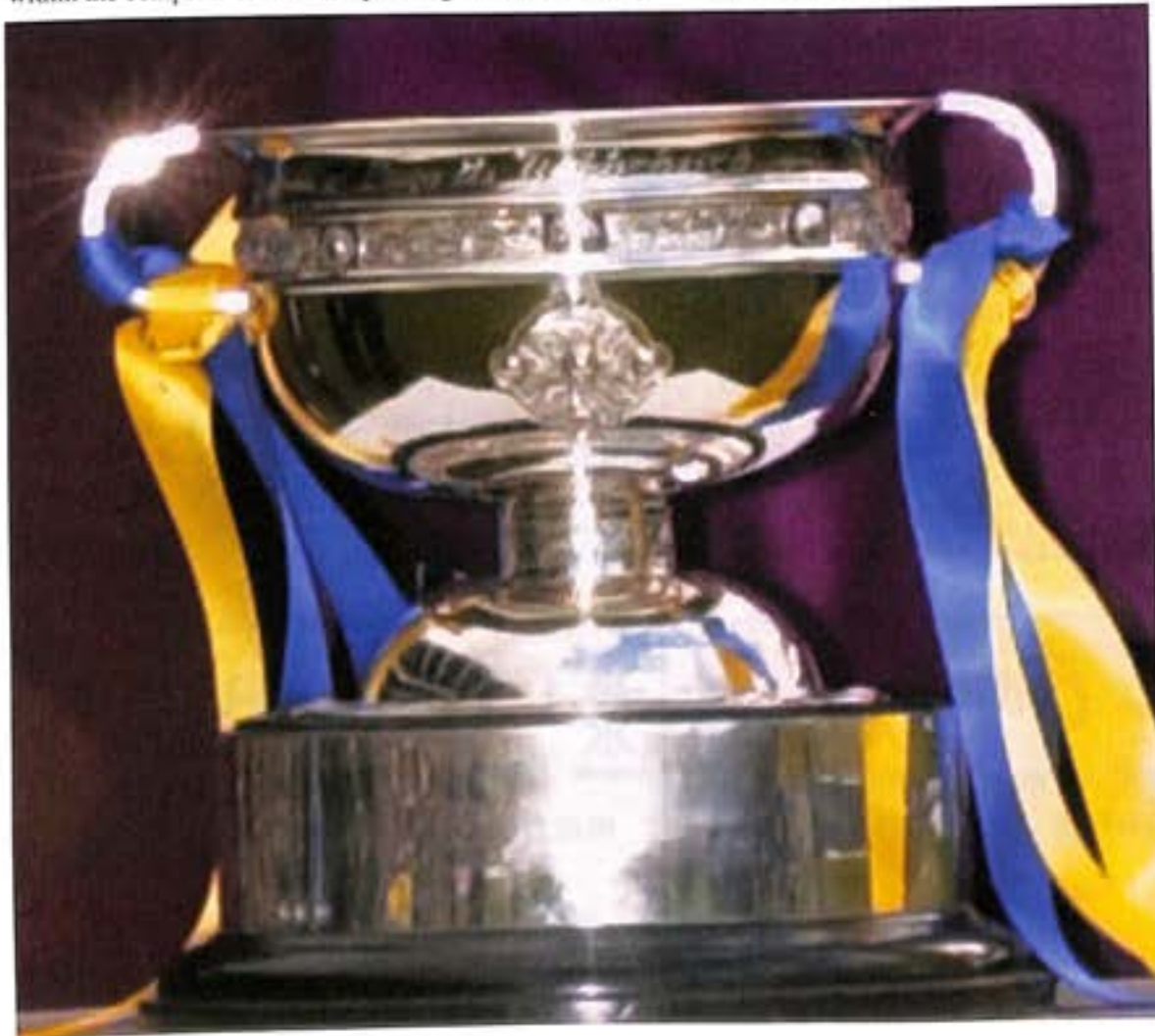
The O'Duffy Cup

With the centenary of Cumann Camogaiochta na nGael fastly approaching in 2004 this is an ideal opportunity for people to see what may well be hidden in various attics around the country. Readers may get in touch with me (Maire Uí Scolai) at 01 2849805 or I may be e-mailed at: maier@gofree.indigo.ie in regards to items for either the centenary or the Museum itself.