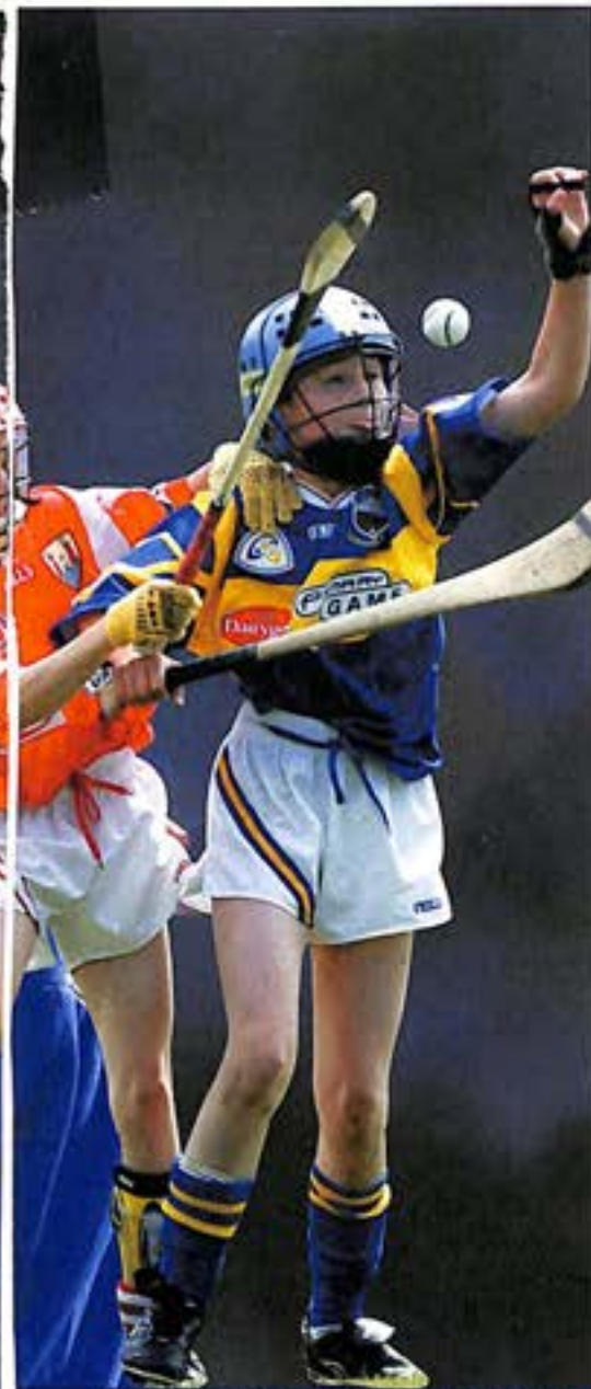
SCHOOLS LEVEL: At Féile na nGael level there is nothing between the provinces but then over a couple of years a gap is appearing