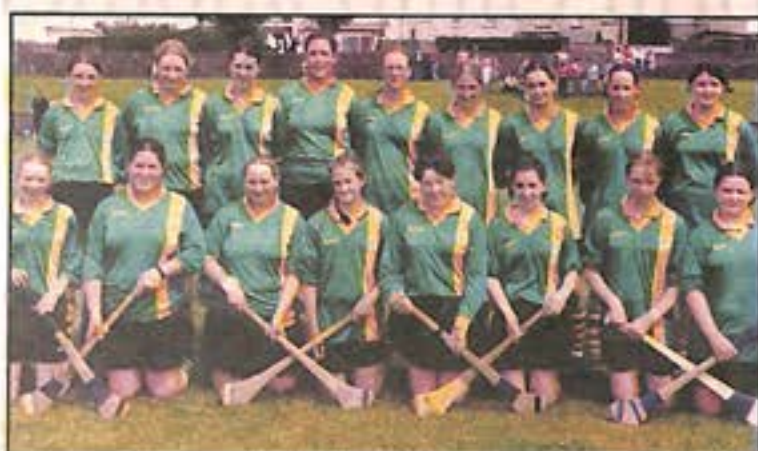
Dungourney under 16 team, winners of the county 12-side championship.