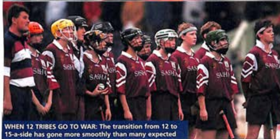
WHEN 12 TRIBES GO TO WAR: The transition from 12 to 15-a-side has gone more smoothly than many expected

"But it's on the way: we don't want to lose our autonomy of course, but we do want to work closely with the GAA. We won't be swallowed up. I don't think that people should be afraid of that. We're 100 years old after all; we didn't just come down in the last breeze."