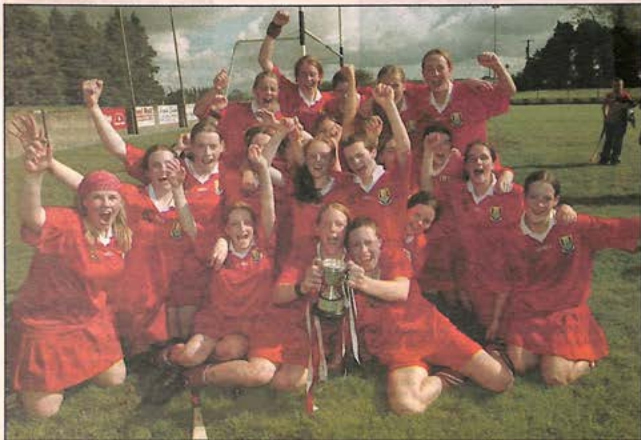
WINNERS: The Cork Camogie team celebrate winning the All-Ireland Minor A title after beating Galway in the final.

CORK are today celebrating a glorious sporting double.