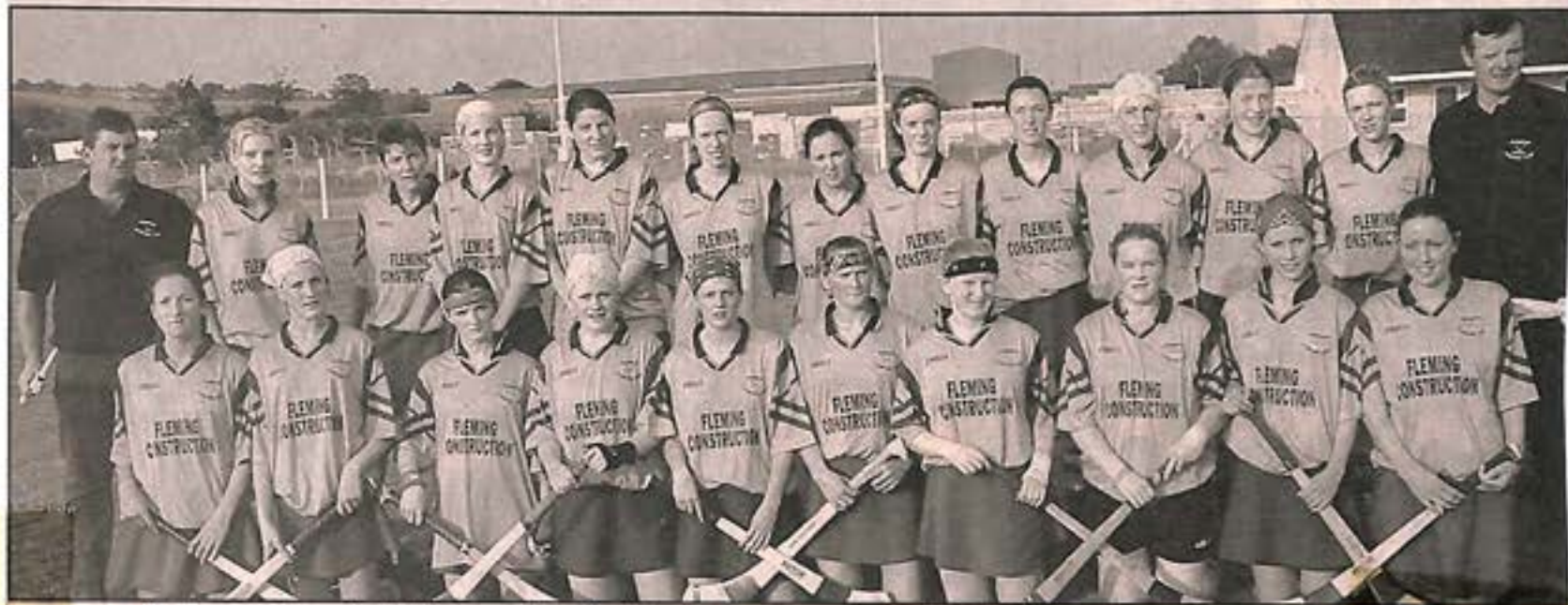
The Barryroe team that lost narrowly to Cloughduv in the recent quarter final of the county camogie senior championship.