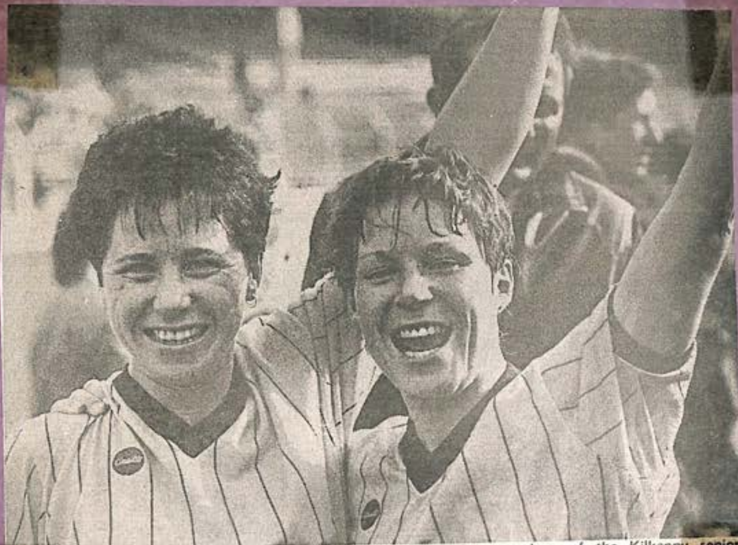
TRIUMPHANT TWINS.. Anne (left) and Angela Downey, members of the Kilkenny senior camogie team, celebrate their victory over Dublin in the All-Ireland final.