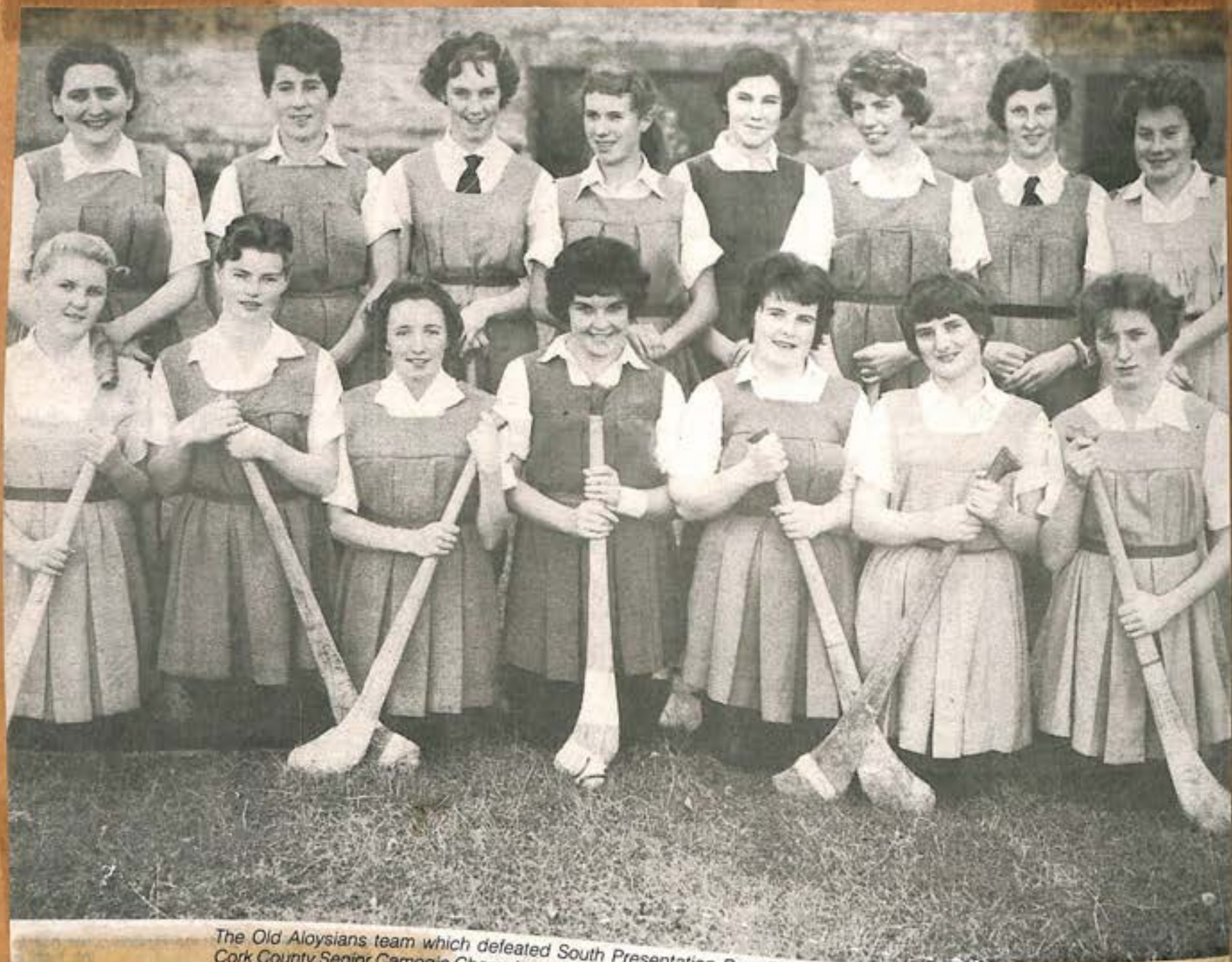
The Old Aloysians team which defeated South Presentation Past Pupils in the final of the Cork County Senior Camogie Championship at the Mardyke on October 16, 1960. (469L)