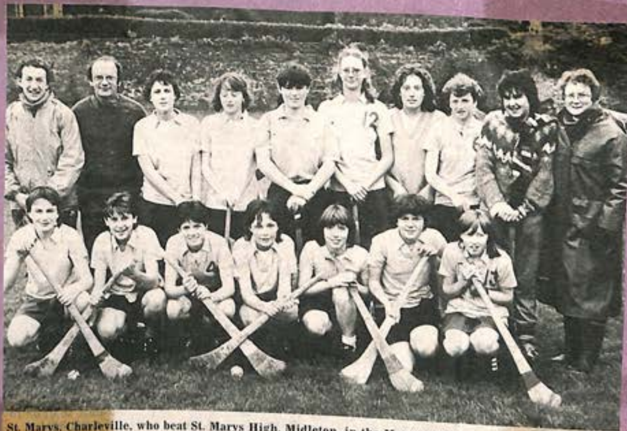
St. Marys, Charleville, who beat St. Marys High, Midleton, in the Munster Colleges under-15½ camogie semi-final at the Midleton CBS sports ground.