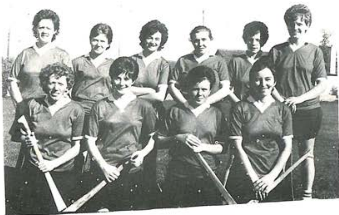
AN IMOKILLY SELECTION WHICH REACHED THE SEMI-FINAL OF THE ALL-IRELAND SEVENS AT Kilmacud