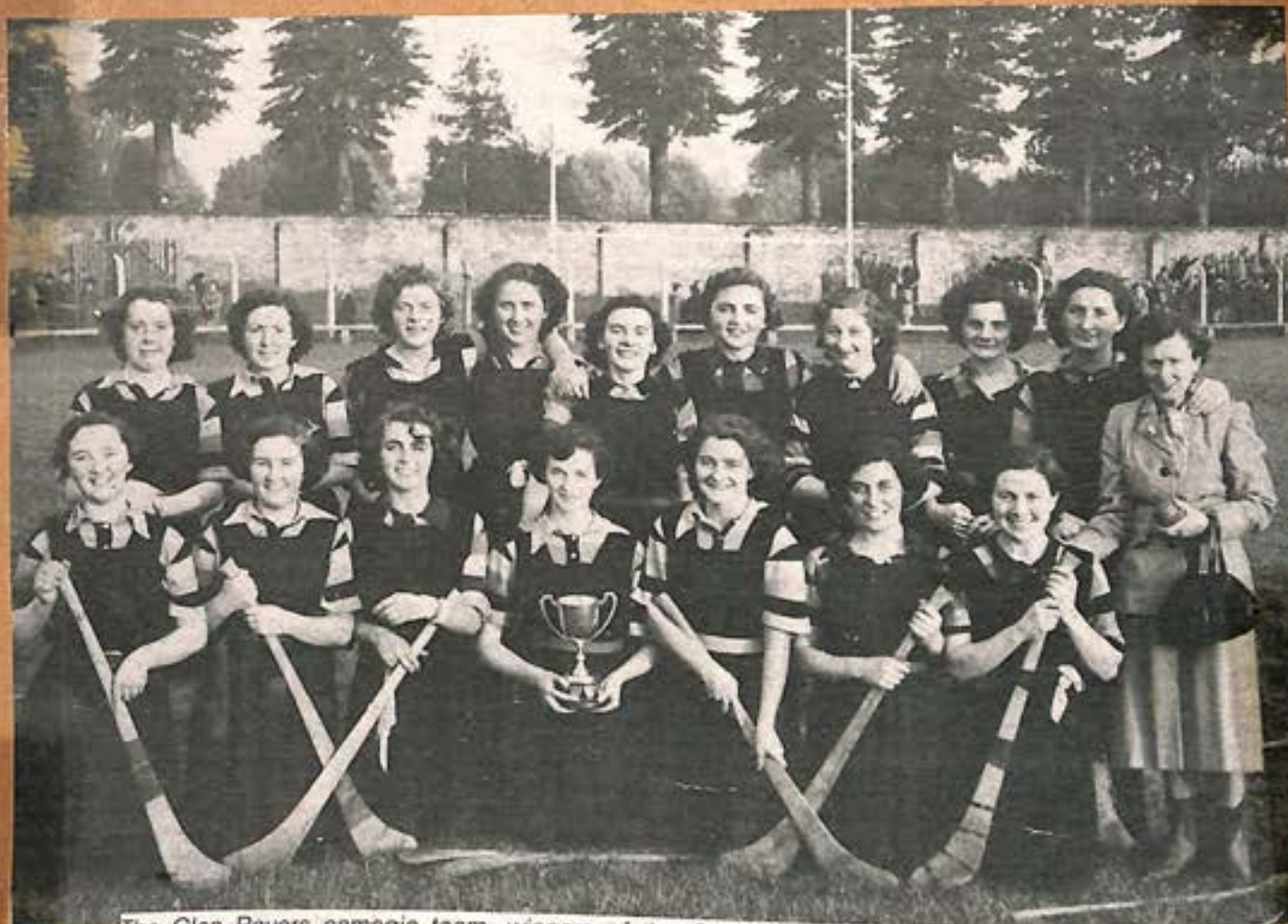
The Glen Rovers camogie team, winners of the Cork County Championship in 1951.