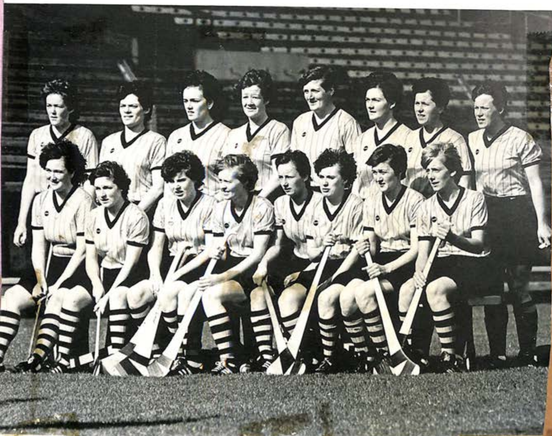
All-Ireland Camogie Champions who defeated Dublin in the final.

But, they must have suffered a resounding