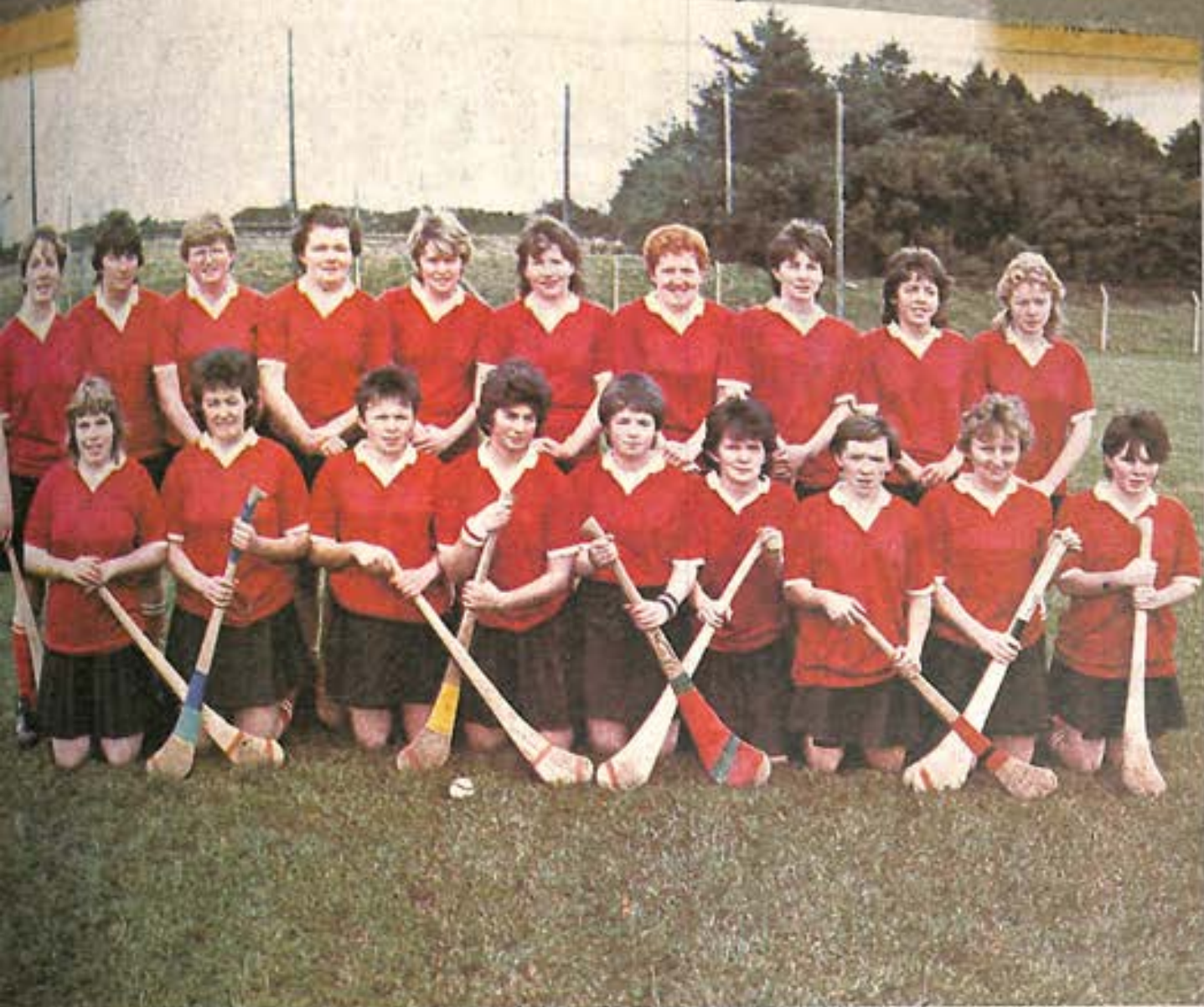
The Fr. O'Neill's team, who defeated Killeagh to win the Cork Junior Camogie Championship. The final score was Fr. O'Neill's 2-6, Killeagh 0-10.