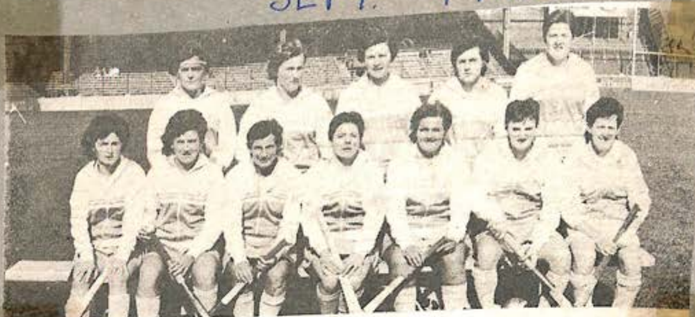
DUBLIN . . . beaten by Kilkenny in the All-Ireland Camogie final.