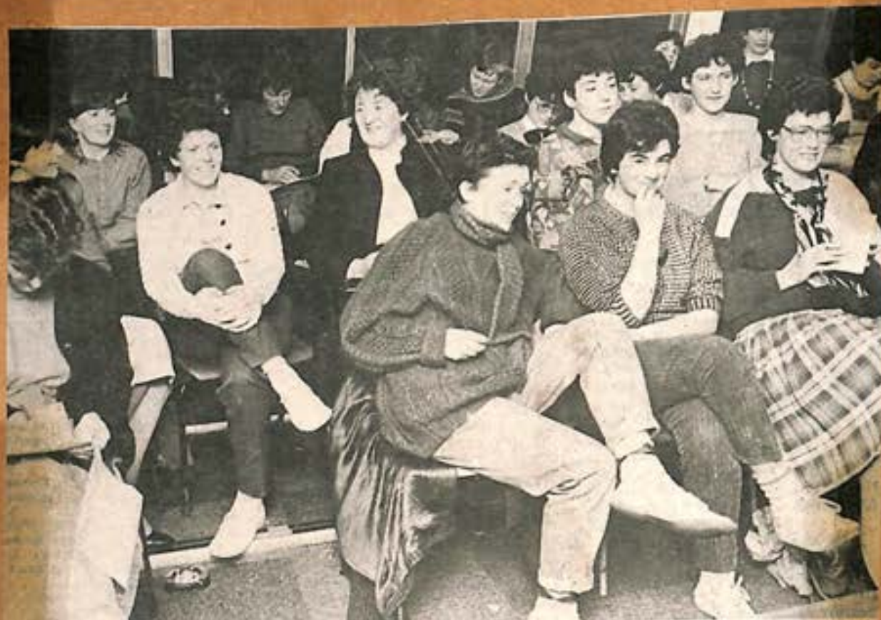
Delegates in happy mood at the Cork County Board Camogie Convention at Paric Ui Chaoimh.