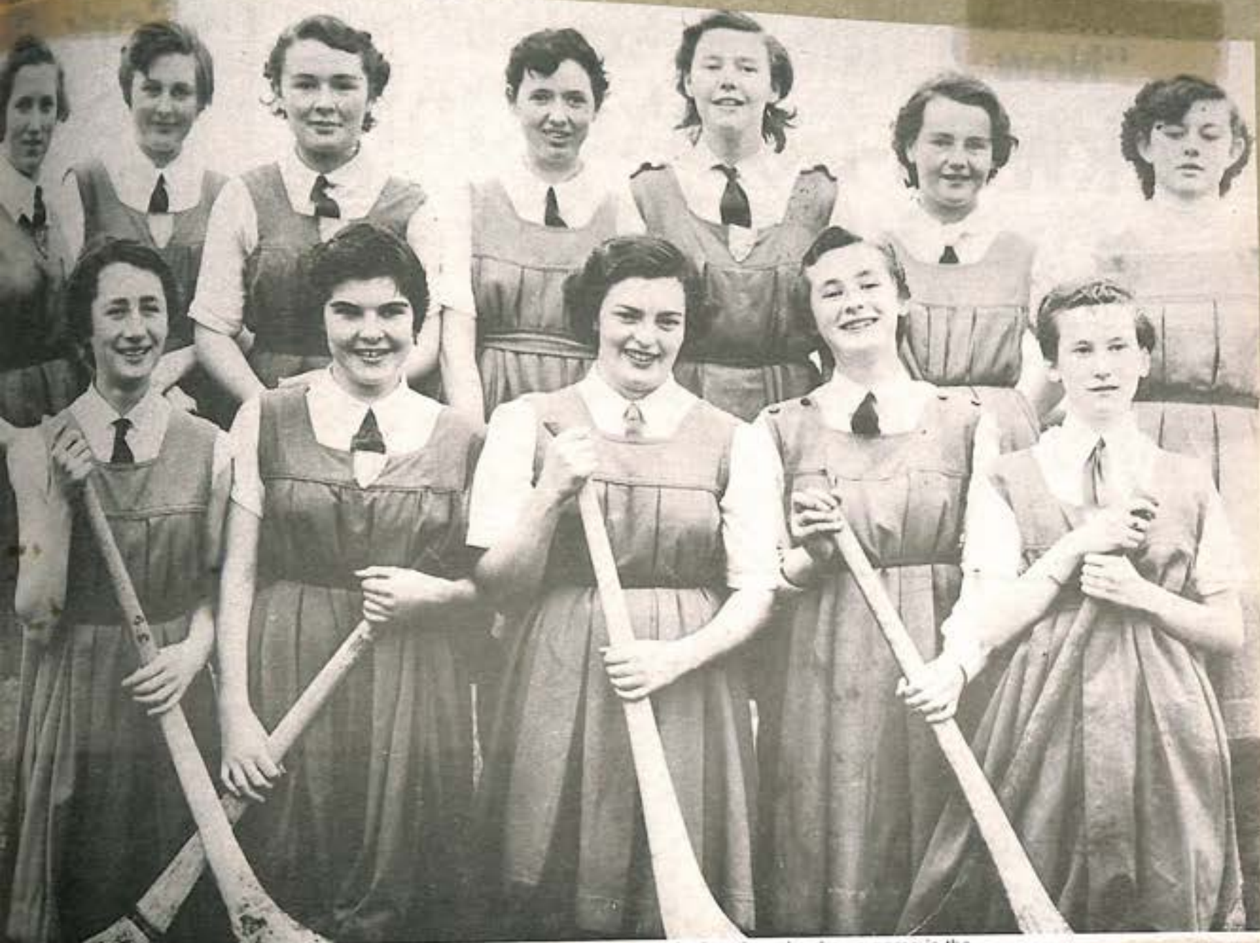
St. Aloysius (top) and South Presentation Convent (bottom) who played a drawn game in the Cork Schools Championship final at Church Road on October 16, 1954 (934 G).