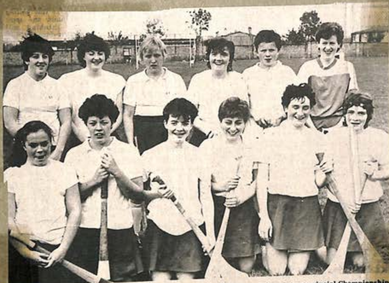
The Munster junior camogie team which defeated Ulster in the Gael Linn Interprovincial Championship at St. Finbarr's Club, Toghher, Cork.