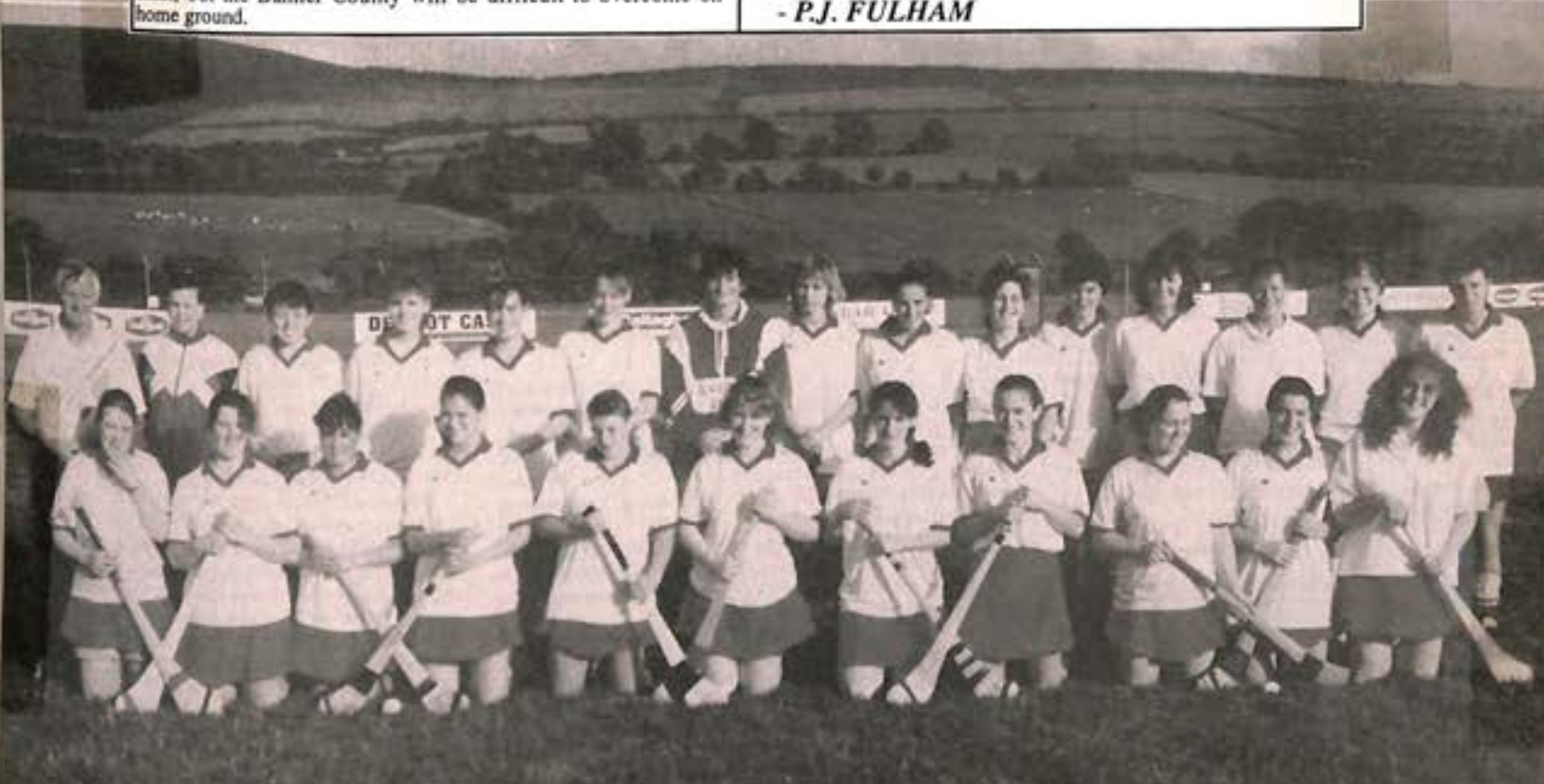
The Cork team which defeated Clare in the Munster Junior Camogie final in Mallow on Thursday night.