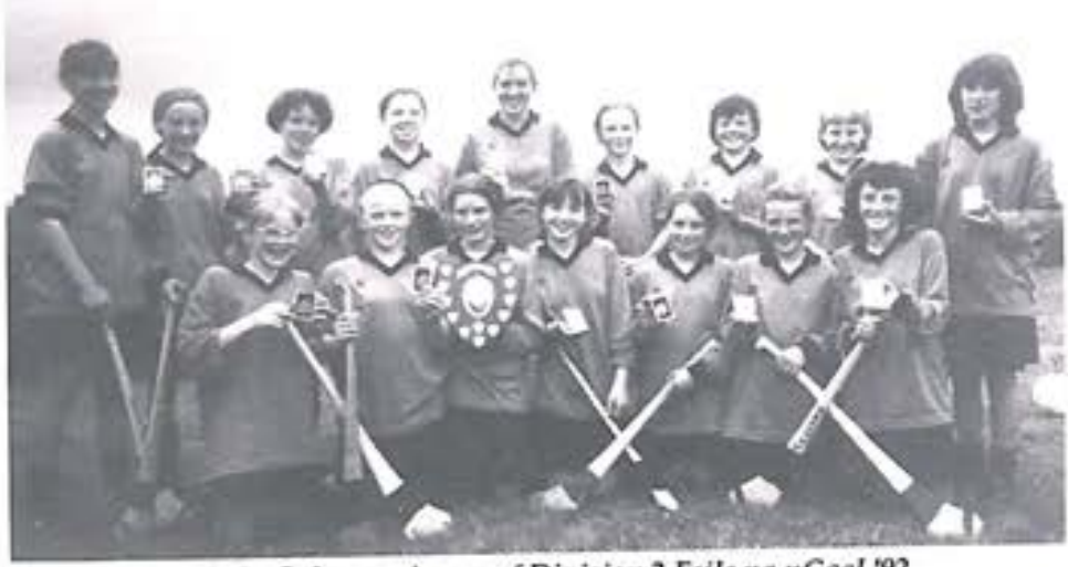
Davitt's, Galway winners of Division 2 Feile na nGael '92

Armagh recorded a good win when they hosted Derry. It was a keenly contested first half. Armagh stamped their authority in the second moiety