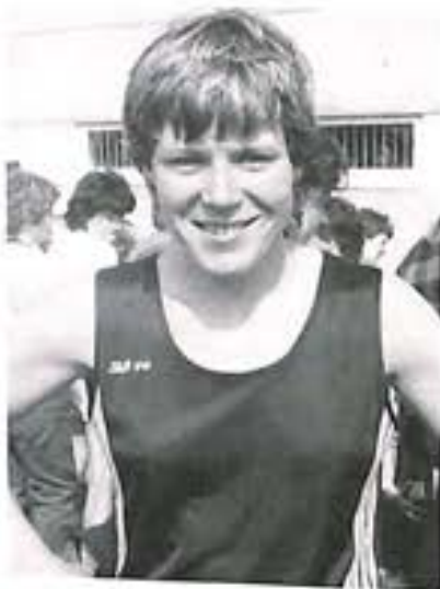
●Angela Downey, Kilkenny.

That has all changed. Camogie made great strides in the sixties and seventies. To mark the Diamond Jubilee of the Association, an All-Ireland Club Championship was introduced. The