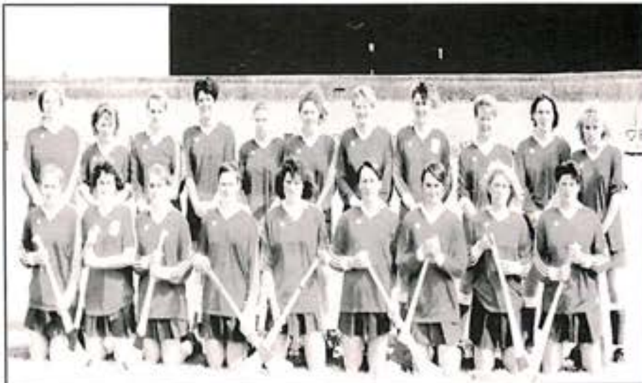
THE GALWAY TEAM