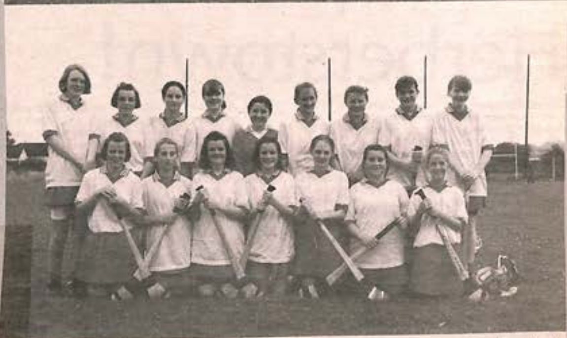
TOGHER COMMUNITY ASSOCIATION — The St. Finbarr's team (top), who played Ballyqarvan in the Togher Festival Under-14 camogie.