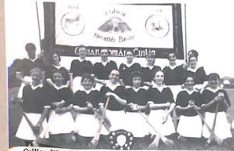
Cullion, Westmeath winners of Division 4 Feile na nGael '92