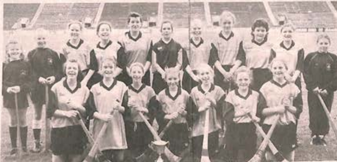
The Scoil Marie Assumpta, Ballyphehane team which won the C final at the Sciath na Scol Camogie finals at Paire Uí Chaoimh.