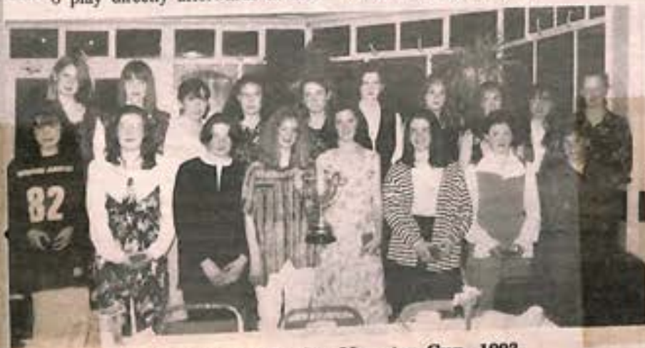
Winners of Senior Munster Cup, 1993