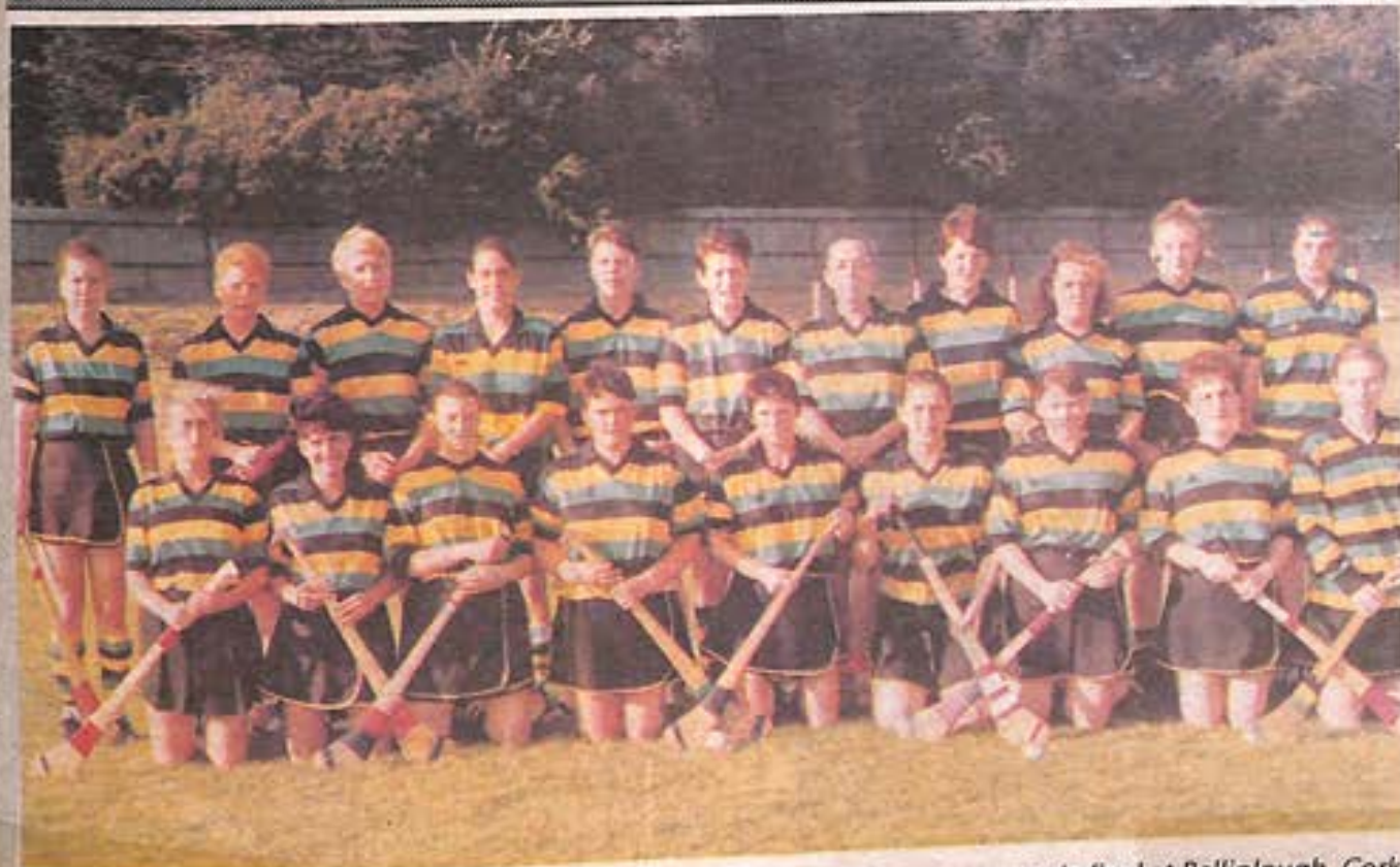
The Glen Rovers team (left), who defeated Na Piarsaigh in the Cork County camogie final at Ballinlough, Cork.