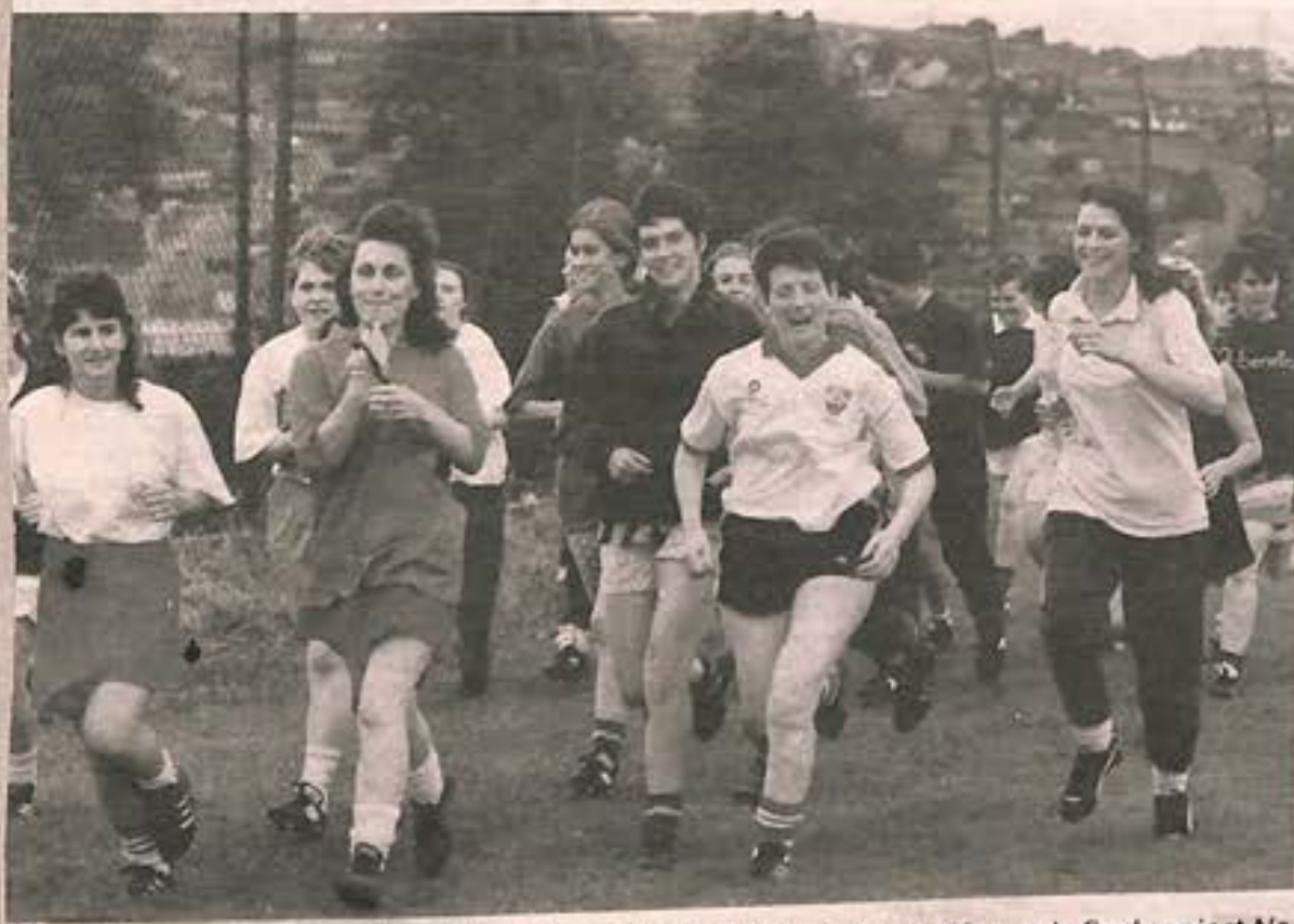
Glen Rovers camogie team in training for next Sunday's Cork County Camogie final against Na Piarsaigh.

On their way to the final, Glen Rovers beat Killeagh and Sarsfields, and on the strength of these victories, will start favourites on Sunday, but shouldn't underestimate their great northside city rivals.