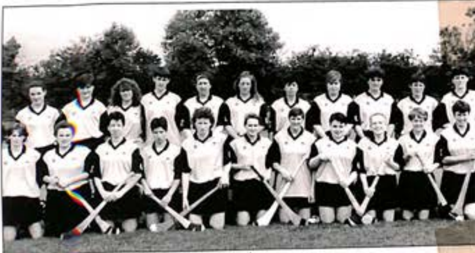
Kilkenny, Camogie National Senior League Champions.