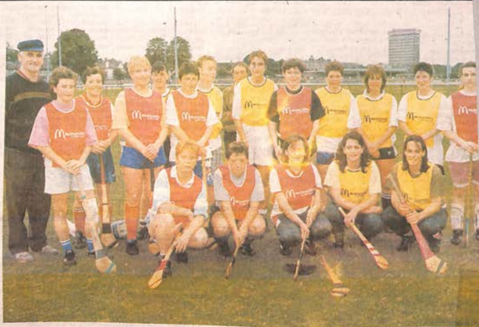
Members of the Cork camogie panel for the All-Ireland semi-final against Kilkenny on Sunday.