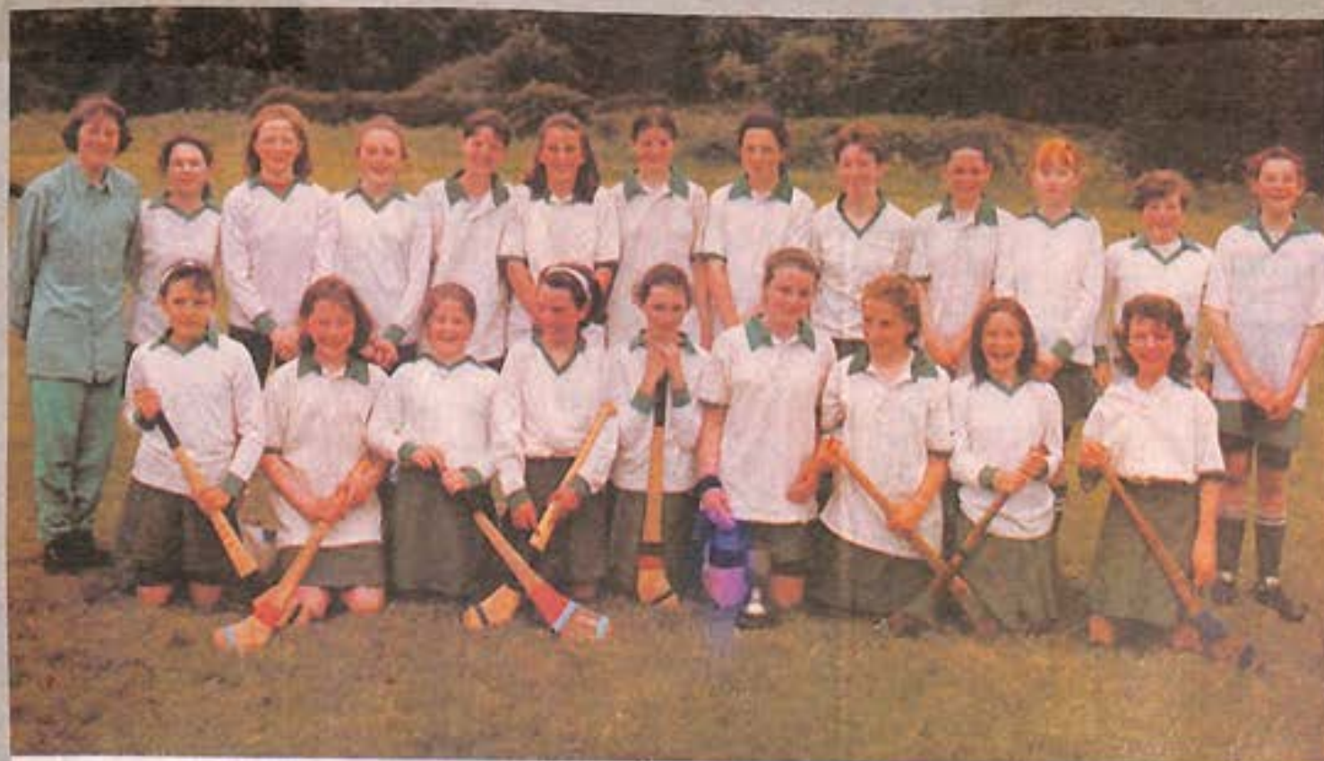
The Aghabullogue Under-14 Camogie team which will represent Cork in thue Féile na nGael finals in Galway at the weekend.