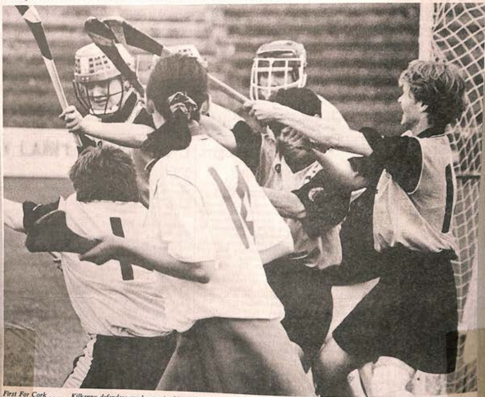
First For Cork ..... Kilkenny defenders are beaten in this goal shot from the first of Cork's penalties.