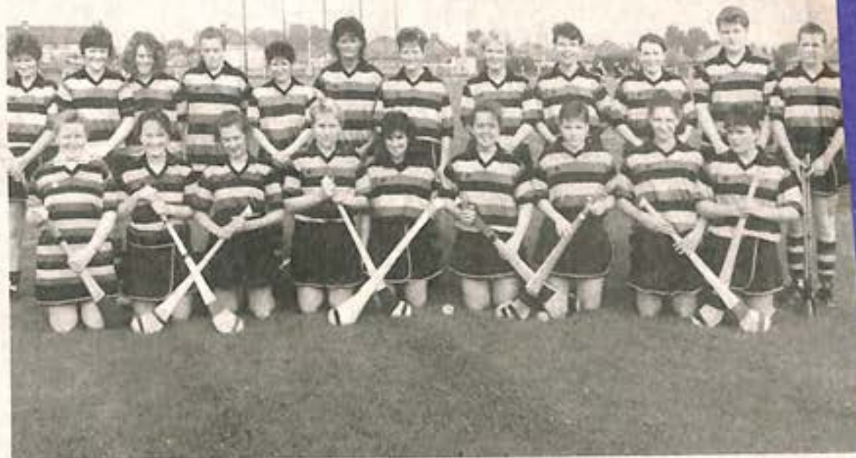
The Glen Rovers team, who defeated Na Piarsaigh in the semi-final of the Cork County Senior Camogie Championship, at Ballinlough last night.