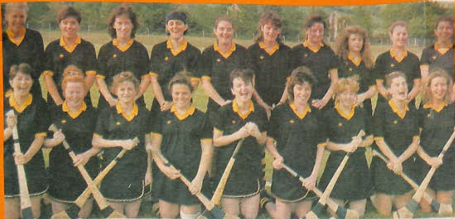
The Na Piarsaigh team which defeated Eire Og in the Cork County Senior Camogie Championship at Ballincollig on Saturday.