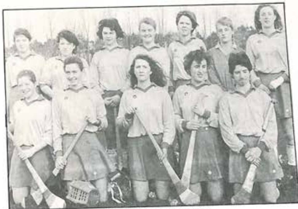
Vocational School, Thomastown

This Page is Sponsored by O'Shea & Sons, Painters & Decorators, Thomastown