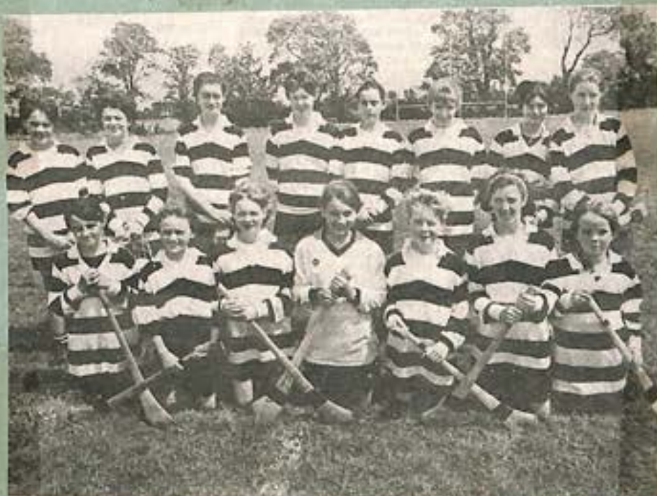
The Ballyagran camogie team who took part in the Munster Community Games finals at Plassey.

CAMOGIE — All Ireland Senior Championship First Round: Kilkenny 4-18, Antrim 0-4. All Ireland Junior NL Final: Limerick 3-13, Roscommon 3-4. Leinster J.L. Semi Final: Dublin 3-6, Wexford 0-4.