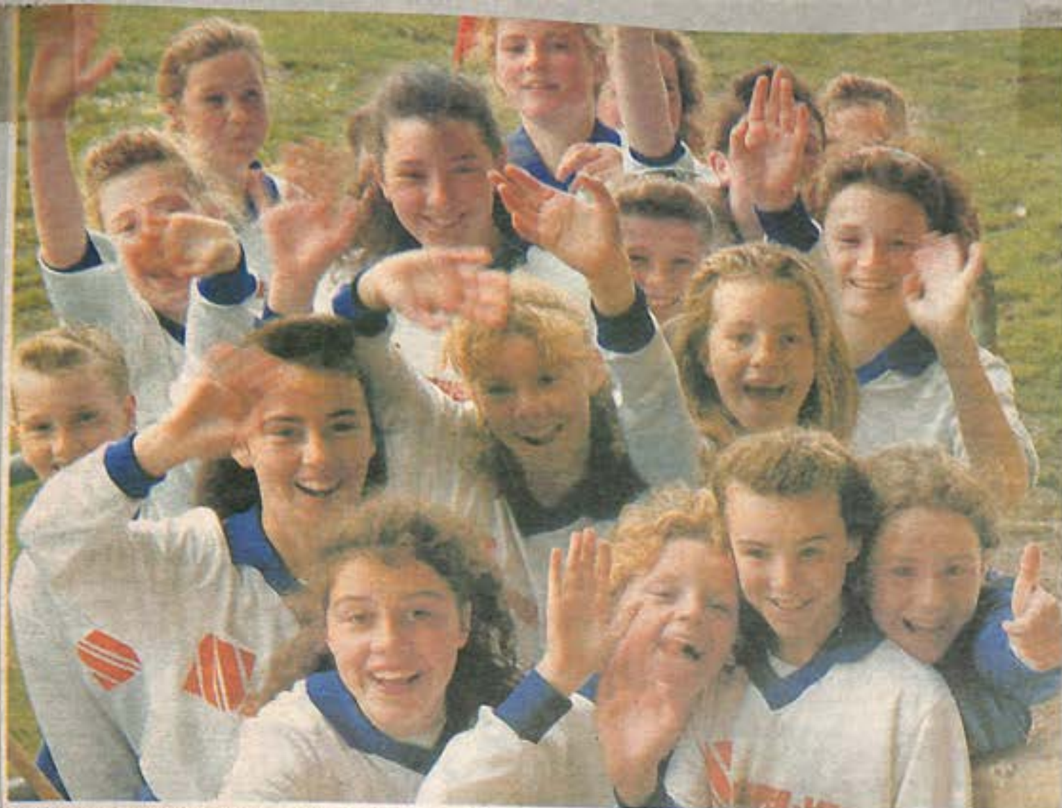
St. Marys On The Hill, Knocknaheeny NS, Cork players celebrate their win over Scoil Oilibhear, Dublin Hill, Cork in Section One in the Sciath na Scoil camogie finals at Pairc Uí Chaoimh.