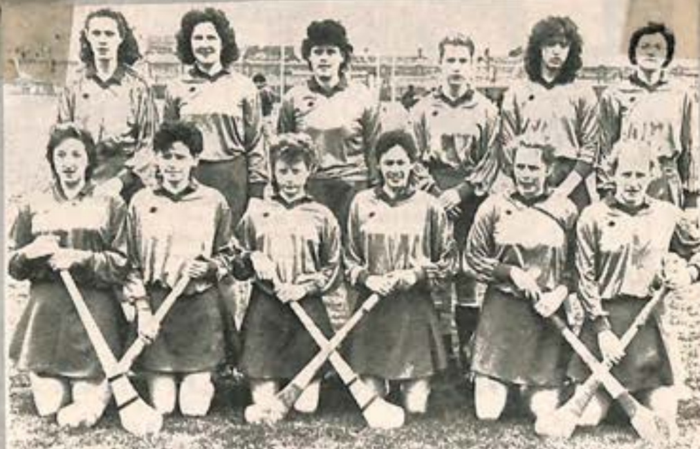
St. Mary's, Nenagh, who defeated St. Cuan's of Galway to become All-Ireland junior camogie champions for the first time on Saturday last at Tullamore.