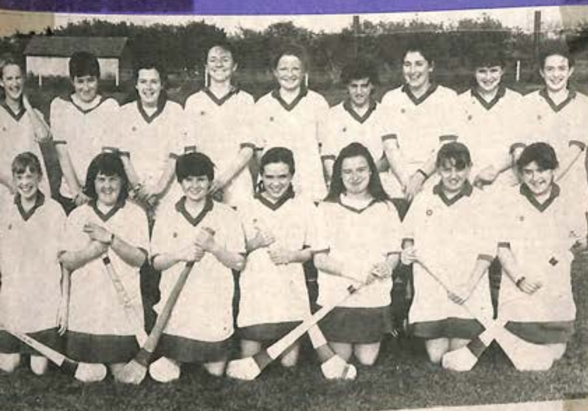
Iniscarra, winners over Bishopstown in the Cork County Felle camogie final played at Bishopstown.