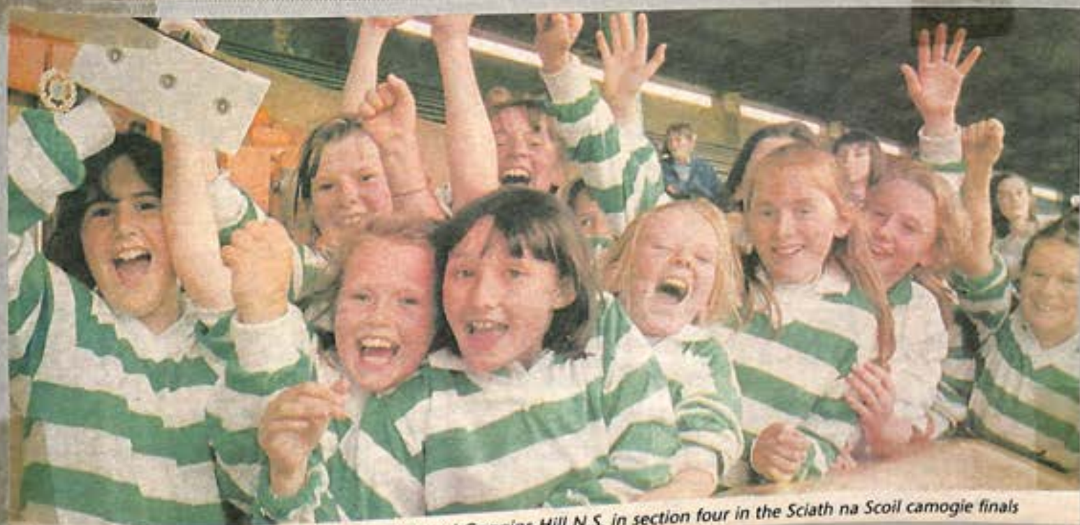
...defeated Goggins Hill N.S. in section four in the Sciath na Scoil camogie finals