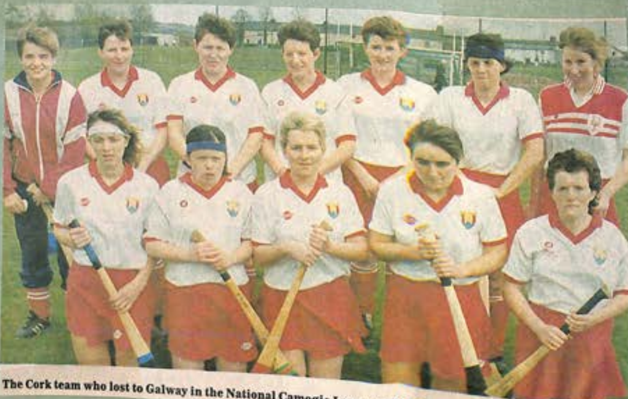
The Cork team who lost to Galway in the National Camogie League at Ballincollig, Cork.

Far more interesting and entertaining was the Junior final, in which St. Mary's Nenagh scored a richly merited 3-9 to 1-10 victory over St. Cuan's Castleblakeney in a game in which both schools were contesting the final for the first time.