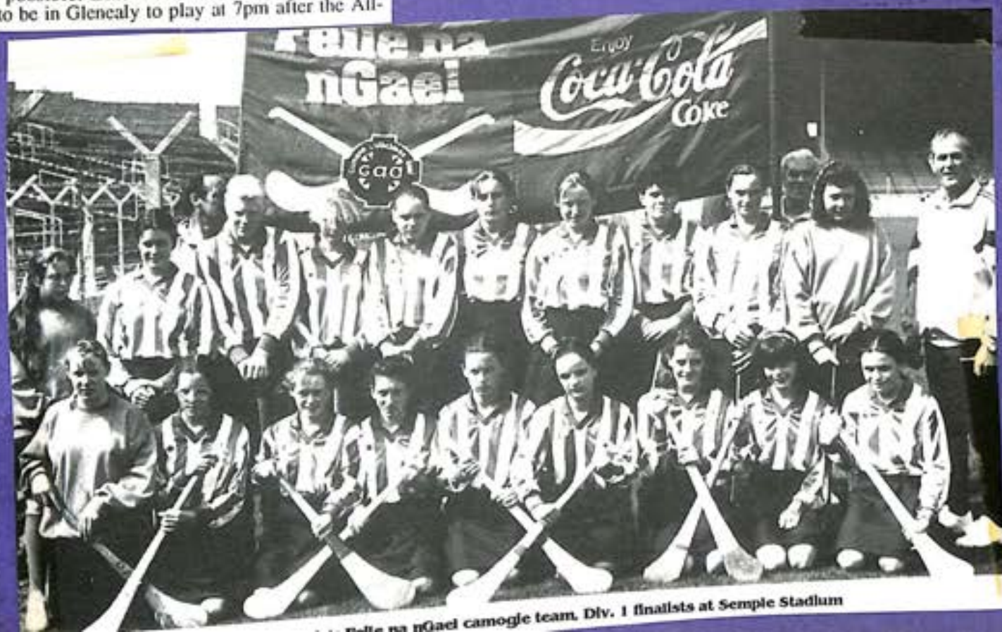
Féilte na nGael camogie team, Div. 1 finalists at Semple Stadium