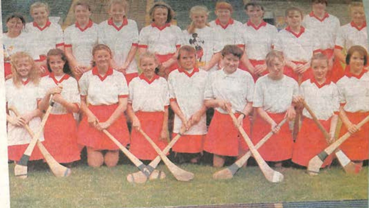
Cloghroe N.S. (top) who defeated Scoil Spioraid Naoimh, Bishopstown, Cork, in the section two final in the Sciath Na Scoil Camogie finals at Páirc Uí Chaoimh.