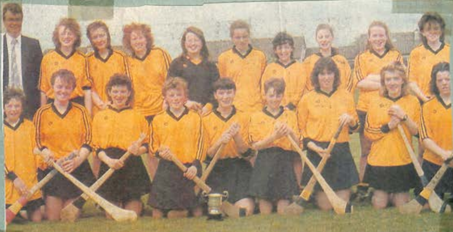
St. Brogan's Bandon, who defeated Mannix College, Charleville, in the Cork Co. Vocational Schools Senior Camogie final at Blarney.