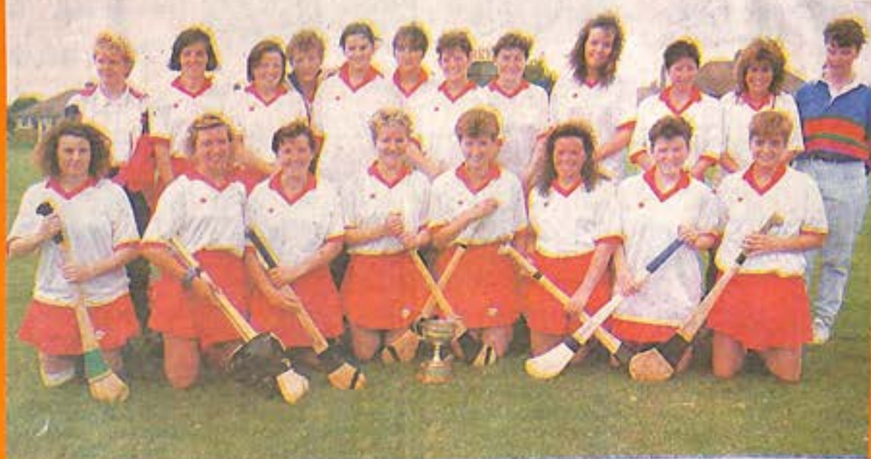
The Cork team, winners of the National Camogie League when they defeated Kilkenny at Ballinlough on Sunday.