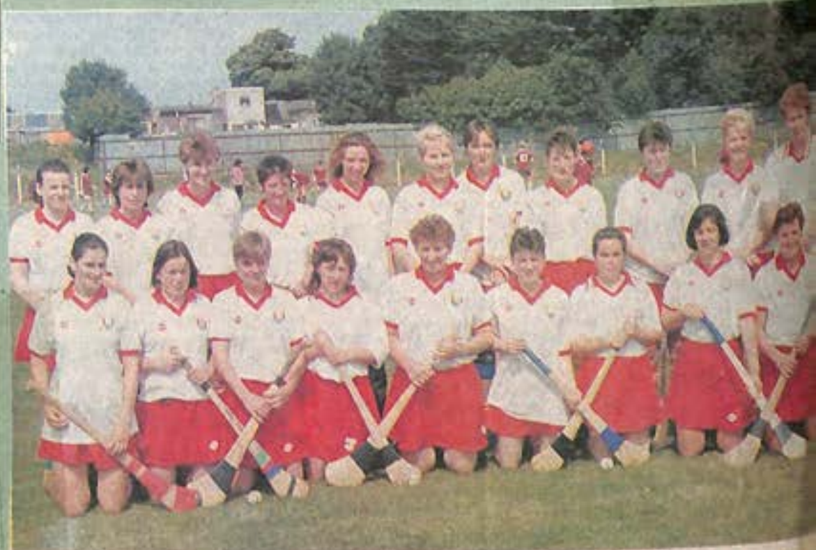
The Cork Camogie team who defeated Galway in the All-Ireland semi-final at Ballinlough.