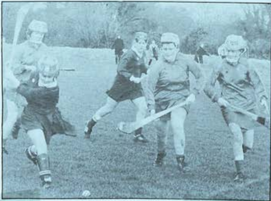
Action from the Junior semi-final between St. Mary's, Nenagh and F.C.J. Buncloody.