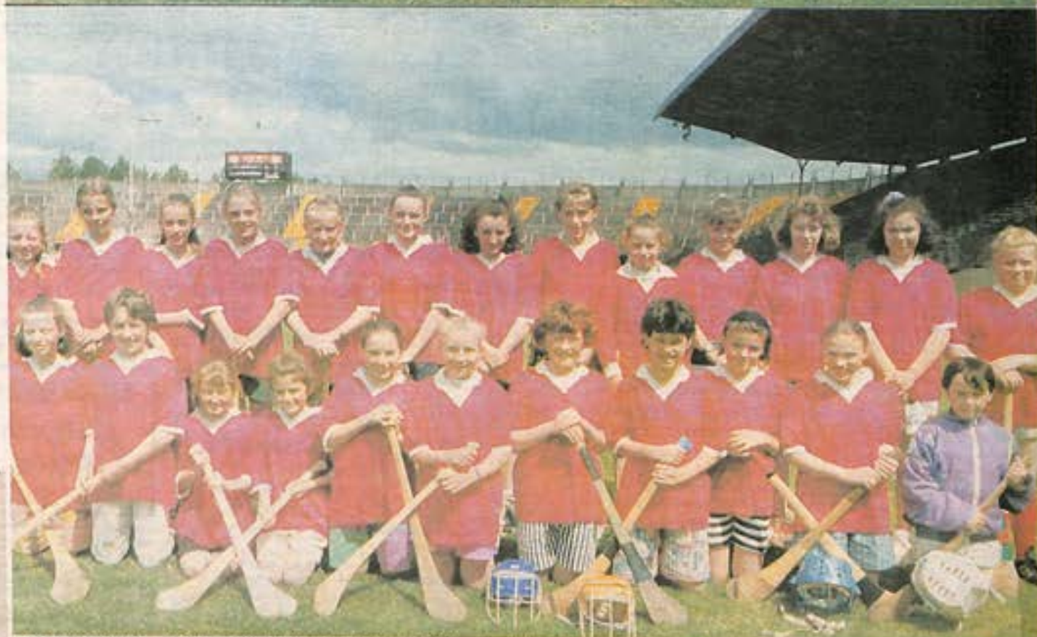
St. Brigid's N.S., Midleton (top) who defeated Kilcredan N.S. in section five in the Sciath Na Scoil camogie finals at Páirc Uí Chaoimh.