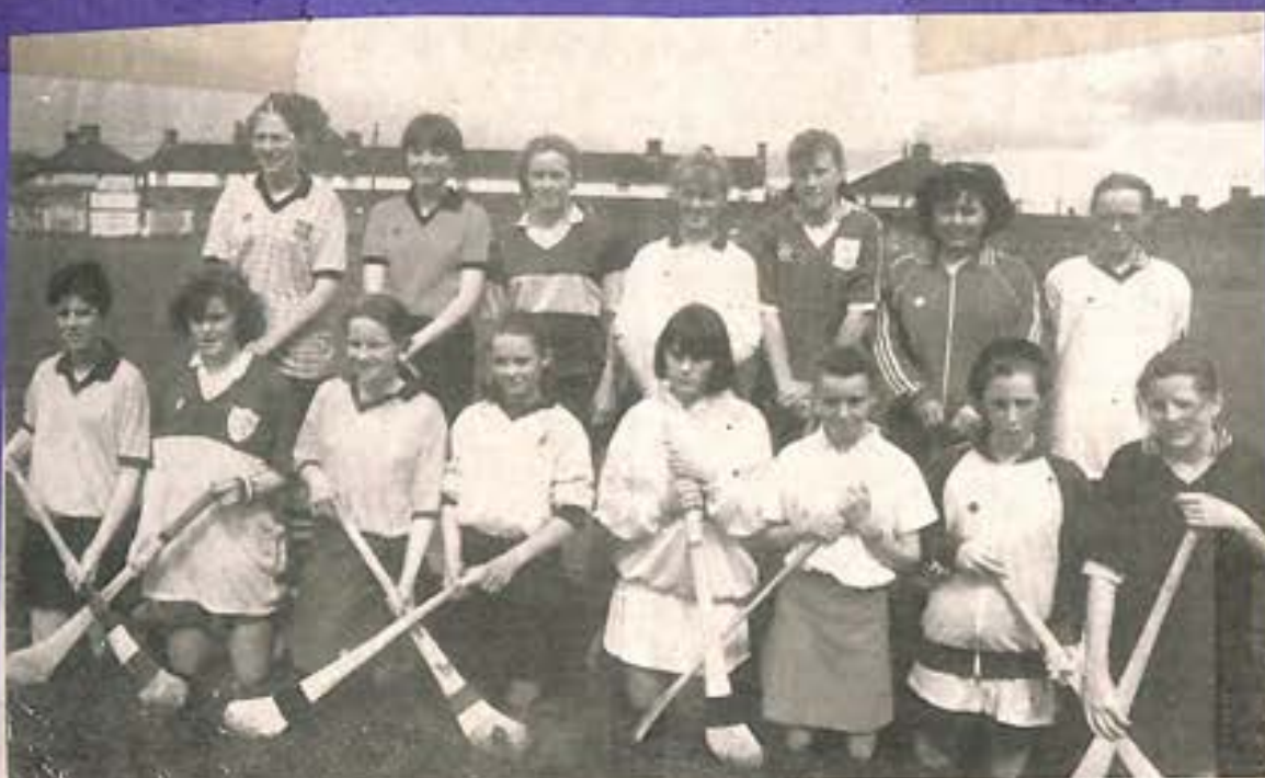
Competitors who took part in the Camogie Skillstar Competition run in conjunction with Feile na nGael in Thurles at the weekend.