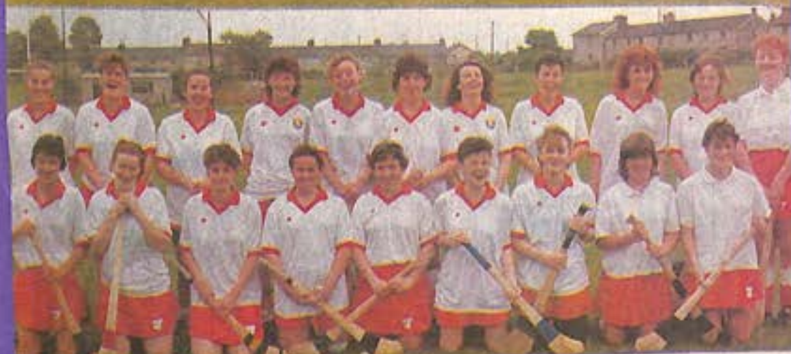
Tipperary (above) who defeated Cork in the Munster Junior camogie final at Ballinacollig.