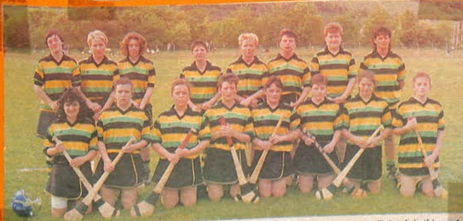
Glen Rovers, Cork County and All-Ireland champions, who had to fight hard to overcome St. Finbarr's in this year's Championship game at Ballincollig on Saturday night. They advance to the semi-final.