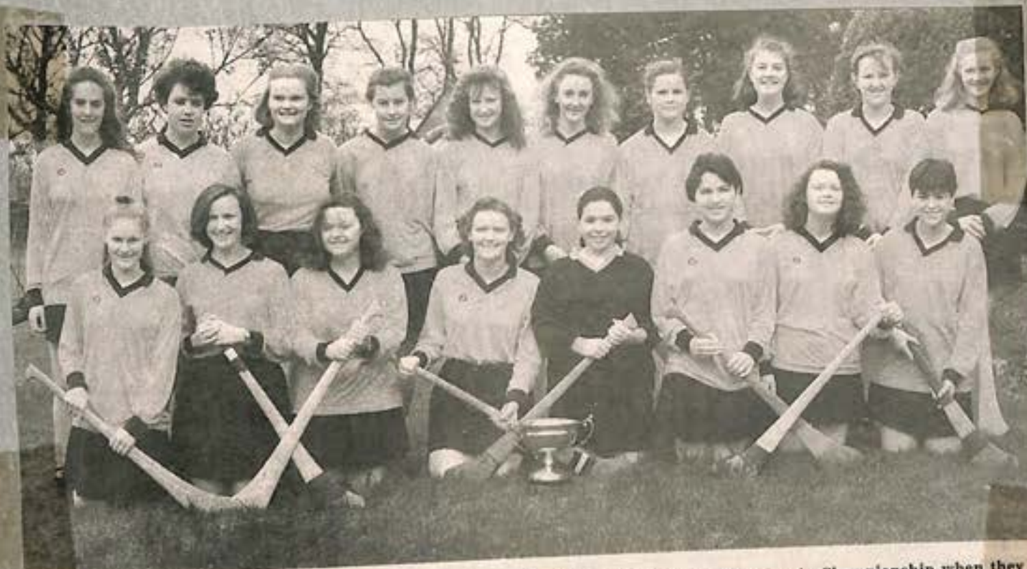
Presentation Secondary School, Bandon, who won the Munster Intermediate Colleges' Camogie Championship when they defeated St Caimins, Shannon in the final at Charleville.