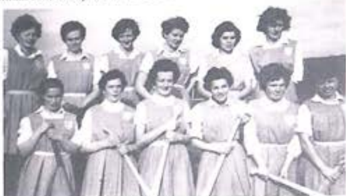
The Leinster team which defeated Ulster in the Gael Linn Inter-Provincial 1962.