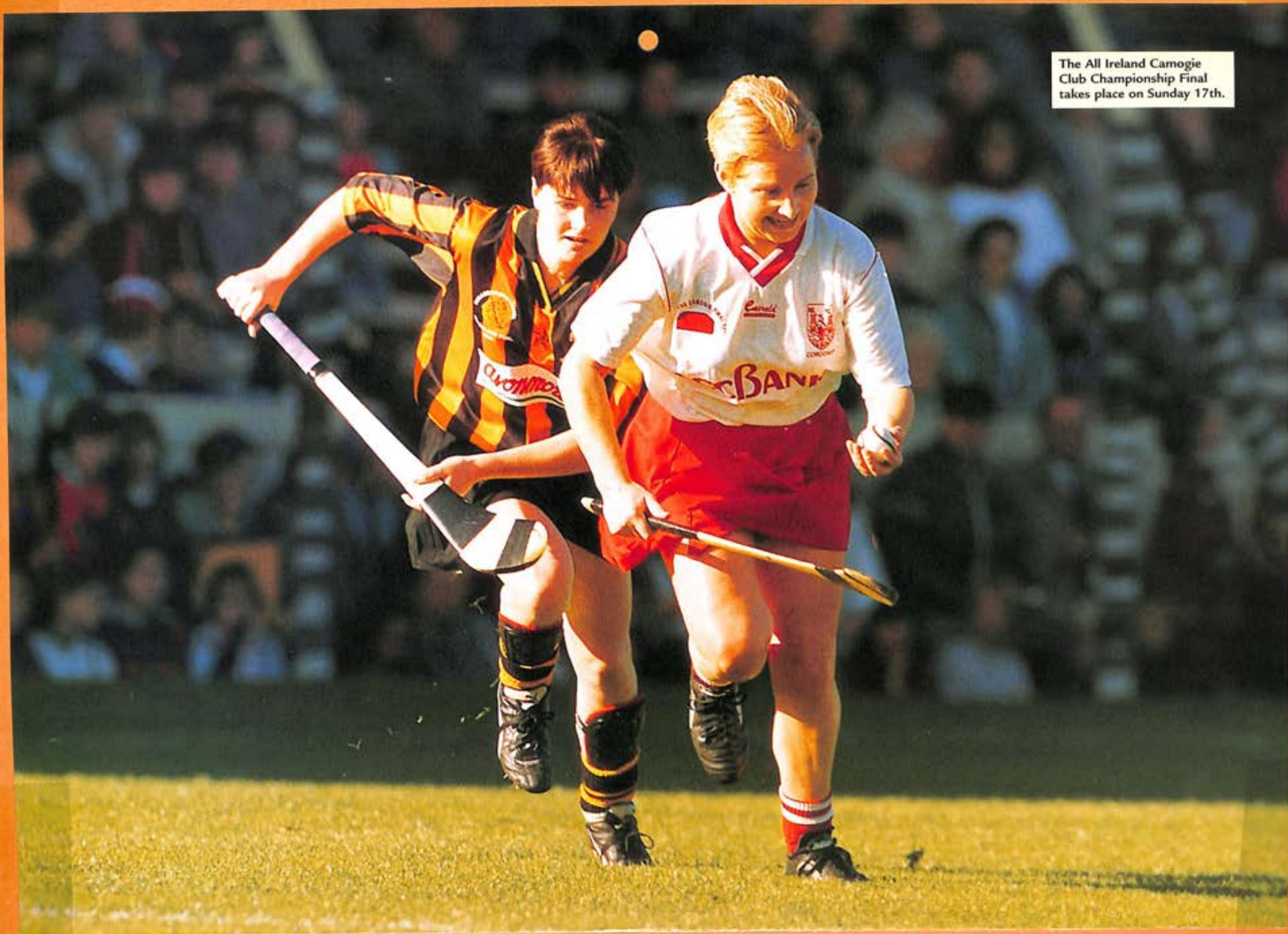
The All Ireland Camogie Club Championship Final takes place on Sunday 17th.