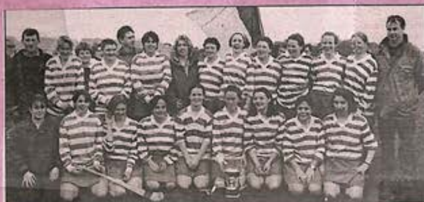
■ Valley Rovers, Cork County Junior A Camogie Champions after they defeated St. Finbarrs in the Final played at Blackrock.