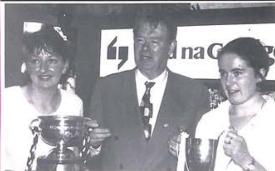
Michéal Ó Muircheartaigh, Cathaoirleach Bhord na Gaeilge, le Imelda Nic Oibhcin (captain na Gaillimhe) agus Antoinin Ni Chonaill (captain Chorcaí), ar dheis.