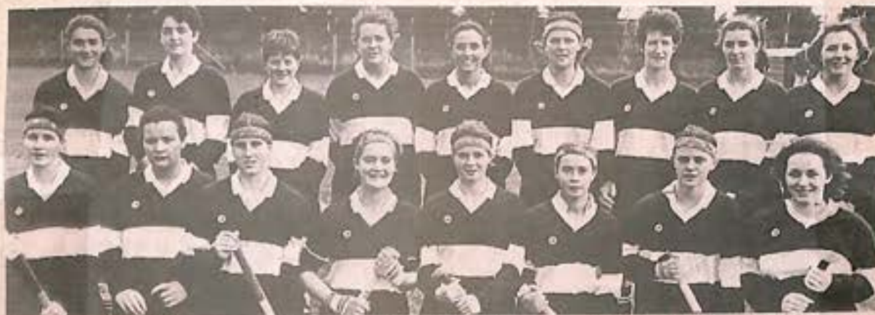
The Granagh/Ballingarry camogie team which will be hoping for All-Ireland Club success on Sunday next when they take on Pearses of Galway in Ballingarry.