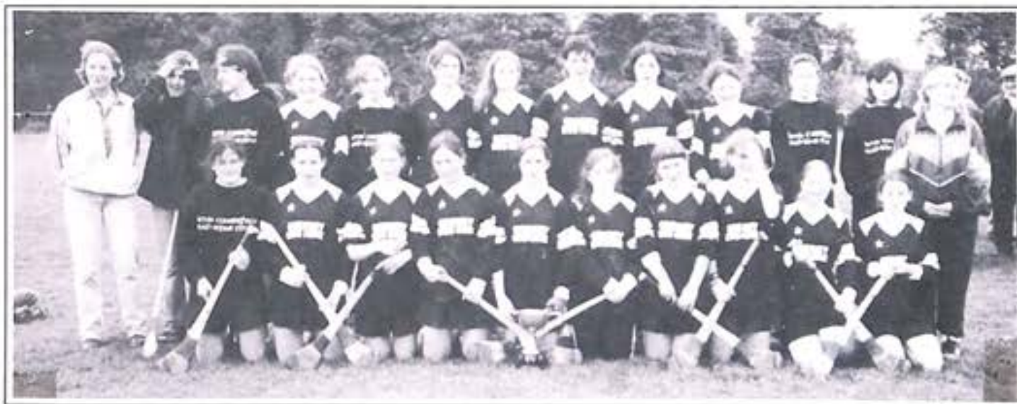
Pearse's Minor Camogie team, 1996 County Champions