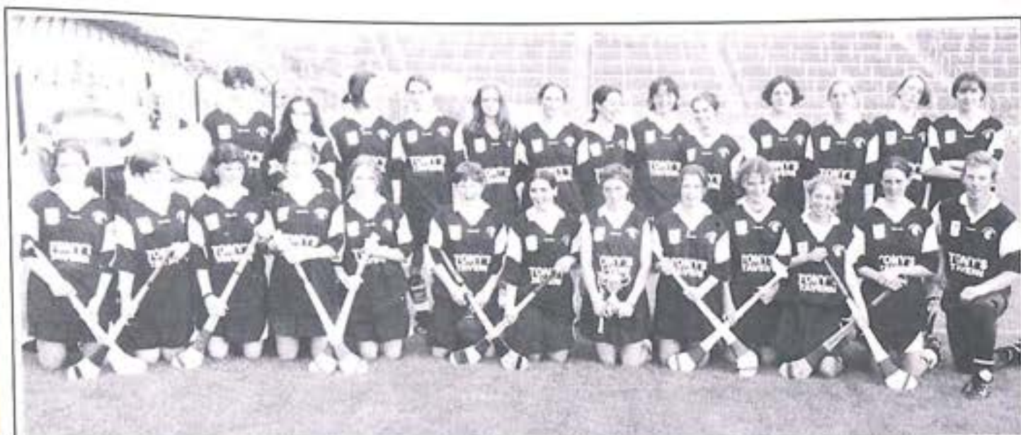
The All-Ireland Winning Team