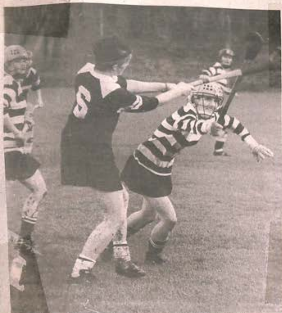
A battle for possession in the All-Ireland camogie final.