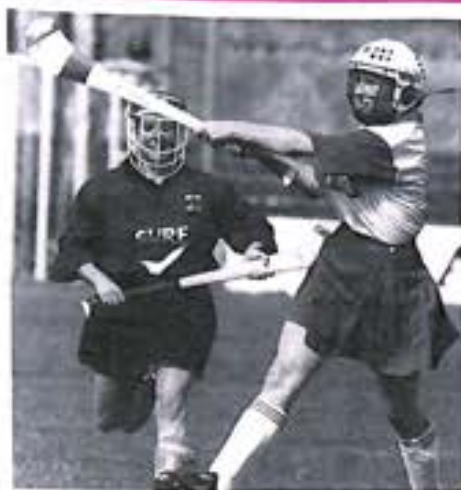
Action from the All-Ireland final.