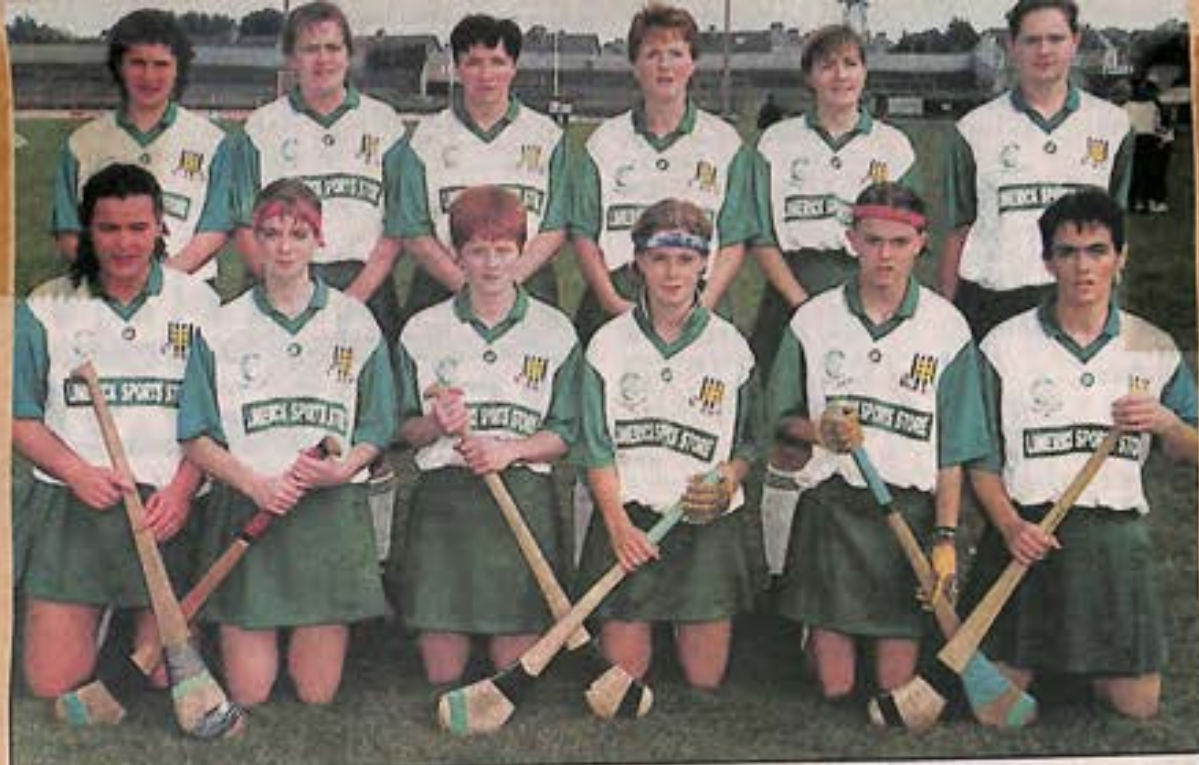
Champions.. the Limerick team who won the All-Ireland Intermediate camogie championship by beating Down at the Gaelic Grounds on Sunday.