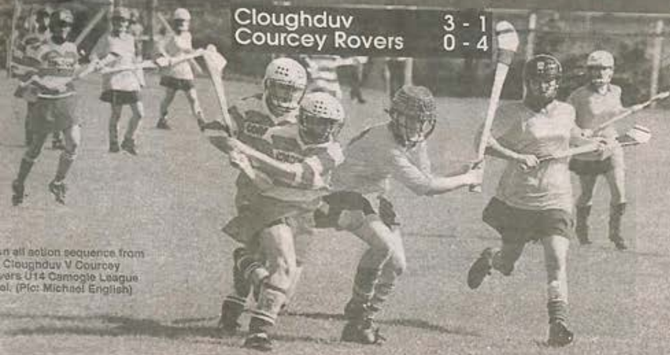
An all action sequence from the Cloughduv V Coursey Rovers U14 Camogie League Final.