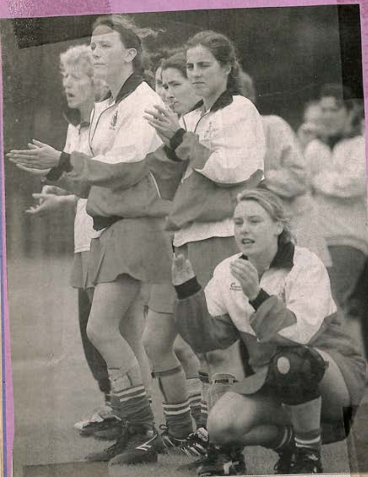
Delight for the Cork subs' bench during their All-Ireland camogie semi-final match against Kilkenny at Pairc Uí Rinn, Cork.