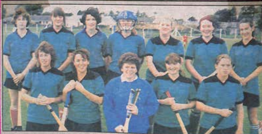
Imokilly camogie team who play Glen Rovers in the County Final on Wednesday next.

SUNDAY — Bord na Gaelge All-Ireland SC semi-final: Galway v Wexford 3.0, Loughrea. All-Ireland IC semi-final: Armagh v Limerick 1.0, Ballymacnab. All-Ireland JC semi-final: Kildare v Cork 1.30, Sarsfields, Newbridge.