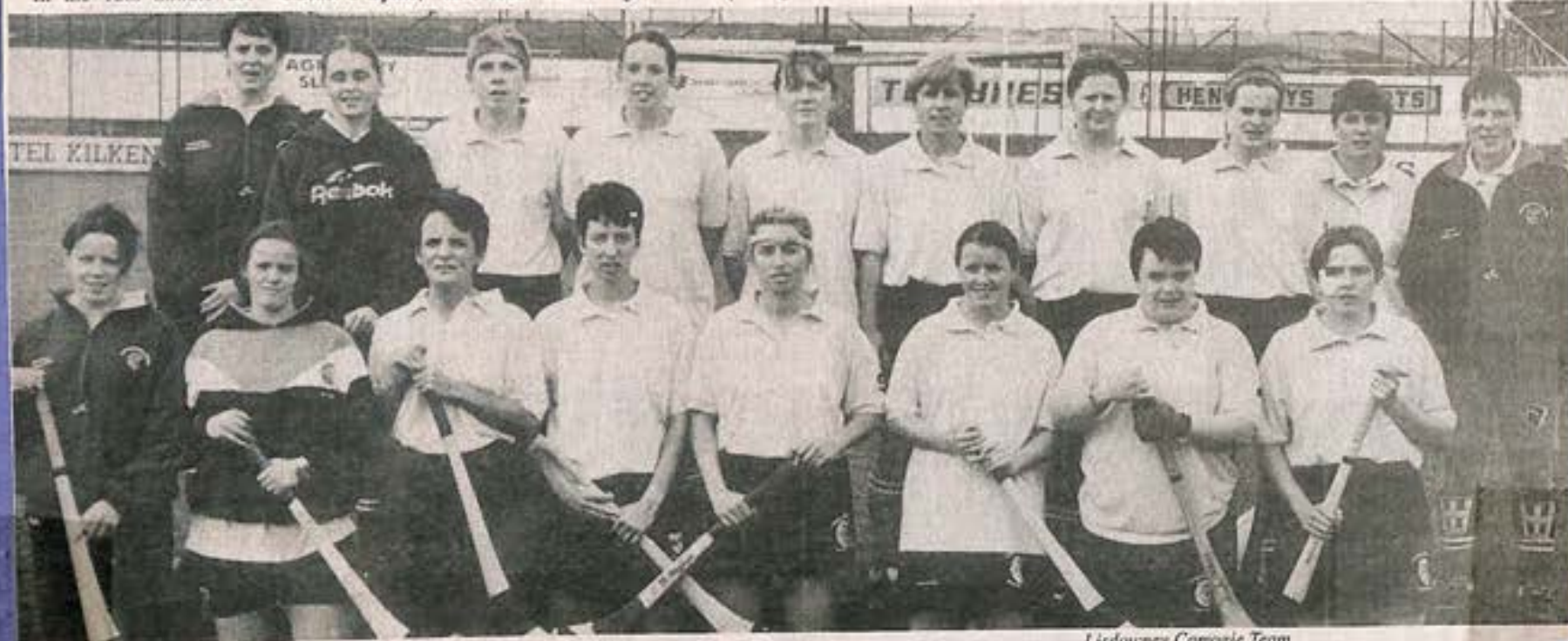
Lisdowney Camogie Team