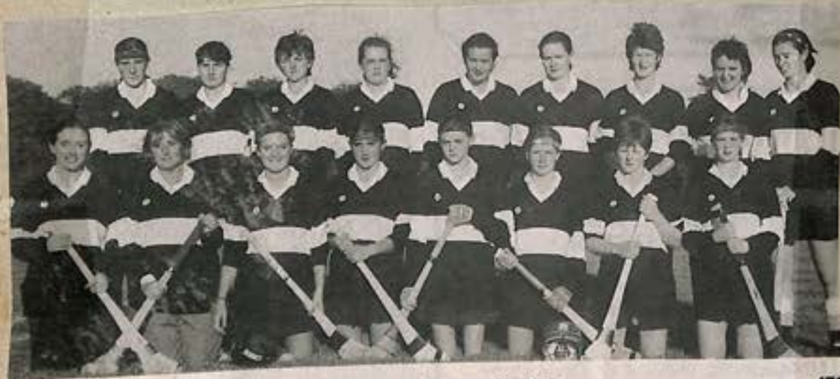
Granagh-Ballingarry, who won the county senior camogie title.