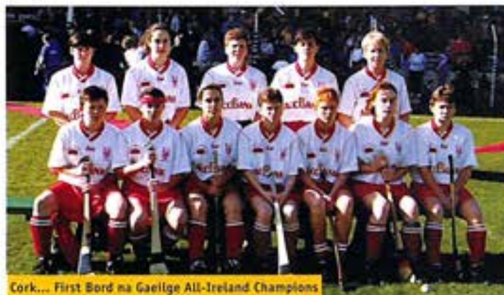
Cork... First Bord na Gaeilge All-Ireland Champions