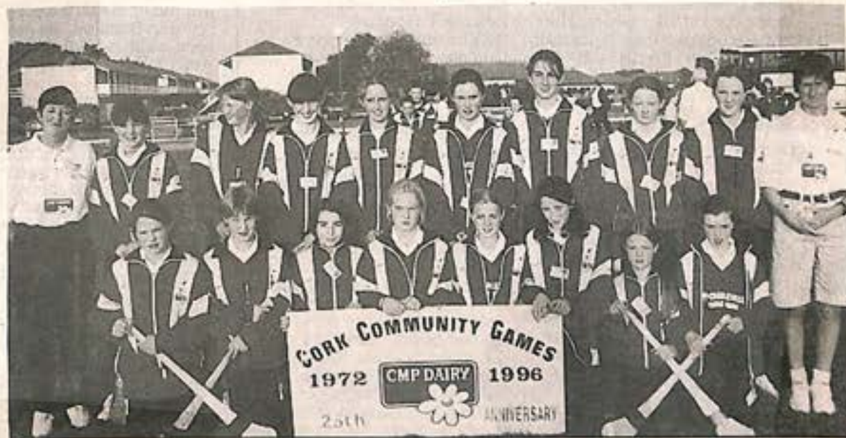
Milford/Tullylease, winners of the under 14 camogie girls final at the CMP Dairy Cork Community Games.