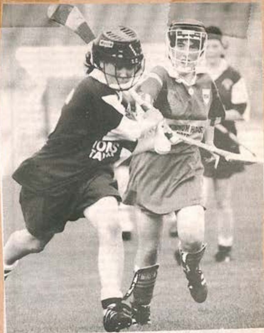
Action from the All-Ireland minor camogie final between Tipp and Galway on Sunday which Galway won by two points.