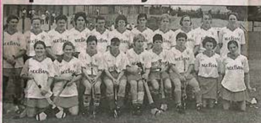
■ Cork's Camogie team who defeated Kilkenny in the All Ireland semi final at Páirc Uí Rinn.