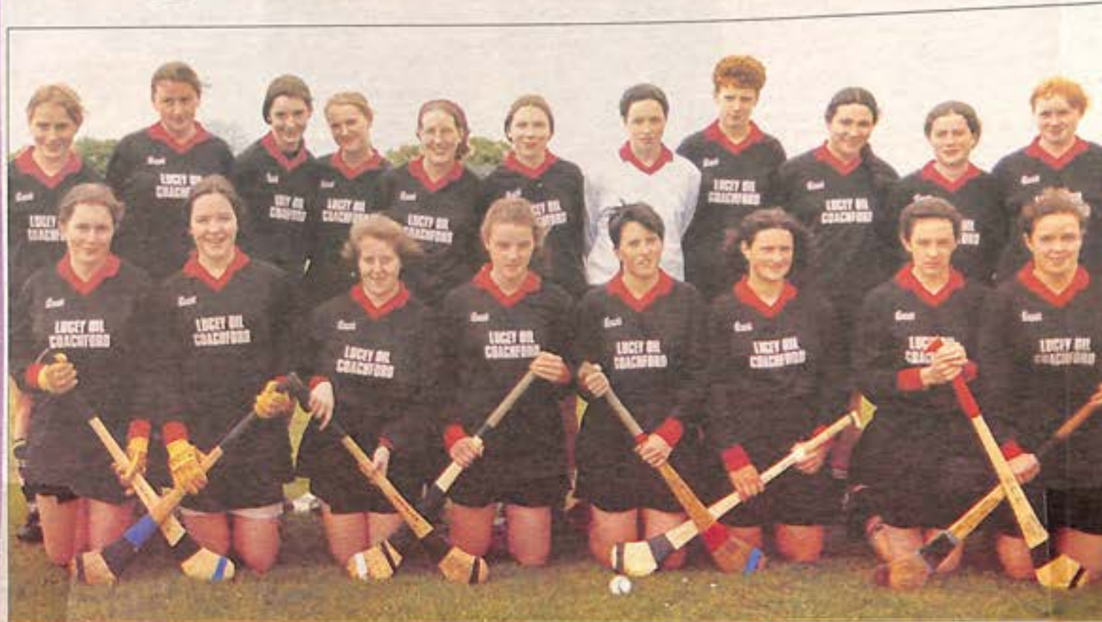
Coachford Senior panel, Munster Intermediate champions 1995.