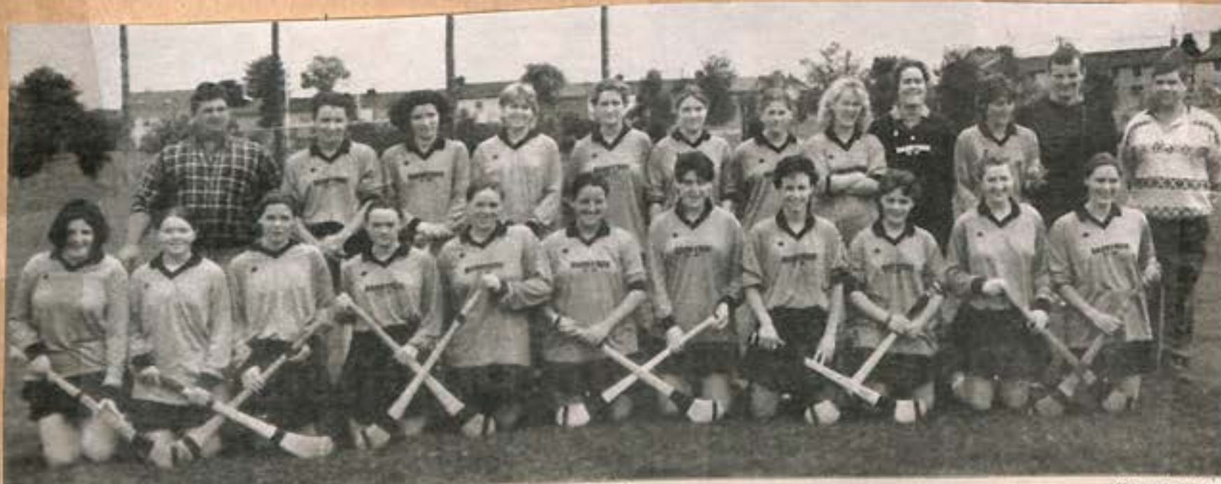
Barryroe, winners over Castlemagner in the County Intermediate camogie final.