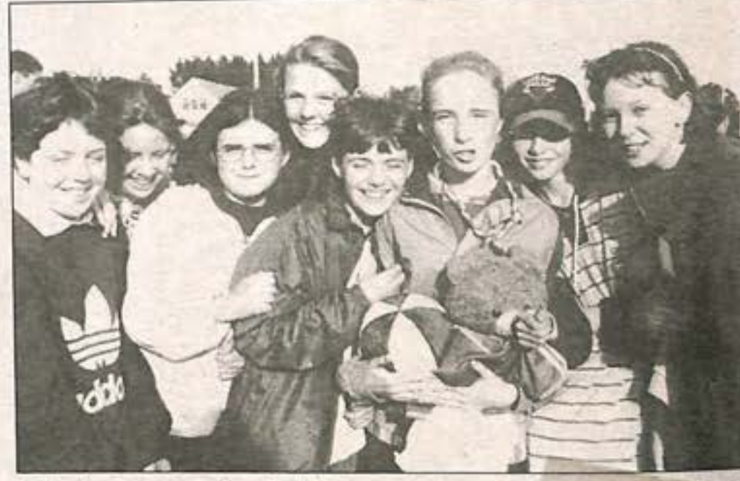
Enthusiastic youngsters from Ballinhassig seen celebrating their teams win over Courcey Rovers in the South East Junior A Hurling Final at Carrigaline recently.