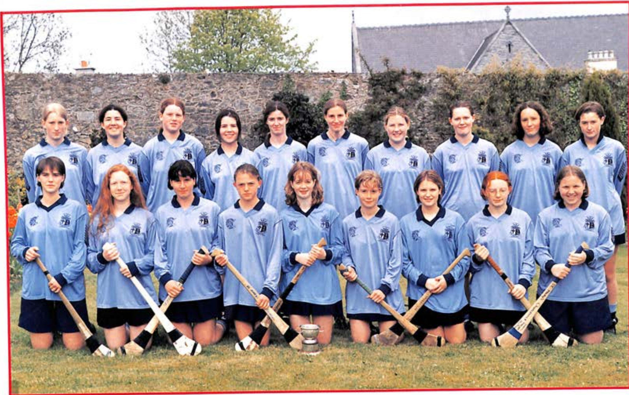
St. Mary's, Charleville All-Ireland Colleges Senior Camogie Champions 1995-'96