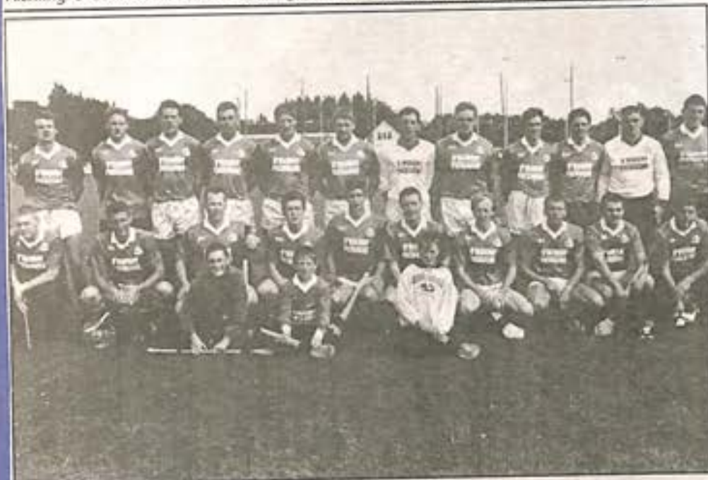
Ballinhassig, 1996 South East Junior A Hurling Champions after their 2-13 to 2-10 victory over Courcey Rovers at Carrigaline. (Howard Crowdy)