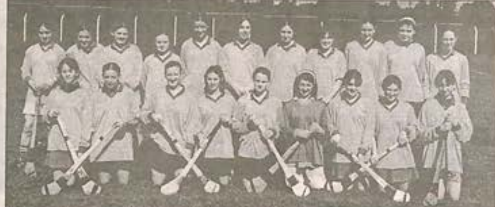
Coursey Rovers who lost to Cloughduv in the Cork County U14 Camogie League Final.