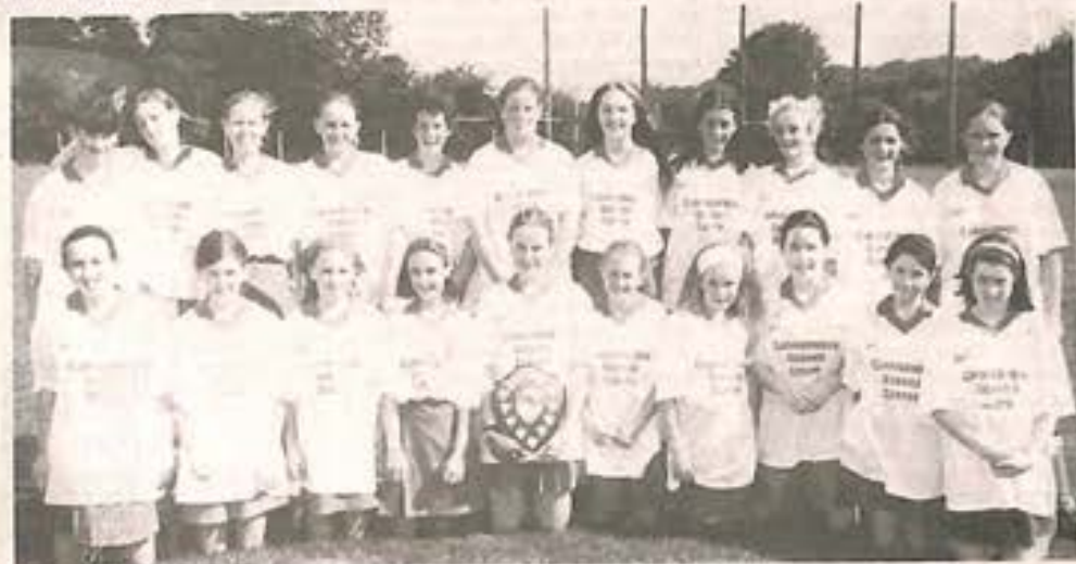
Ballygarvan, South East under 13 camogie champions after defeating holders Ballinhassig in the final at Ballinhassig.