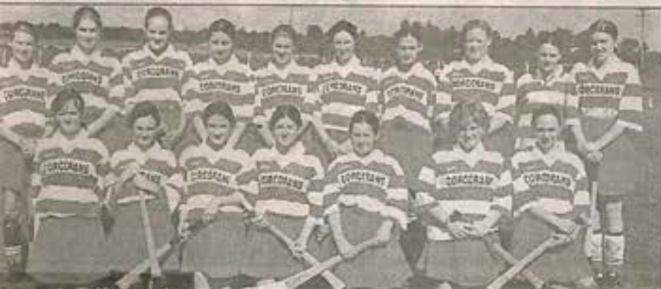
Cloughduv U14 Camogie Team who defeated Coursey Rovers in the League Final at Newcestown.