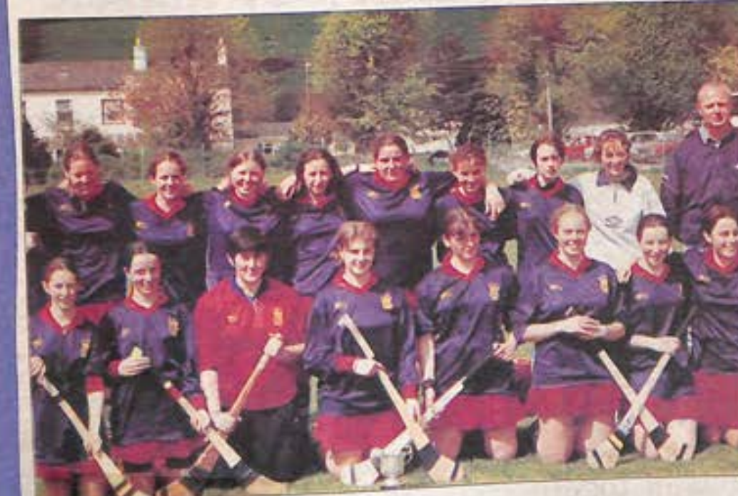
St. Mary's, Macroom

Another split in Cork saw five clubs in the Muskerry division breaking away from the Cork County Camogie Board to run their own competitions. They affiliated directly to the Munster Council, and represented Cork in two consecutive years in the Munster championships — but were beaten on both occasions by Clare and Waterford respectively. Unity among Cork clubs was firmly estab-