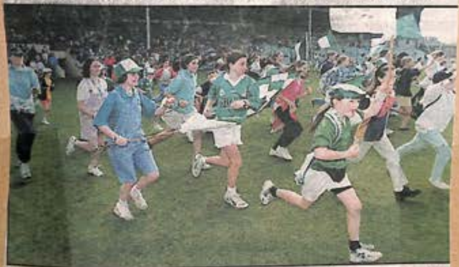
Fans rush to congratulate Limerick's camogie heroines.