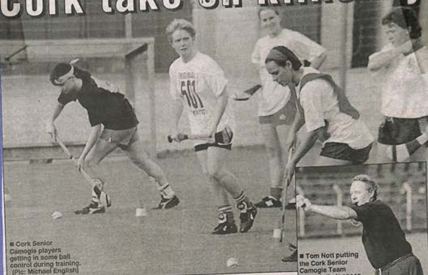
■ Cork Senior Camogie players getting in some ball control during training.