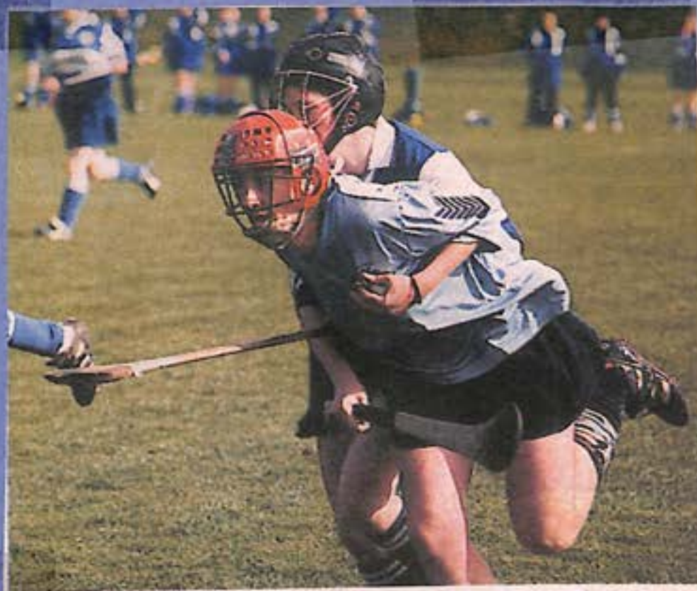
Close encounters during the All Ireland Senior Schools Camogie Semi Final, St Marys Charleville versus St. Patricks of Derry in Newtownshandrum.