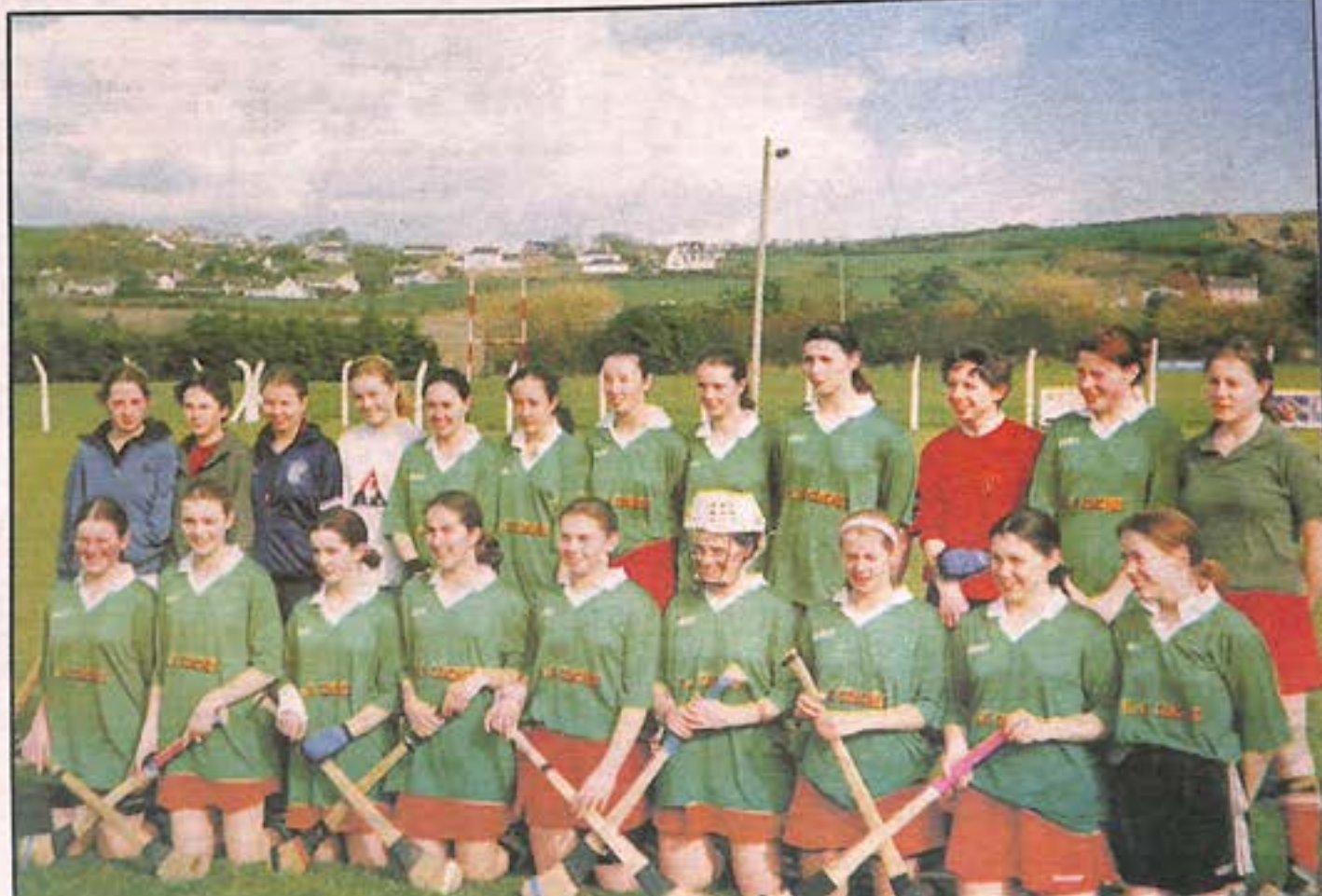
Sacred Heart College, Clonakilty, who have qualified for the All Ireland post primary camogie final.