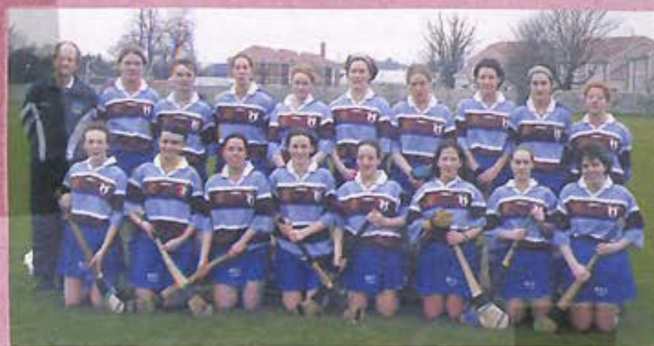
The MICE camogie team

As far as camogie is concerned, Mary Immaculate are currently enjoying prosperous times. Winners of the Purcell Cup on three occasions during the 1980s, the college regained the prestigious prize after a lengthy wait last season. At the time of writing, MICE were on course for retaining the Purcell Cup, having qualified for the semi-final stages.