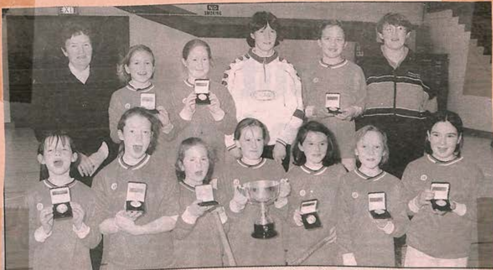
Millford NS celebrate their win in the Indoor Camogie Sciath na Scol competition after beating Douglas in the final.