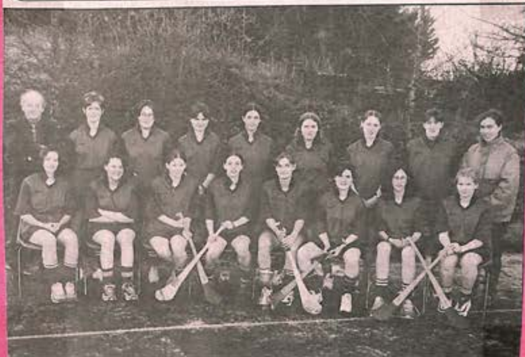
North Tipperary Senior Camogie Champions. Camogie in Coláiste Phobal Ros Cré is kindly sponsored by Roscrea Credit Union.