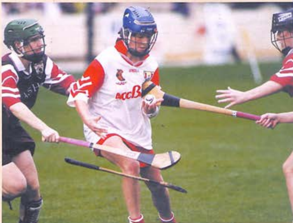
If Galway and Cork are to meet in this year's senior championship, it will be in the All-Ireland semi-final