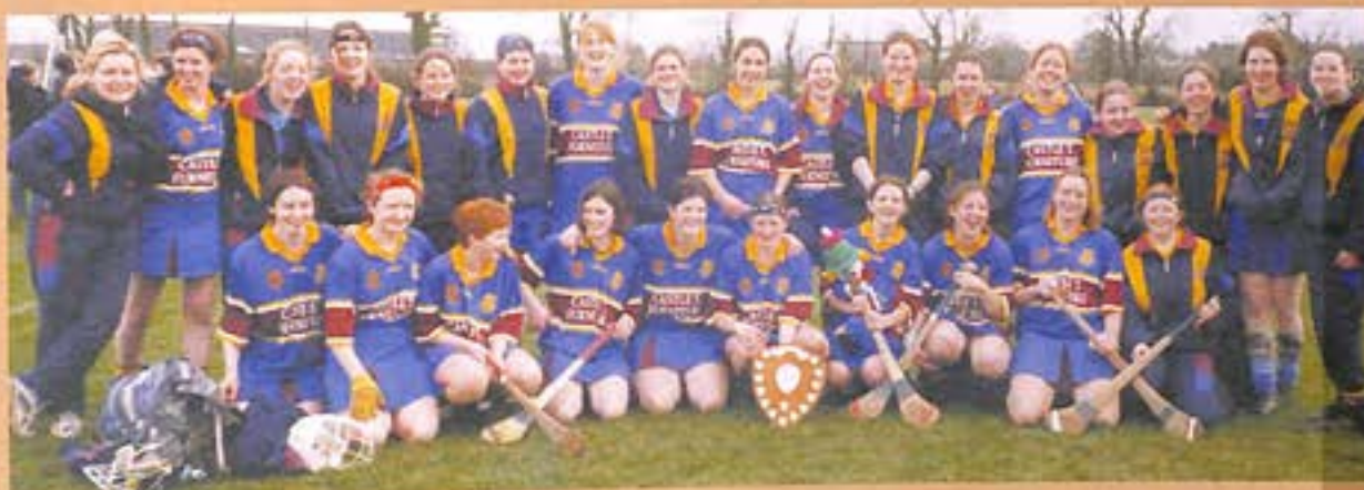
The Limerick University squad that clinched the Ashbourne Shield competition