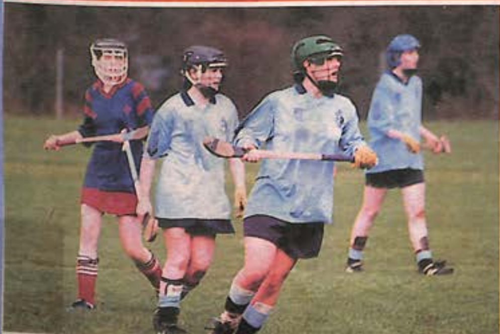
Anxious to join the action of the Munster Colleges Senior Camogie Championship.