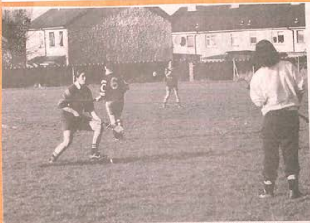
Members of St. Mary's camogie panel engaging in a puck around at training.