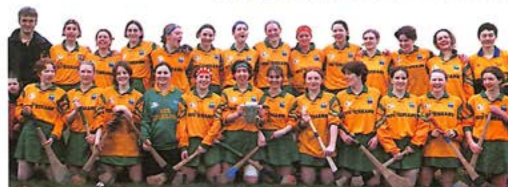
Waterford I.T. ... Ashbourne Cup winners 1999.