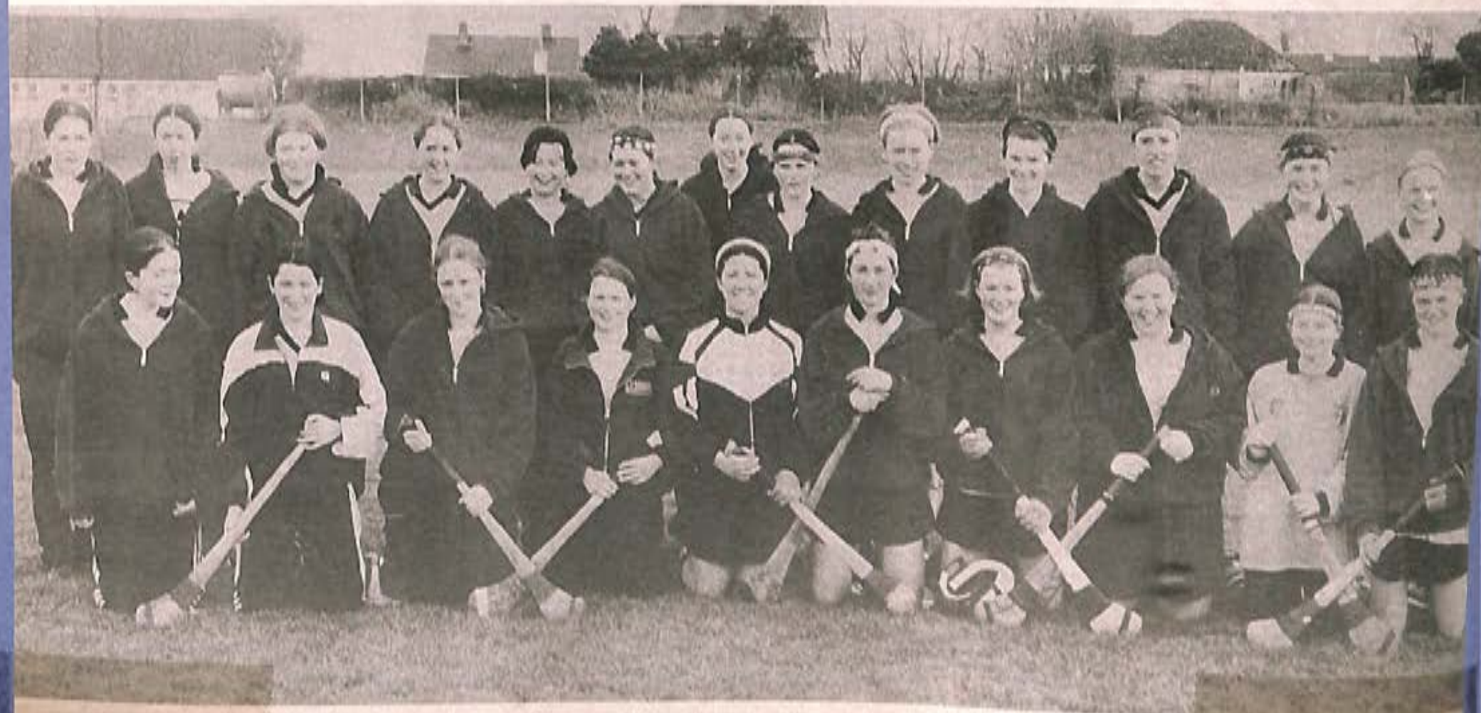
St. Marys, Charleville Senior Camogie panel which has qualified for yet another All Ireland Schools Final.

From which direction is the ball coming? There was a little confusion for these players during the All Ireland Schools Senior Camogie Semi Final in Newtownshandrum.