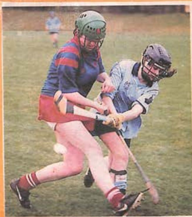
Tussling for the ball