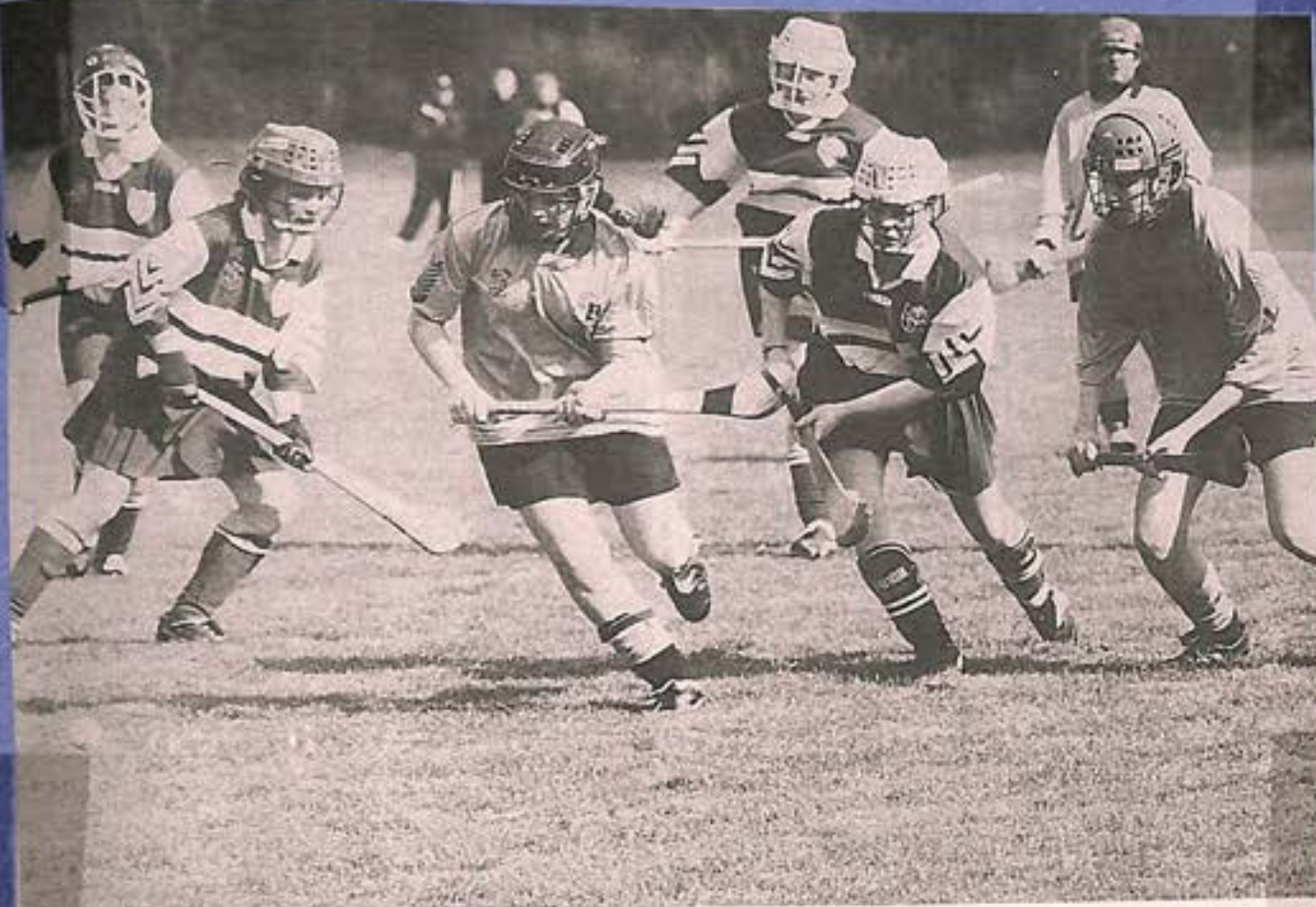
Action from the St. Mary's Charleville, versus St. Patricks of Derry All Ireland Camogie Semi Final which was played in Newtownshandrum.