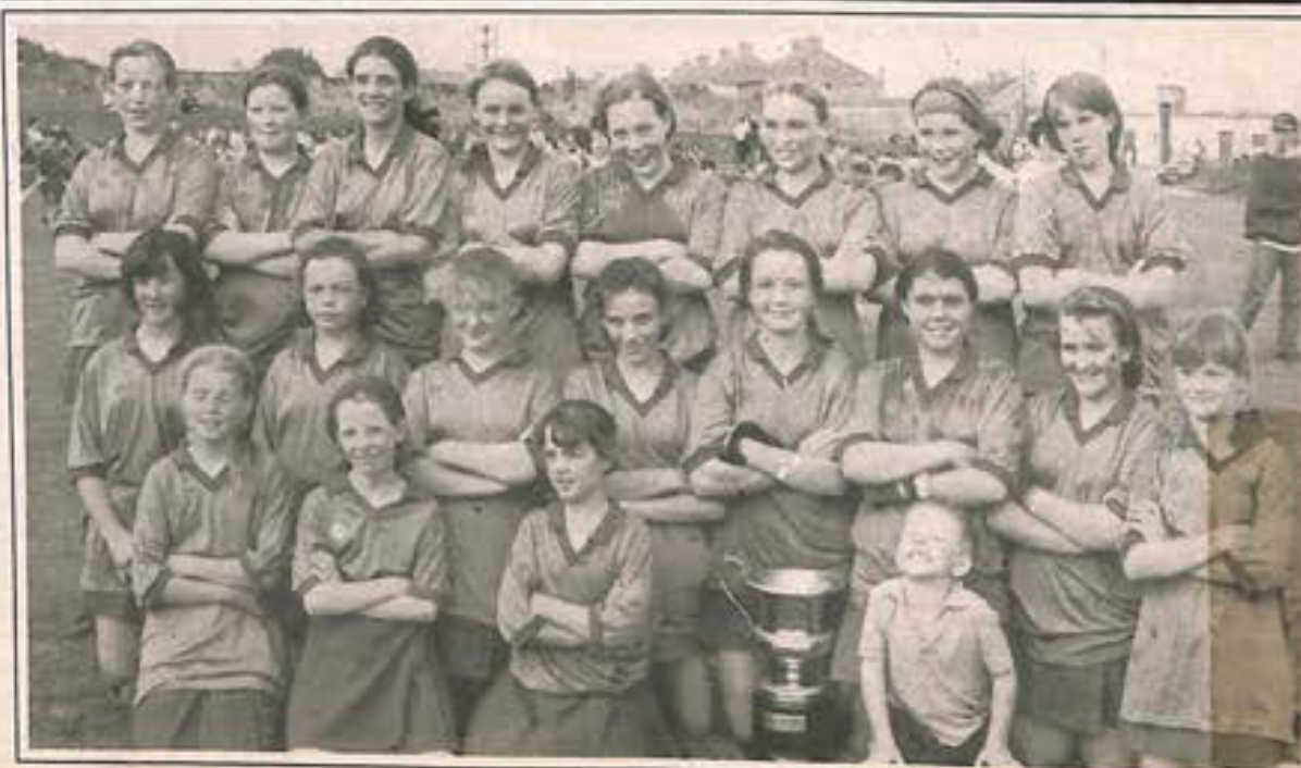
■ The St. Ibar's team that defeated Buffers Alley in the under-14 county camogie final