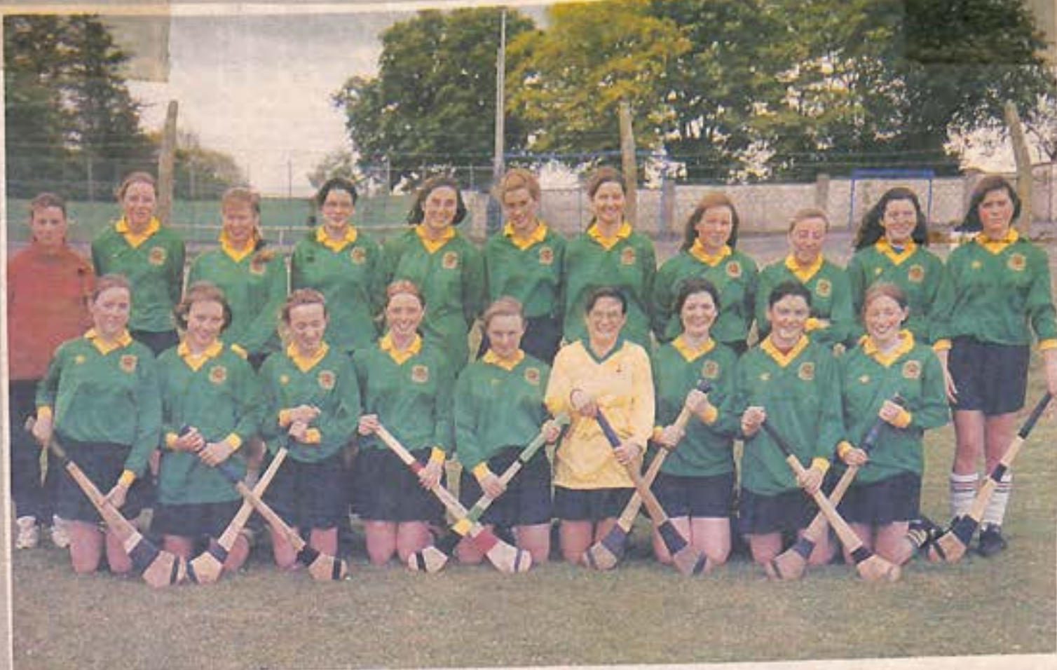
St Aidans College, Dublin Hill, runners-up in the Munster Colleges Intermediate Camogie League.