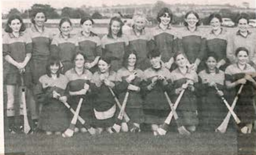
St Catherines who were runners-up in the U-14 B League.

Under-16 'B' League — Youghal v Sarsfield at Youghal (Ref. Sarsfield); Cobh v Fr. O'Neills at Cobh (Ref. Fr. O'Neills); Cloyne v Carrigtwohill at Cloyne (Ref. Carrigtwohill).