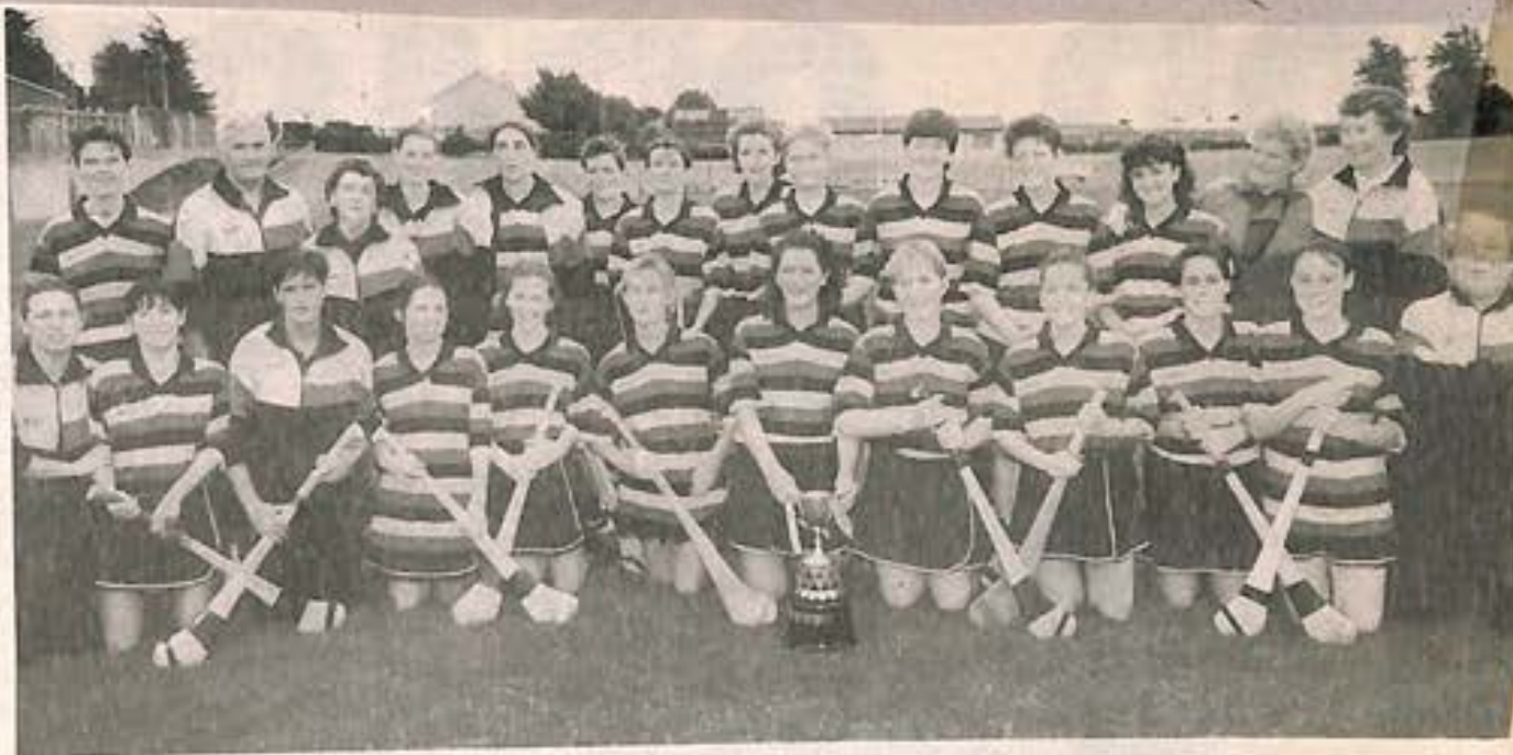
The Glen Rovers team which defeated Bishopstown in the Cork County Senior "A" Championship Camogie Final at Pairc Ui Chaoimh.