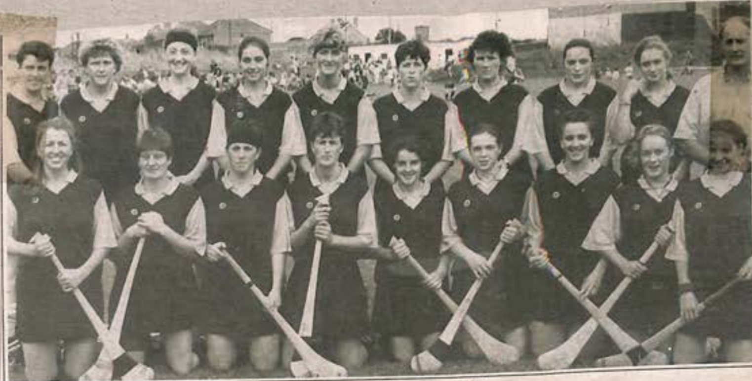
■ The Rathnure team that captured the county senior camogie title by defeating Oulart in a replay.

CAMOGIE REPLAY Rathnure regain crown in thrilling style