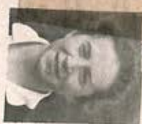
Minor girls make camogie history

Wexford's Minor camogie girls created history on Monday last when they scored a five-points victory over reigning champions, Galway, in an exciting All-Ireland final at Loughrea to take their first-ever title in the grade. SEE PAGE 43.