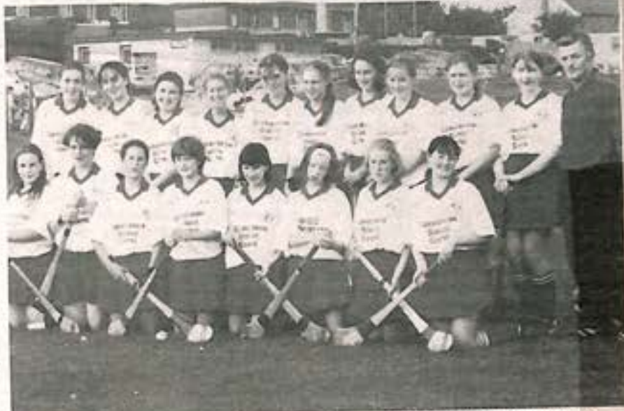
Ballygarvan who were league winners in the U-14 B League.

On form Sarsfields will probably start as slight favourites to advance.