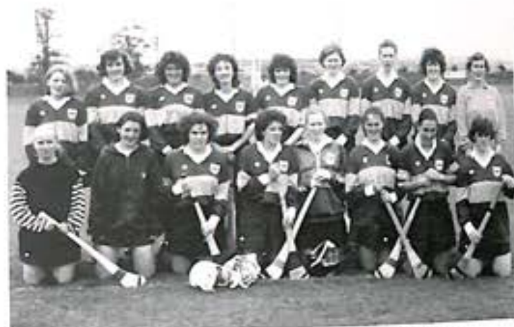
CASHEL - ANN FRASER CUP WINNERS 1992