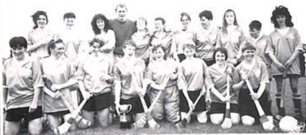
TOOMEVARA - SENIOR COUNTY CHAMPIONS 1992

The club would like to thank all sponsors, officers, supporters, parents and everyone involved in the club for their help during the year and we look forward to an even better year in 1993.