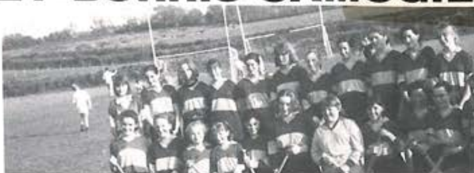
MOYCARKEY-BORRIS - Under-14 County Final B Winners

The U-14 team went one step further than the U-12s when they achieved an historic first ever under-age county championship for the club. En route to their title they recorded decisive victories over Roscrea, Templemore and Holycross. The actual final played against Kilruane McDonagh's in Ballycahill G.A.A. field was of a very high standard. Indeed, to the casual observer it provided ample evidence