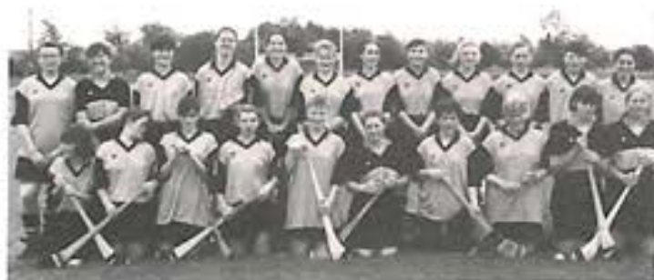
KILKENNY - Leinster Minor Camogie Champions 1992

Despite their ultimate defeat, great credit is due to the entire panel for their achievement in reaching a fifth successive All-Ireland against some very worthy opponents, for their