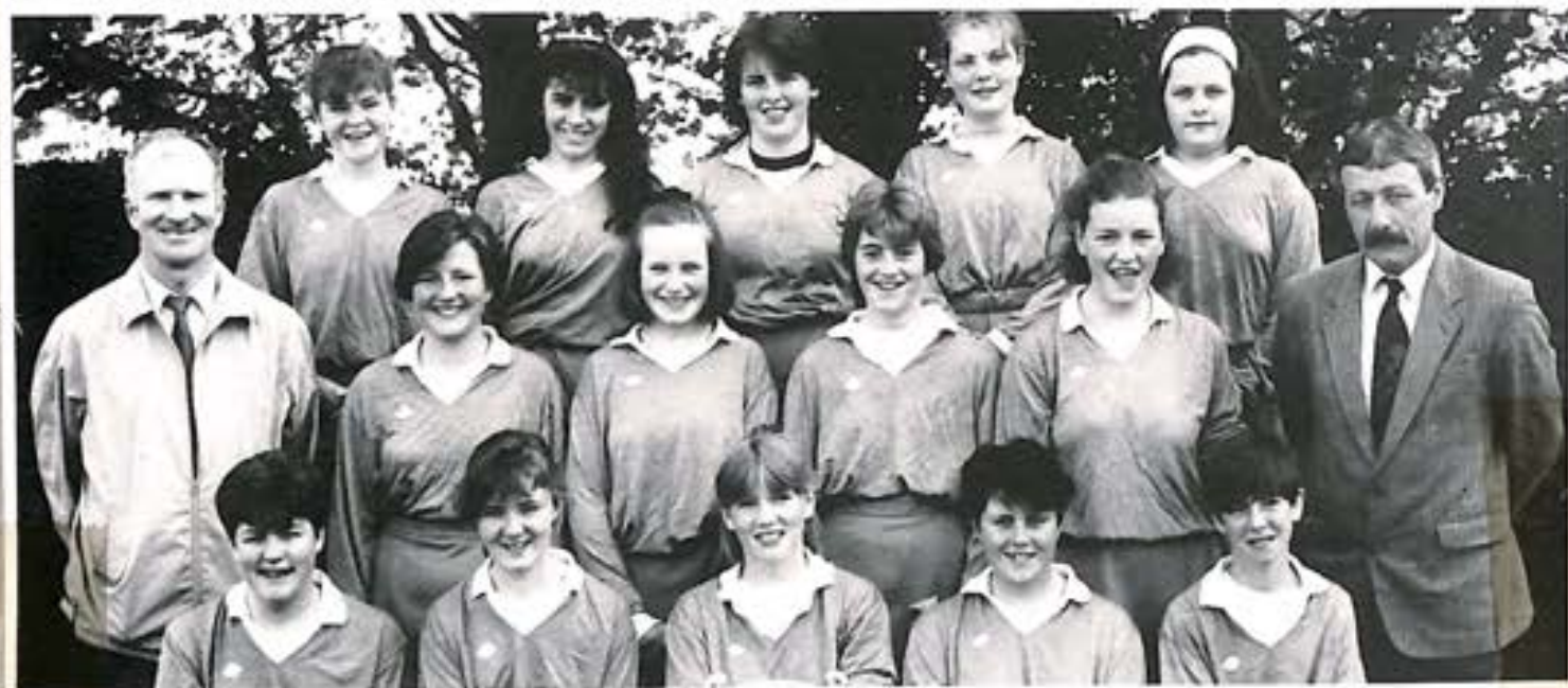
FETHARD U-14 TEAM - WINNERS OF COUNTY SCHOOLS 'A' CHAMPIONSHIP

All in all, a very enjoyable year in camogie circles in Fethard school.