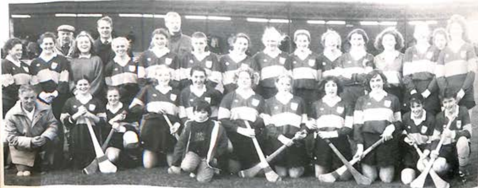
CASHEL - U-16 COUNTY CHAMPIONS 1992