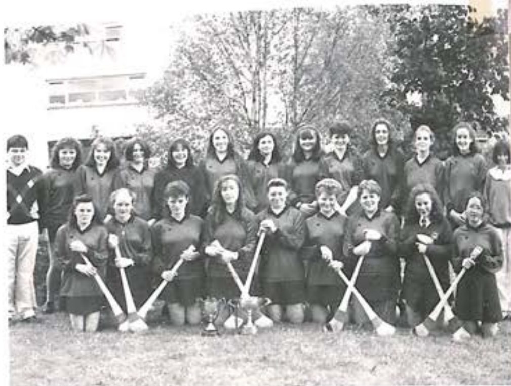
ST. MARY'S, NENAGH - Junior All-Ireland Champions 1992

Overall it has been a year of huge success for camogie in St. Mary's with the school winning five cups in all - three Munster and two All-Irelands. With most of our talented young players available to