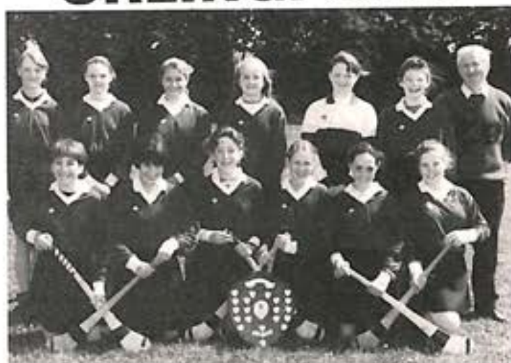
EMERALDS, URLINGFORD – Camogie County Champions 1992