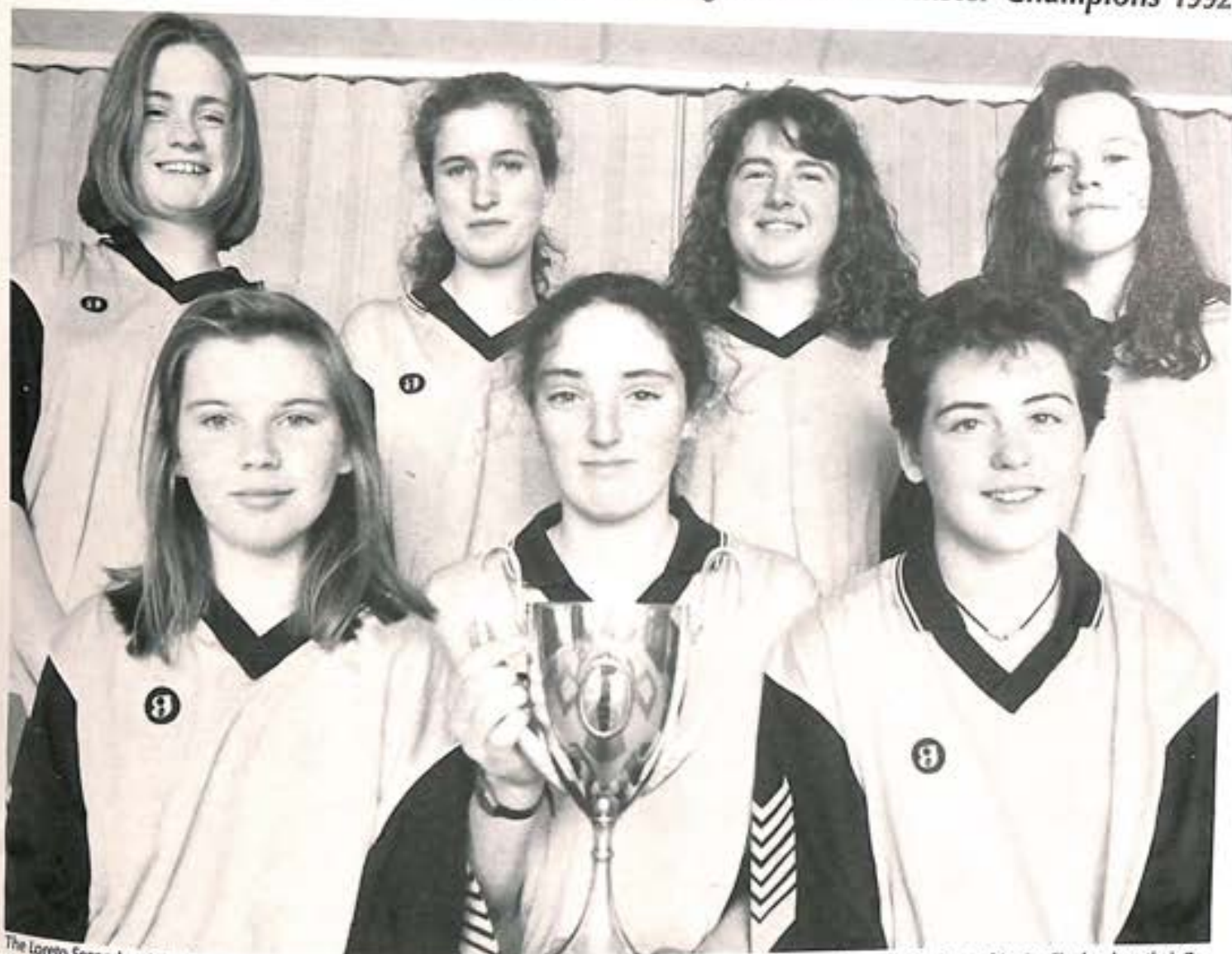
The Loreto Secondary School gained a small measure of compensation for their defeats in the Leinster Colleges Camogie Senior and Junior Finals when their 7-a-side team defeated Castlecomer C.S., Presentation S.S. and Thomastown V.S. to win their first title in this grade.