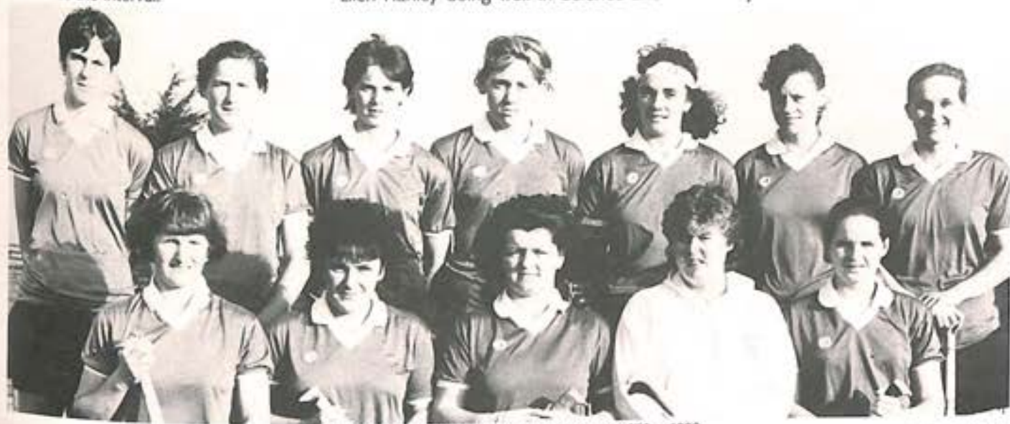
BALLYCALLAN SENIOR COUNTY CAMOGIE FINALISTS - 1992