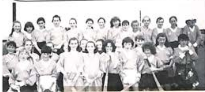
SIX IN A ROW