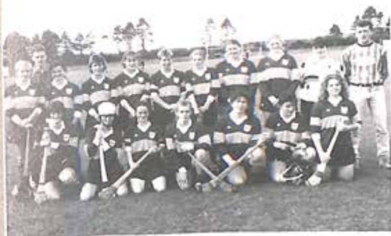
JOHN HOGAN CUP WINNERS 1992