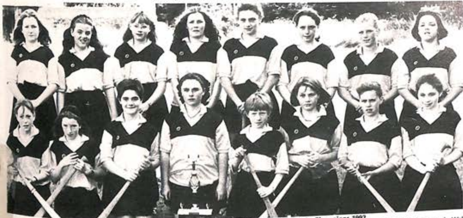
SCOIL LACHTAIN, FRESHFORD – Primary Schools' Roinn 'A' Camogie Champions 1992