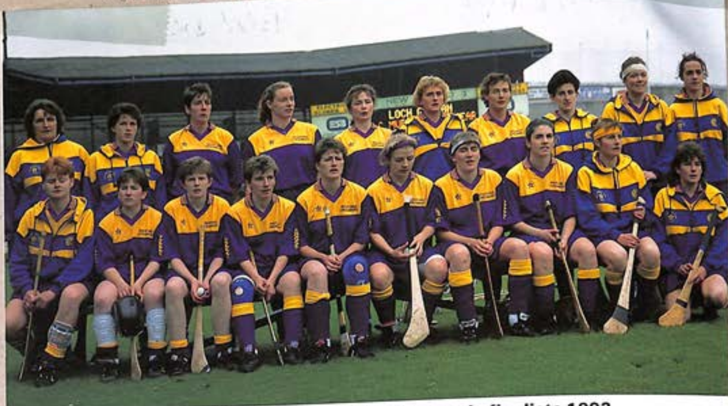
WEXFORD - All-Ireland Senior camogie finalists 1992