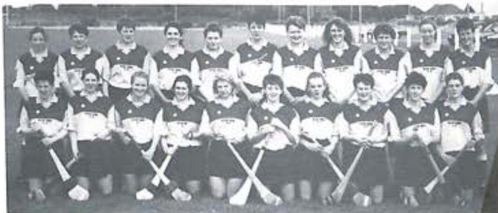
Wexford Senior squad, defeated by Kilkenny in the All-Ireland final and hoping for revenge