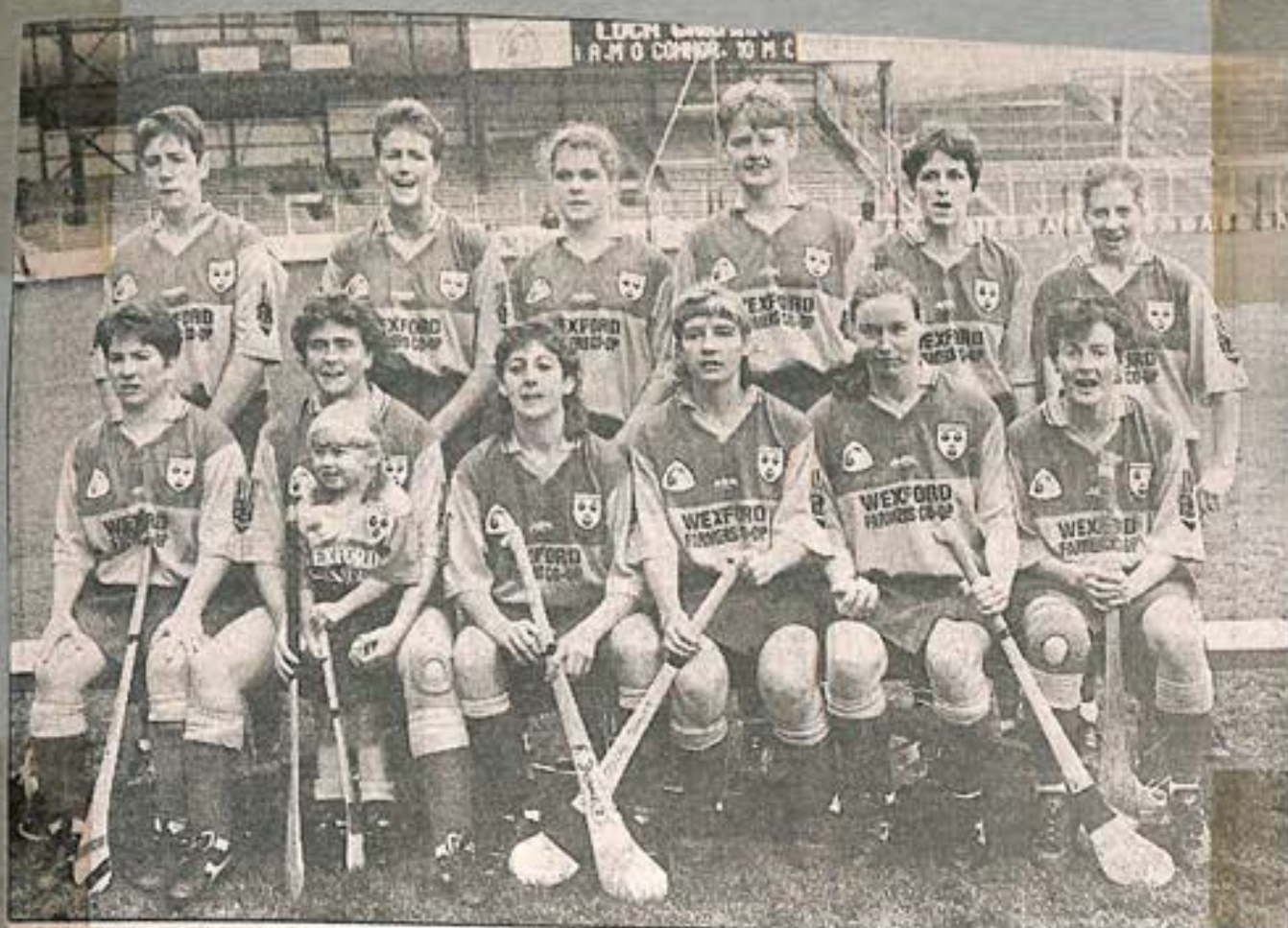
The Wexford team who were beaten by Kilkenny in the All Ireland Camogie Final at Croke Park on Sunday.