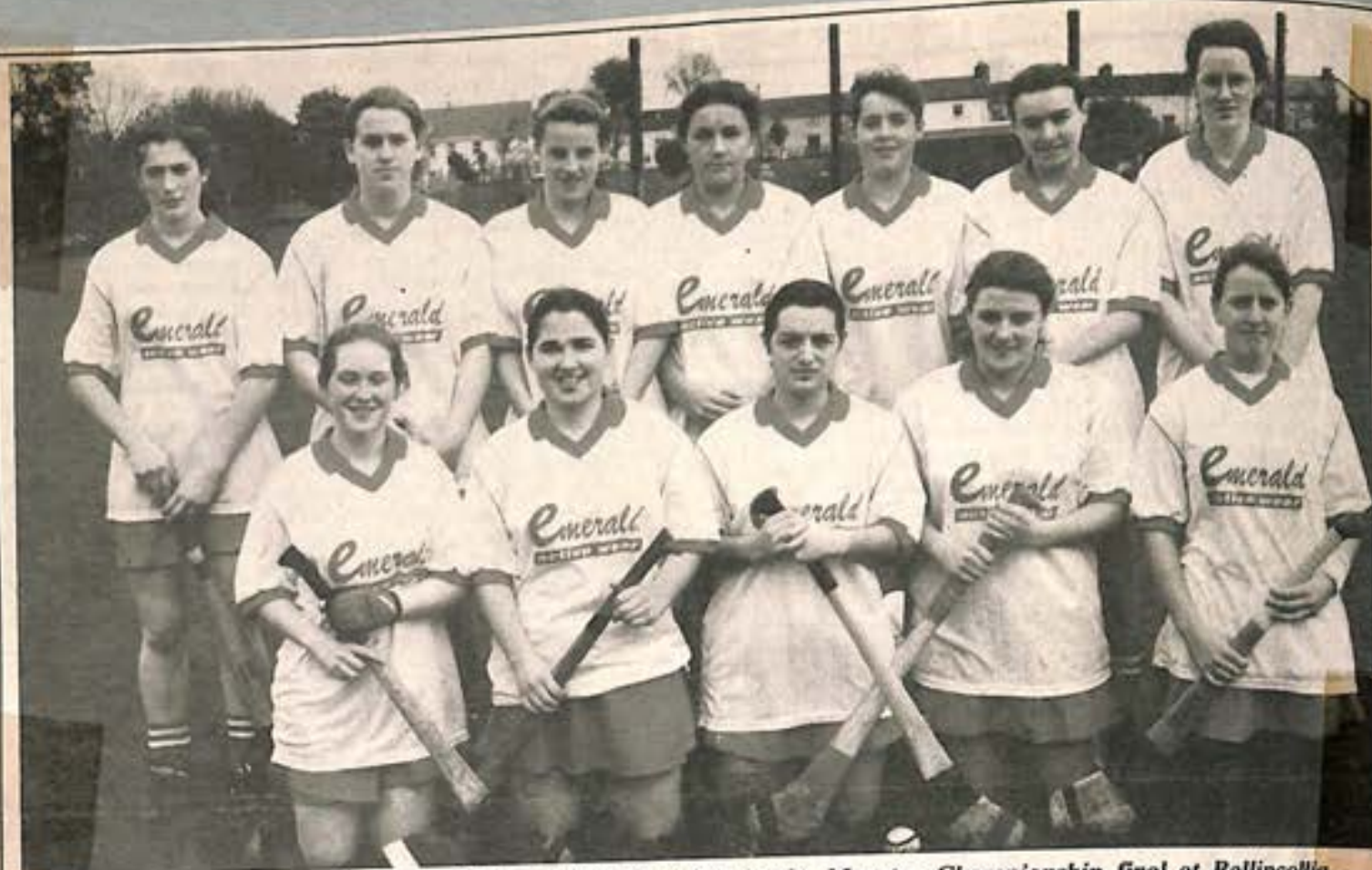
The Cork U-18 camogie team which defeated Limerick in the Munster Championship final at Ballincollig.