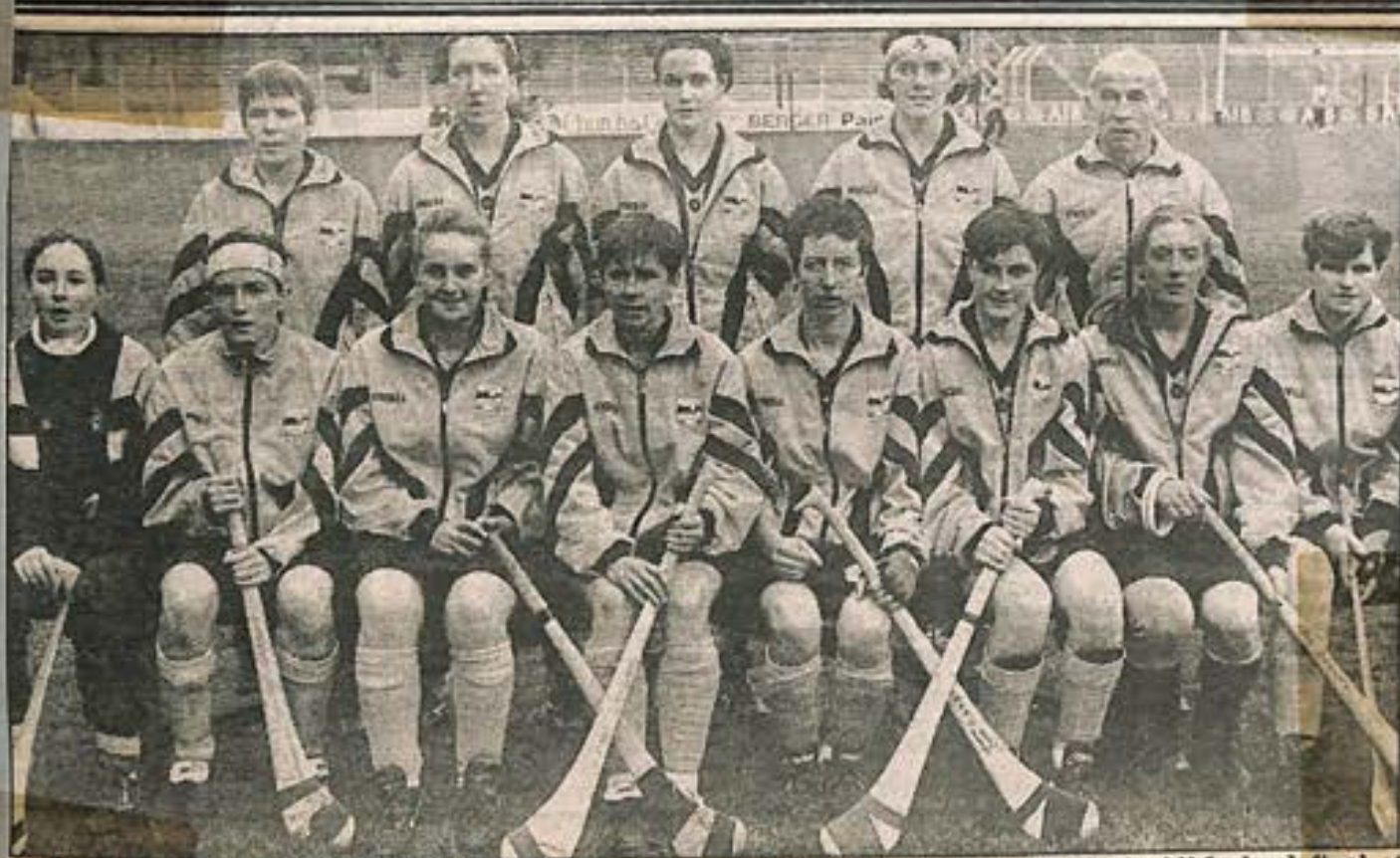
● CHAMPIONS . . . the Kilkenny Camogie team who defeated Wexford in yesterday's All-Ireland final at Croke Park. Report on page 47.