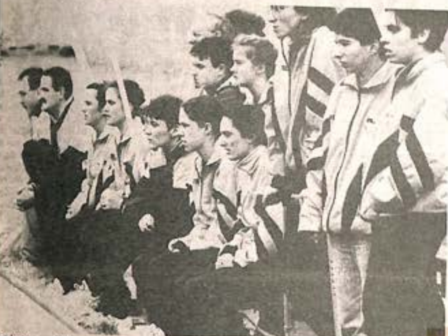
Not happy . . . Kilkenney selectors and substitutes looking worried as their team is overhauled by Wexford.