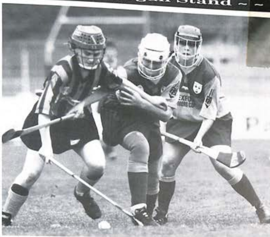
Action from the All-Ireland Senior Camogie Final in which Kilkenny defeated a gallant Wexford outfit

In the end it was only two points that separated them,