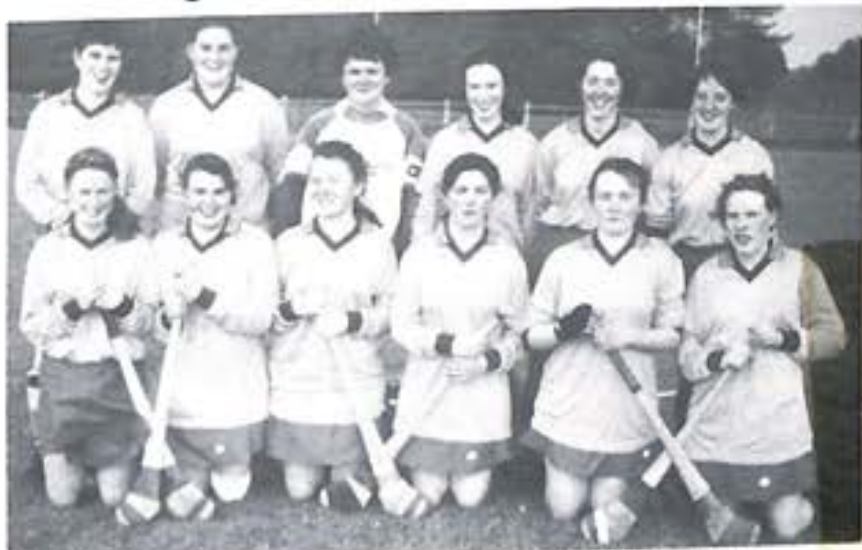
Roscommon team defeated by Galway in the Connacht final