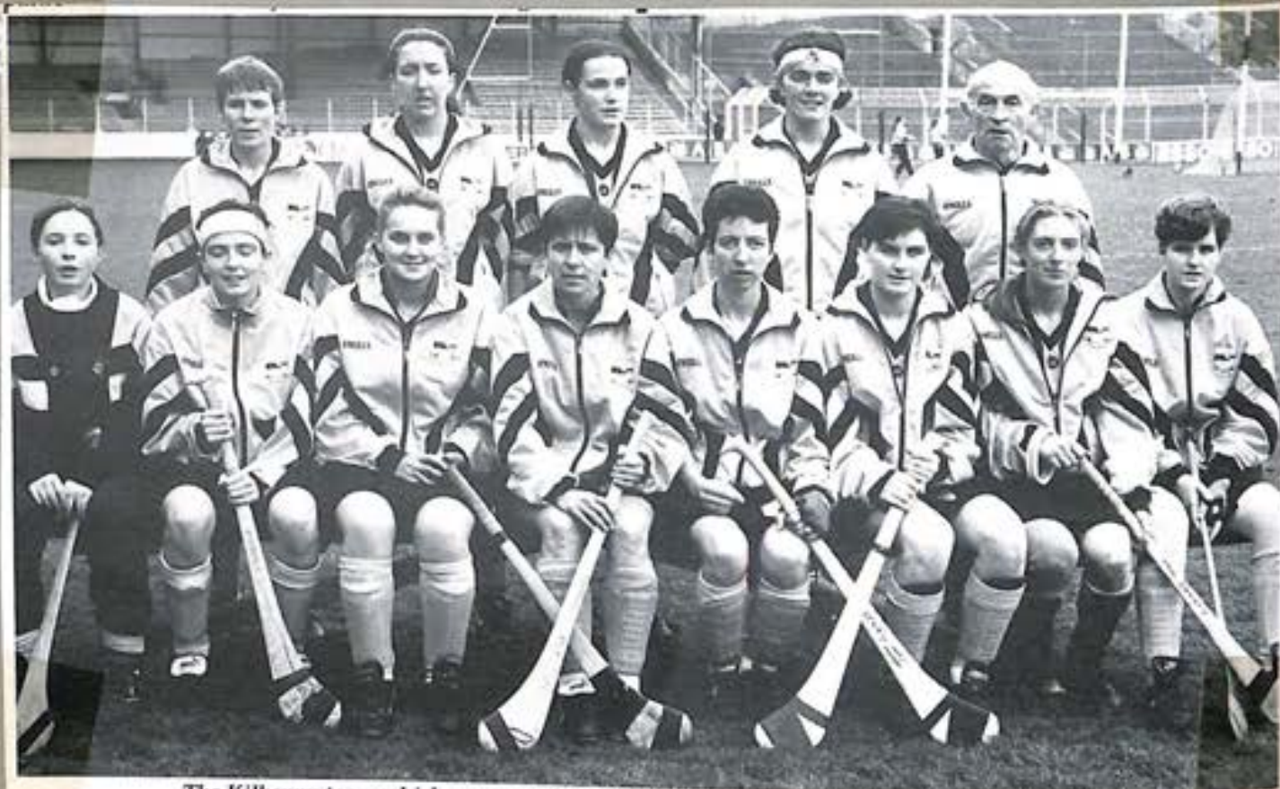
The Kilkenny team which overcame Wexford in this year's All-Ireland Senior camogie final