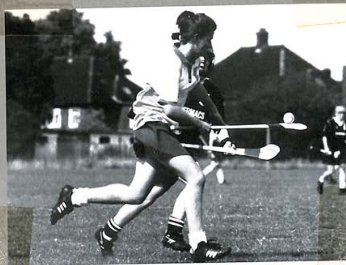
All-Ireland Championship Junior Semi-Final - London v An Ghaillimh