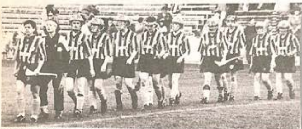
Marching To Victory.. The Kilkenny camogie team parading before the All-Ireland at Croke Park.