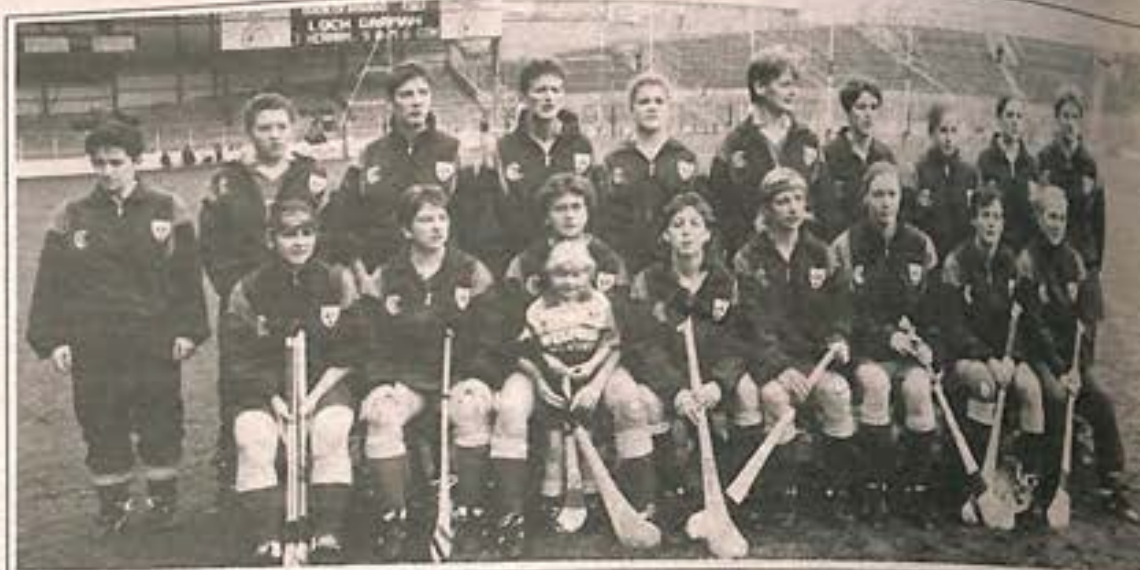
■ The Wexford panel, beaten by Kilkenny in the All-Ireland camogie final at Croke Park on Sunday.