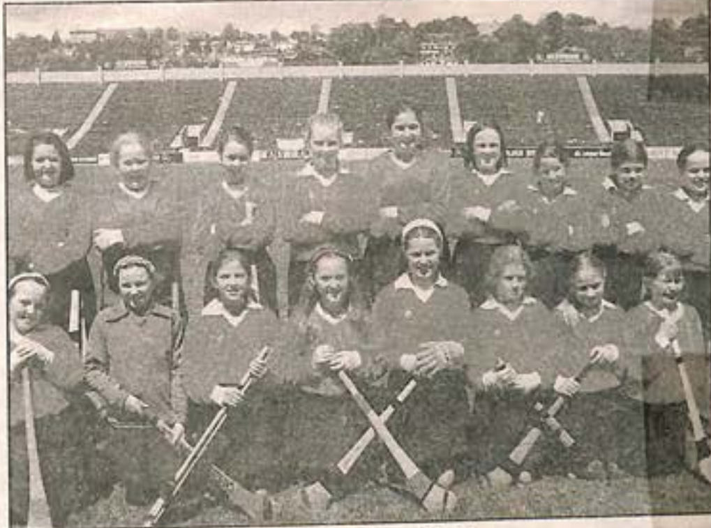
Berrings NS who were beaten in the Roinn 7 Camogie final.