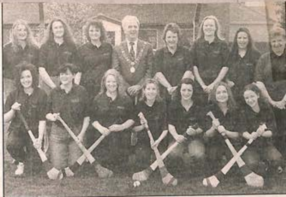
Brian Dillons Camogie Club on their recent trip to London.