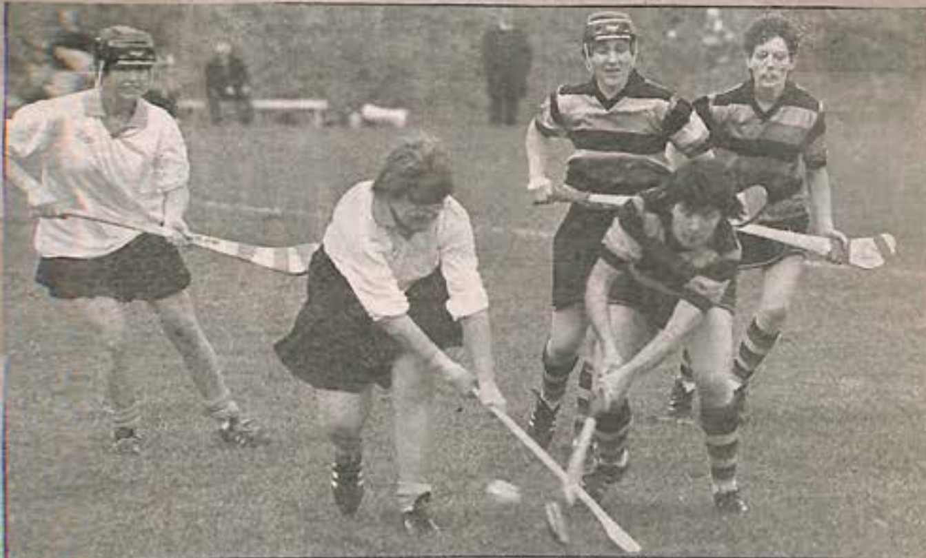
Action from Glen Rovers historic victory over St Pauls from Kilkenny in the All Ireland camogie club final