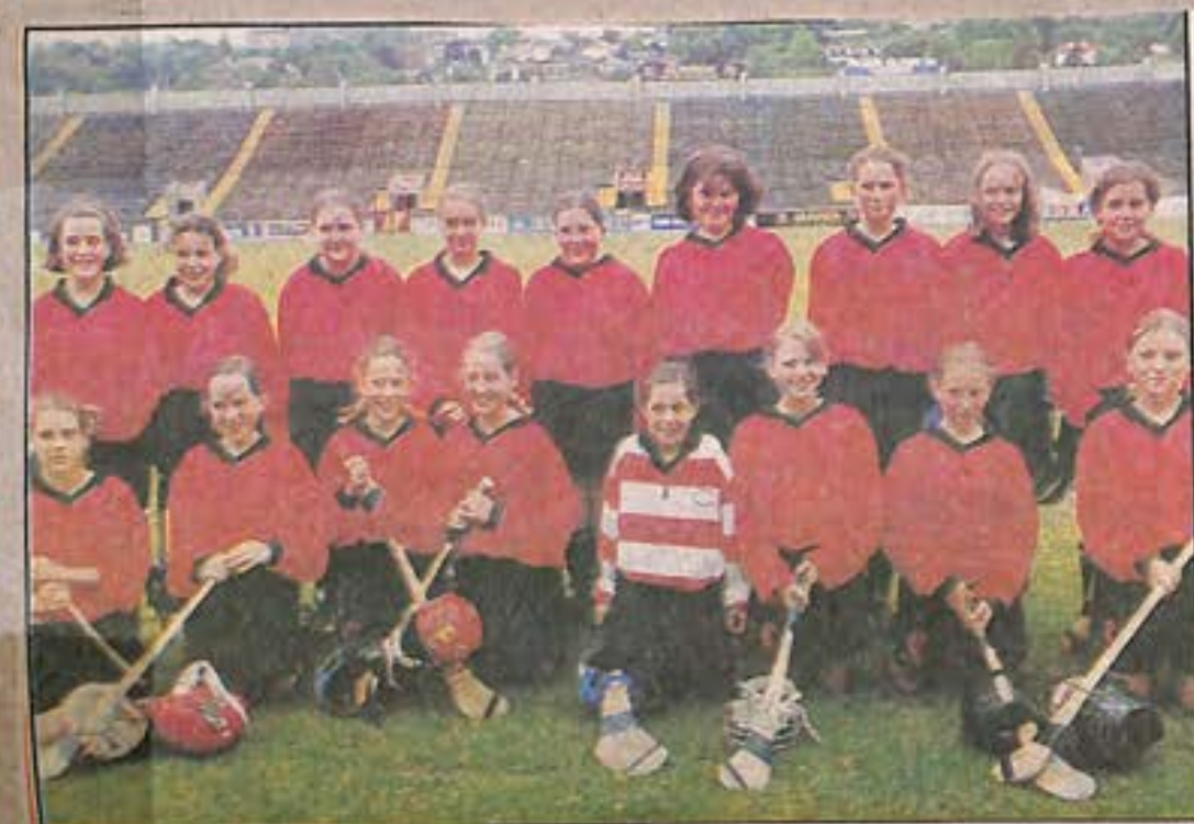
Riverstown NS who won the Roinn 3 Camogie title.