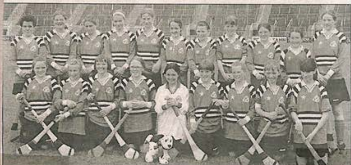
■ St. Columba's Douglas who lost to Scoil Oilibhéir 2-1 to 1-0 in the final of Roinn 1 Sciath na Scol Camogie.