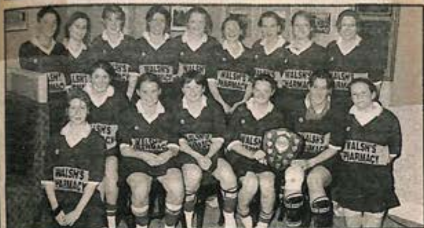
Carrigaline, winners of the Cork county under 16 league final.