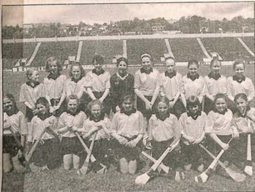
Glenville NS who won the Roinn 7 Camogie title.