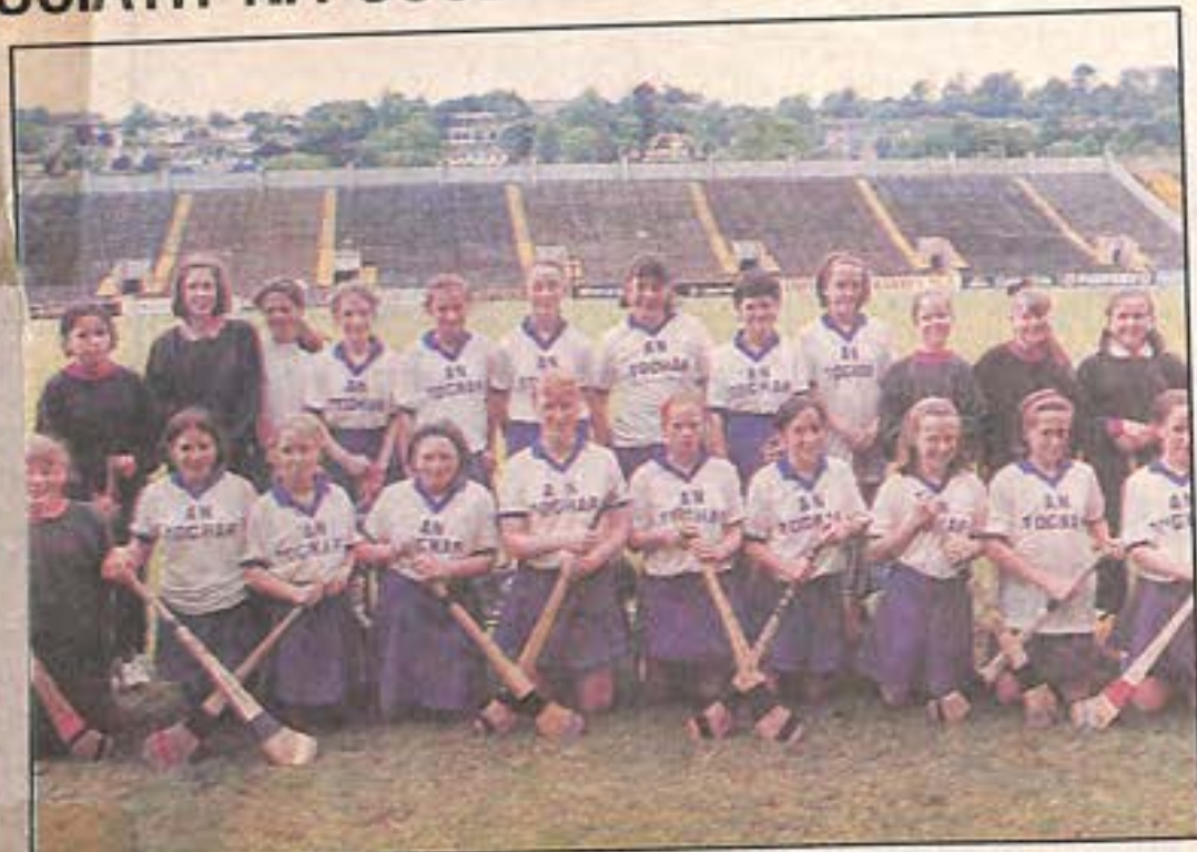
Togher NS winners of the Roinn 2 Camogie title.