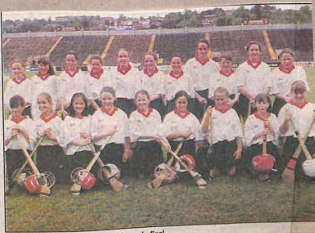
Mayfield NS who lost the Roinn 3 Camogie final.