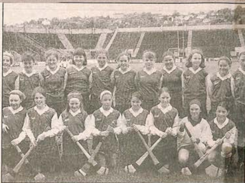
Aghabullogue NS who were defeated in the Roinn 4 Camogie final.