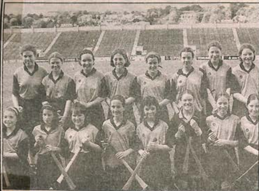
Barryroe NS who won the Roinn 6 Camogie title