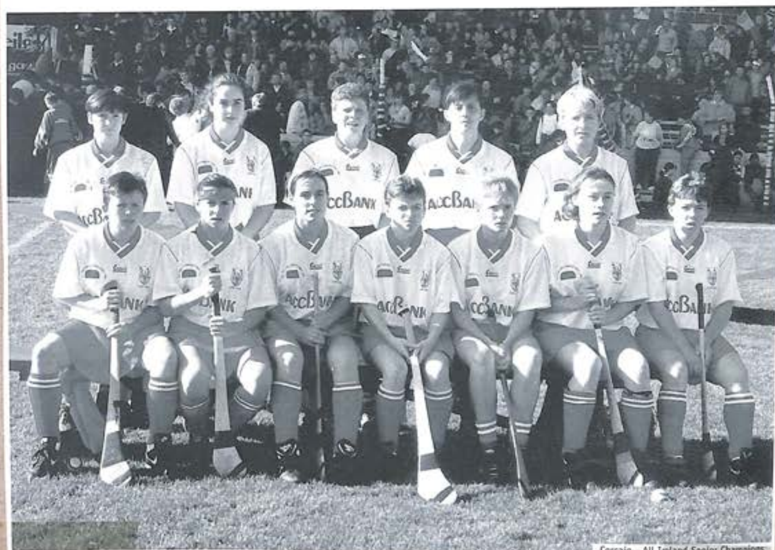
Corcaigh - All-Ireland Senior Champions