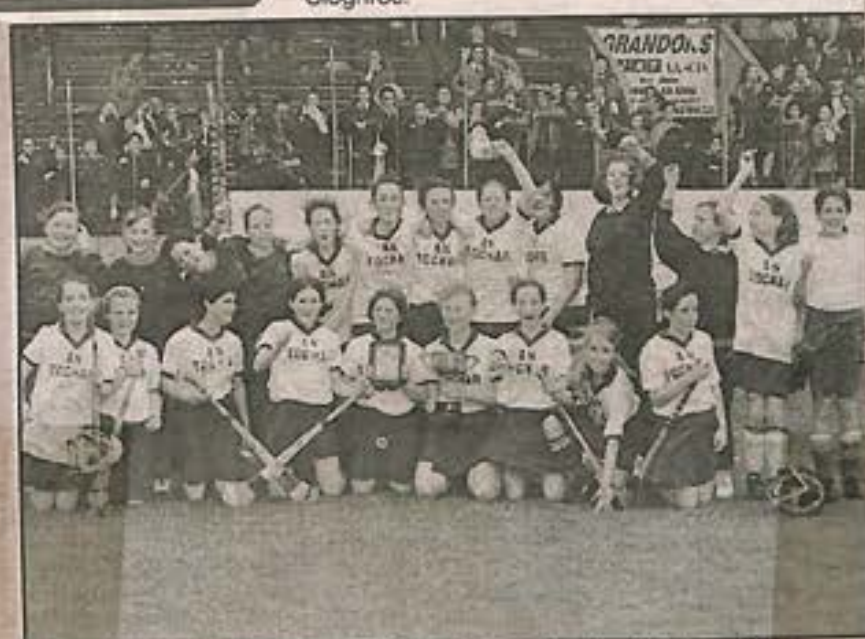
■ Togher N.S. girls celebrate their Roinn 2 victory in the Sciath na Scol Camogie Finals at Páirc Uí Chaoimh.

Roinn 7: Glennville 3-1 Berrings 1-0 Roinn 6: Barryroe 8-8 Ballinspittle 1-0 Roinn 3: Riverstown 2-0 Scoil Mhuire, Banríon, Mayfield 1-2 Roinn 1: Scoil Oilibhéir 2-1 Scoil N. Columba, Douglas 1-0 Roinn 4: Ballygarvan 6-2 Aghabullogue 0-0 Roinn 5: Ballyhoda 4-1 Dripsey 0-0