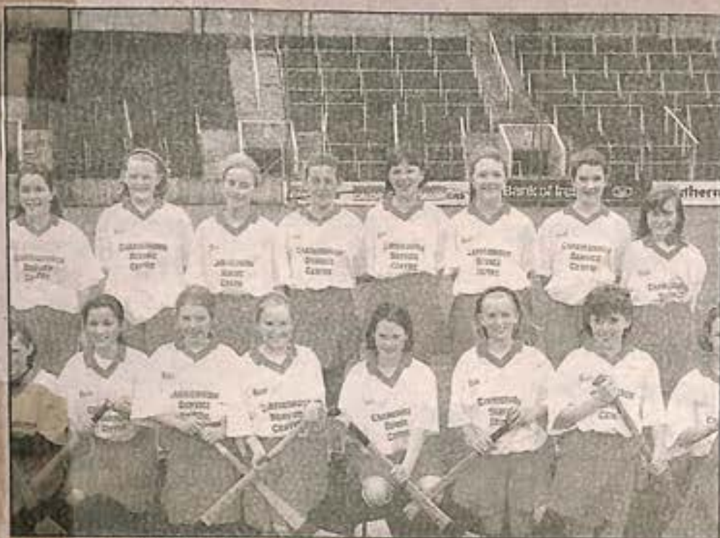
Ballygarvan NS winners of the Roinn 4 Camogie title.