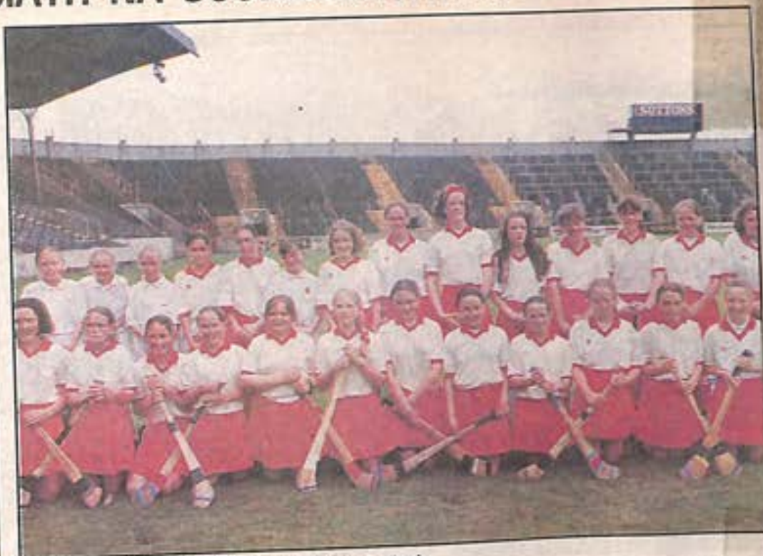
Cloghroe NS beaten in the Roinn 2 Camogie final.