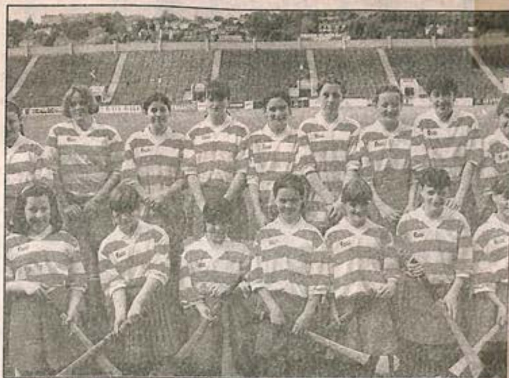
Ballinspittle NS who lost the Roinn 6 Camogie final.