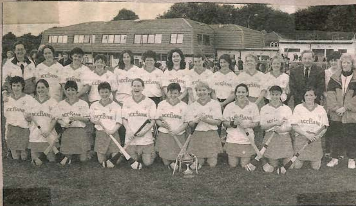
The Cork camogie team who captured the National league title yesterday at the expense of Galway