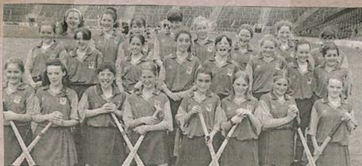
■ Scoil Oilibhéir Section 1 winner of the Camogie Sciath na Scol finals at Páirc Uí Chaoimh.