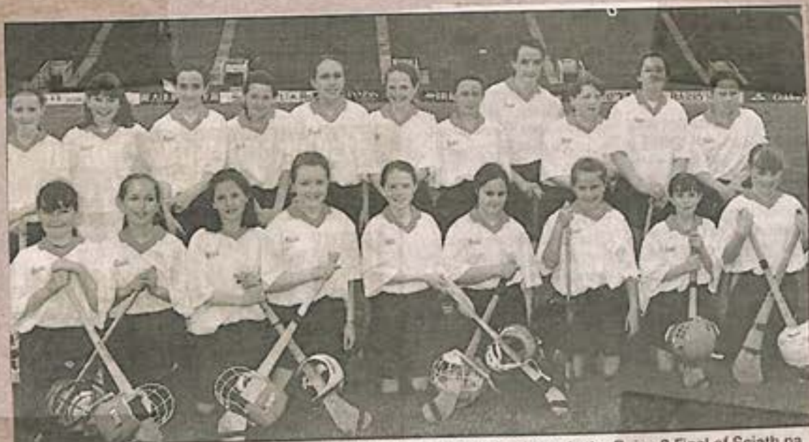
■ Scoil Mhuire Balaíon Camogie Team, Mayfield, who lost to Riverstown in the Roinn 3 Final of Sciath na Scol.