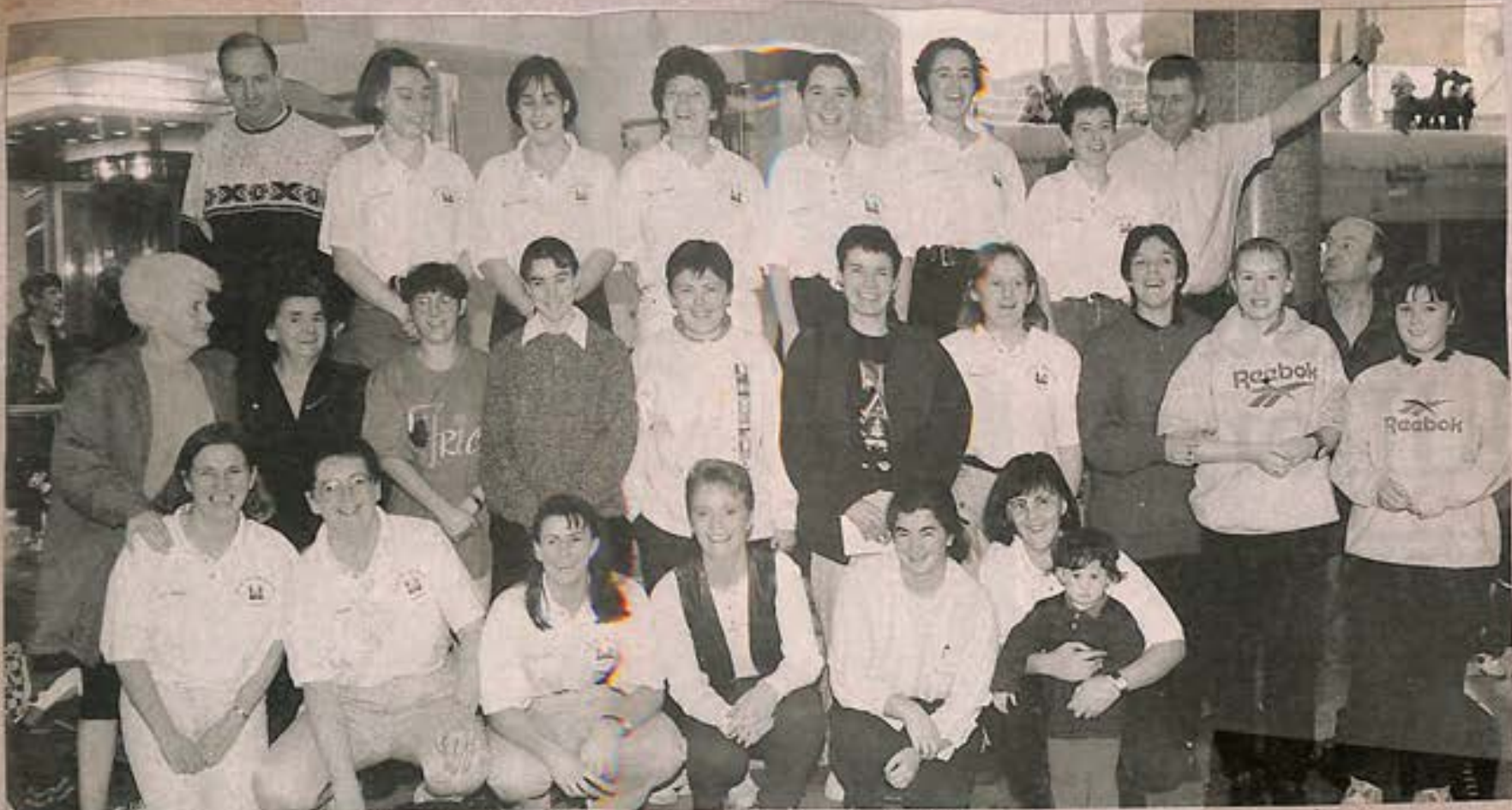
The Cork Camogie Team, the All-Ireland champions, pictured at Cork Airport before departing for holidays in the Canary Islands.