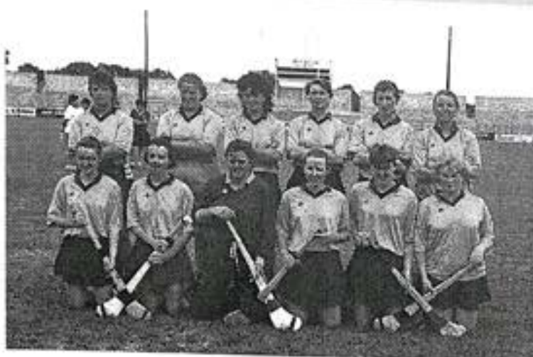
The Clare Senior Camogie team which lost to Cork in the Munster Championship.

After a good win over Whitegate in early Summer, our U 16 team had a long