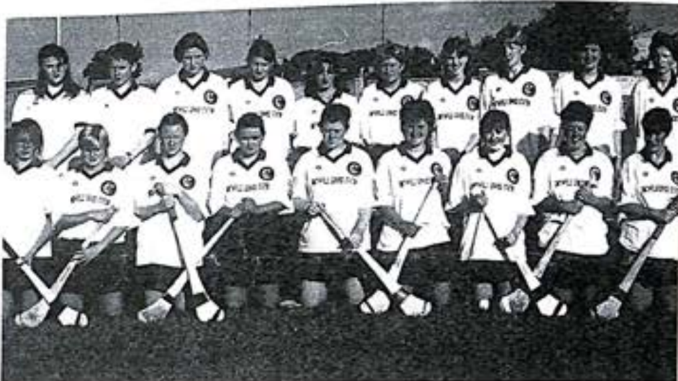
Croagh/Kilfinny Co. Senior Champions