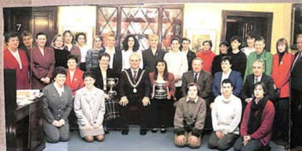
7. The Cork Senior Camogie Team in celebratory mood after the Civic Reception to mark their All Ireland Victory