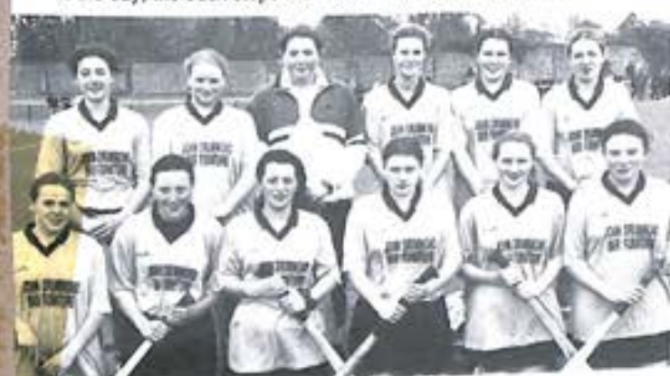
The 1994 Brian Dillons Minor camogie outfit, beaten Championship finalists.