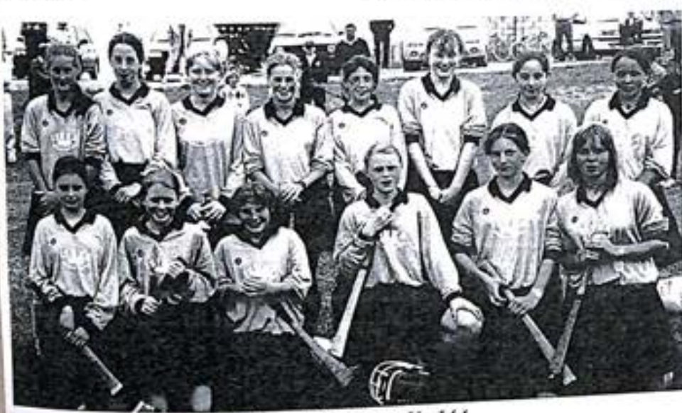
Na Piarraigh Runners Up U14A

Knockaderry won the final but hard luck to Galbally who are also a new club to this age group. Well done to both teams.