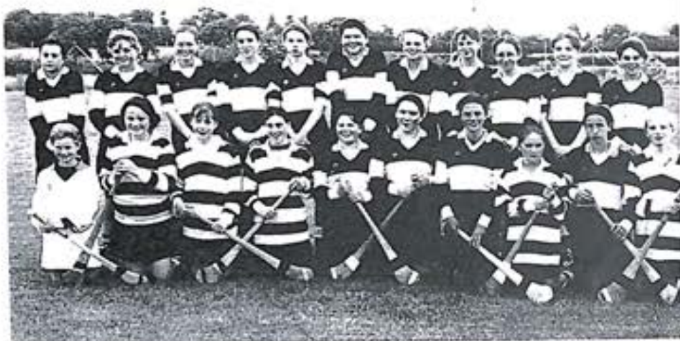
Granagh - Ballingarry U-14 Co. Champions

Ballyagran, Bruff, Granagh/Ballingarry, Killeedy, Newtownshandrum and Croagh/Kilfinny. Each team had five games, the two top teams in the final.