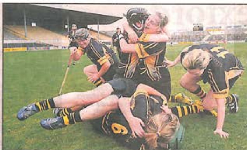
Kilkenny celebrate after their victory over Galway in the National League Division One camogie final at Nowlan Park, Co. Kilkenny.

Really, this was the difference. Leaking three goals was trouble for Galway and put them under a lot of pressure.