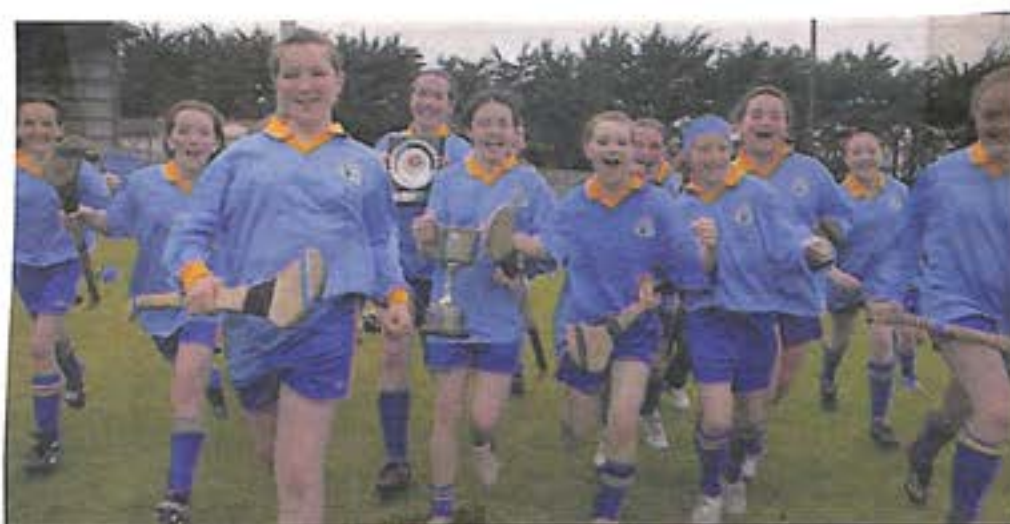
Victory lap of honour for Carrigaline Gaelscoil girls.