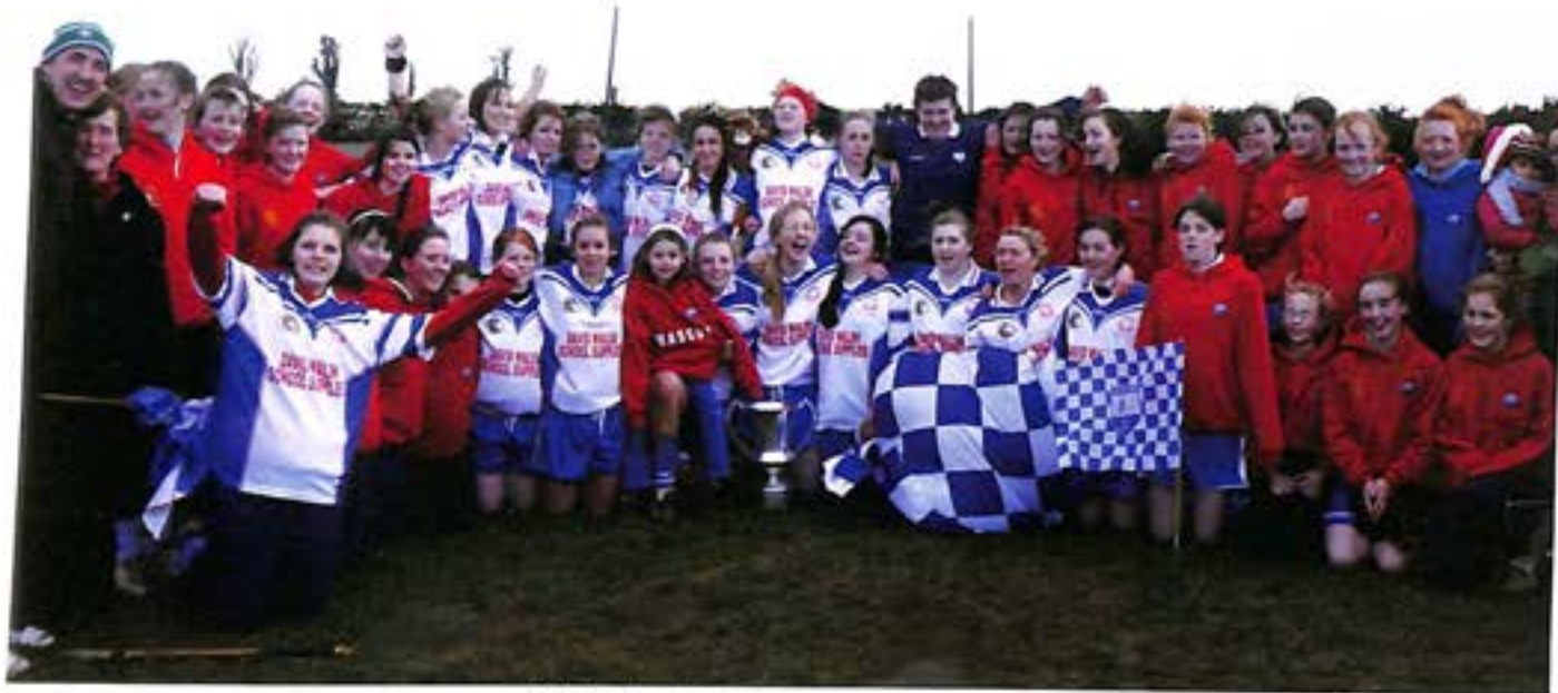
All-Ireland senior camogie winners, Blackwater C.S