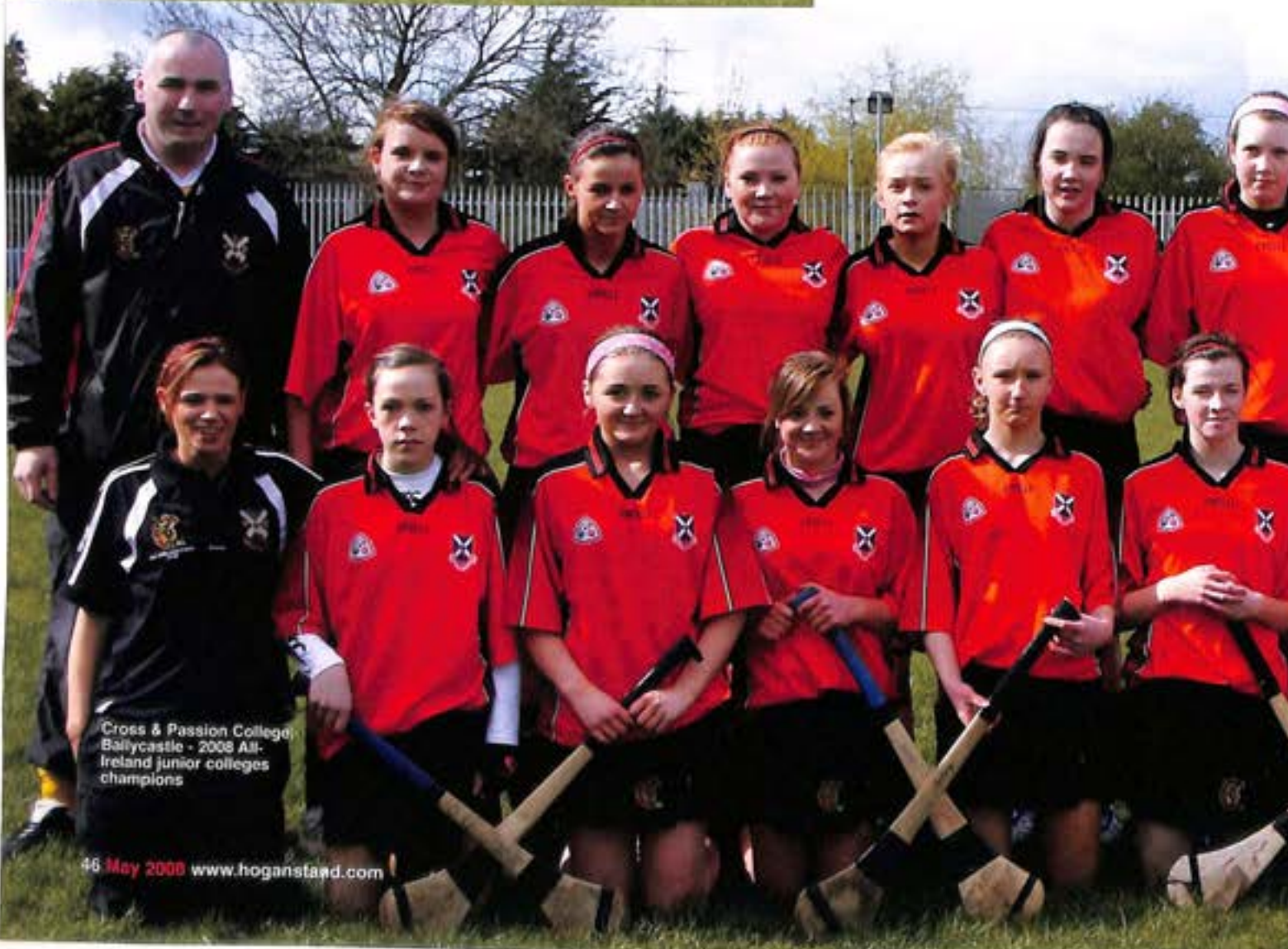
Cross & Passion College, Ballycastle - 2008 All-Ireland junior colleges champions

CPC is also a centre of excellence for learning and