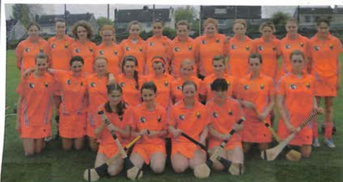
Cork under 16 team who defeated Clare last weekend