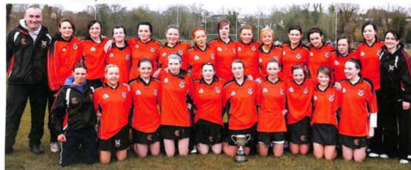
The CPC side that captured Corn Elmhear (Ulster U16 Colleges)