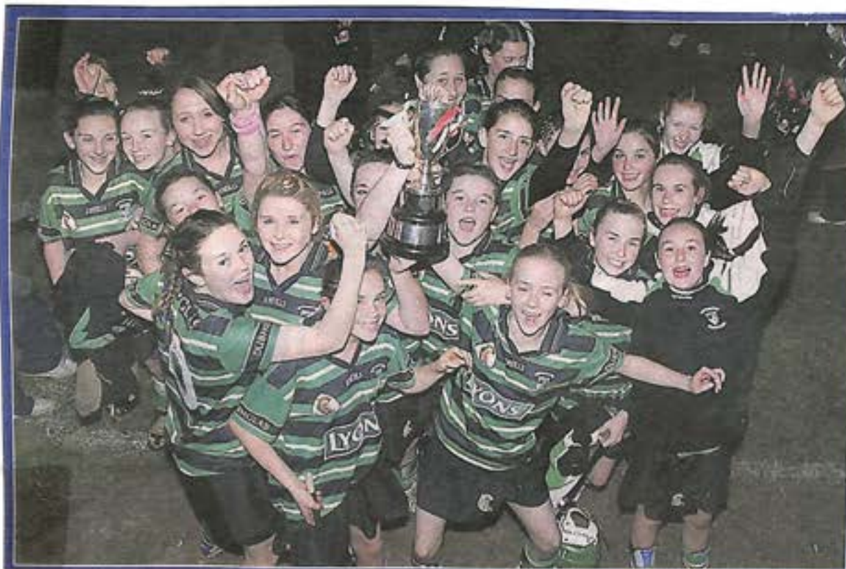
The Douglas camogie team celebrate defeating Courcy Rovers in the Cork Division One Féile na nGael final at Ballinlough last night. See page 49 for full match report.