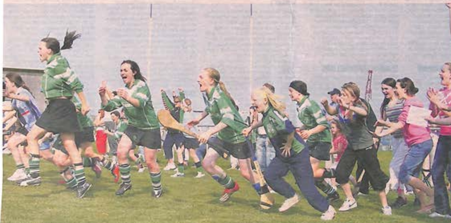
CHARGE OF THE LUCAN BRIGADE: Sarsfields celebrate after claiming their first Féile na nGael Division 1 title.