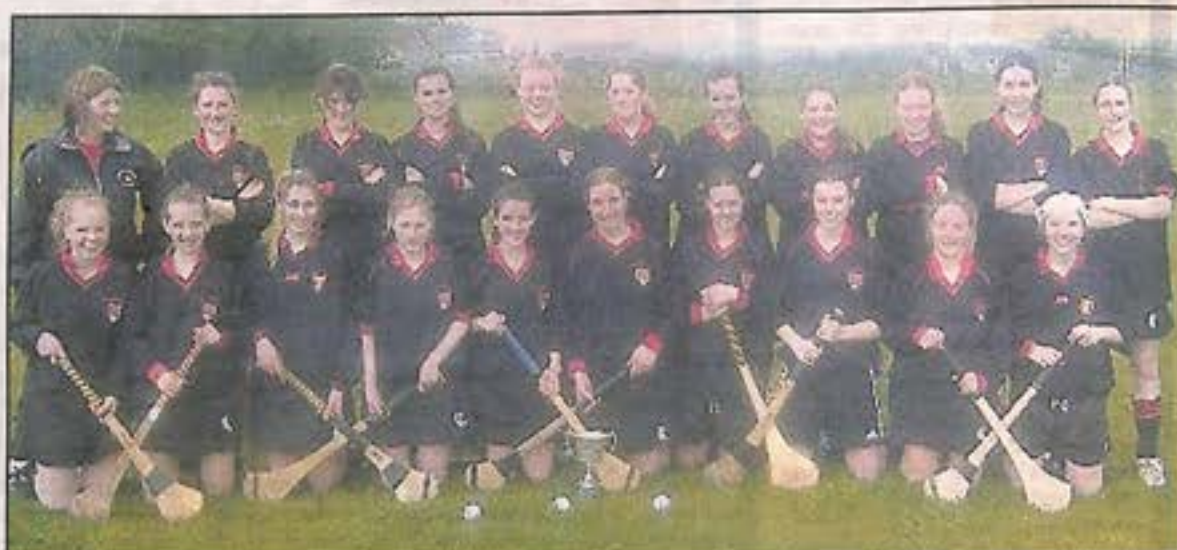
The Coachford team which defeated St Mary's, Charleville, in the Cork Colleges Senior A Camogie final held at Mallow yesterday.