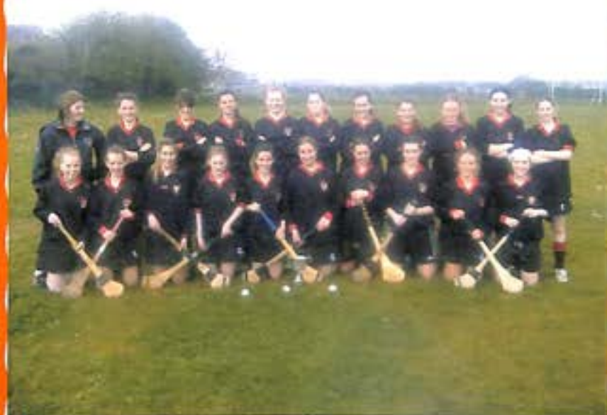
Coachford Senior College who won the Cork Colleges Senior Final recently.

Munster U18 Final Clare v Cork, @ Clarecastle, Wed May 14th,