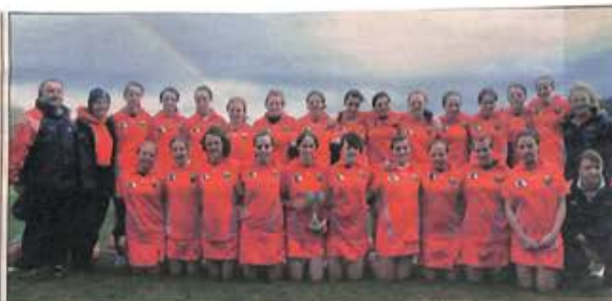
Cork under 16 A Munster champions

Twice Tipp came close to grabbing an equaliser in the four minutes of added time but Cork held out to book their place in the Munster final where they will meet Clare or Limerick.