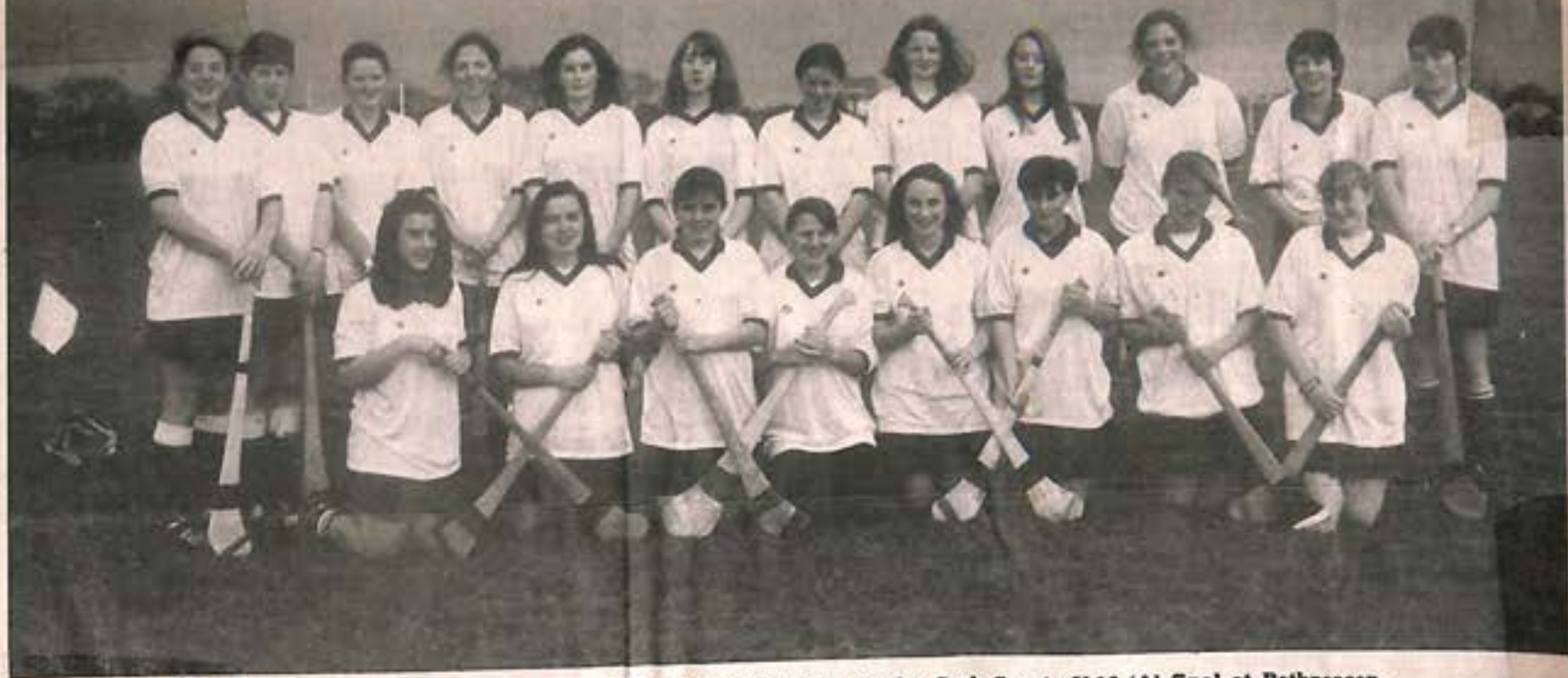
The Inniscarra U-16 camogie team which defeated Killeagh in the Cork County U-16 'A' final at Rathpeacon.