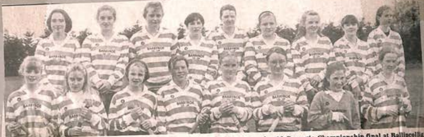
Courcey Rovers, who had a one point win over Bandon, in the Cork County under 16 Camogie Championship final at Ballinscollig.