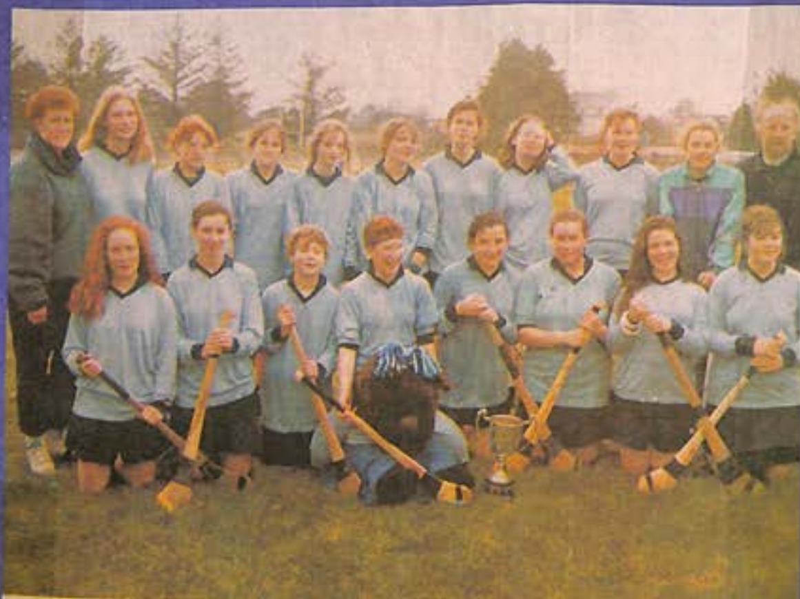
St. Mary's, Charleville, pictured at Whitegate, Co. Cork, after defeating Scariff Community School in the Munster Senior Camogie final.

At Santry — Shield final 1.0. Cup final 2.30.