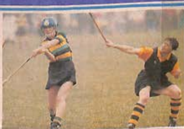
■ Action from the match

■ GLEN Rovers beat Rathnure in the All-Ireland senior camogie final in Cork yesterday.