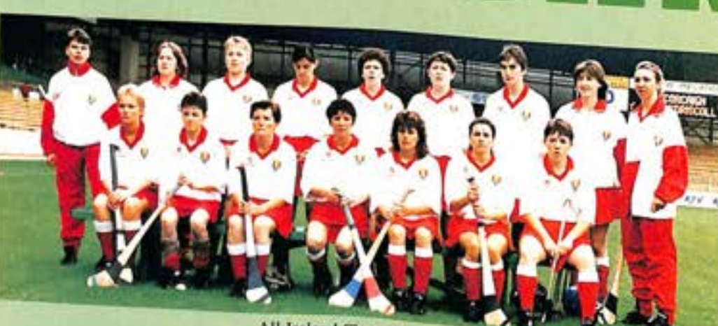
All-Ireland Champions Cork