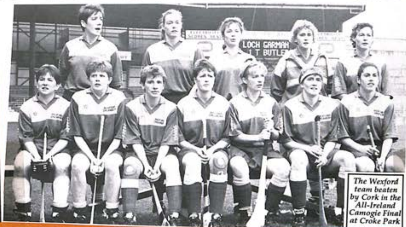
The Wexford team beaten by Cork in the All-Ireland Camogie Final at Croke Park