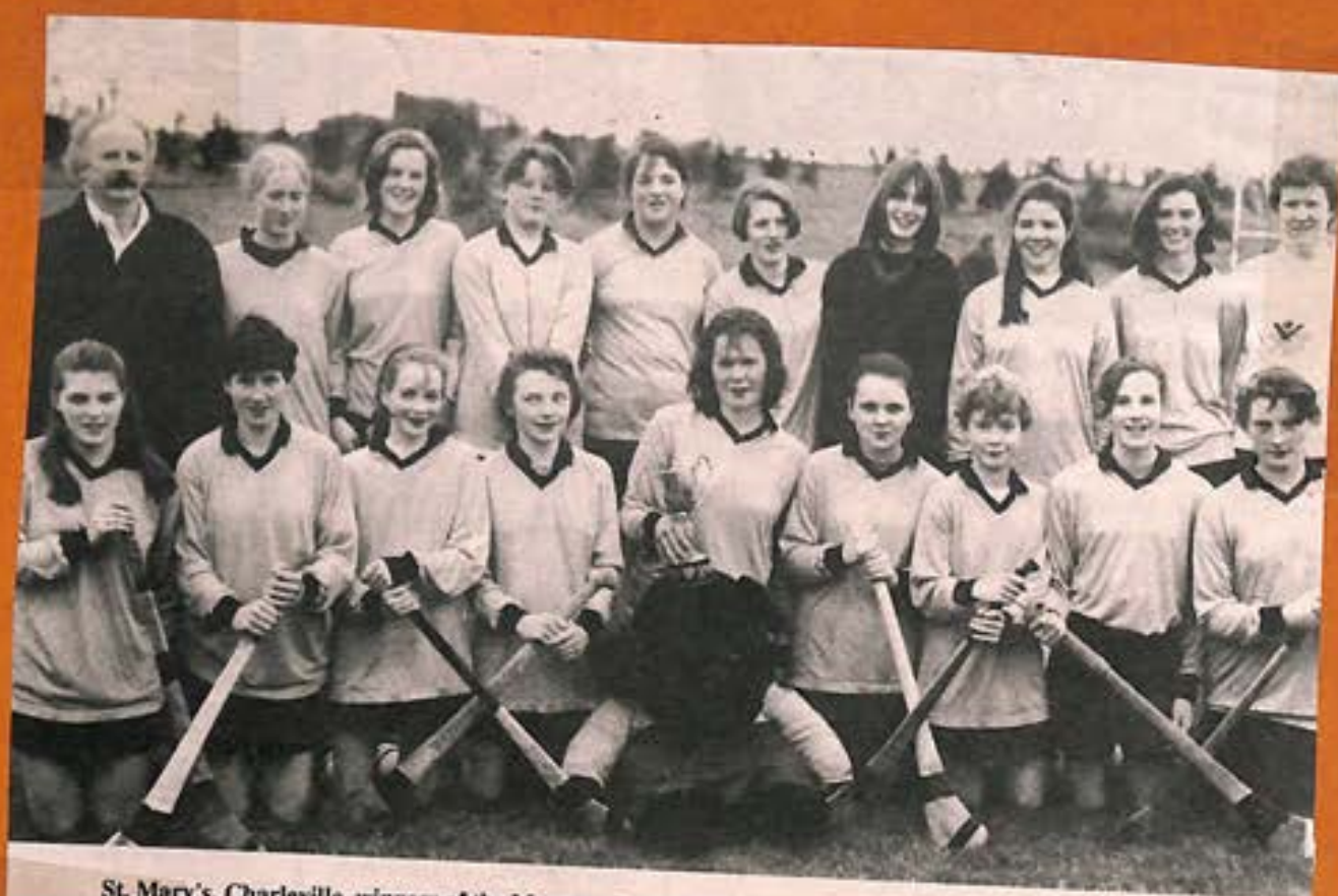
St. Mary's, Charleville, winners of the Munster Colleges Junior Camogie Final at Newtownshandrum.