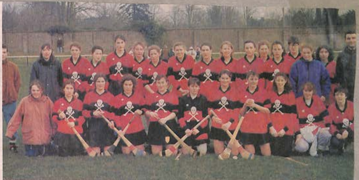
The UCC team which defeated Trinity College, Dublin, in the quarter-final of the Ashbourne Cup Inter-varsity Camogie Championship at the Mardyke, Cork.

Although they are up against the overwhelming favourites, the Cork side