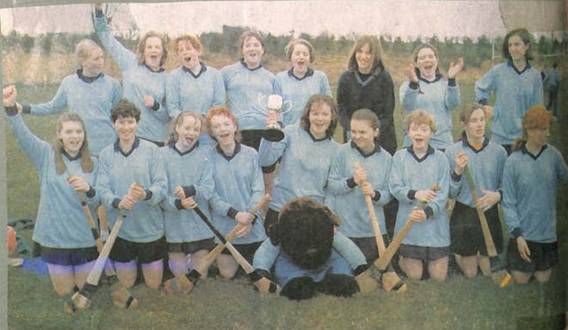
St. Mary's, Charleville, who defeated St. Mary's Nenagh, in the Munster Colleges Junior Camogie final at Newtownshandrum.