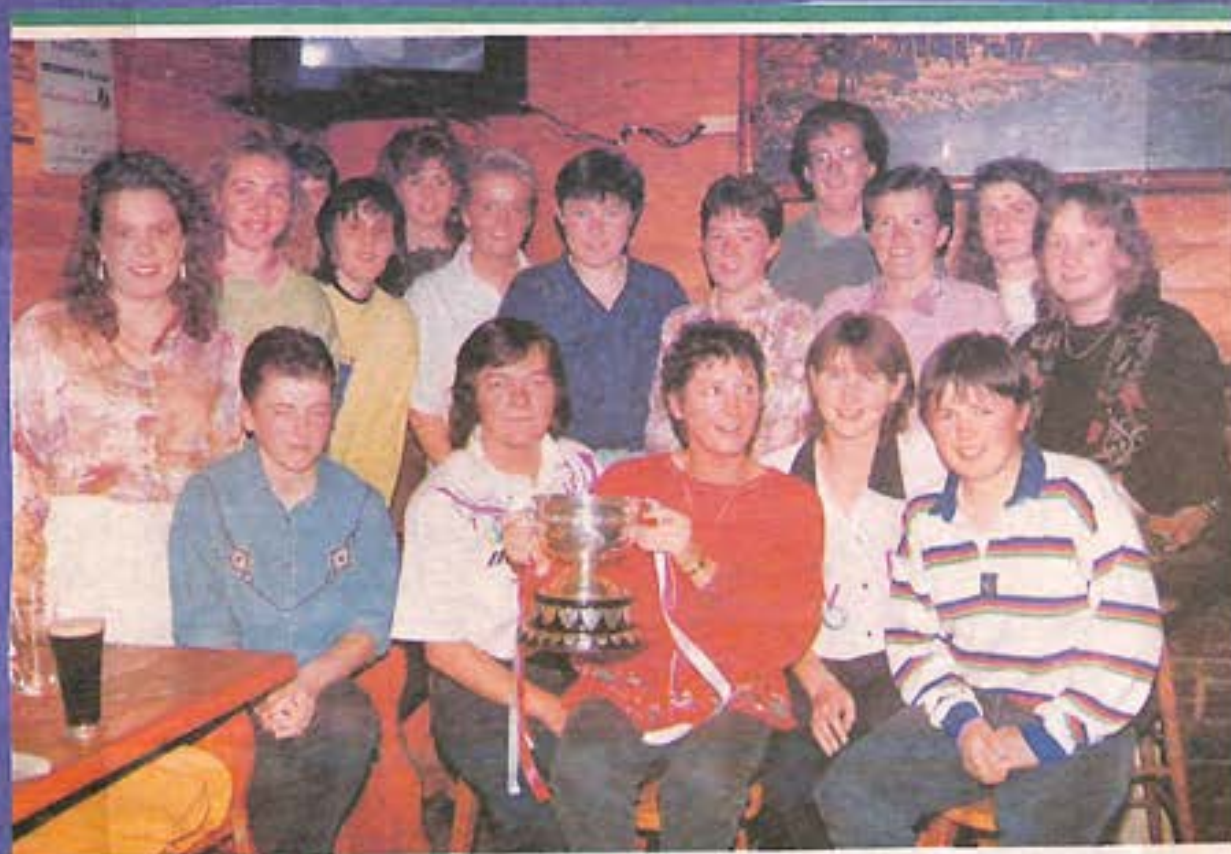
Members of the Cork camogie team with the All-Ireland torphy celebrate and watch the game on T.V. in Killeagh, last, night.