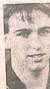
D.J. CAREY (Hurling) 1550 111 762