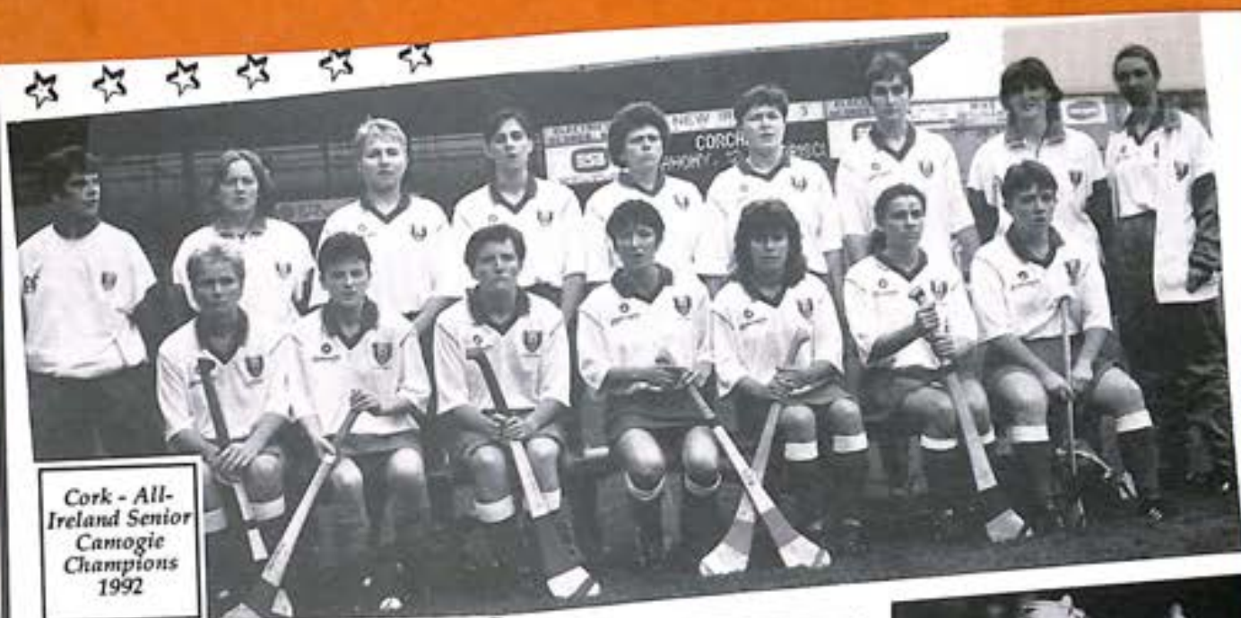
Cork - All-Ireland Senior Camogie Champions 1992