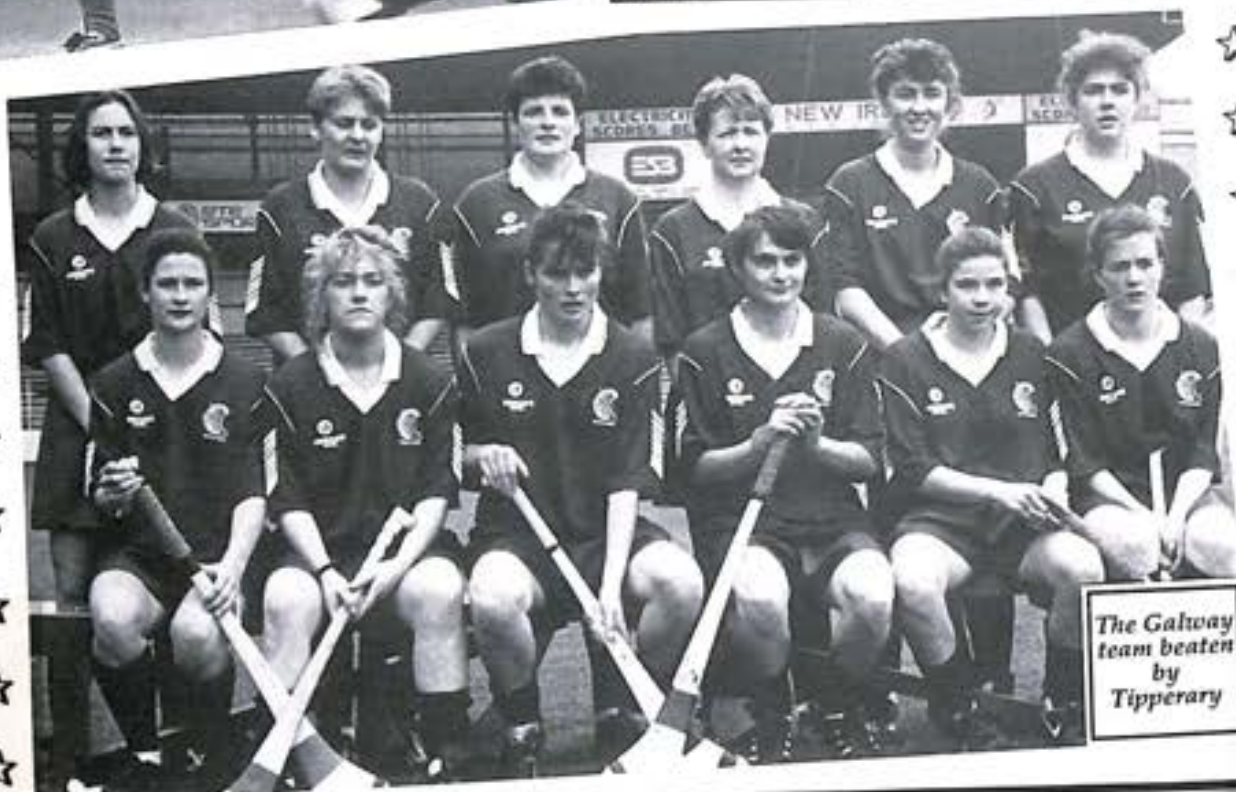
The Galway team beaten by Tipperary