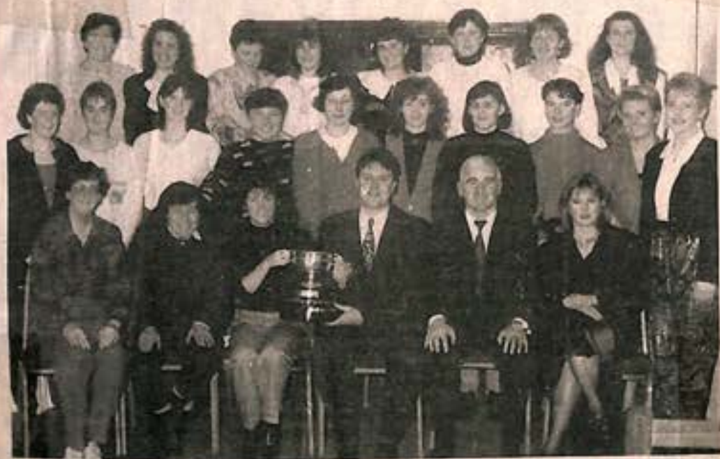
Pictured at Rochestown Park Hotel were members of the All-Ireland winning Cork camogie team selectors, who received awards from McDonalds.