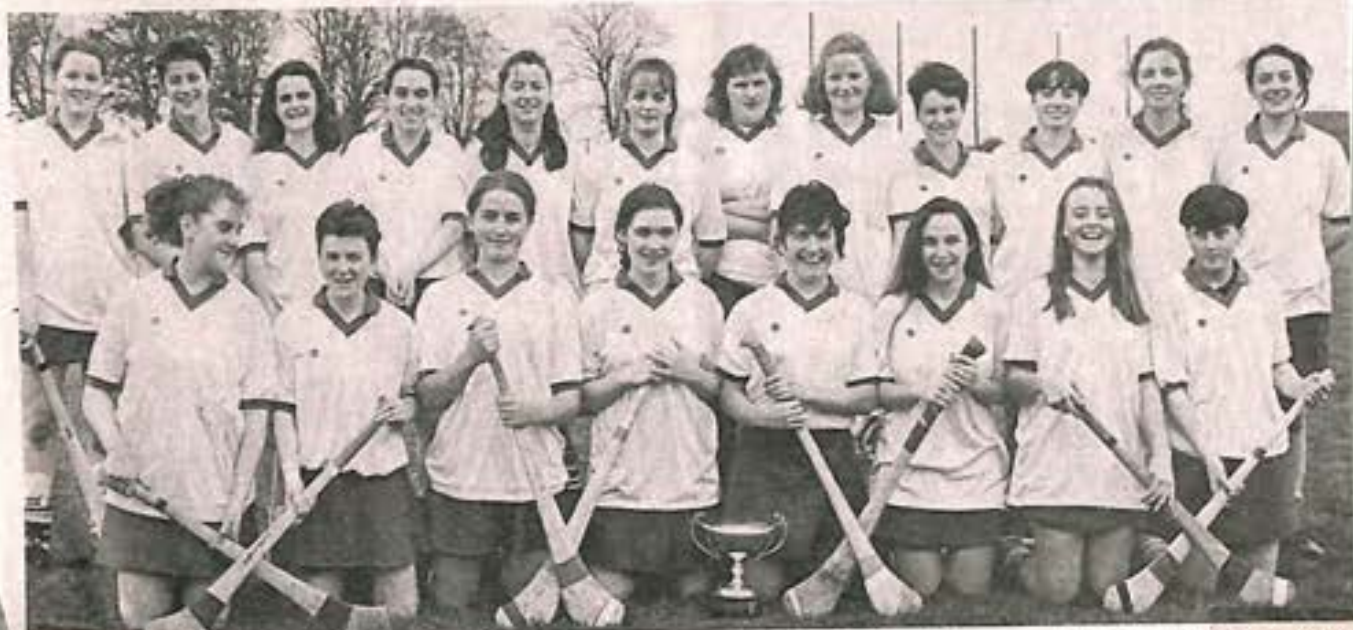
The Inniscarra team, winners of the Cork Co. Junior 'A' Camogie Championship with a two point victory (1-8 to 1-6) over Newcestown in the final at Ballincollig.

In the U-16 "B" final Courcey Rovers defeated Bandon 3-1 to 2-3.