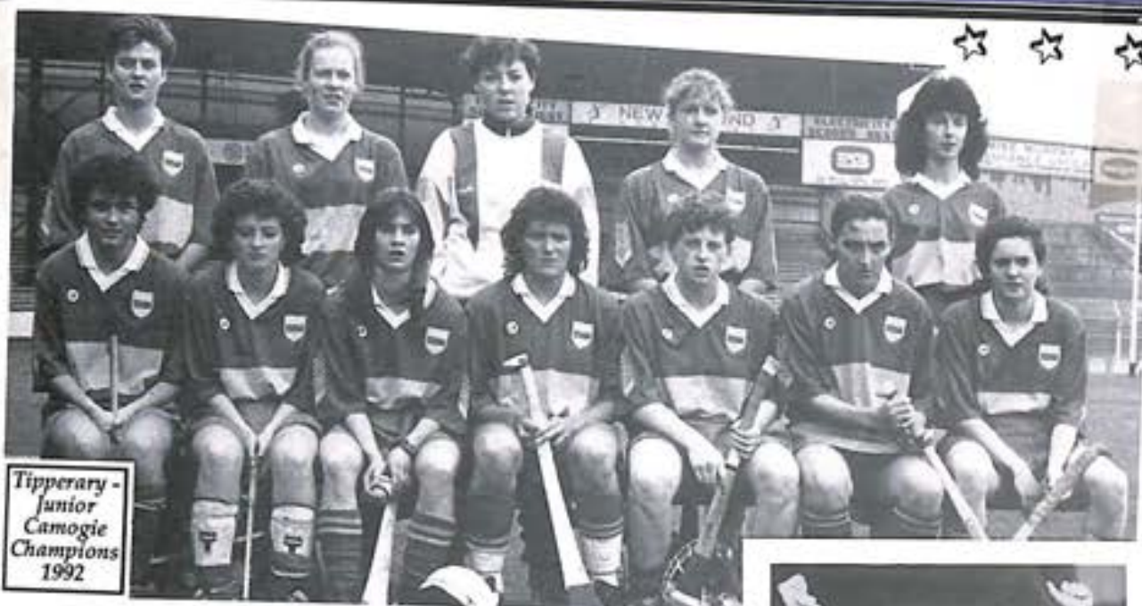
Tipperary - Junior Camogie Champions 1992